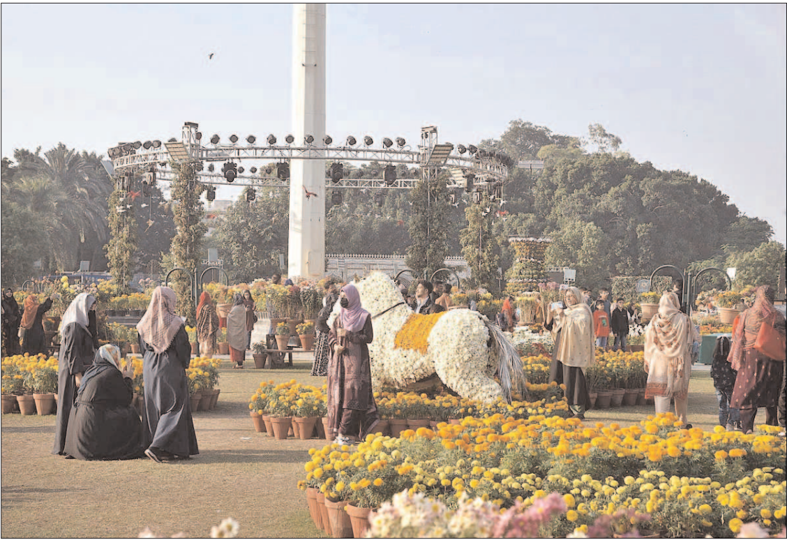
LAHORE: People visit and enjoying flower show at Race Course Jillani Park.