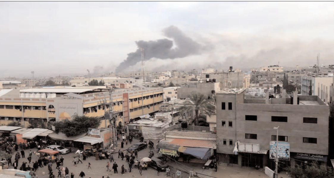
KHAN YOUNIS: Smoke rises after Israeli strikes, amid the ongoing conflict between Israel and the Palestinian Islamist group Hamas, in Khan Younis in the southern Gaza Strip.

PARIS (Reuters): A French warship operating in the Red Sea has shot down two drones that were launched at it from the Yemen coast, the defence ministry said on Sunday. It said the multipurpose frigate Languedoc had intercepted and destroyed a first drone at around 9:30 p.m. local French time on Saturday, and a second one around 11:30 p.m. at 110 km (68.35 miles) from the Yemen coast around Al Hudaydah.