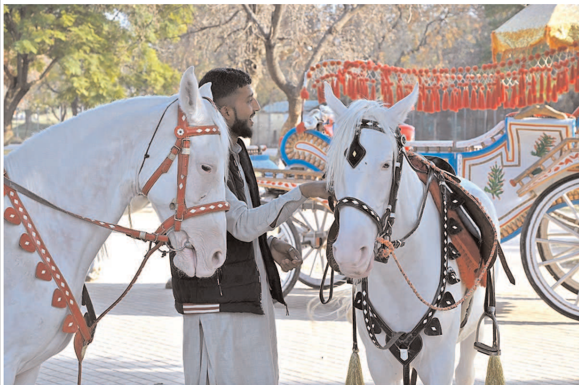
ISLAMABAD: Vendor along with horses waiting for costumers at Lakeview Park in the Federal Capital.

This regulatory body must also have power to recover investors' money by selling the belongings of a developer if he fails to deliver project on time. The small investors have appealed to the government to deal with this issue on priority as they have recently dealt with artificial hike in dollar price, hoarding, repatriation of illegal migrants and other issues of common man's interest. Just to conclude, the case is not with all housing societies as there are good developers as well who take along their investors by bailing out them if any problem comes their way. Therefore, it is direly needed to regularize this business setting certain rules and regulation through involvement of the government so the poor could be saved from cruel clutches of these money hungry property tycoons.