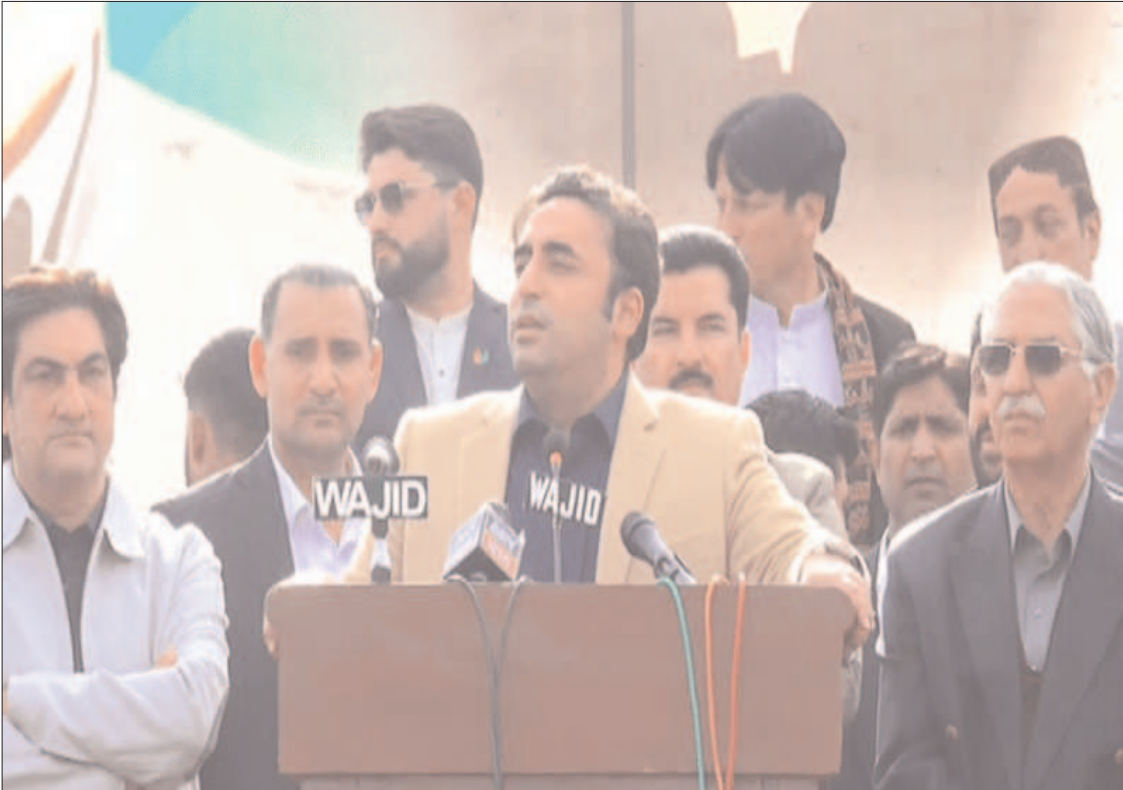
KOHAT: PPP Chairman Bilawal Bhutto-Zardari addresses a workers' convention in Kohat.