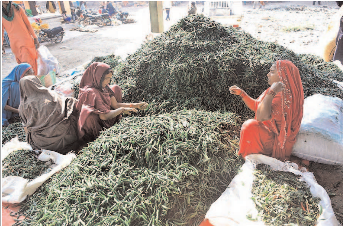
HYDERABAD: Labourer women busy in sorting the good quality green chili at vegetables market.

scapegoat, it has to target the elite who are getting annual benefits worth seventeen and a half billion dollars, and no government is willing to reduce this amount even a little bit, which is surprising. The non-taxpaying elite will only collectively think of saving the system when they see it collapsing or in a crisis that directly affects them. To expect them to contribute to increasing the tax-to-GDP ratio seems unlikely. If the elite could not be controlled, the problems of Pakistan would never be reduced, he said, adding that the current situation is a test of the vision of our leadership.