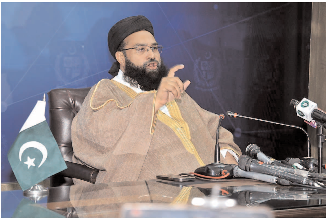
ISLAMABAD: Chairman Pakistan Ulama Council Hafiz Muhammad Tahir Mahmood Ashrafi addressing a press conference.