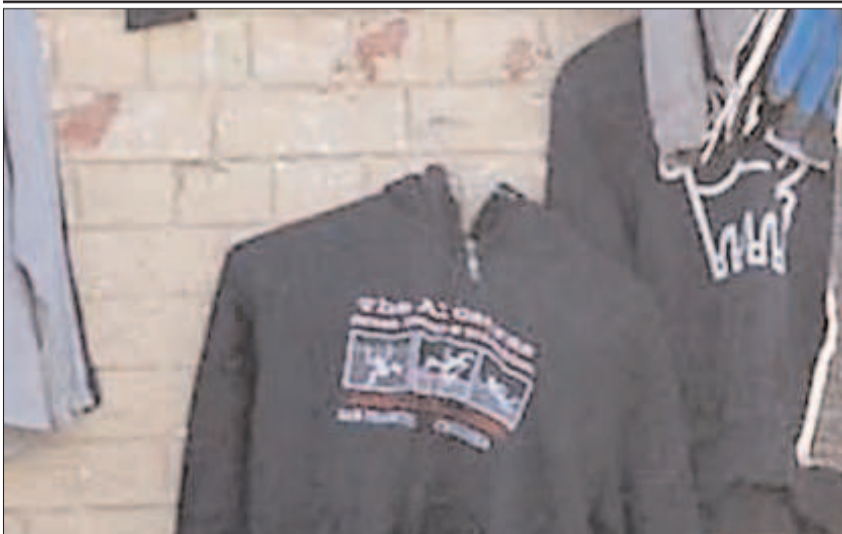
QUETTA: A child vendor taking nap while selling warm cloth at his roadside setup.