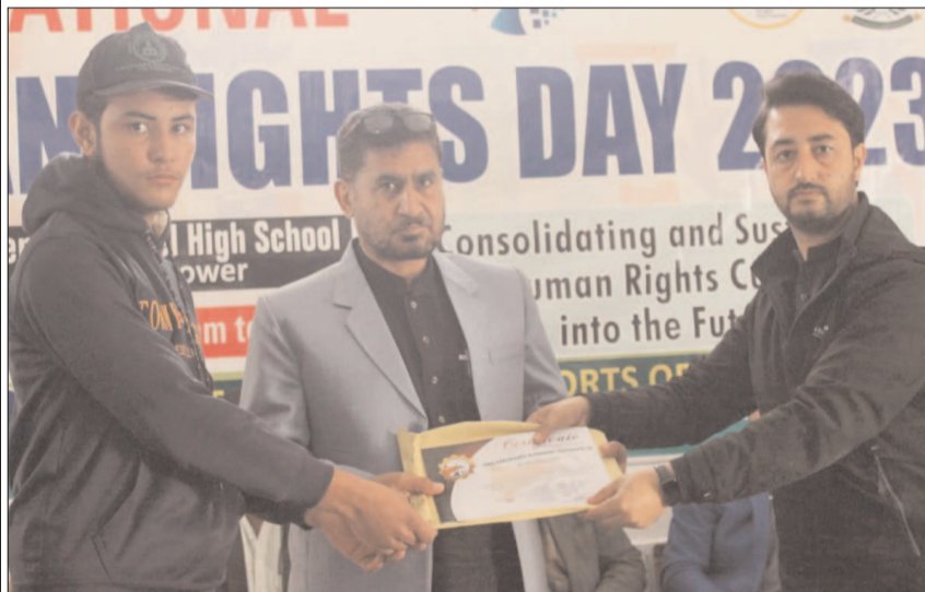
LOWER: Books and other gifts being distributed among school students at a function.

Rescue 1122 firefighters rescued the girl trapped in the fire and shifted her to DHQ Hospital. Rescue 1122 firefighters quickly controlled the fire.