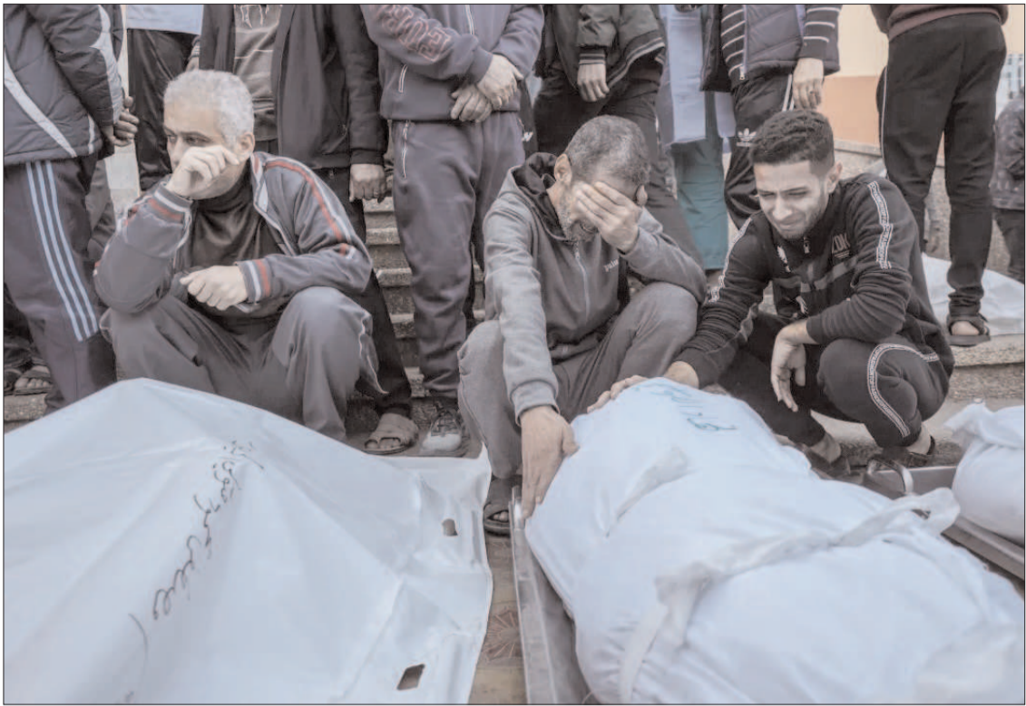
GAZA: Palestinians mourn in front of shrouded bodies of relatives killed following Israeli strikes at Khan Younis's Nasser Hospital.