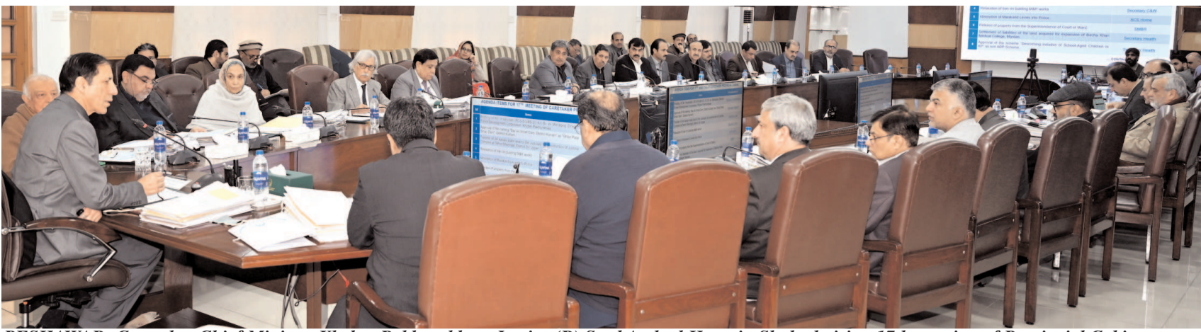
PESHAWAR: Caretaker Chief Minister Khyber Pakhtunkhwa Justice (R) Syed Arshad Hussain Shah chairing 17th meeting of Provincial Cabinet.

He termed the monitoring system and information cell of the Information Department playing a very crucial role for conveying the official version to the people and keeping the government aware of the public opinion.