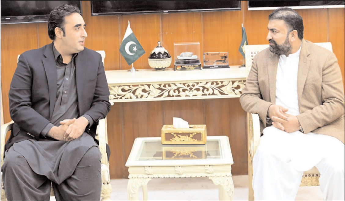
ISLAMABAD: Caretaker Federal Minister for Interior, Sarfraz Ahmed Bugti in a meeting with Chairman PPP Bilawal Bhutto Zardari.