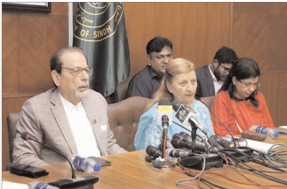
KARACHI: Caretaker Sindh Information, Minorities Affairs Minister Ahmed Shah, caretaker Education Minister Rana Hussain addressing a press conference at Sindh Assembly.