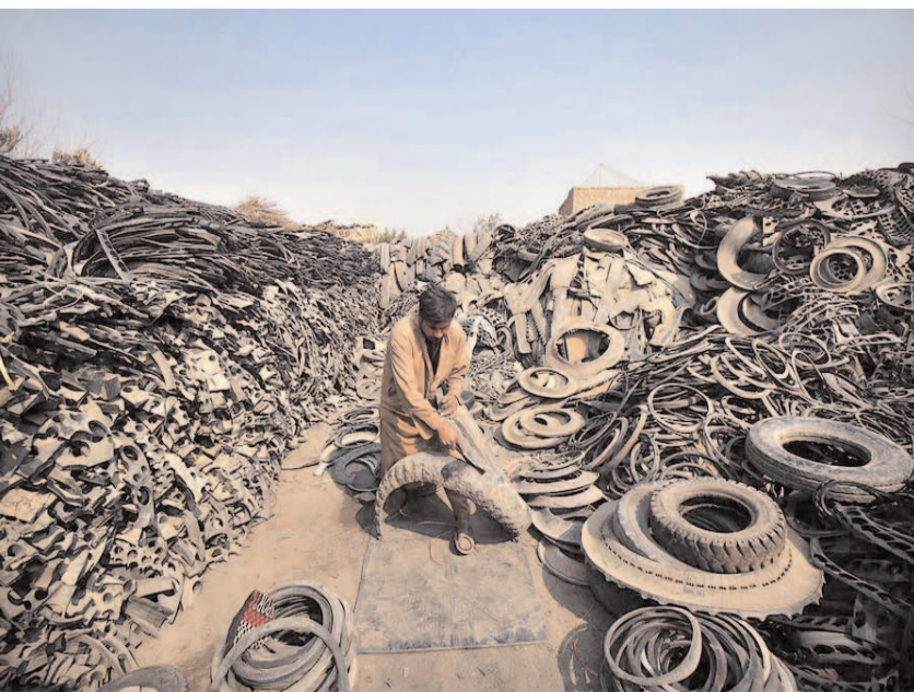
PESHAWAR: A laborer busy in cutting scrap tyres at godown near Ring Road.

The charm of the bouquets decorated with the flowers captivated the participants' hearts and soul who showed keen interest in the exhibition.