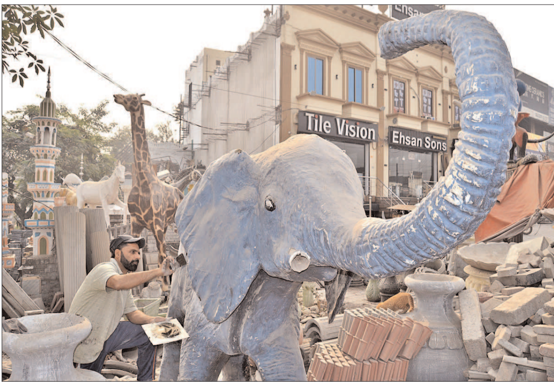
LAHORE: Artist using his artwork skills to restore and finalize an elephant sculpture.