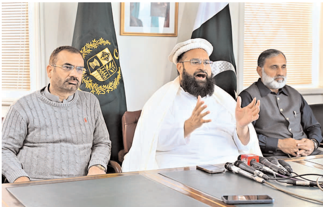
ISLAMABAD: Special Representative to the Prime Minister for Religious Harmony & Islamic Countries and Chairman Pakistan Ulama Council Hafiz Tahir Mahmood Ashrafi accompanied by the representative of Hajj Operative Association of Pakistan (HOPE) addressing a press conference at Ministry of Interfaith Harmony.

RAWALPINDI (APP): Rawalpindi District Police have registered 147 FIRs against underage drivers during the last 24 hours, said a police spokesman here on Tuesday. He informed that police on the directives of City Police Officer, Rawalpindi were taking action against underage drivers. All possible steps were being taken to improve the traffic situation on the city roads and facilitate the citizens, he added. A total of 2673 FIRs were registered under the campaign launched against underage drivers while 147 cases were registered during the last 24 hours. The CPO had directed the City Traffic Police to take solid steps to control traffic rules violations and underage driving, he said. He said fatal road accidents occur due to speeding and reckless driving of the drivers particularly underage. Underage drivers not only endanger their own lives but the lives of other road users, he said adding that parents should keep a vigilant eye on their children to avert road accidents. The vehicles and motorcycles of the underage drivers were also being impounded in respective police stations, he said. In addition to issuing fines for underage driving, Police were also conducting awareness campaigns in schools and colleges to educate young individuals about the legal age requirements for obtaining a driver's license, he added.