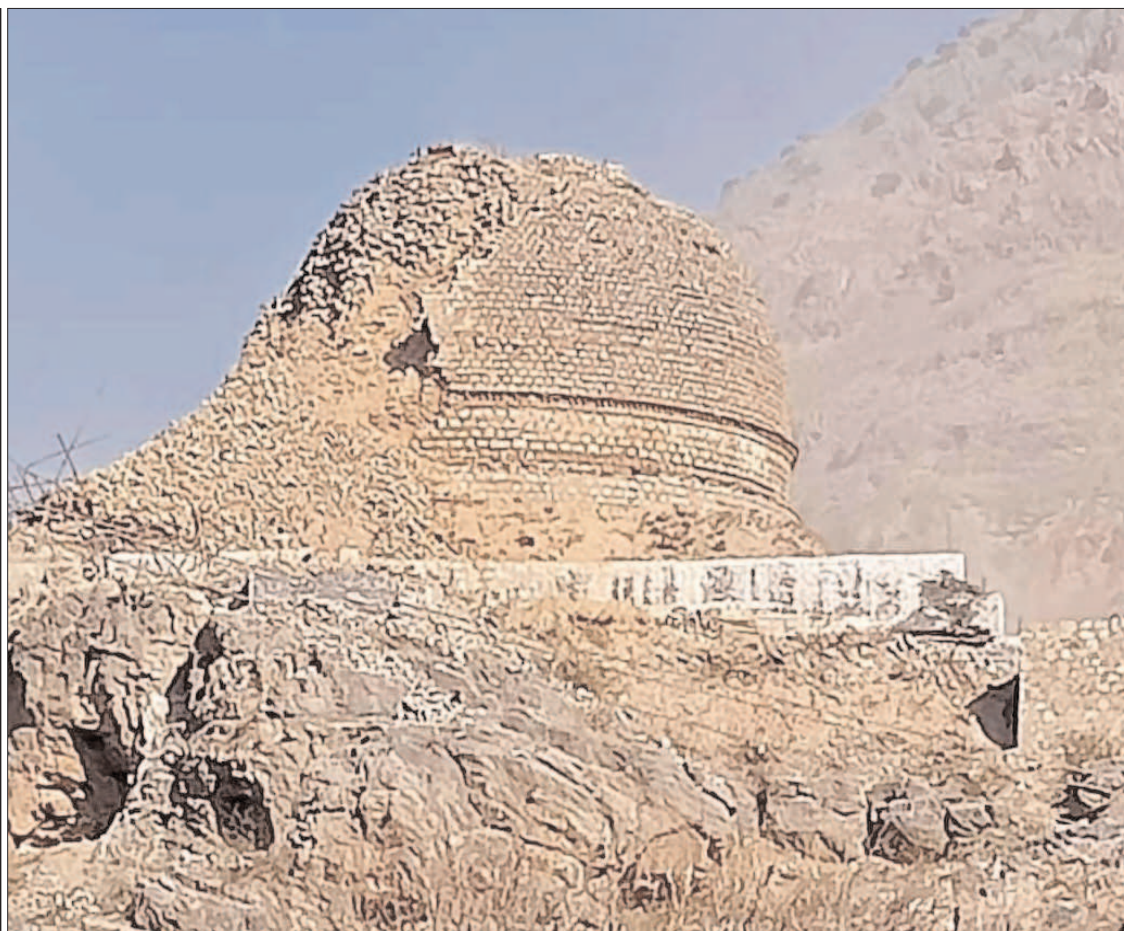
LANDI KOTAL: A part of an outer layer of Shpola Stupa, as sacred site for Budmat followers fell down during reconstruction work.