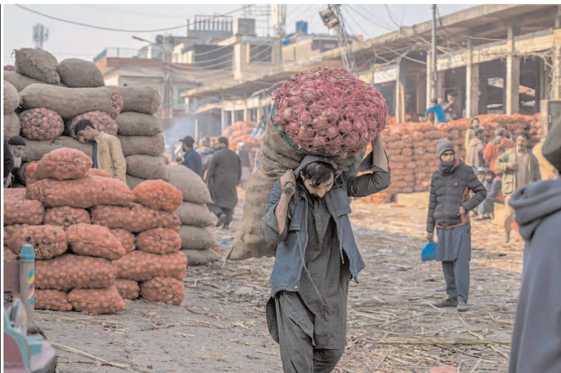
ISLAMABAD: A labourer carrying sack of onion on his back at Islamabad fruit and vegetable market.

The over all increase in the sale and assembling of farm tractors output would further augment the government's overall endeavours for farm mechanization as well as enhancing the output of different major and minor crops to ensure food safety and security in the country.