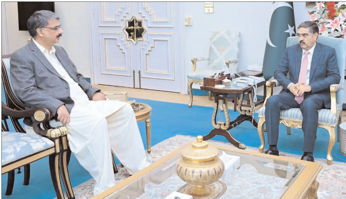
ISLAMABAD: Prime Minister of Azad Jammu and Kashmir Ch. Anwaar-ul Haq called on Caretaker Prime Minister Anwaar-ul-Haq Kakar.