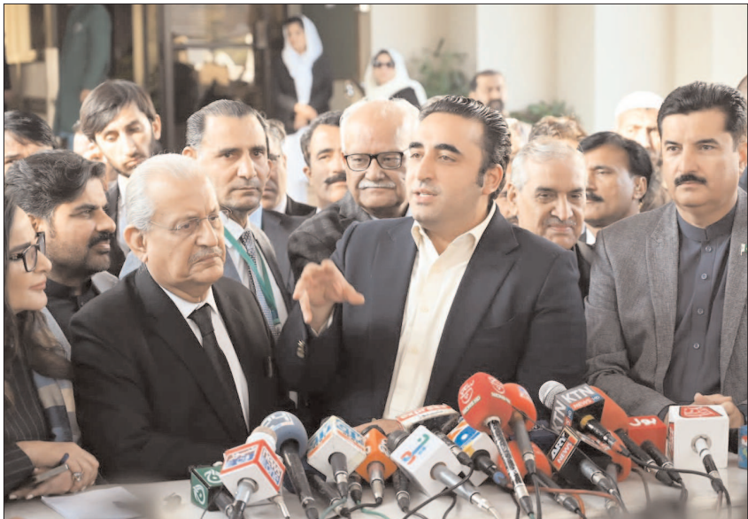
ISLAMABAD: Chairman Pakistan People's Party, Bilawal Bhutto Zardari talking to media persons.

Most of the 2.3 million people in Gaza have been driven from their homes and the United Nations has given dire warnings about the humanitarian situation in the coastal enclave, saying that hundreds of thousands of people are starving. Four Palestinians were killed on Tuesday in a drone strike during an Israeli raid on the occupied West Bank city of Jenin and its refugee camp, the Palestinian health ministry and the Palestinian official news agency WAFA said. — Arab News