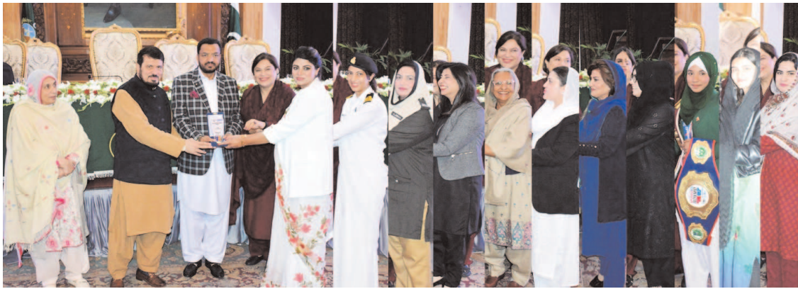
PESHAWAR: Governor Khyber Pakhtunkhwa Haji Ghulam Ali distributing awards amongst talented women during a ceremony held at Governor's House.

In his message, KP Governor expressed sympathies with families of the martyred and prayed to rest departed souls in eternal abode with peace. He also prayed for early recovery of the injured and said that these acts of cowardice could not demoralize the security forces and police, adding that the entire nation supports the security forces in the war against terrorism.