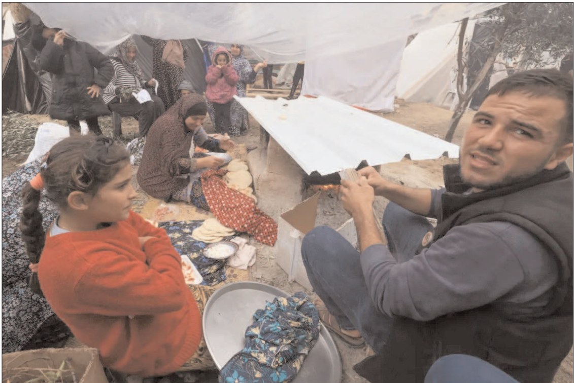
GAZA: Palestinians shelter from the rain at a camp for displaced people in Rafah.