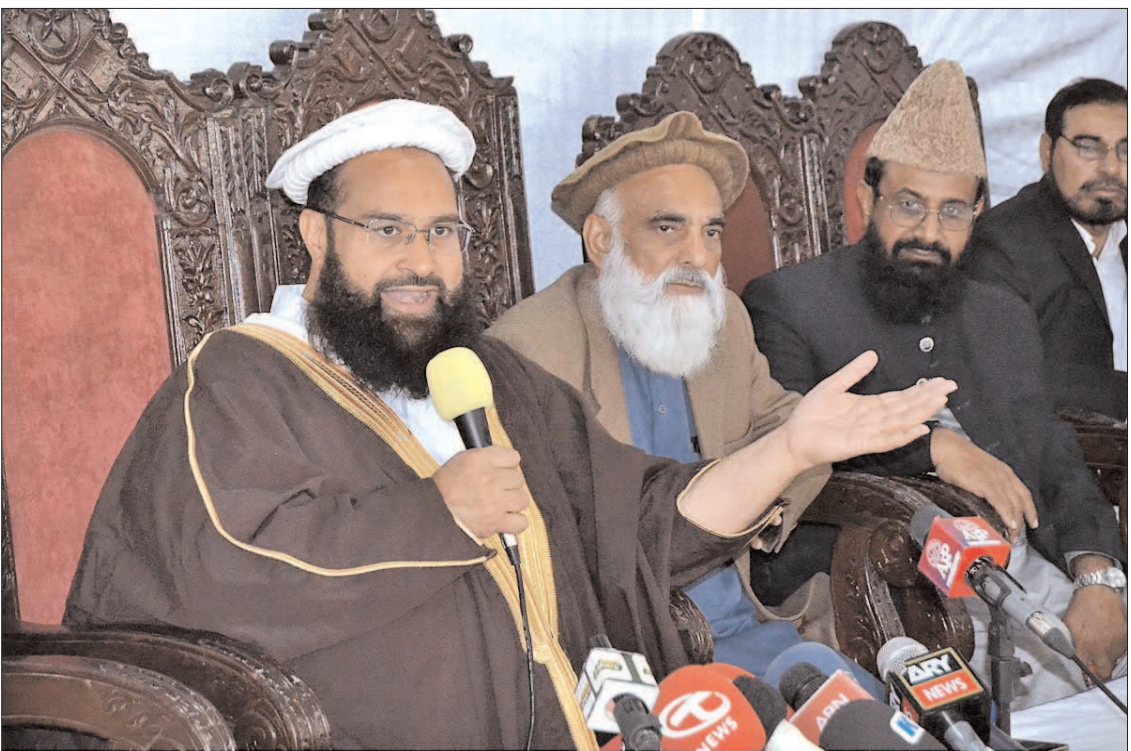
LAHORE: Special Assistant to Prime Minister Allama Tahir Ashrafi and Chairman Pakistan Ulema-e-Islam Council addressing a press conference at Directorate of Hajj.