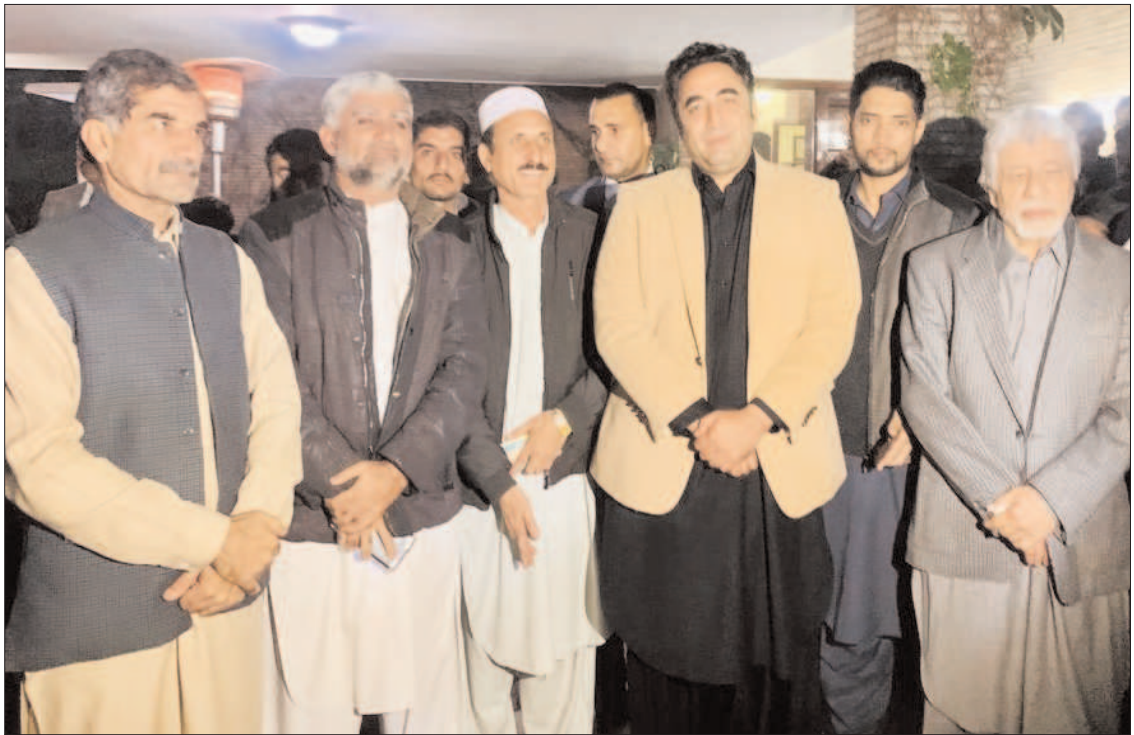
PESHAWAR: Chairman PPP Bilawal Bhutto Zardari in a group photo with the staff of The Frontier Post.