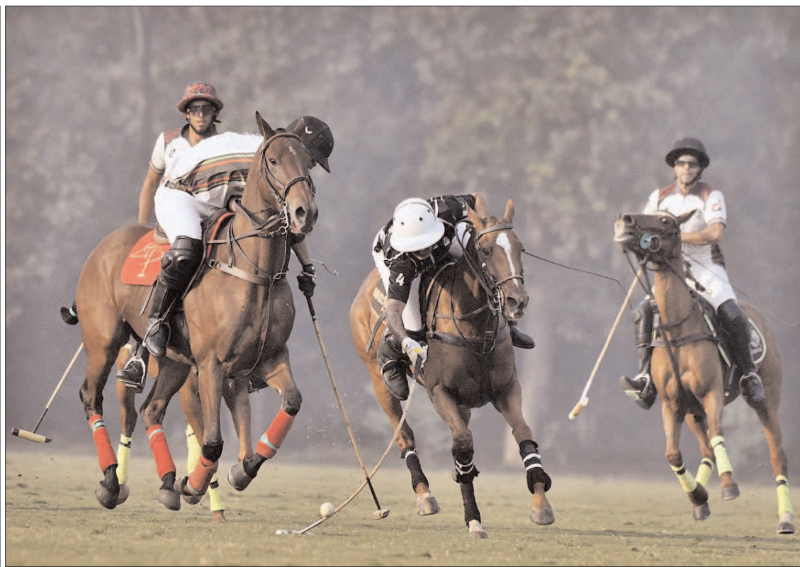
LAHORE: Players struggling to get hold on the ball during Polo match between Master Paints and FG Din Polo during Hamadan 12th Lahore Open Polo Championship 2023 at Lahore Polo Club.