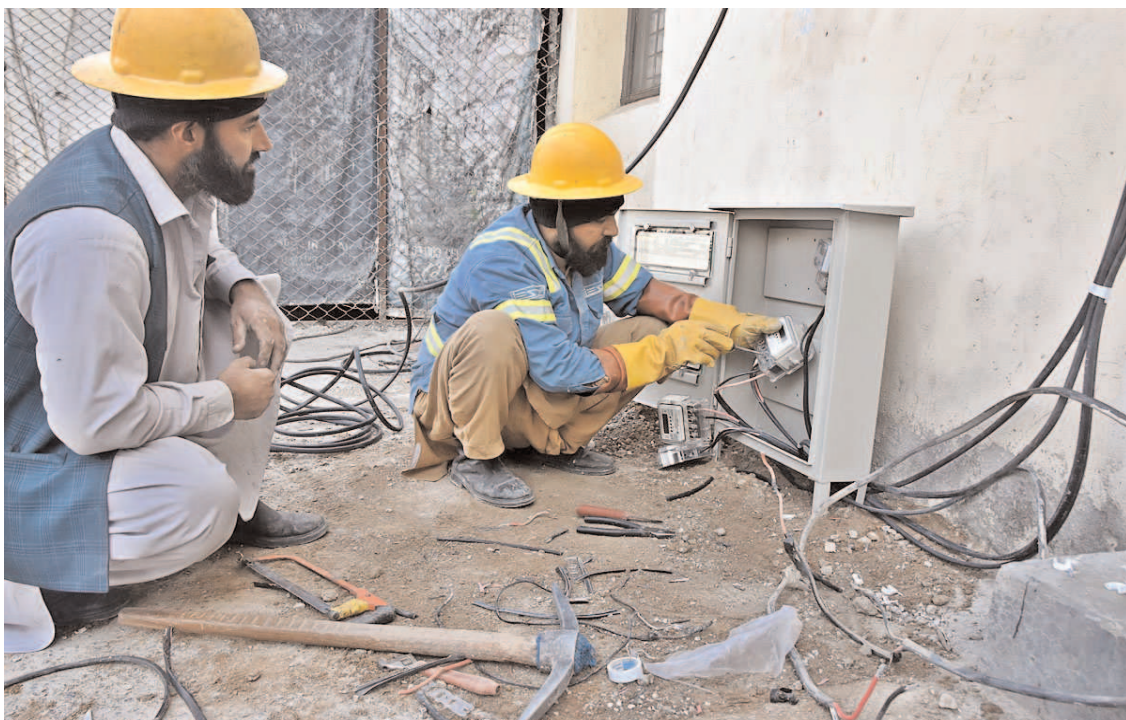
ISLAMABAD: IESCO workers busy installing new electricity meters in residential flats at G-7 in Federal Capital.

He affirmed that the world realizes the fact that Pakistan is one of the major victims of climate change.