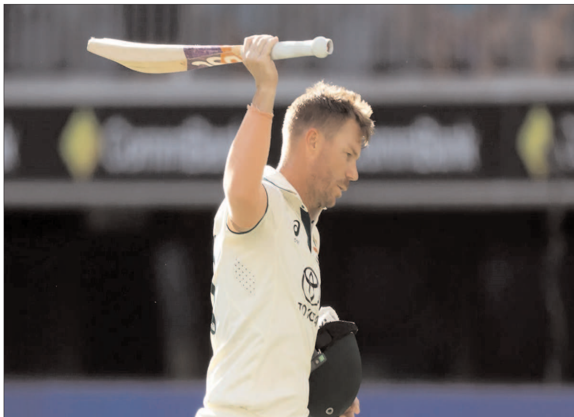
PERTH: David Warner walks off after his century.

Best Women's player shortlist Aitana Bonmati (Spain/Barcelona) Linda Caicedo (Colombia/Real Madrid) Jenni Hermoso (Spain/Pachuca)