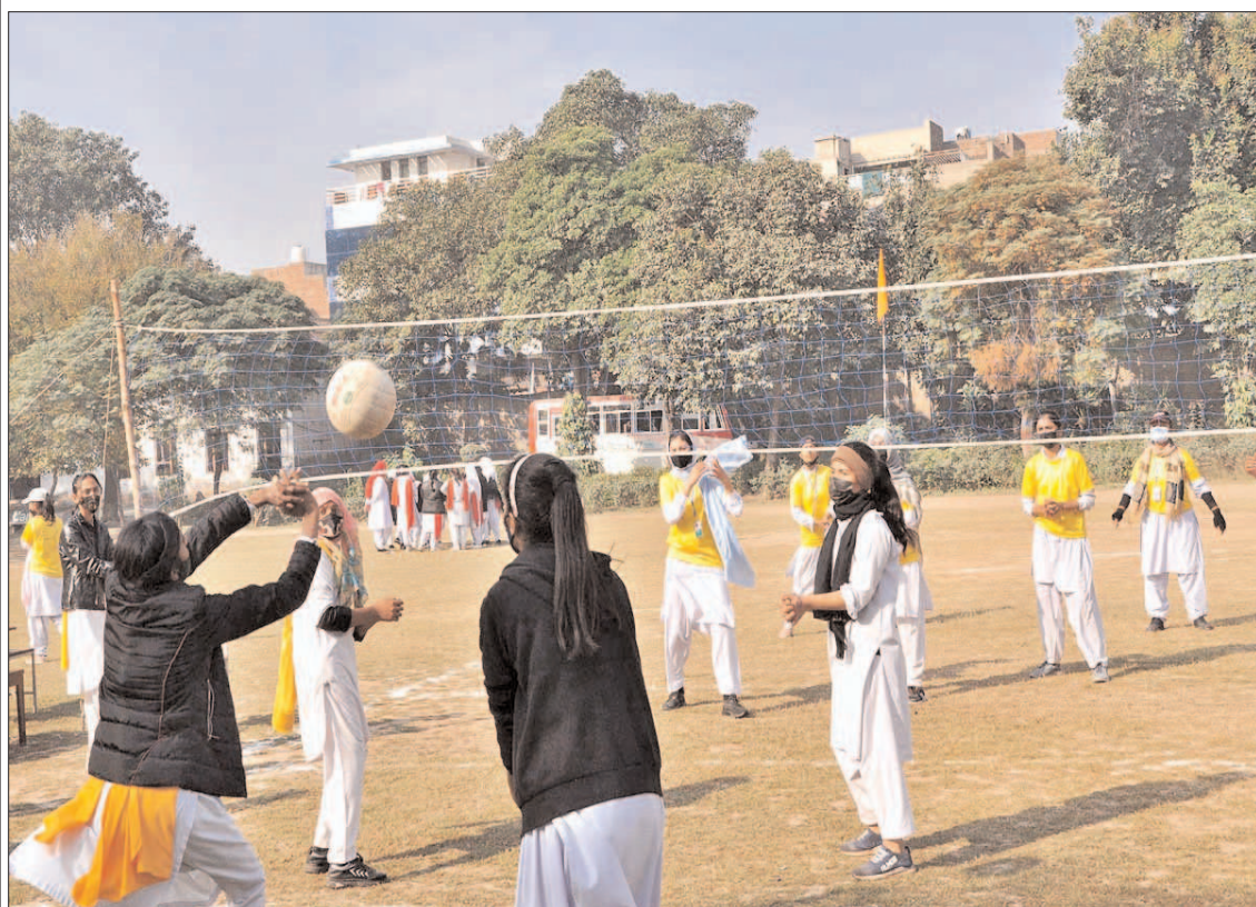
SARGODHA: A view of volleyball match played between Government College for Women Mianwali and Government College for Women Chandni Chowk Sargodha teams during Inter-Collegiate Division Women Sports organized by Higher Education at Government College for Women Chandni Chowk.