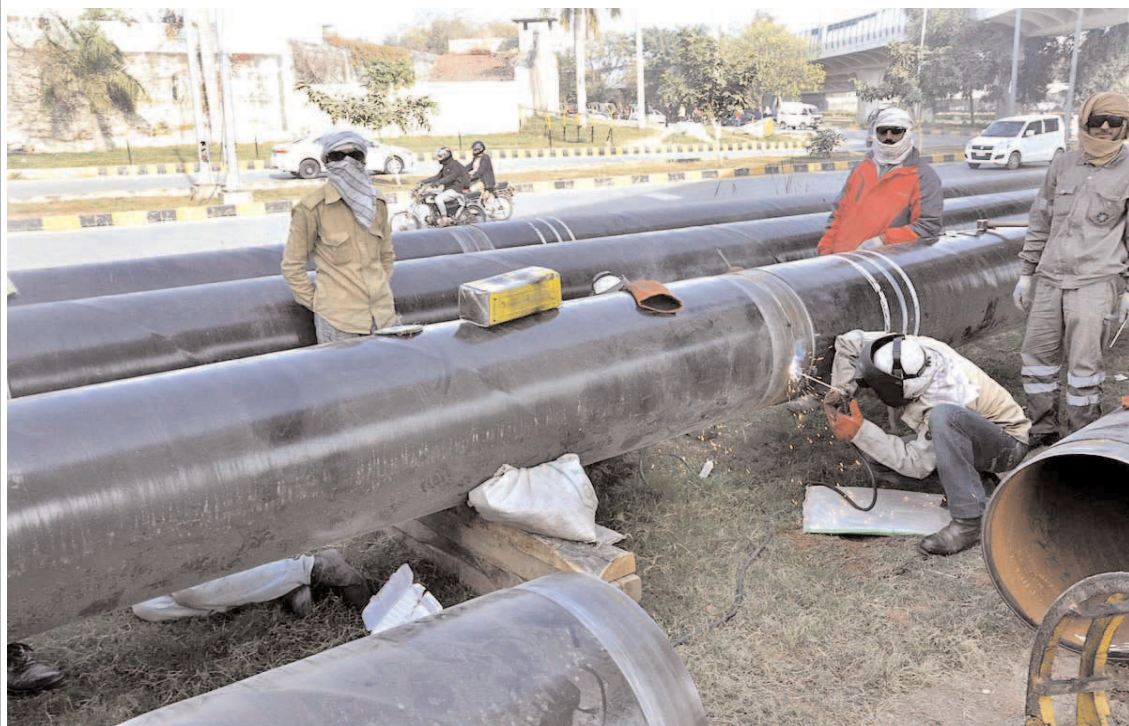
ISLAMABAD: Labourers busy in welding sui gas pipes for laying near Srinagar Highway in Federal Capital.

This portal indicates complete information about the financial aspect from the commercial point of view and provides the live incremental financial position concerning passenger earring. The software for the email exchange server has been installed in the IT Directorate with the viewpoint that emails being used previously from the web hosting company were bounced back as a result e-ticketing client of Pakistan Railways was not in a position to approach this office in case of complaints and claim of refund.