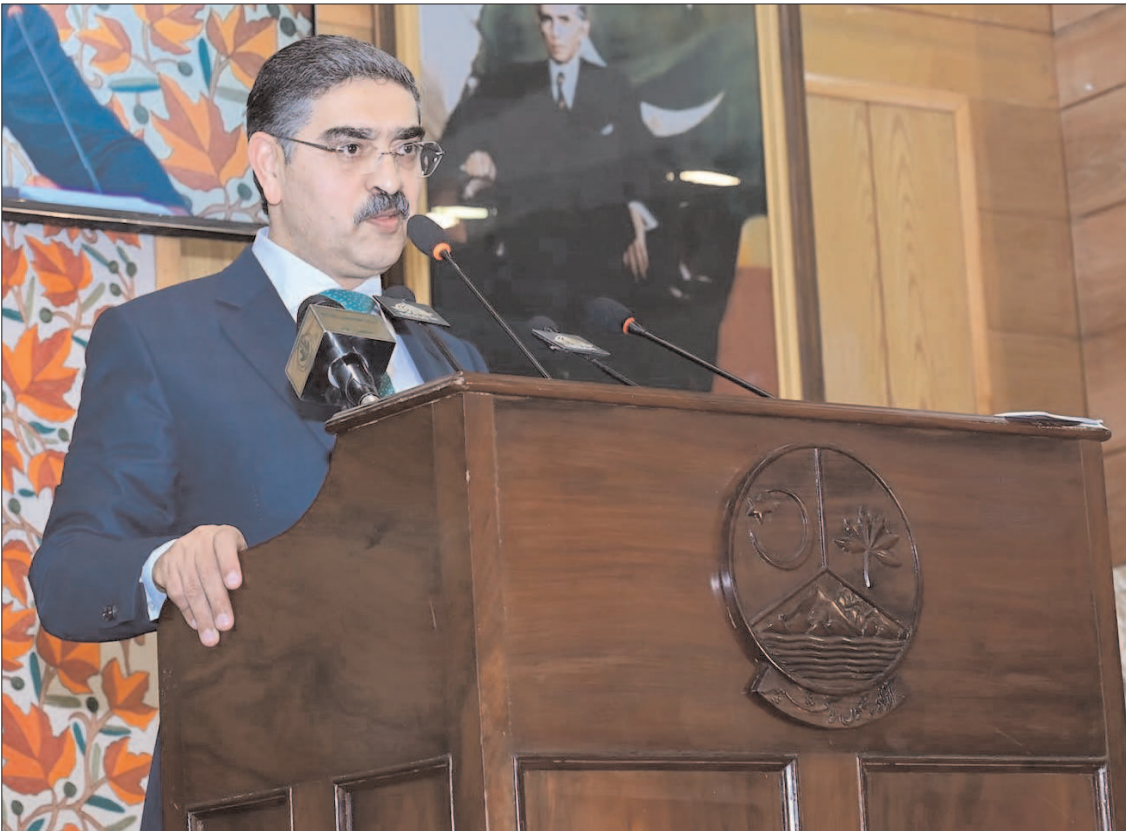
MUZAFFARABAD: Caretake Prime Minister Anwaar-ul-Haq addressing the special session of Azad Jammu and Kashmir Legislative Assembly.

Caretaker Information Minister Murtaza Solangi highlighted that the cabinet also approved a reduction in the processing fee for Afghan nationals being evacuated to third countries. The processing fee, initially set at $800, has now been halved to $400. The caretaker cabinet aims to encourage Afghan nationals residing in Pakistan illegally to either obtain legal documents or finalize evacuation agreements promptly. The reasons for the Afghans' presence in Pakistan vary. Some fled decades ago during the Soviet-Afghan War, while others sought refuge more recently from the Taliban's 2021 takeover. The complex history and intertwined lives of the two countries add layers of difficulty to the repatriation process. While the Pakistani government emphasizes security concerns as the driving force behind the deportations, the human cost of the operation remains a crucial consideration.