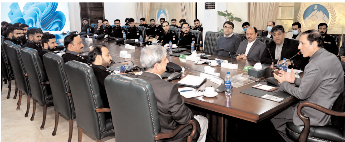
PESHAWAR: Caretaker Chief Minister Khyber Pakhtunkhwa Justice (R) Syed Arshad Hussain Shah addressing undertraining Assistant Superintendents of Police (ASPs) at Chief Minister’s House.

Governor Khyber Pakhtunkhwa Haji Ghulam Ali ensured redressal of public interest issues on priority basis while assured initiation of development works after general elections scheduled on 8th February 2024.