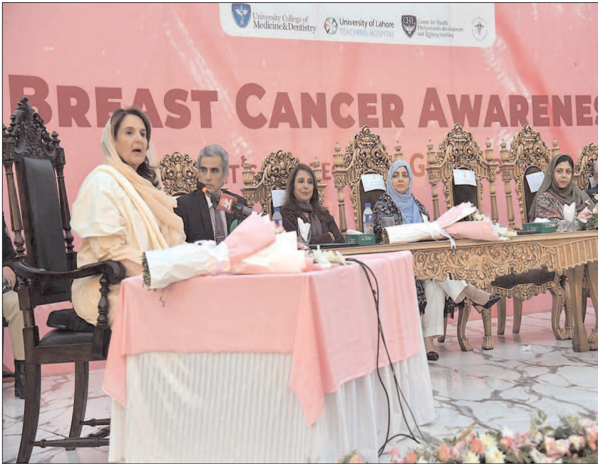
LAHORE: First Lady Begum Samina Arif Alvi addressing to the "Breast Cancer Awareness" at Governor House.