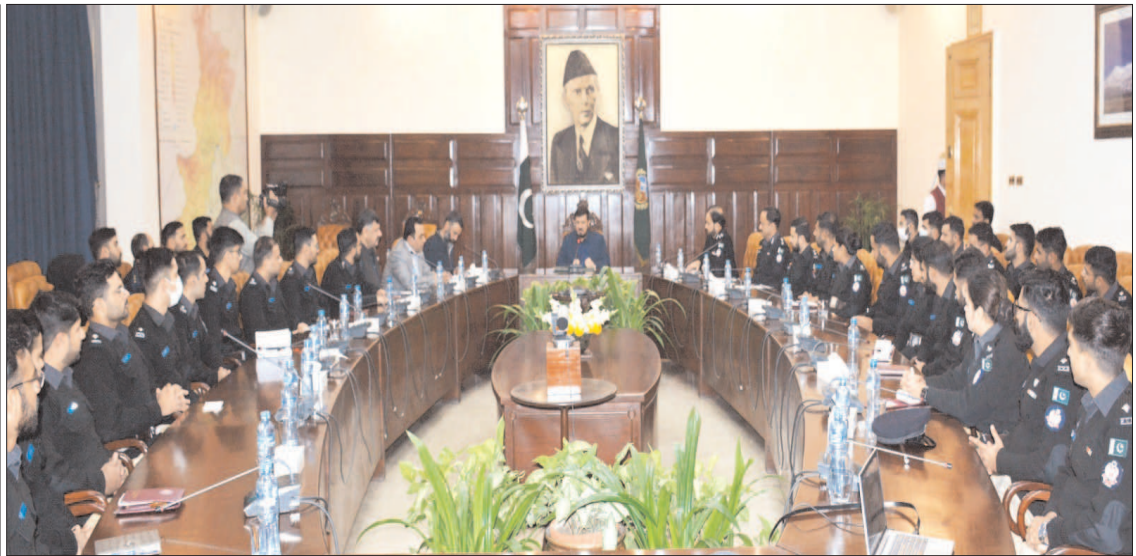
PESHAWAR: Governor Khyber Pakhtunkhwa Haji Ghulam Ali addressing SPs of Police Service of Pskistan at Governor's House.