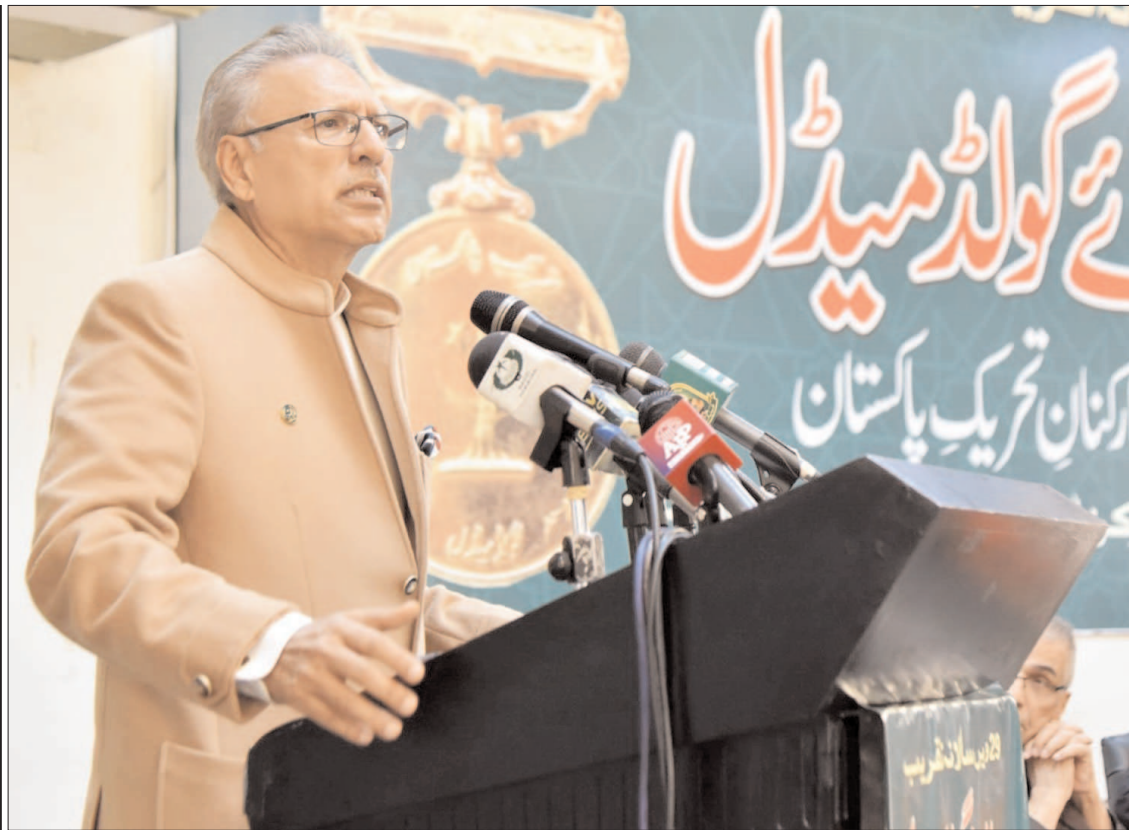
LAHORE: President Dr. Arif Alvi addressing the Annual Gold Medal ceremony of Tehreek-e-Pakistan Trust.

Khyber Pakhtunkhwa police has played an unprecedented role in the war against terrorism in the province and none of the tactics by anti-state elements could dampen their morale. The Chief Minister made it clear that, whoever is against the state or its constitution, is the enemy of all of us; such elements would be dealt with iron hands and no one would be allowed to sabotage the writ of the government. The Chief Minister said that development of the merged districts has been the top most priority of the provincial government, but due to financial crunches, development and welfare activities in the merged areas are being affected. He maintained that unfortunately, the promises made at the time of merger, have not been fulfilled, which is the basic reason behind slow paced development in the merged districts.