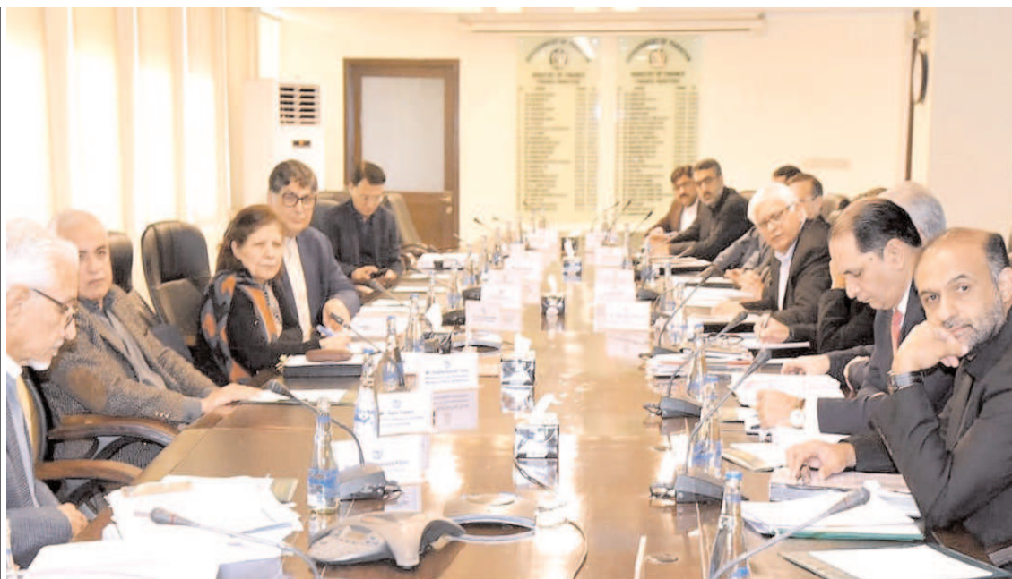
ISLAMABAD: The Federal Minister for Finance, Revenue and Economic Affairs, Dr. Shamshad Akhtar presided over a meeting of the Economic Coordination Committee (ECC) of the Cabinet.

The senior management of both institutions congratulated their respective teams on achieving this significant milestone during the ceremony.