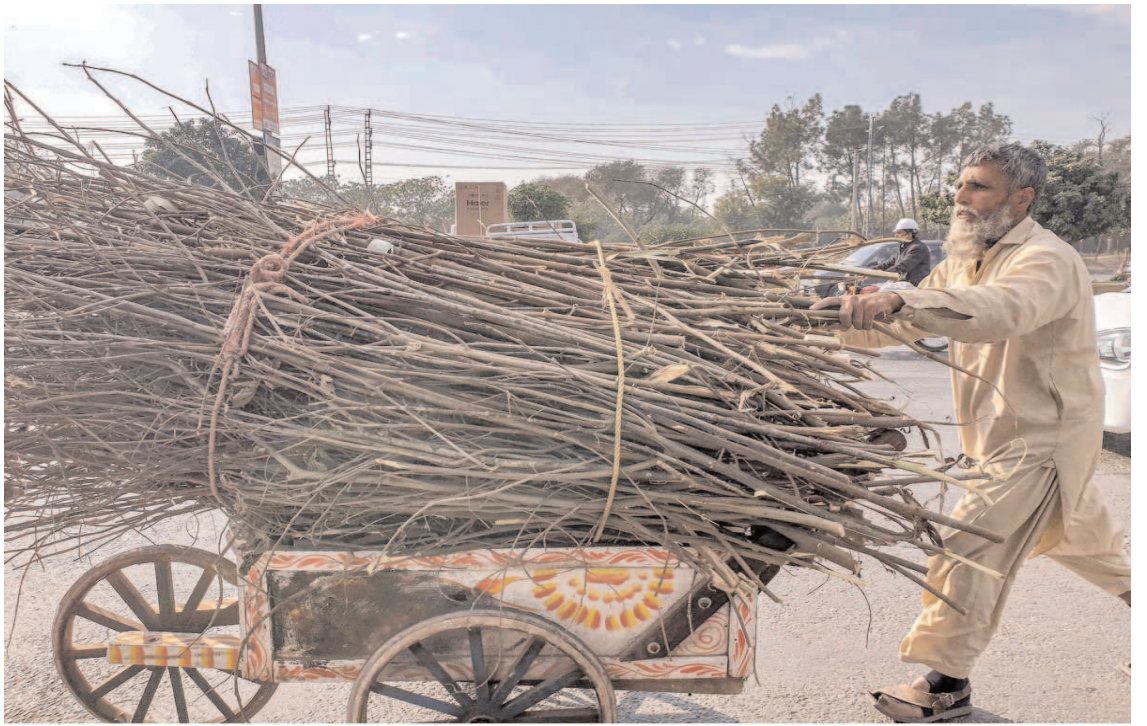
ISLAMABAD: An aged man on his way with a handbarrow loaded with dry woods, collected for domestic use in the Federal Capital.

The official said that it also mentioned Section 12 of the Railway Act of 1890 that the district administration or road authority should bear the expenses for the upgrade of these unmanned level crossings.