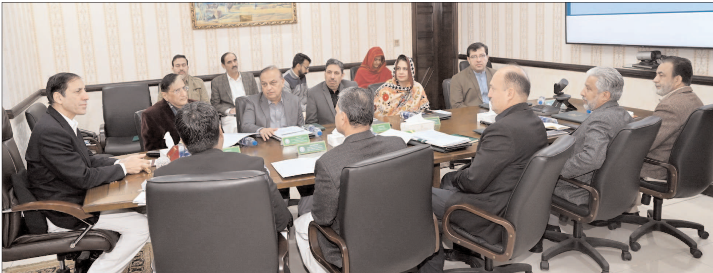
PESHAWAR: KP Caretaker Chief Minister Justice (R) Arshad Hussain Shah chairing a meeting regarding issues of TMA and elected representatives of local bodies.