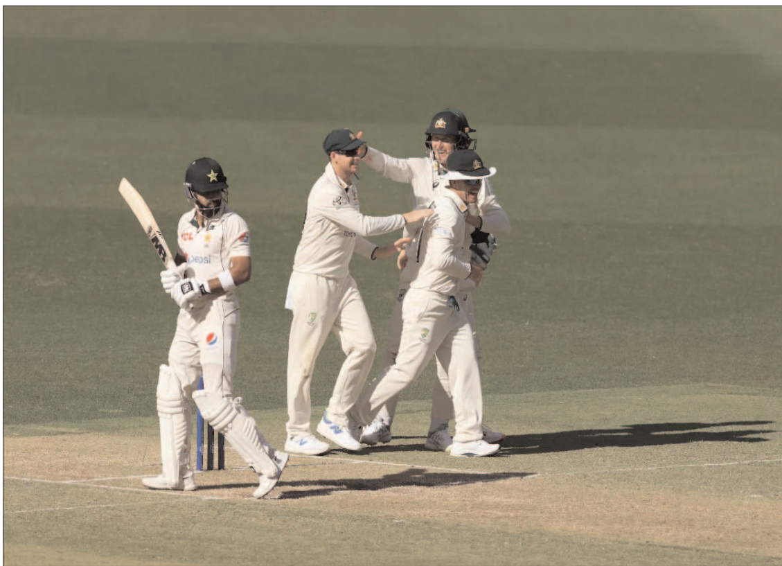
PERTH: David Warner, stationed at leg slip, pounced Abdullah Shafique.