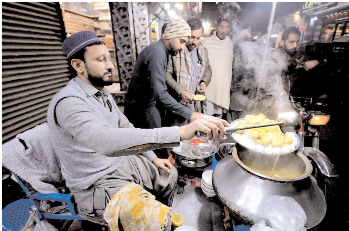
PESHAWAR: A vendor preparing warm traditional soup for a customer along a street during winter season in the Provincial Capital.

all stakeholders and particularly the unwavering trust and confidence of our worthy shareholders in FFC's leadership and management.