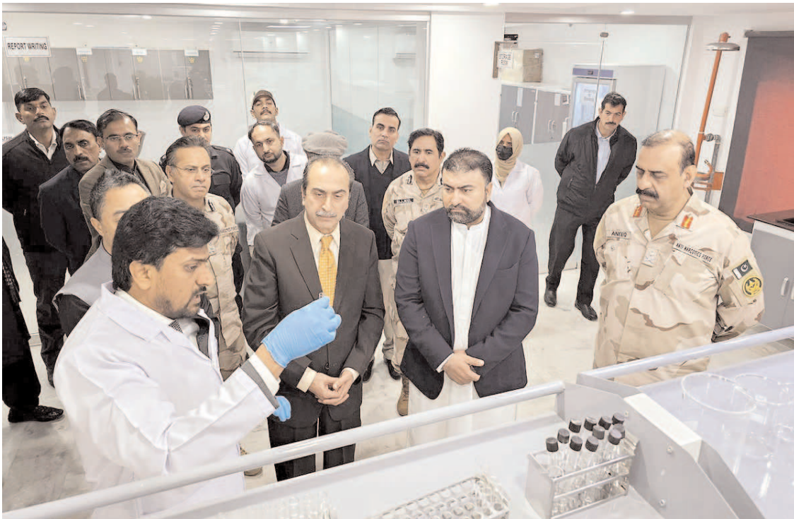
ISLAMABAD: Caretaker Federal Minister for Interior and Narcotics Control, Sarfraz Ahmed Bugti visiting the Anti-Narcotics Force Forensic Lab at ANF Academy.

ISLAMABAD (APP): Capital Development Authority's (CDA) Anti-encroachment operation is on full swing in Islamabad and removed various encroachments from Bari Imam area. On the directions of Chairman CDA, the Enforcement Directorate with the support of Islamabad Police along with other departments and district administration conducted a mega anti encroachment operation against the illegal population established on the government land in Mohalla Thatti adjacent to Bari Imam.