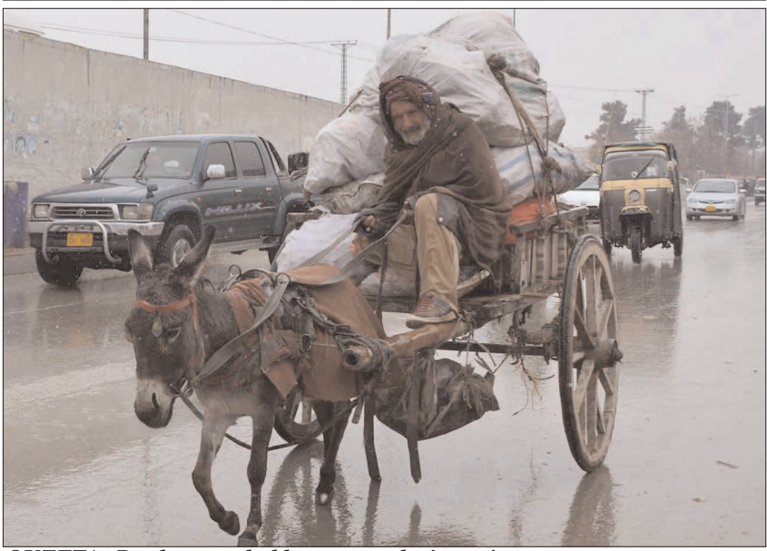
QUETTA: Donkey cart holder on way during rain.