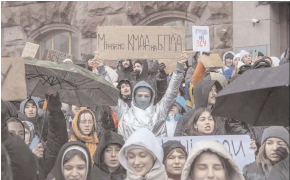
KYIV: An activist holding a sign reading 'exchange city council for drones' during a protest in Ukraine.