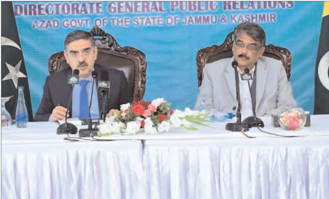
MUZAFFARABAD: Caretaker Prime Minister Anwaar-ul-Haq addressing a press conference along with Prime Minister of Azad Jammu and Kashmir Ch. Anwaar-ul-Haq.

Vol. XXXIX No. 328 Regd. No. 241 JAMADI-US-SANNI 02 1445 -- SATURDAY, DECEMBER 16 2023 PESHAWAR EDITION 12 PAGES PRICE. 30