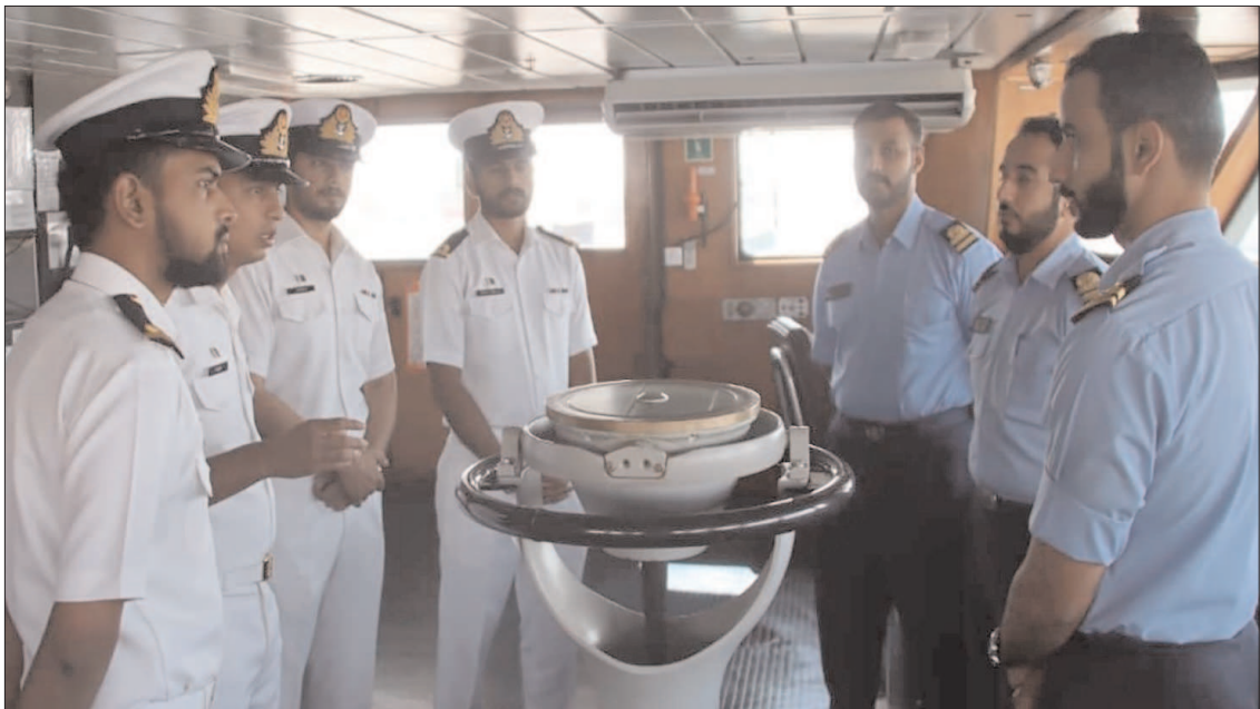
OMAN: Officials of Oman Navy visiting Pakistan Navy Ship TUGHRIL at Salah Port.