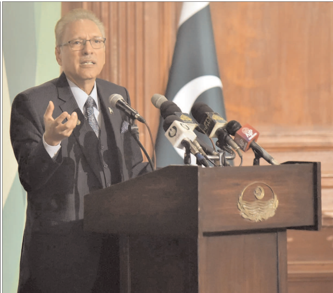
LAHORE: President Dr. Arif Alvi addressing the seminar titled 'Role of insurance ombudsman in strengthening business sector.'