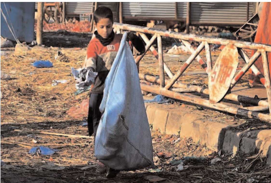
ISLAMABAD: A gypsy child collecting garbage at Fruit and vegetable market in the Federal Capital.

ISLAMABAD (APP): At least two people were killed in dumper-motorcycle collision in Kasur, late Friday. According to detail, rescue sources told that the accident occurred at the Dipalpur Road in Kot Sardar area of Kasur where a rashly-driven dumper hit a motorcycle, killing two persons on the spot, said a private news channel reported. Police and rescue teams rushed to the site and shifted the bodies to nearby hospital. The deceased were identified as Samiullah and Rizwan. According to police spokesman, the driver of dumper managed to flee from the scene.