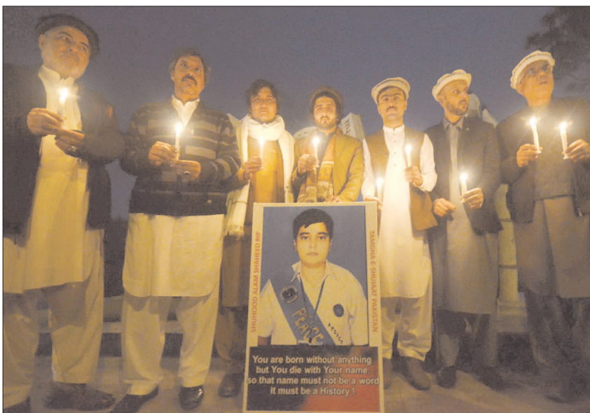
PESHAWAR: Relatives of APS Shuhada lighting candles in memory of their martyred loved ones.