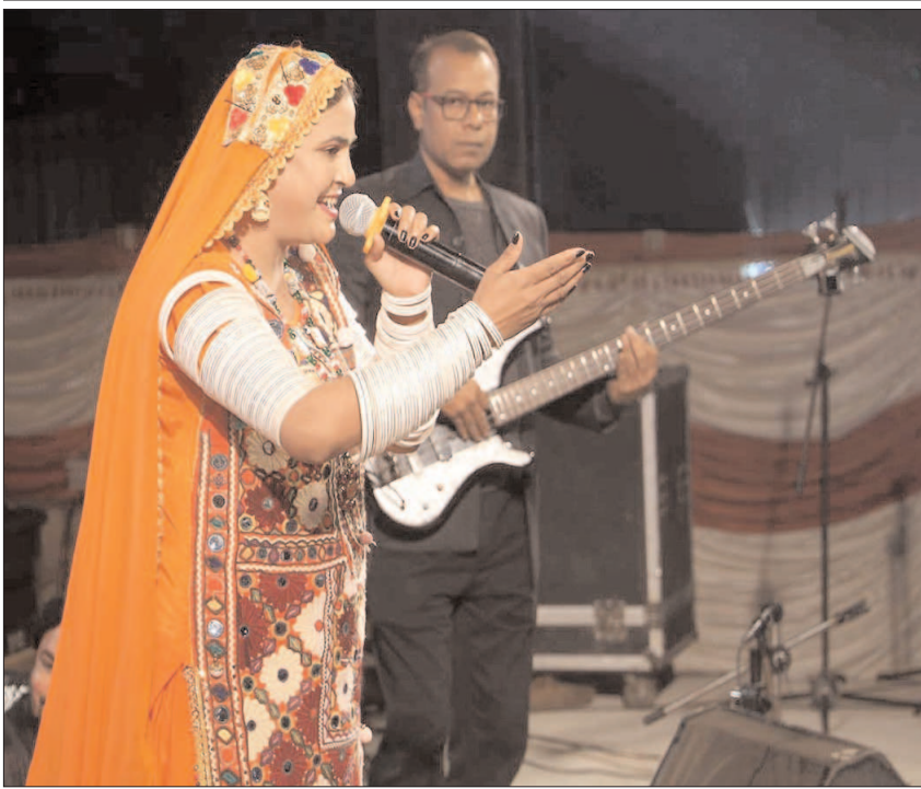
HYDERABAD: A Sufi artist performing at Sufi Mela.

"Poetry is an excellent genre to express opinion and it is vital to safeguarding cultural heritage. Multan Arts Council will continue to promote such great literary work," the speakers vowed.