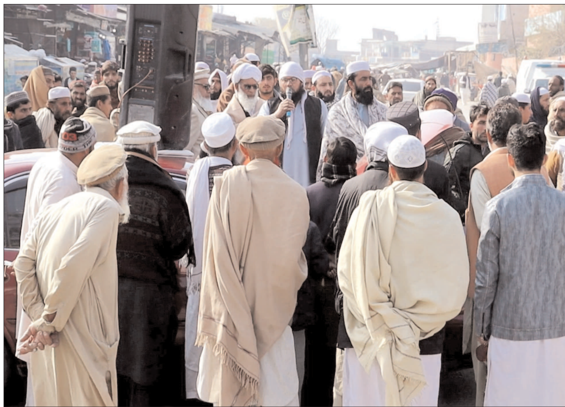
HANGU: People holding a protest against un-announced electricity load shedding in their areas.