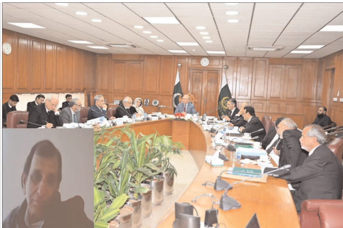
ISLAMABAD: Mr. Justice Syed Mansoor Ali Shah and Justice (Retired) Manzoor Ahmed Malik chairing the meeting of committee to review Judicial Commission of Pakistan Rules 2010 Supreme Court

The Committee deliberated on the process of calling nominations and meeting of the Commission, the procedure for initiating nomination for Supreme Court Judges, High Court Judges, and Federal Shariat Court Judges, representation of Advocates and Judicial Officers in High Court appointments, diversity in High Court appointments, criteria for determining merit, procedure and criteria for confirmation of Additional Judges and establishing a secretariat of the Commission. The Committee also resolved to finalize the draft Rules on 29th December 2023.