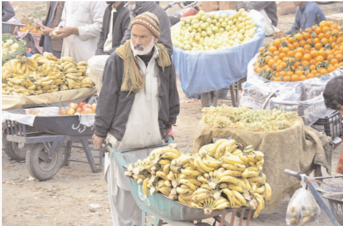
ISLAMABAD: A laborer on his way carrying banana on his wheelbarrow at fruits and vegetables market.

cial economic zones. Zubair said that Caretaker Commerce Minister Gohra Ijaz gave a clear message in his visit to China that Chinese investors can take advantage of GSP Plus by increasing exports from Pakistan to GCC and Africa. There has been significant progress in Pakistan-China trade relations and China has agreed to revise the Free Trade Agreement. He also said that the caretaker commerce minister has also invited Chinese industrialists to accelerate investment in special economic zones, there is a strong possibility that China will open its markets to Pakistan. Zubair said that the Pakistani business delegation had a meeting with China's Deputy Minister of Commerce, Li Fei, and in this meeting, they discussed increasing trade between Pakistan and China. Undoubtedly, the visit of the Pakistani delegation to China under the leadership of Caretaker Commerce Minister Gohra Ijaz proved to be extremely successful, which will have positive effects in the future.