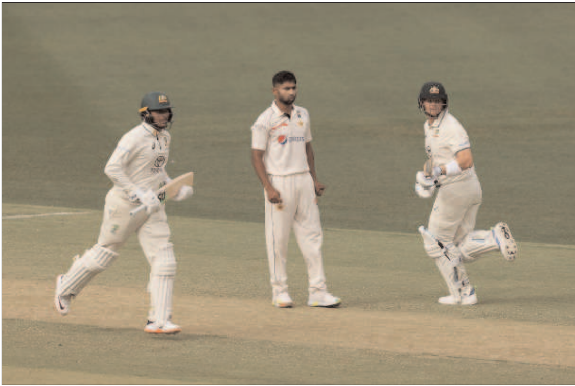
PERTH: Usman Khawaja and Steve Smith of Australia run between wickets during day three of the Men's First Test match between Australia and Pakistan at Optus Stadium.