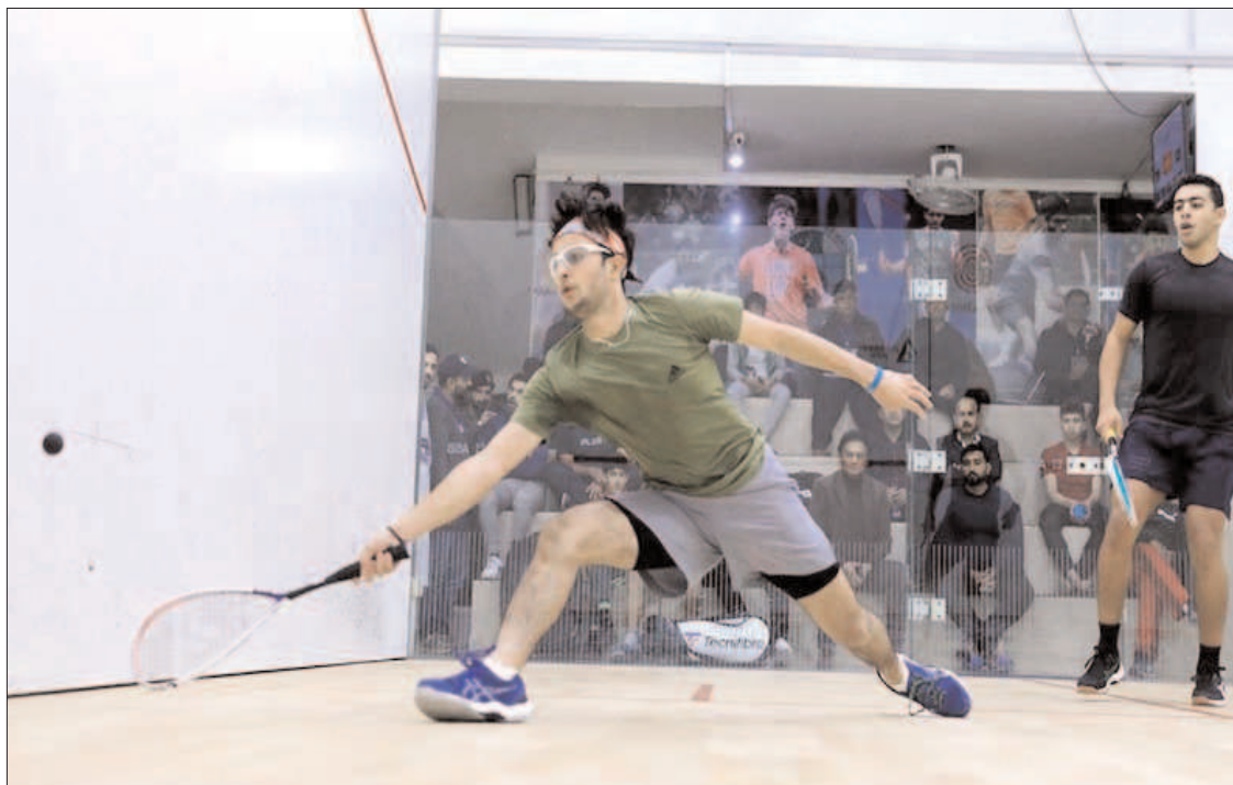
ISLAMABAD: Players in action as Pakistan Squash Federation in collaboration with PAF & Serena Hotels is organizing Chief of the Air Staff-Serena Hotels International Squash Championship for Men & Women at Mushaf Squash Complex.