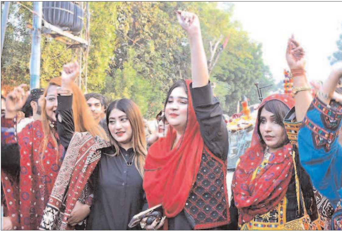
HYDERABAD: Women participants in a rally in connection with upcoming Sindhi Culture Day outside Press Club.

KOHAT: Deputy Commissioner Kohat, Dr. Azmatullah Wazir led a polio campaign performance review on Friday, urged Kohat residents to support the vaccination effort for a polio-free district. According to DC office, Dr. Azmatullah Wazir presided over a performance review meeting of the fourth day of the polio campaign. DC Dr. Wazir urged the residents of Kohat district to join the fight against polio by taking the vaccine to protect their children from permanent disability and to cooperate with the polio teams to eradicate the virus from the district. Additional Deputy Commissioner General Shahryar Qamar, Additional Assistant Commissioners, District Health Officer Kohat and other relevant health staff attended the meeting to discuss the about the campaign and the steps to be taken to ensure its success in the coming days.