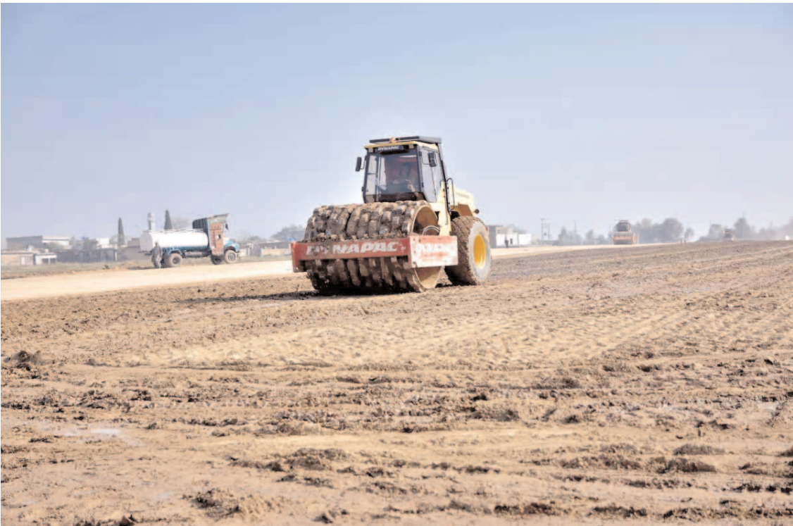
RAWALPINDI: Heavy machinery being used to build Chak Beli Link Road in the outskirts of the city.