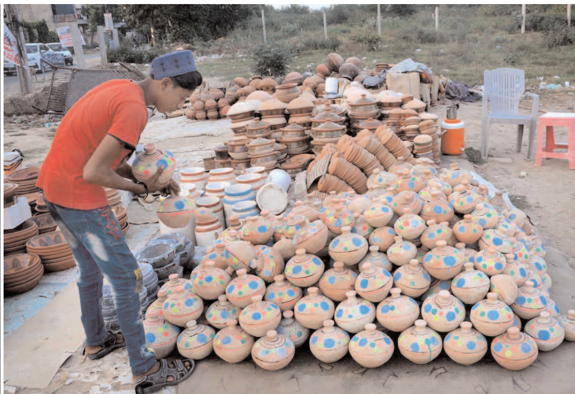
LAHORE: A vendor busy in arranging and displaying clay Golak (money boxes) to attract the customers at his roadside setup in Provincial Capital.

KARACHI (APP): Three ships, BD Pioneer-1, Seaspan Beacon and Hafnia Tagus scheduled to load/offload Rice, Containers and Gas oil, berthed at Multi-purpose Terminal, Container Terminal and Oil Terminal respectively on Thursday. Meanwhile three more ships, MSC Damla, Big Breezy and Red Cosmos carrying Containers and Coal also arrived at outer anchorage of the port on Friday morning.