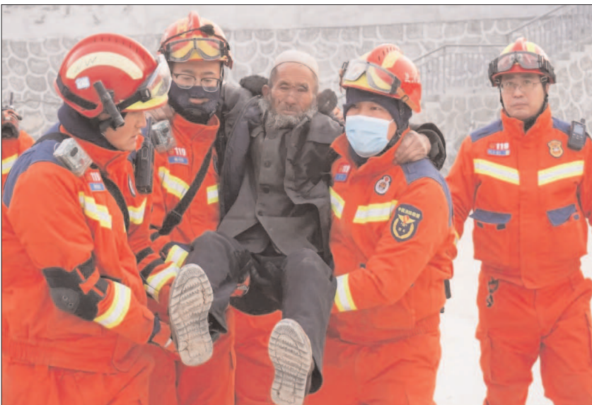
BEIJING: Rescuers carry an injured person in Dahe village in northwest China's Gansu province.

The US Geological Survey said on Monday night's magnitude-5.9 quake struck at a shallow depth at 11:59 pm local time (1559 GMT) with an epicentre around 100 kilometres (60 miles) from Gansu's provincial capital, Lanzhou. China's state news agency Xinhua reported the magnitude as 6.2 and said the shaking was felt as far away as the major city of Xi'an, about 570 kilometres away. Dozens of smaller aftershocks followed, and officials warned that tremors with a magnitude of more than 5.0 were possible in the next few days.