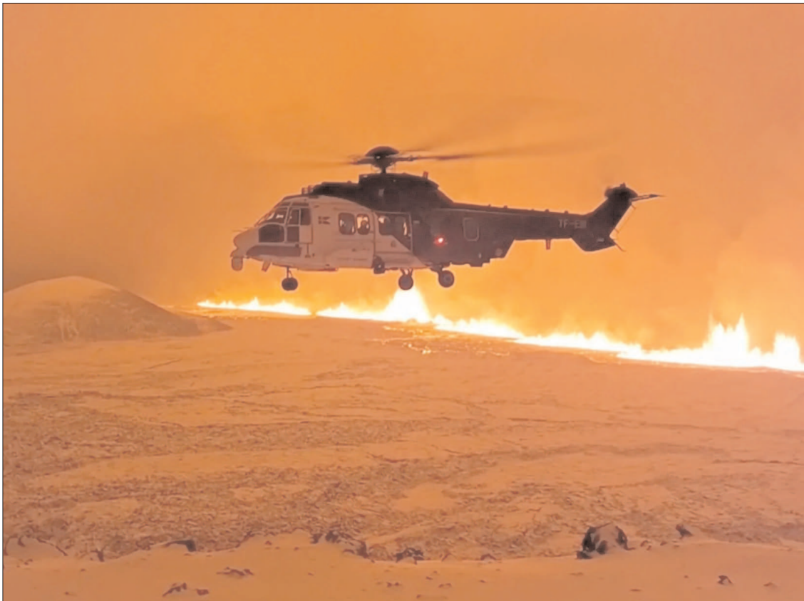
REYKJANES: An Icelandic coastguard helicopter flying above magma near Grindavik on Iceland's peninsula.