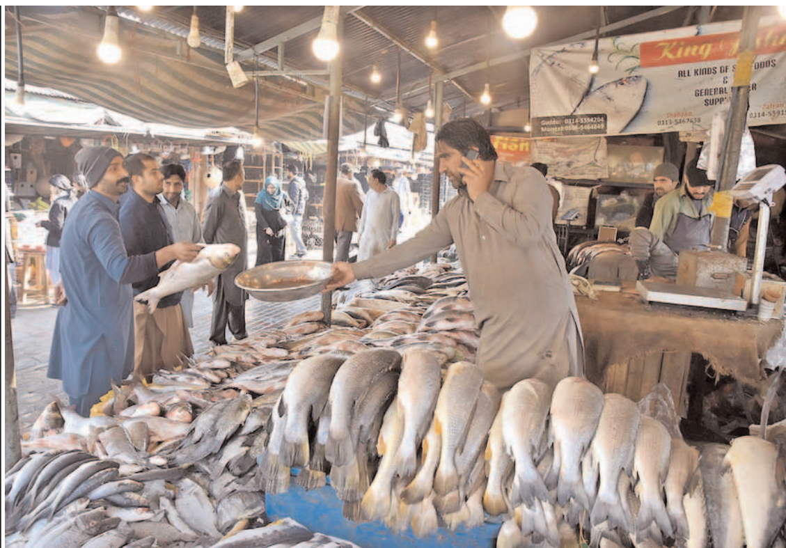
ISLAMABAD: People purchasing fish from vendor in Weekly Bazaar at Peshawar Mor.

The exchange rates of the Emirates Dirham and the Saudi Riyal decreased by 05 paise each to close at Rs77.06 and Rs75.44 respectively.