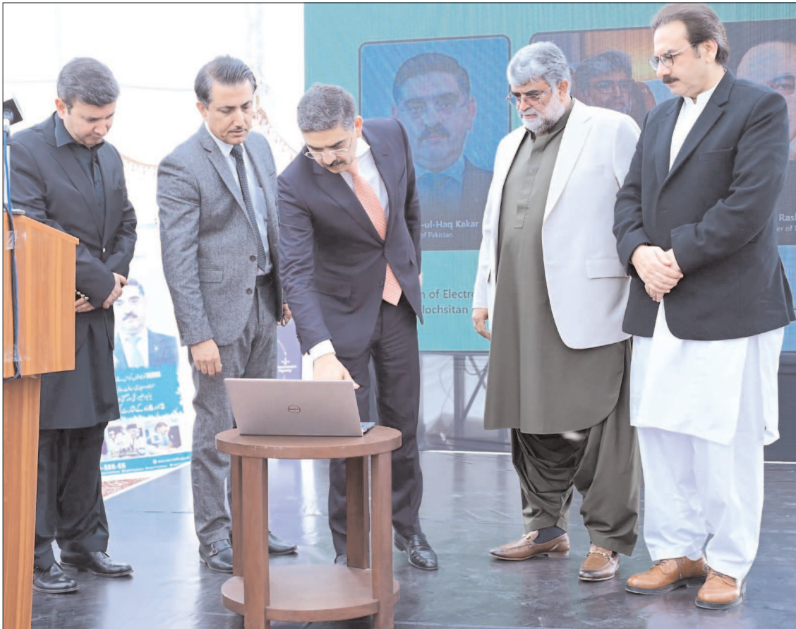
QUETTA: Caretaker Prime Minister Anwaar-ul-Haq Kakar launching Electronic Public Procurement System of Balochistan.

Vol. XXXIX No. 332 Regd. No. 241 JAMADI-US-SANNI 07 1445 -- WEDNESDAY, DECEMBER 20 2023 PESHAWAR EDITION 12 PAGES PRICE. 30