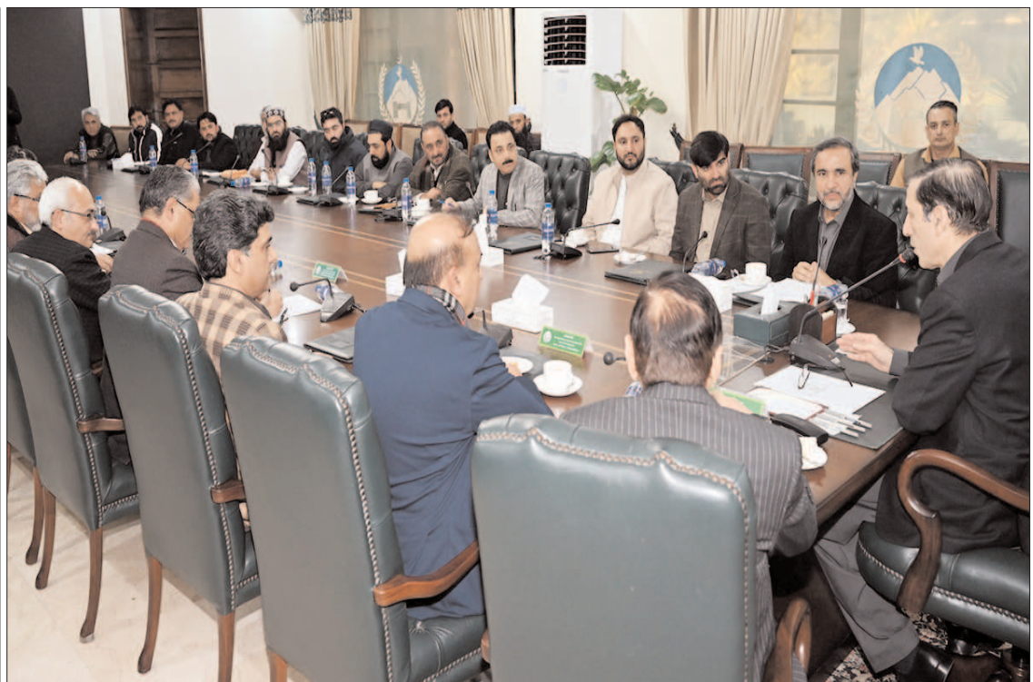
PESHAWAR: Caretaker Chief Minister Justice (retd) Syed Arshad Hussain Shah talking to a delegation of local government officials.