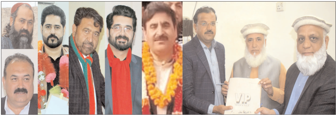
PESHAWAR: Members of various parties submitting nomination papers in RO office for general elections.

He said that struggle and commitment of Quaid-e-Azam created a separate homeland for Muslims where they are free to live according to their wishes and practice religion. He congratulated Christians on Christmas and said that 47 Christian employees of the hospital have been given salary and four holidays to celebrate Christmas.