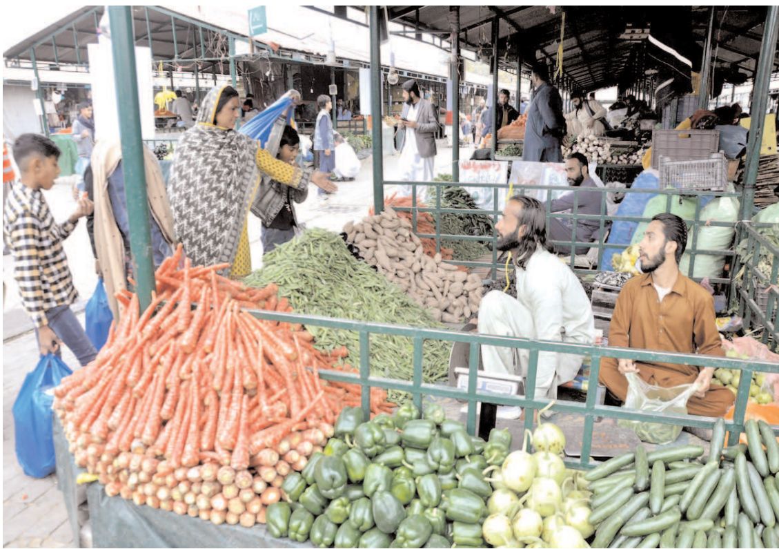
ISLAMABAD: A vendor selling vegetables on his stall at H-9 weekly bazar in federal capital.