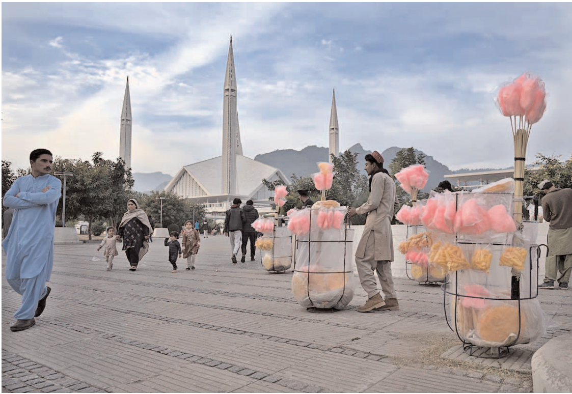
ISLAMABAD: Vendors displaying sweet and salty stuff to attract customers at Faisal Masjid.

ISLAMABAD (APP): Federal Board of Intermediate and Secondary Education (FBISE) has announced the results of second annual examinations of Intermediate for the year 2023, in which the overall success ratio of Class XI remained 79.99 per cent while Class XII was 75.10 per cent. According to the details, during the 2nd annual examination 2023 of the federal board, the 11th class regular enrollment was 56,643, out of which 45,008 students remained successful, with success ratio of 80.64 per cent. Furthermore, 1,030 ex-private students participated in the exams, out of which 358 students remained successful with the success ratio of 37.02 percent. The total annual enrollment of the eleventh class of the federal board was 57,673 out of which 45,366 students passed the exams with the overall success ratio of 79.99%. Similarly, in the 12th class, the regular enrollment of the board exams 2023 was 721, out of which 570 students had passed with success ratio of 80.51%. Meanwhile, in the same exam, the ex-private enrollment remained 20,096, while 13,738 students passed with success ratio of 73.59%. The total annual enrollment of the FBISE exams 2023 was 20,817 in class 12th, in which 14,308 students passed with overall success ratio of 75.10%.