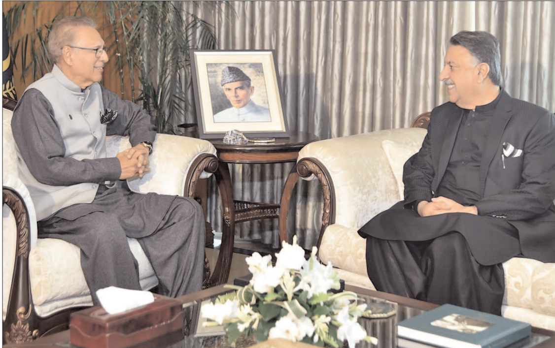
ISLAMABAD: Governor Balochistan Malik Abdul Wali Khan Kakar called on President Dr. Arif Alvi, at Aiwan-e-Sadr.