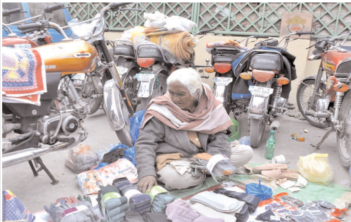
ISLAMABAD: An aged woman displays household items to sell for livelihood outside H-9 weekly bazar in federal capital.

As per the statement of K-Electric, the official said that the electricity connection would be restored after payment of complete amount along with arrears.