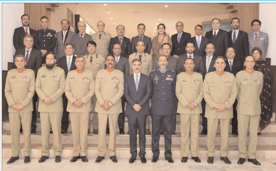
ISLAMABAD: Caretaker Prime Minister Anwaar-ul-Haq Kakar in a group photo with the President, directing staff of National Defence University and graduating civil service officers of National Security Course-2024.