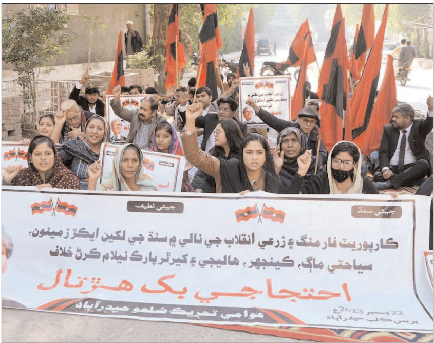
HYDERABAD: Activists of Awami Tehreek holding a protest in favour of their demands.

While the officers discussed the human trafficking law and the steps taken so far were carefully reviewed. The SP Investigation also urged the concerned representatives to ensure the implementation of specific Acts designed to prevent human trafficking. The SP Investigation issued instructions and said that a seminar and workshop should be held in this regard so that the public can get awareness about this law and added that any forced or physical labor on women, especially children, should be reported to the local police in time. Do it.