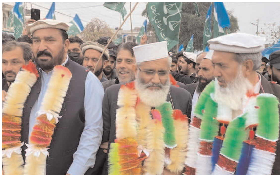
LOWER DIR: JI Chief Sirajul Haq and other party members coming after submitting of nomination papers for general elections.

He said that the people have faced "selected government" in past and they will not tolerate any such move in the future. "If the selection process is adopted this time, the nation will not accept it because now the majority of the population is comprised of young people who will not accept a 'selected' government," he added.