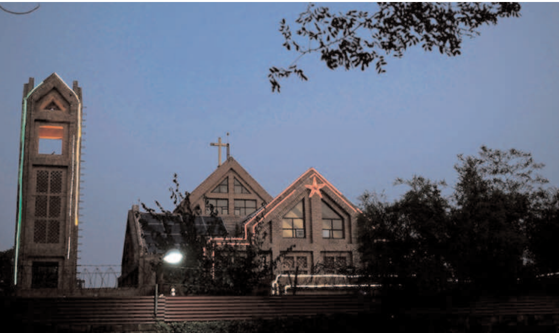
ISLAMABAD: An eye-catching view of a Church at G-7 decorated with colorful lights during Christmas celebrations.

This programme is envisioned to provide financial assistance to GB's students aspiring for undergraduate studies at HEC-recognised public sector universities in Pakistan. The programme was started in 2021, and until now, 275 students have been awarded this scholarship.