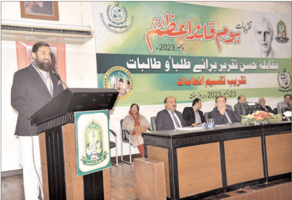
LAHORE: Punjab Governor Balighur Rahman is addressing the speech competition ceremony in connection with Quaid-i-Azam Day at Nazaria-i-Pakistan Trust.