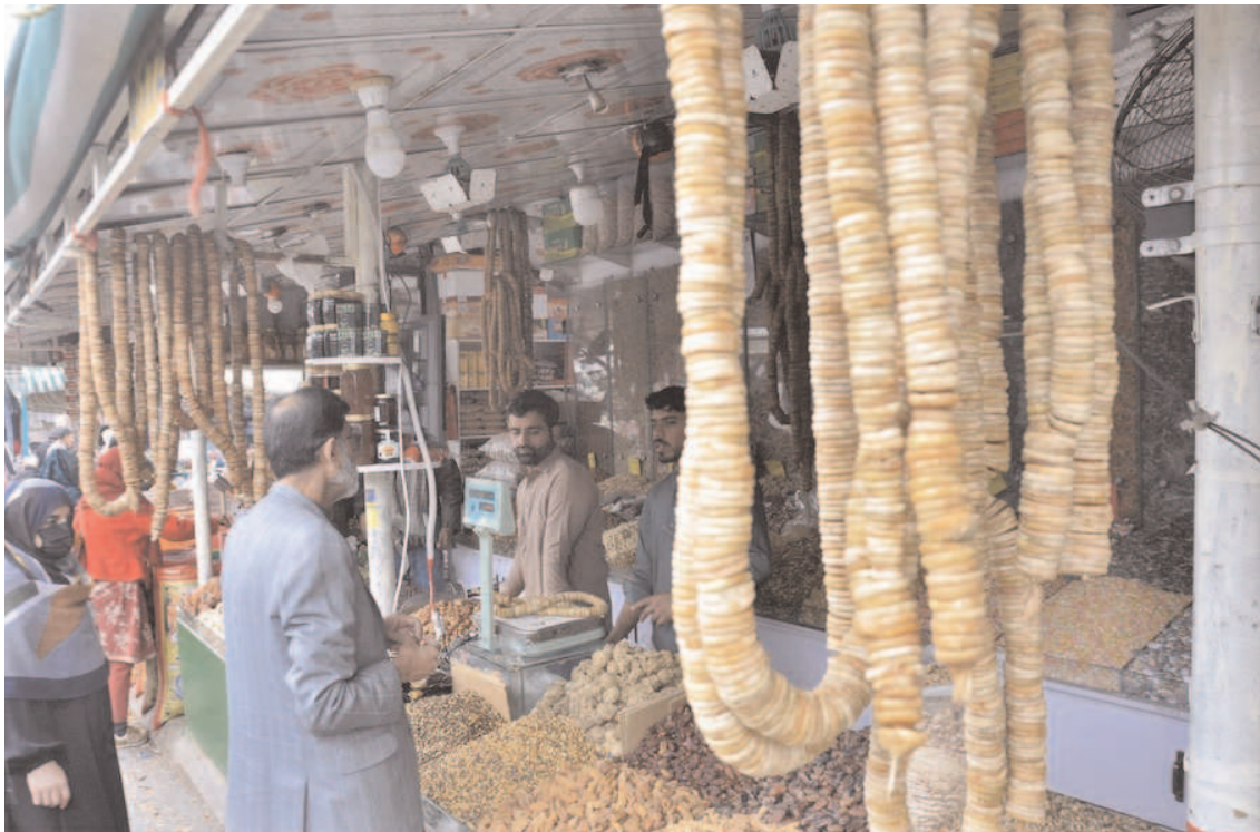
ISLAMABAD: Customers inquiring about dry fruits at a stall in H-9 Weekly Bazaar.