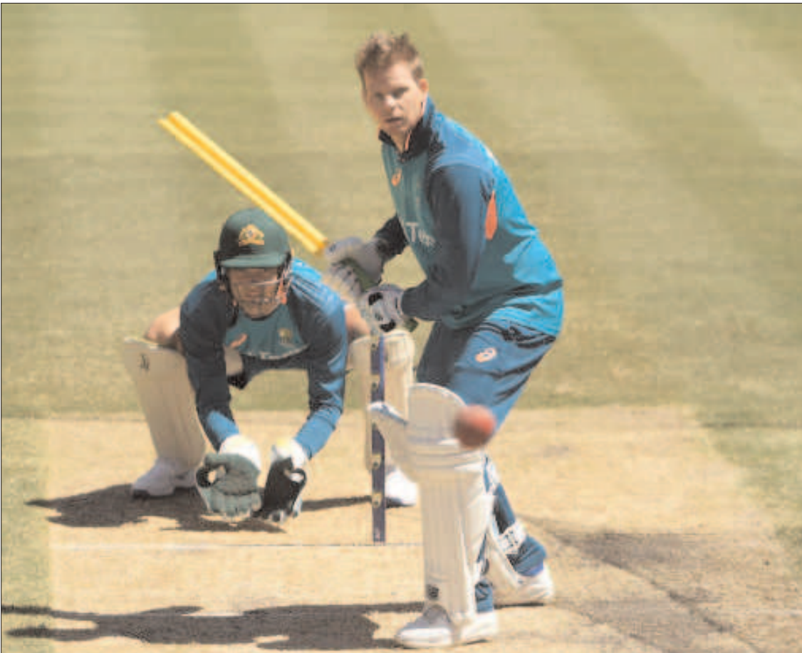
MELBOURNE: Steve Smith (R) and Alex Carey in action during an Australian Test squad nets session at Melbourne Cricket Ground.