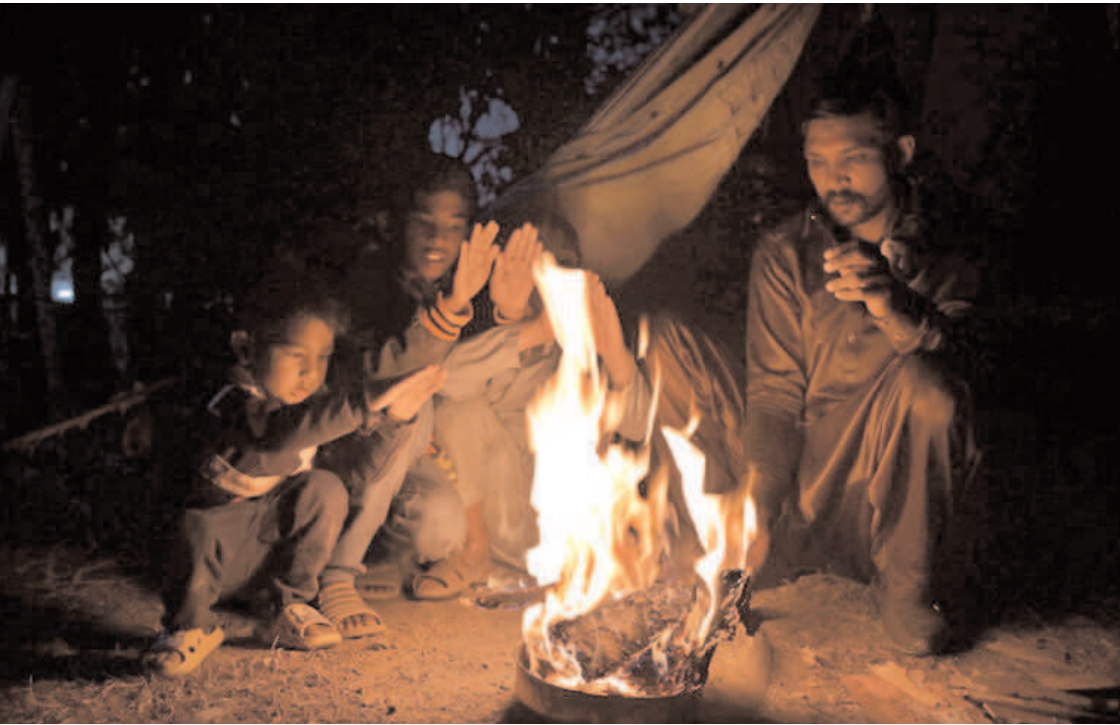
ISLAMABAD: A family sitting around the fire to keep them warm as the temperature falls in the city.

In his address, the Governor of Punjab commended the dedicated efforts of those instrumental in shaping the 100-day plan. He acknowledged and extended appreciation to SAPM Mushaal Hussein Mullick for her personal endeavours in championing human rights in Pakistan and tirelessly working towards the empowerment of Pakistani women to deserving status. The Governor also declared Mushaal as a source of inspiration and an emblem of the Kashmir freedom movement.