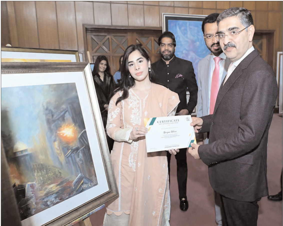
ISLAMABAD: Caretaker Prime Minister Anwaar-ul-Haq Kakar awarding certificate of appreciation to young artist for their artistic depictions of peace for Palestine cause.

Vol. XXXIX No. 336 Regd. No. 241 JAMADI-US-SANNI 11 1445 -- SUNDAY, DECEMBER 24 2023 PESHAWAR EDITION 12 PAGES PRICE. 30