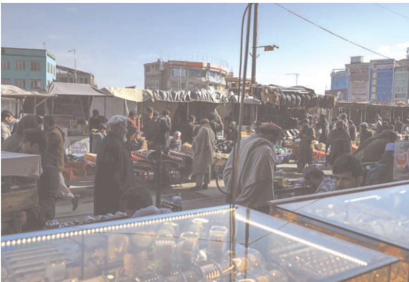
KABUL: People shop at a market in central Kabul.