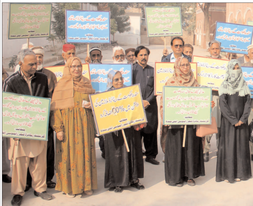
HYDERABAD: Members of government retired teachers association holding a protest rally in favour of their demands.

the amended act 2022 but were also bypassing the Teachers' Regularization Act 2022. He said the YTA was not ready to accept the CP Fund policy and demanded the government to reverse its decision regarding it. He said the high ups of the finance department and Accountant General office were contacted again and again but to no avail. The YTA leader said that they had no option other than setting up a protest sit-in at Peshawar against the government's apathy to accept the demand of thousands of public sector schools. He said that male and female teachers from across the province would participate in the YTA proposed sit-in at Peshawar on Dec 27.