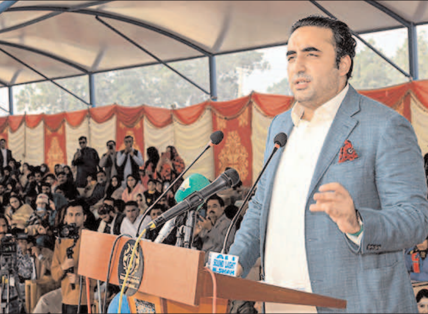
SHAHEED BENAZIRABAD: Chairman Pakistan People’s Party, Bilawal Bhutto Zardari addressing during convocation ceremony at Bakhtawar Cadet Collage for Girls.

Chairman Bilawal Bhutto Zardari said that provision of education and employment opportunities by the government is the right of the youth, adding that vocational training facilities will be provided to the youth along with financial support through Youth Card and Youth Centers. He vowed that youth centers will be established in every district with digital library, free Wi-Fi facility, vocational training and career counseling as well as cultural and sports facilities, adding that steps will be taken at the government level for the