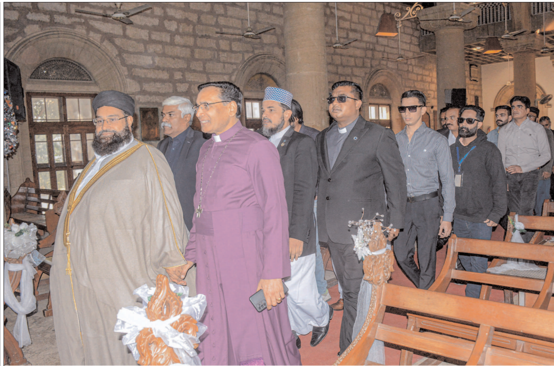
KARACHI: Special Representative to the Prime Minister on Religious Harmony & Islamic Countries and Chairman of Pakistan Ulema Council Hafiz Tahir Mahmood Ashrafi visiting Holy Trinity Cathedral Church.

Khyber Pakhtunkhwa. The fog and smog will prevail in plains of Punjab, KP and upper Sindh.