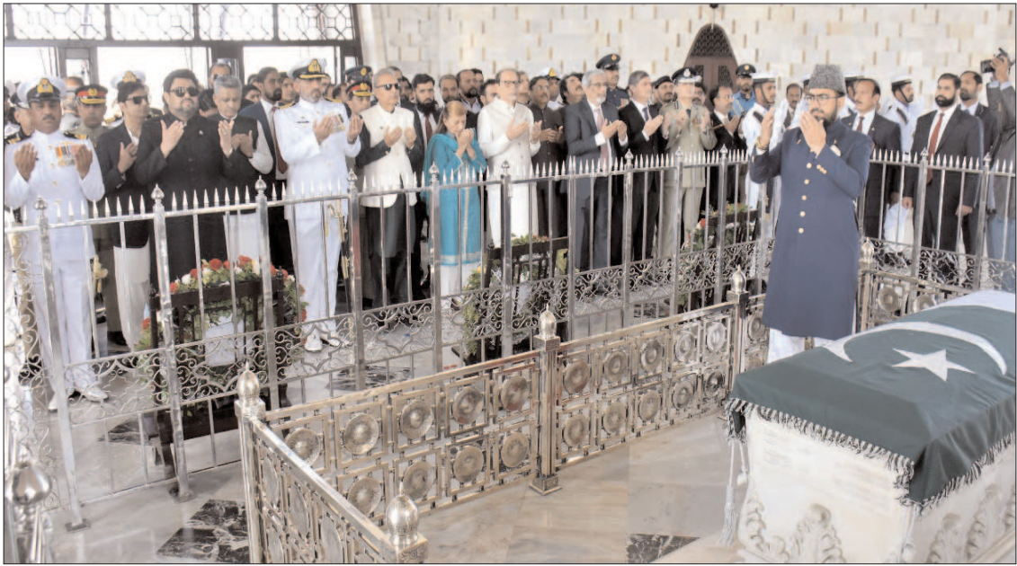
KARACHI: President Dr. Arif Alvi offering fateha at the Mausoleum of Quaid-e-Azam.