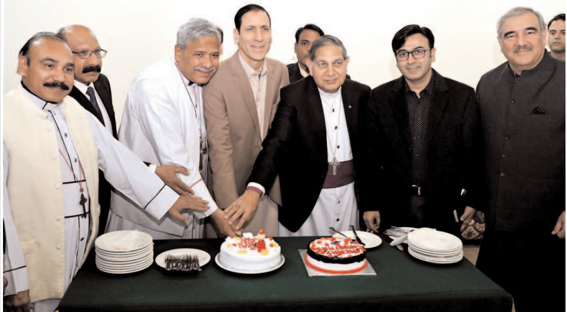
PESHAWAR: Caretaker Chief Minister Khyber Pakhtunkhwa Justice (R) Syed Arshad Hussain Shah cutting Christmas Cake.

Drawing parallels with neighboring India, the Chief Minister emphasized that the anti-Muslim stance of our neighbouring country underscores the correctness of the decision to establish a separate state for Muslims. Chief Minister Arshad Hussain Shah declared the collective determination of the nation to make any necessary sacrifices to ensure that the beloved homeland remains invincible. The statement echoed a sentiment of unwavering patriotism and a commitment to Quaid-e-Azam's vision for a strong and sovereign Pakistan.