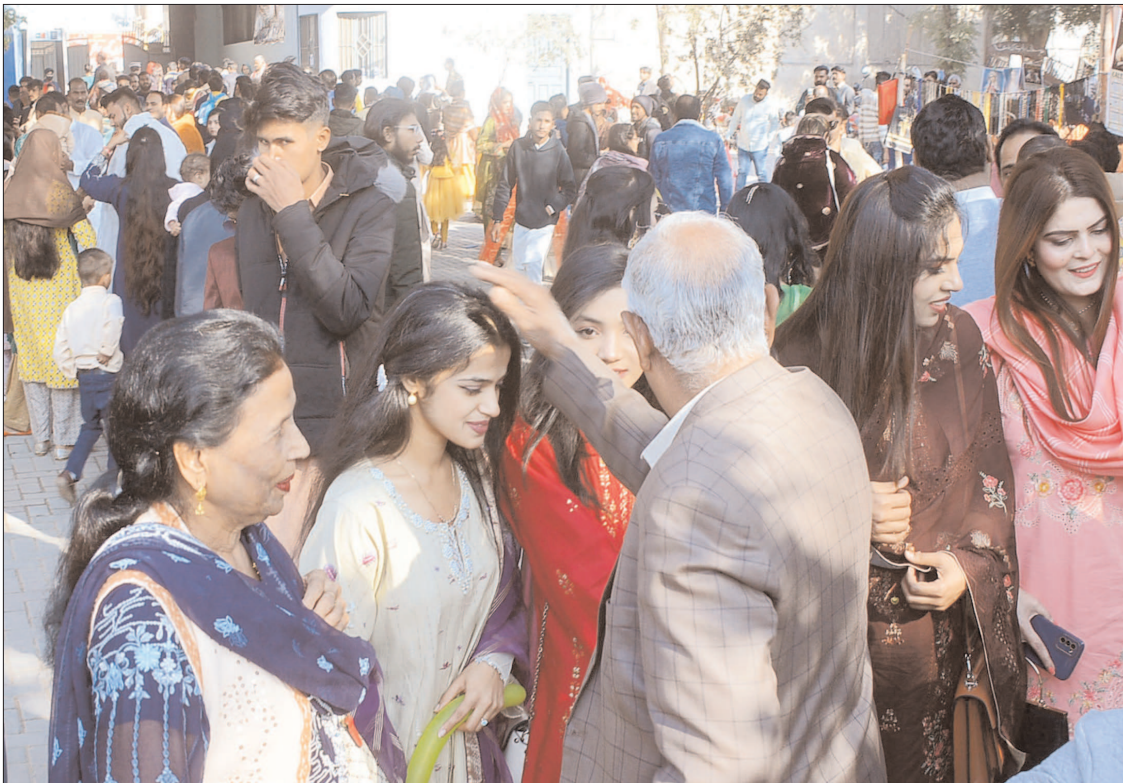
FAISALABAD: People from Christian community greeting after taking part in X-mass celebrations at Catholic Church.

SHIKARPUR (INP): Four people including a man and his son were shot dead in two different incidents in Shikarpur on Monday. Two people were slain and two others injured when two rival groups clashed in Hazarao Chadio village in Shikarpur's suburban area of Dakhan.