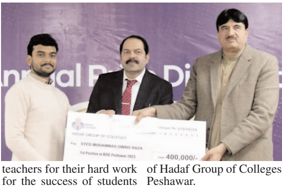
teachers for their hard work for the success of students of Hadaf Group of Colleges Peshawar.