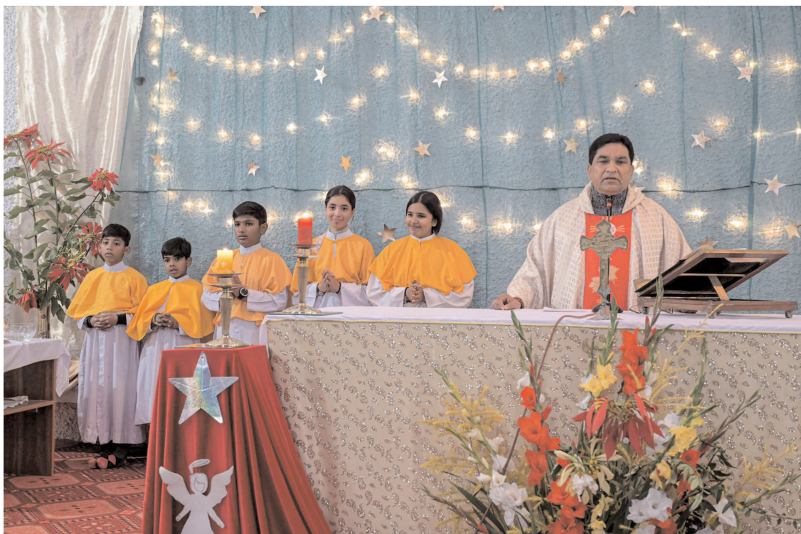
ISLAMABAD: Christian community members performing religious rituals on Christmas day at Fatima Church.