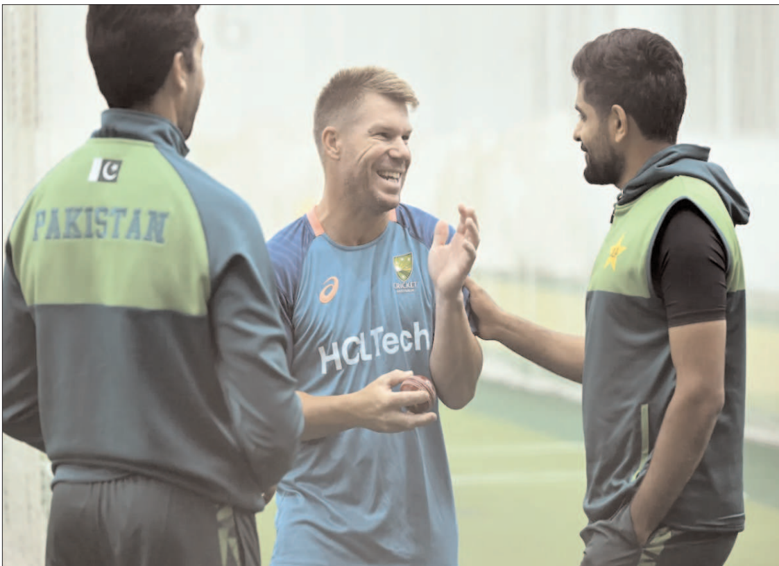
MELBOURNE: Umar Gul, David Warner and Babar Azam share a light moment in the nets.

They languish eighth in the Premier League this season, 12 points behind leaders Arsenal, and have been knocked out of the League Cup and the Champions League. Manager Erik Ten Hag's position is also likely to come under closer scrutiny, with the Dutch coach failing to build on ending United's six-year trophy drought by winning the League Cup last season.