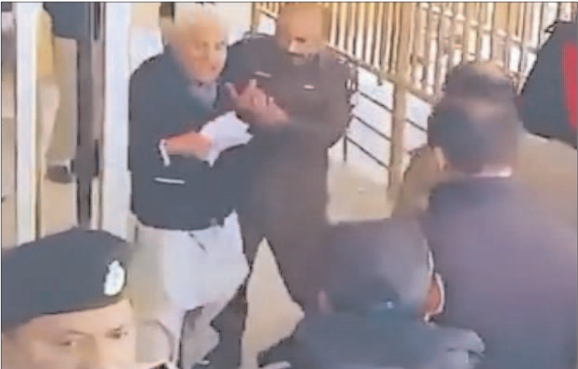
RAWALPINDI: PTI's Shah Mahmood Qureshi being forcibly arrested outside Adiala Jail.