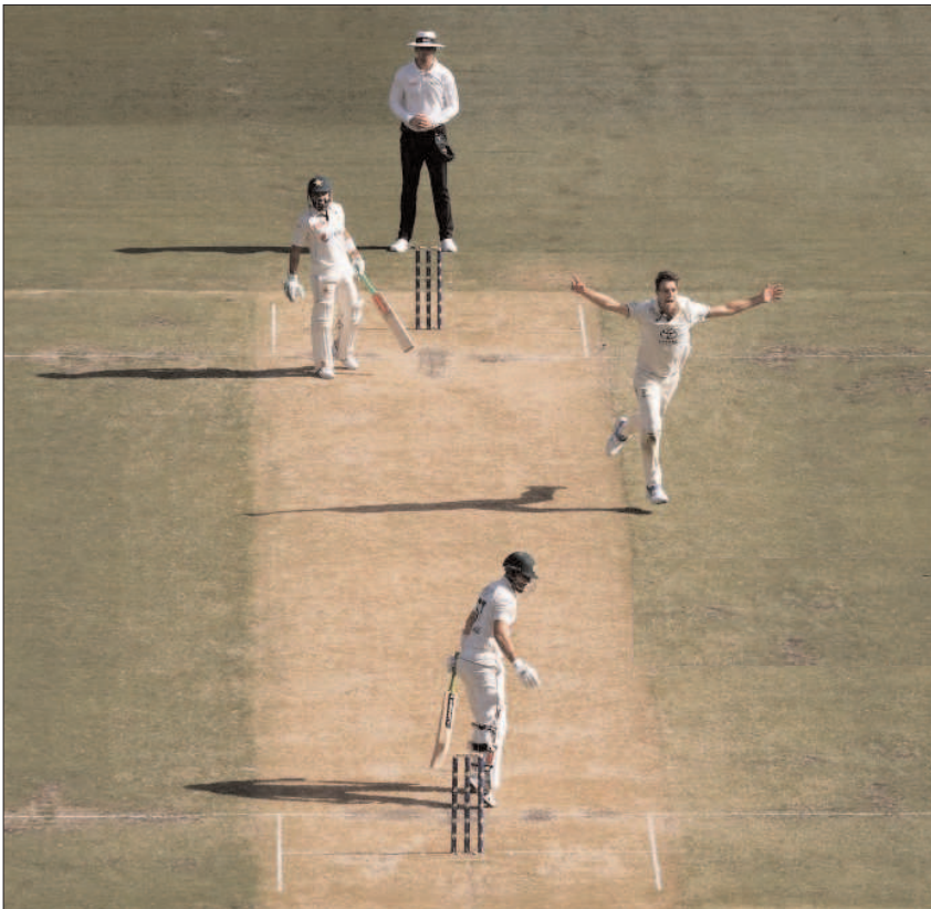
MELBOURNE: Pat Cummins celebrates the dismissal of Salman Ali Agha during day two of the Second Test Match between Australia and Pakistan.

Daryl Mitchell hit consecutive fours before falling for 14 to leave New Zealand 20-4. Mark Chapman hit 19 off as many balls before being caught with the score on 50-5.