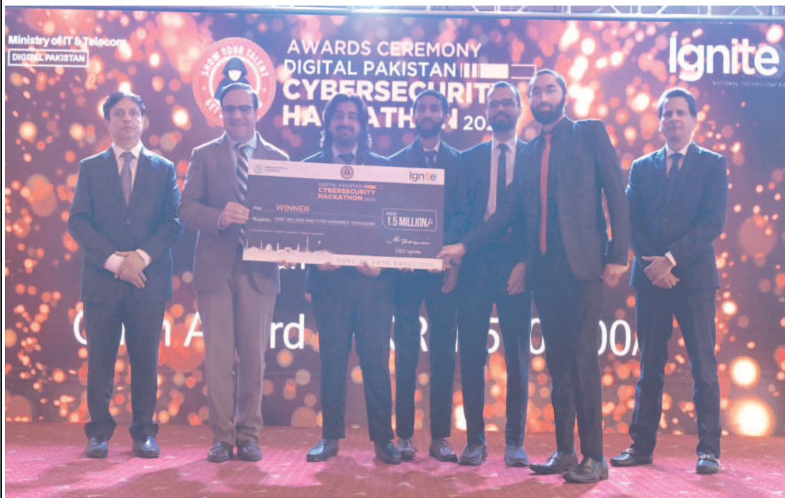
ISLAMABAD: Caretaker Federal Minister for IT & Telecommunication, Dr. Umar Saif giving award to the winner team during Awards Ceremony of Digital Pakistan Cyber security Hackathon-2023.

The nutritionist urged the masses to read food labels carefully, choose whole, unprocessed foods whenever possible, and limit the intake of sugary snacks and beverages. He believed that a collective effort to reduce sugar consumption would lead to a healthier population and a significant decrease in the prevalence of diet-related diseases.