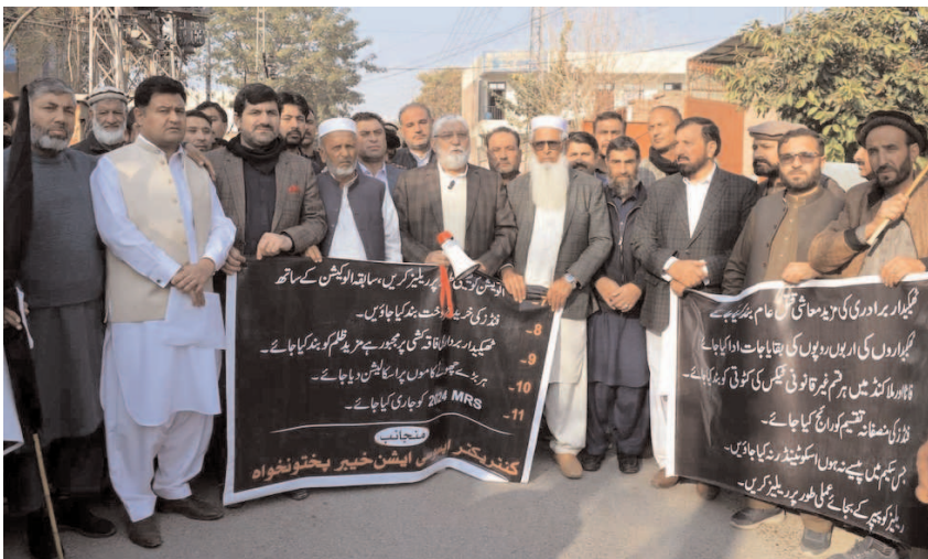
PESHAWAR: Members of Contractor Association hold placards during a protest.