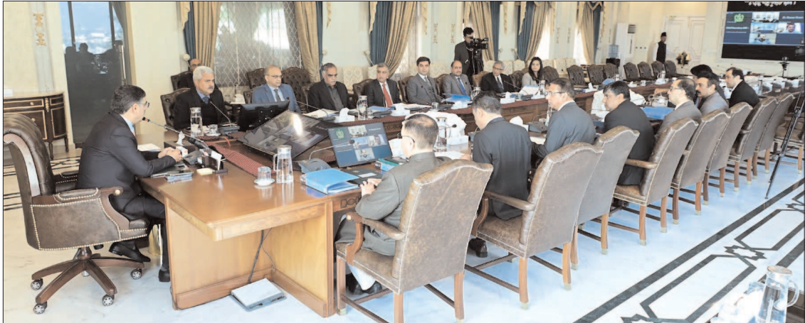
ISLAMABAD: Caretaker Prime Minister Anwaar-ul-Haq Kakar chairing the 5th meeting of Board of Governors of Special Technology Zones Authority.