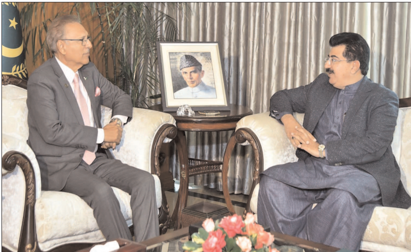
ISLAMABAD: Chairman Senate, Muhammad Sadiq Sanjrani called on President Dr. Arif Alvi, at Aiwan-e-Sadr.

Yemen's Iran-backed Houthi militia claimed responsibility for a missile attack on Tuesday on a container ship in the Red Sea and for an attempt to attack Israel with drones. The attacks are a response to Israel's assault on Gaza, the militia says. An Israeli airstrike killed a senior leader of Iran's Revolutionary Guards in Syria on Monday.