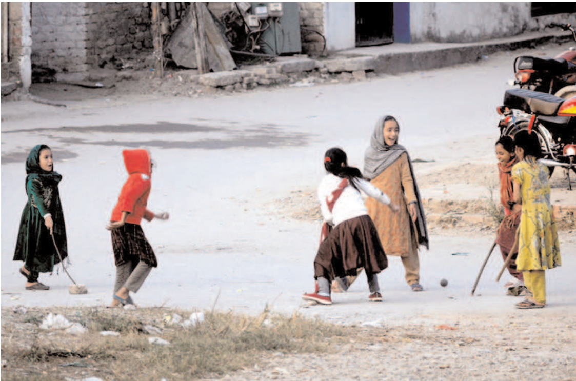
ISLAMABAD: Children enjoying play in a street at the slum area of G-7.

Palwasha Khan, representing PPP said that Pakistan Peoples Party has shown commitment to energy renewables in the past, and it will continue its legacy of facilitating pro-people development models in every sector of the economy. In the end, Ubaidullah Chaudhary thanked the participants and political parties in showing commitment and solidarity with the cause of sustainable renewable energy.