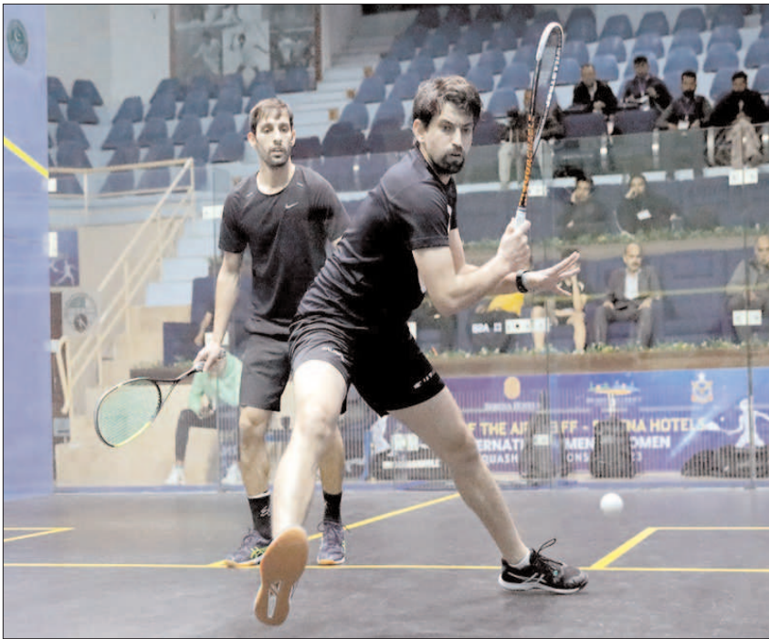
ISLAMABAD: Players in action during CAS-Serena Hotels International Squash Championship for Men & Women organized by Pakistan Squash Federation in collaboration with PAF & Serena Hotels.

LONDON (Agencies): Ronnie O'Sullivan marched into the UK Championship final with a comprehensive 6-2 victory over Hussein Vafaei. The seven-time world champion, 47, led from start to finish as he proved too strong for Iran's Vafaei in York. He will play either Judd Trump or China's Ding Junhui on Sunday for the £250,000 first prize. "Sometimes survival is just the difference, it can help you win tournaments," O'Sullivan told the BBC. "He missed a few balls, let me off the hook a few times and didn't put any pressure on me. "I just want to do myself justice in matches and play well. "Playing well under pressure is important, but I'm just motivated by cash." Breaks of 113 and 54 enabled world number one O'Sullivan to lead 2-0, but Vafaei, 29, rallied with a century and won a scrappy fourth frame to restore parity. It was one-way traffic after that as the seven-time world champion showed his pedigree with breaks of 90, 60, 52 and 50 to secure a spot in his ninth UK Championship final. "I didn't have my heart in front of my hero," said Vafaei, the world number 18. "My body just felt heavy, it felt like somebody had poured cold water on me. "I've had a good tournament and only one man could stop me - and that was Ronnie O'Sullivan." O'Sullivan will be appearing in the final for the ninth time and is chasing a record-extending eighth UK title.