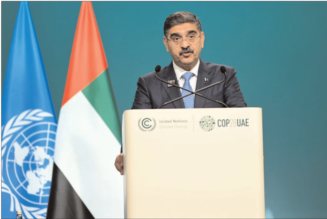
DUBAI: Caretaker Prime Minister Anwaar-ul-Haq Kakar makes a national statement at the World Climate Action Summit/COP28.