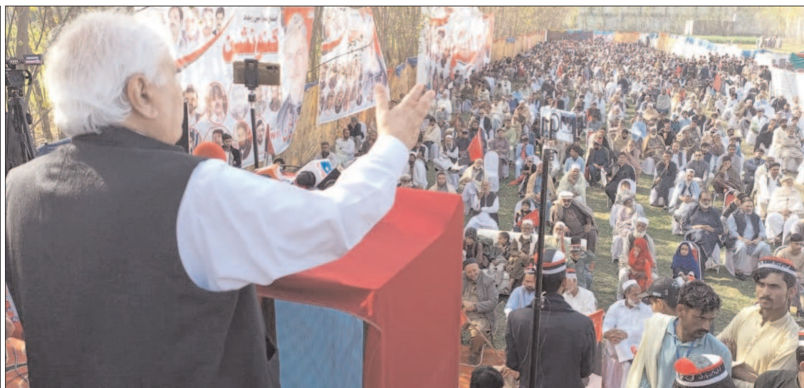
SWABI: Qaumi Watan Party Chairman Aftab Ahmad Khan Sherpao addressing party's workers convention.

in 36 robbery and other cases. The police recovered Rs.1.3117 million in cash, illegal weapons, mobile phones and other items from their possession while an investigation is ongoing, he added.