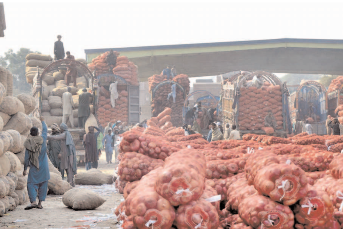
MULTAN: A large number of laborers unloading onions on delivery truck at vegetable market.

My name is Asadullah Khan. But in some academic certificates it is noted as Asadullah. Please rectify as Asadullah Khan s/o Humayun Khan.