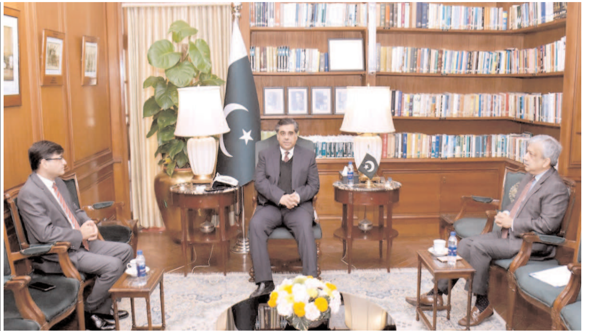
KARACHI: Deputy Governor SBP calls on Caretaker Federal Minister for Commerce and Industries & Production Dr. Gohar Ejaz at Governor House.

ISLAMABAD (APP): The per tola price of 24 karat gold decreased by Rs.1,900 and was sold at Rs.220,900 on Friday compared to its sale at Rs.222,800 on the last trading day. The price of 10 grams of 24 karat gold also decreased by Rs.1,629 to Rs.189,386 from Rs.191,015 whereas the price of 10 gram 22 karat gold went down to Rs.173,604 from Rs.175,097, the All Sindh Sarafa Jewellers Association reported. The price of per tola and ten-gram silver remained unchanged at Rs2,680 and Rs.2,297.66 respectively. The price of gold in the international market decreased by $15 to $2,090 from $2,105, the Association reported.