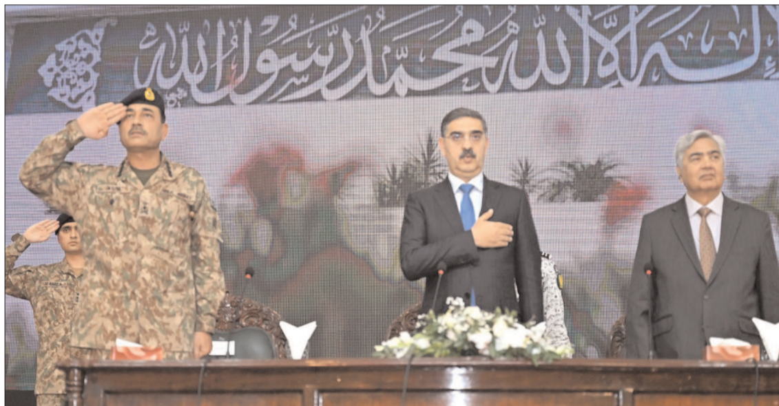
ISLAMABAD: Caretaker Prime Minister participating in National Farmer's Convention as chief guest.