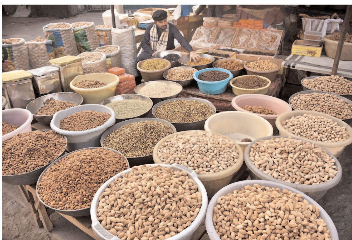
LAHORE: A vendor selling dry fruit at his roadside setup.