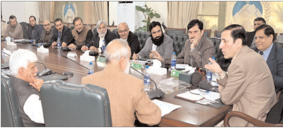
PESHAWAR: KP Caretaker Chief Minister Justice (R) Syed Arshad Hussain Shah chairing a meeting regarding issues of Ayub Teaching Hospital, Abbottabad.