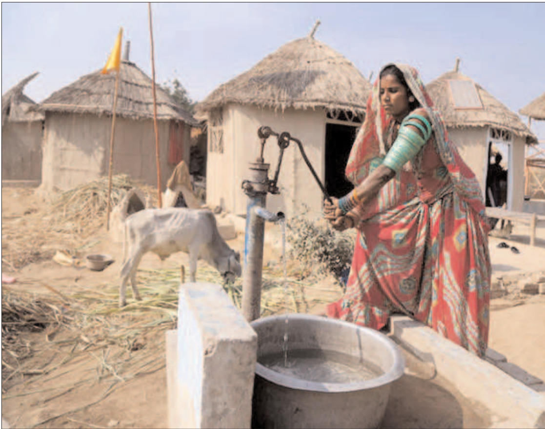
TANDO ALLAHYAR: A villager lady filling water from a hand pump at the model of the Climate Resilience Markaz of bamboo housing by the Intellectual Property Organization, Government of Pakistan, in Pono village.