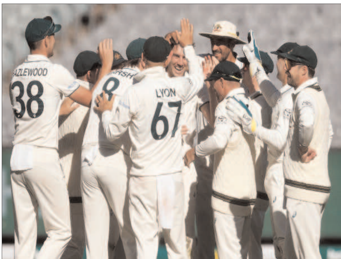
MELBOURNE: Pat Cummins of Australia (C) celebrates the dismissal of Mohammad Rizwan of Pakistan during day four of the Second Test Match between Australia and Pakistan at Melbourne Cricket Ground.

India's test squad: Rohit Sharma (captain), Shubman Gill, Yashasvi Jaiswal, Virat Kohli, Shreyas Iyer, KL Rahul, Ravichandran Ashwin, Ravindra Jadeja, Shardul Thakur, Mohammed Siraj, Mukesh Kumar, Jasprit Bumrah, Prasidh Krishna, KS Bharat (wk), Abhimanyu Easwaran, Avesh Khan.