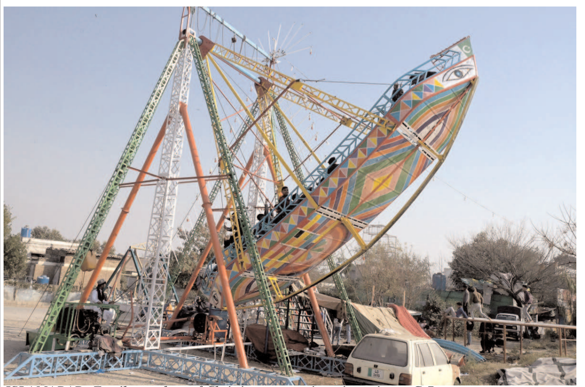
ISLAMABAD: Family members of Christian community enjoy swing at G-7.

HEC, in collaboration with relevant stakeholders including Ministry of IT