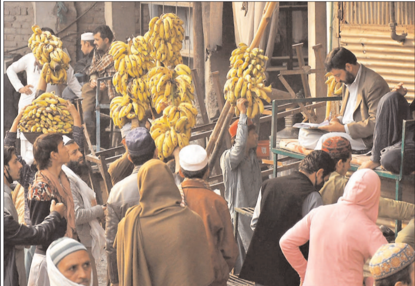
PESHAWAR: Labourer busy in work at fruit market.

On this occasion, the caretaker minister also assured all possible support from the government in the expansion of franchises of best private schools in the merged districts and said that this offer is for all groups of best and reputable schools. In the meeting, Dar-Arqam educational chain expressed his willingness to the caretaker minister's offer and assured the provision of possible services on behalf of his institution in this regard.