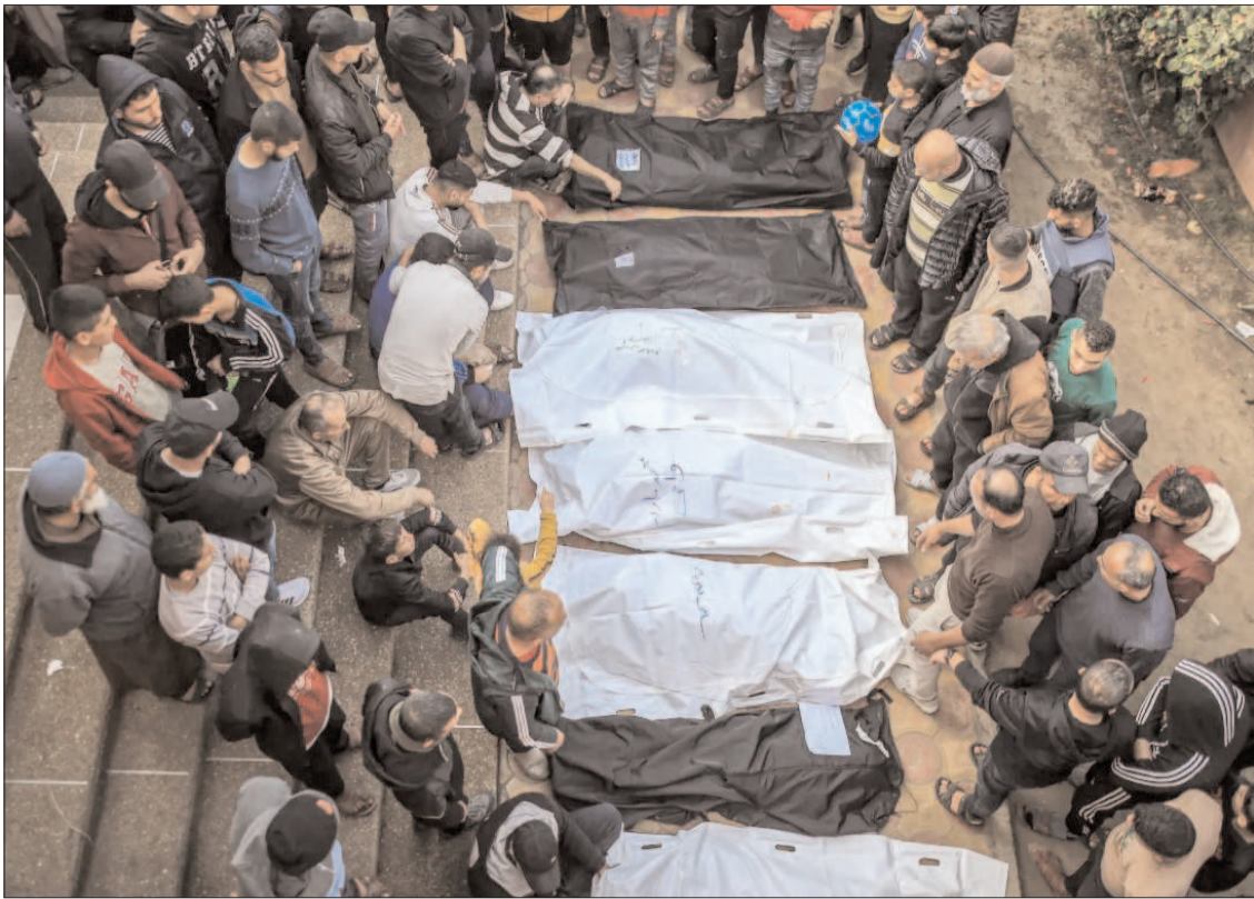
GAZA: People stand over the shrouded bodies of loved ones killed during an Israeli bombardment at Nasser hospital in Khan Younis.