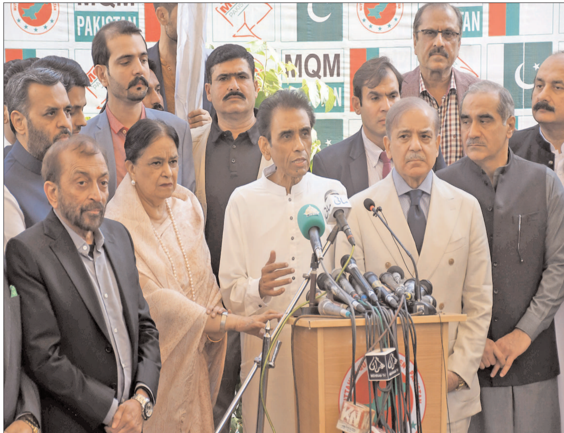
KARACHI: MQM-P Convener Khalid Maqbool Siddiqui and PML-N leader Shehbaz Sharif talking to media persons.