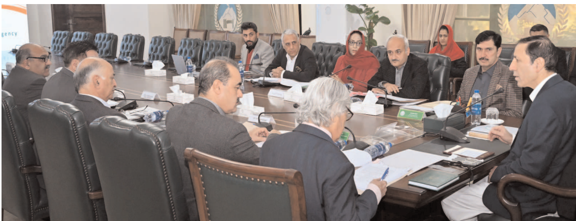
PESHAWAR: Caretaker Chief Minister Khyber Pakhtunkhwa Justice (R) Syed Arshad Hussain Shah chairing 31st Meeting of BoGs of Educational Testing and Evaluation Agency.

These alarming figures underscore the urgent need for comprehensive awareness campaigns and accessible treatment facilities to combat the spread of AIDS in KP. government must prioritize preventive measures and allocate adequate resources to effectively address this public health crisis.