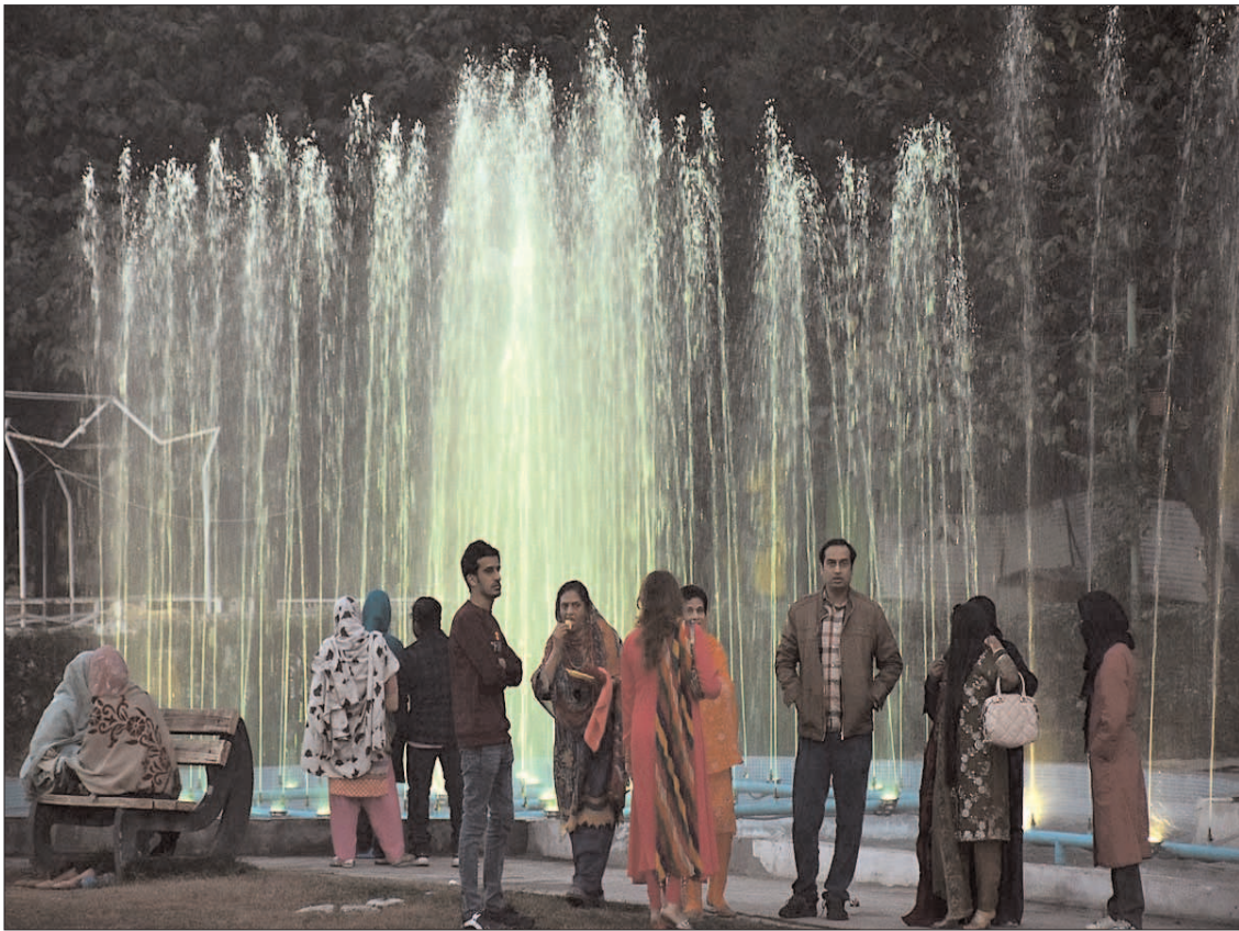
LAHORE: People enjoying the colorful water fountains at Jilani Park.

It was told in the meeting that there were 21 Livestock farms in Punjab. Hybrid fodder is cultivated on 18,880 acres of land in 13 farms. Minister was briefed that 'Qalma' of Hybrid fodder was being prepared in the Livestock department. Almost 11,000 animals were being given hybrid fodder in government farms and buffaloes were giving good results after eating simple fodder, meeting told. It was further told in the meeting that our buffaloes were among best milk producing animals in the world. The minister said that good amount of forex could be fetched through exporting hybrid fodder, adding that incentives had to be given to farmers to boost cultivation of fodder.