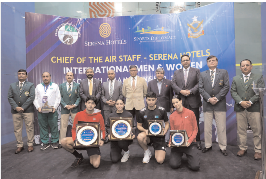
ISLAMABAD: Prize distribution ceremony of CAS-Serena Hotels International Squash Championship 2023.

MANCHESTER (INP): Manchester City were stunned by a Dejan Kulusevski's 90th minute equaliser earned Spurs a thrilling 3-3 draw at the Etihad on Sunday. Tottenham manager Ange Postecoglou insisted he would not relent from his philosophy of relentless attacking football despite facing the might of City with a mounting injury crisis and earned his reward. Spurs captain Son Heung-min scored at both ends inside the opening 10 minutes. Phil Foden put City in front before half-time, but Giovanni Lo Celso levelled 20 minutes from time. Jack Grealish restored the home side's lead once more, only for Kulusevski's header to ensure City have now dropped points in five of their last eight league games. The English and European champions drop to third in the table, three points behind leaders Arsenal. A point lifts Tottenham into fifth and snaps a run of three consecutive defeats. The visitors' daring approach was met with an early reward. Son raced onto Kulusevski's ball over the top and Ederson failed to prevent the South Korean scoring his eighth goal against City. The lead only lasted three minutes as Son cancelled out his opener at the wrong end.