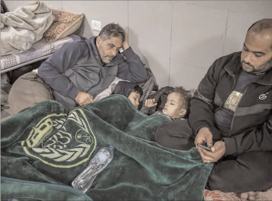
GAZA: Displaced Palestinians take refuge in Nasser Medical Complex as attacks continue in Khan Younis.

Israel says it targets Hamas operatives and blames civilian casualties on the militants, accusing them of operating in residential neighborhoods. It claims to have killed thousands of militants, without providing evidence. Israel says at least 81 of its soldiers have been killed. — Arab News