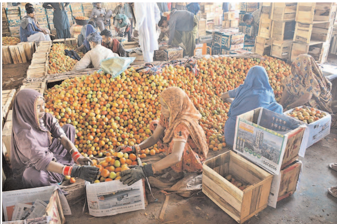
HYDERABAD: Labourers women packing fresh tomatoes in wooden boxes at vegetable market.

He, however, urged the government to review the massive gas price hike and revise its decision in the best interest of industries and the economy of the country.