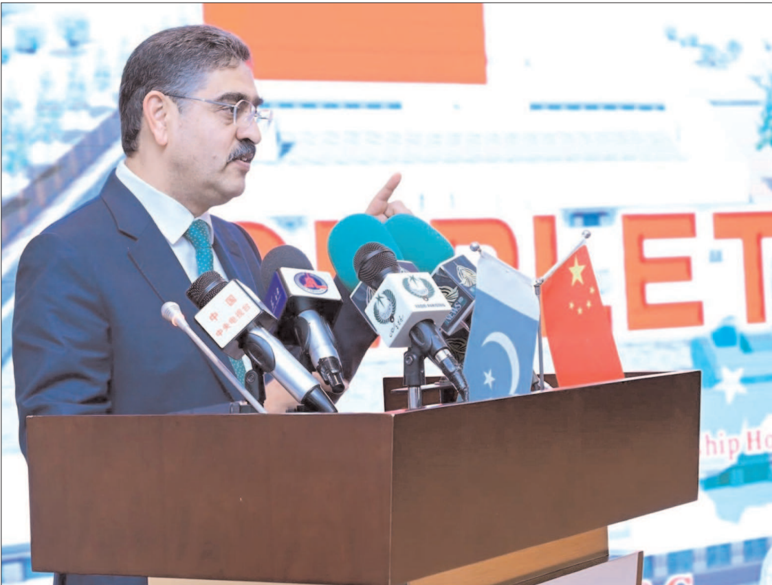
GWADAR: Caretaker Prime Minister Anwaar-ul-Haq Kakar addressing the inauguration ceremony of Pak-China Friendship Hospital Project and China-Aid Gwadar Seawater Desalination Project.