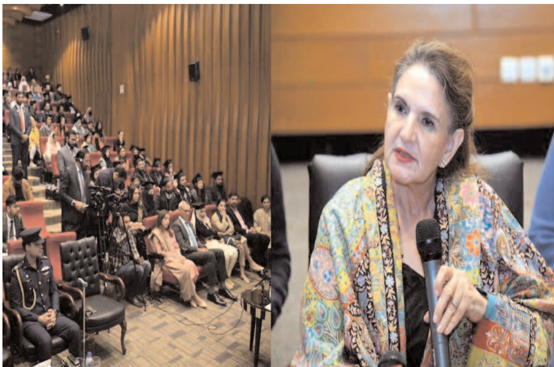
ISLAMABAD: First Lady Begum Samina Alvi addressing the graduation ceremony of students with disabilities of the Network of Organizations Working with Persons with Disabilities Pakistan (NOWPDP).