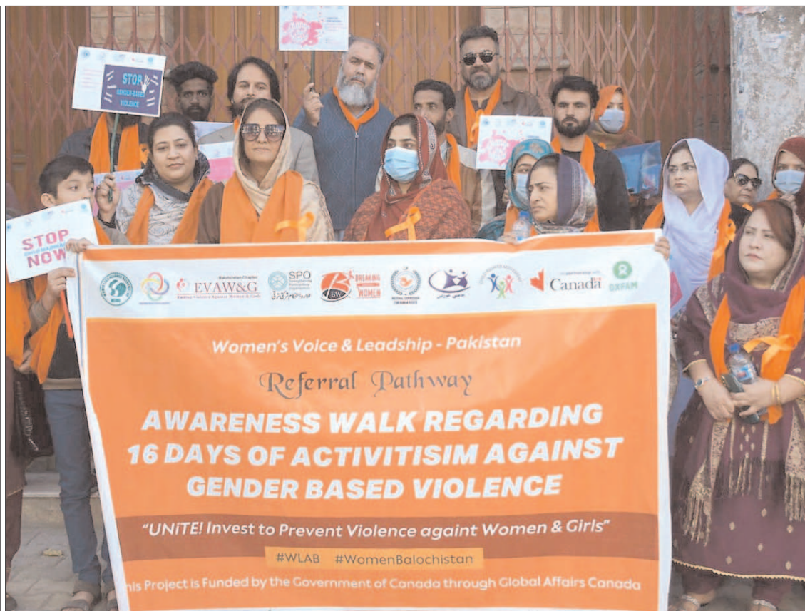
QUETTA: Ending violence against women members holding a banner and placards for acceptance of their demands.