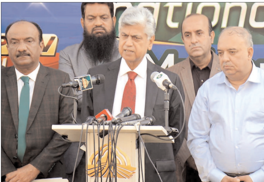
MULTAN: Caretaker Federal Minister for Information and Broadcasting and Parliamentary Affairs, Murtaza Solangi addressing the inauguration ceremony of 24/7 transmission of PTV National.

Khyber Pakhtunkhwa will come out [for the polls], God willing Punjab will also come out. God willing so will Karachi, so will Sindh, so will Balochistan for Imran Khan, for their honour," he said.