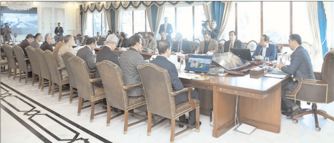
ISLAMABAD: Caretaker Prime Minister Anwaar-ul-Haq Kakar chairing a meeting of task force on polio eradication.

LANDI KOTAL: The Pak-Afghan border, Torkham was suspended for export and import, when a dispute erupted between the officials of the both countries over the installing of welcoming sign board at the crossing here on Wednesday. The official said that the Pakistani border security officials installing welcoming sign board at the export route.