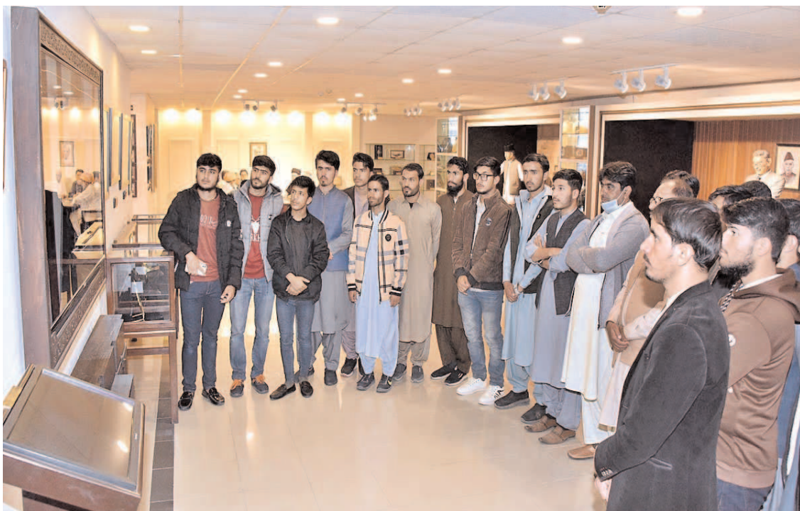
ISLAMABAD: A group of students and faculty members of the Balochistan residential college, Zhob visiting senate museum at Parliament House.

500 grams hashish and 250 grams of Ice drug were recovered from the possession of the accused.