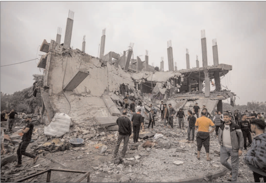
GAZA: Neighbours and rescue teams look for survivors after the Israeli attack.