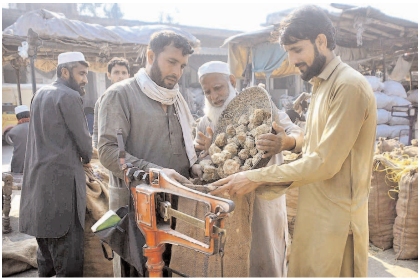
PESHAWAR: Vendors busy in filling sacks with traditional sweet ‘Gur’ for selling purpose at Gur Mandi.

Pesco to control electricity pilferage. He said that timely actions have reduced load shedding considerably. He also urged people to install meters, avoid power theft and pay their electricity bills to ensure a smooth supply of electricity to consumers.