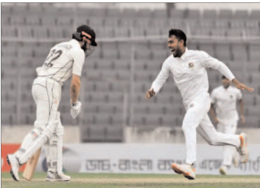
DHAKA: Mehidy Hasan Miraz wheels away in celebration after getting the big wicket of Kane Williamson.

"I know it's a difficult tournament but I hope to be ready to compete, I don't aspire to anything else but to be competitive."