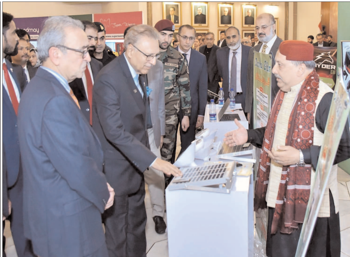
ISLAMABAD: President Dr. Arif Alvi being briefed about innovative technological startups and their products, at the Angels Investors Summit and Startup Showcase held at Aiwan-e-Sadr.

It added that the ongoing Sindh Secondary Education Improvement Project would receive additional financing of $275 million emergency assistance loan that was part of ADB's $1.5 billion pledge of support for Pakistan's recovery from the devastating 2022 floods. "The additional financing will help reconstruct up to 1,600 flood-damaged schools using disaster- and climate-resilient and gender-responsive designs," it informed. "This will boost resilience and inclusivity in the education system in Pakistan, helping recovery of learning and earning losses especially for girls in the most disadvantaged and vulnerable districts of Sindh."