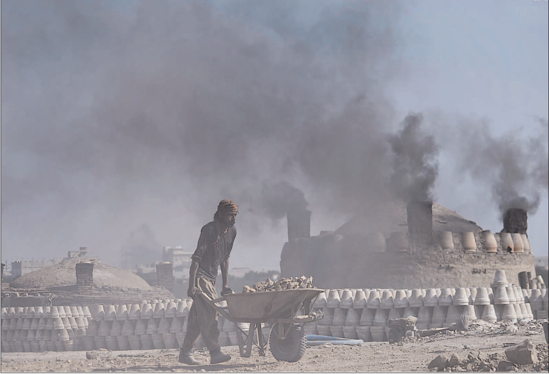
KARACHI: A man drive thru Dust in area of Karachi.