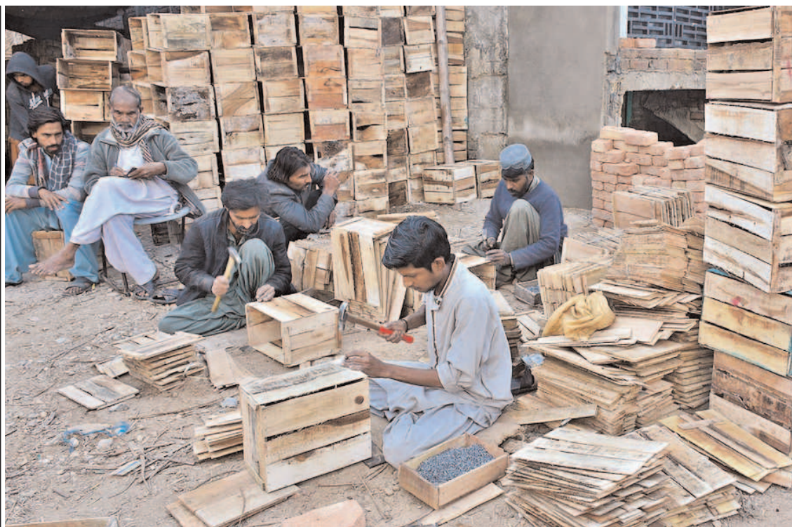
HYDERABAD: Labourers busy in preparing wooden boxes for packing fruits and vegetables at vegetable market.

The enablement of RAAST P2M facility is likely to give a big boost to the SBP digitization efforts enabling hundreds of thousands of vendors across the country to receive payments against the goods and services in their accounts on real time basis.