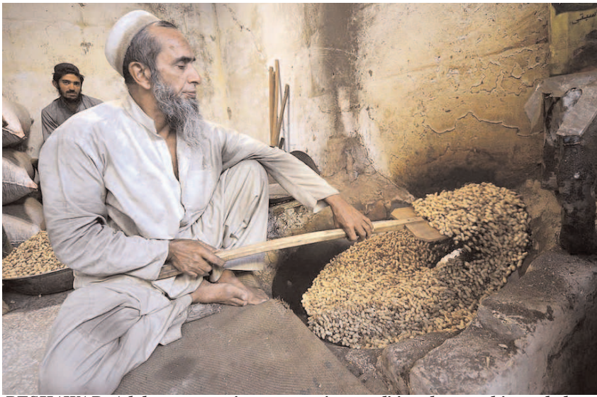
PESHAWAR: A labourer roasting peanuts in a traditional way at his workplace.

She urged all to come forward and play their part in making people with disabilities independent and useful citizens of society. She appreciated the management, faculty, and staff of SEC Peshawar for their efforts.