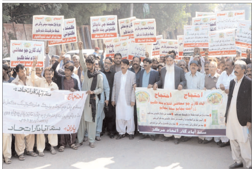
HYDERABAD: Growers holding a protest demonstration in favour of their demands.

The Pakistan Muslim League Nawaz has also launched its election campaign and the party seems more active in PK 15 and PK 16 wherein party gatherings are held on daily basis. The PPP, PTI, JUI-F, Quami Watan Party and others are yet to announce their candidates. However, the PPP, PTI and JUI-F are also holding party gatherings and corner meetings. The PTI, despite hardships, succeeded in holding a workers' convention at Mayar here the other day. The former MNA Bashir Khan and other activists addressed the gathering which was attended by hundreds of party workers from parts of Jandol sub division.