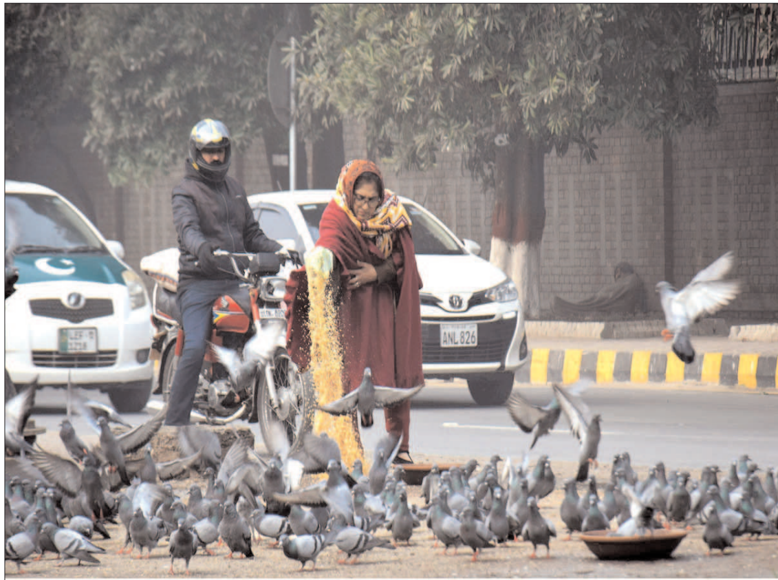
LAHORE: Woman throwing food for pigeons as mercy at roadside in the Provincial Capital.