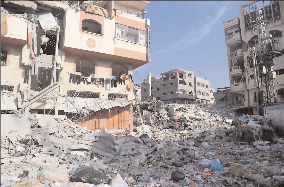
GAZA STRIP: A view of destroyed buildings after Israeli airstrikes on Ba'it-ul-Laiha area.

Here in Rafah, there are no large hospitals, only mid-sized hospitals or smaller centres and clinics. Outside the Kuwaiti hospital, we can see the wounded being brought in. However, they are only staying in the hospital for around 30 minutes – long enough for their information to be taken – because the facility is running out of space. Then, they are sent to either the Abu Youssef Najjar Hospital, which is a mid-sized facility and has relatively better equipment, or the European Gaza Hospital. Most of the injured are in Najjar Hospital because the road leading to the European Gaza Hospital is very dangerous, with possible artillery shelling during the day. —Aljazeera