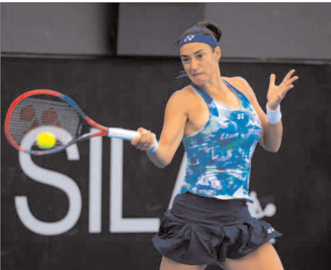
ADELAIDE: Caroline Garcia of France in action against Taylah Preston of Australia in the first round on Day 2 of the 2024 Adelaide International at Memorial Drive.