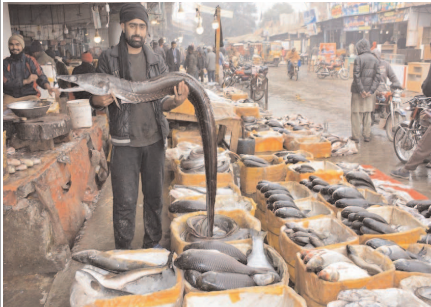
FAISALABAD: A vendor displaying fishes at his shop to attract customers.

Oil prices edged down to extend Monday's steep losses that came after