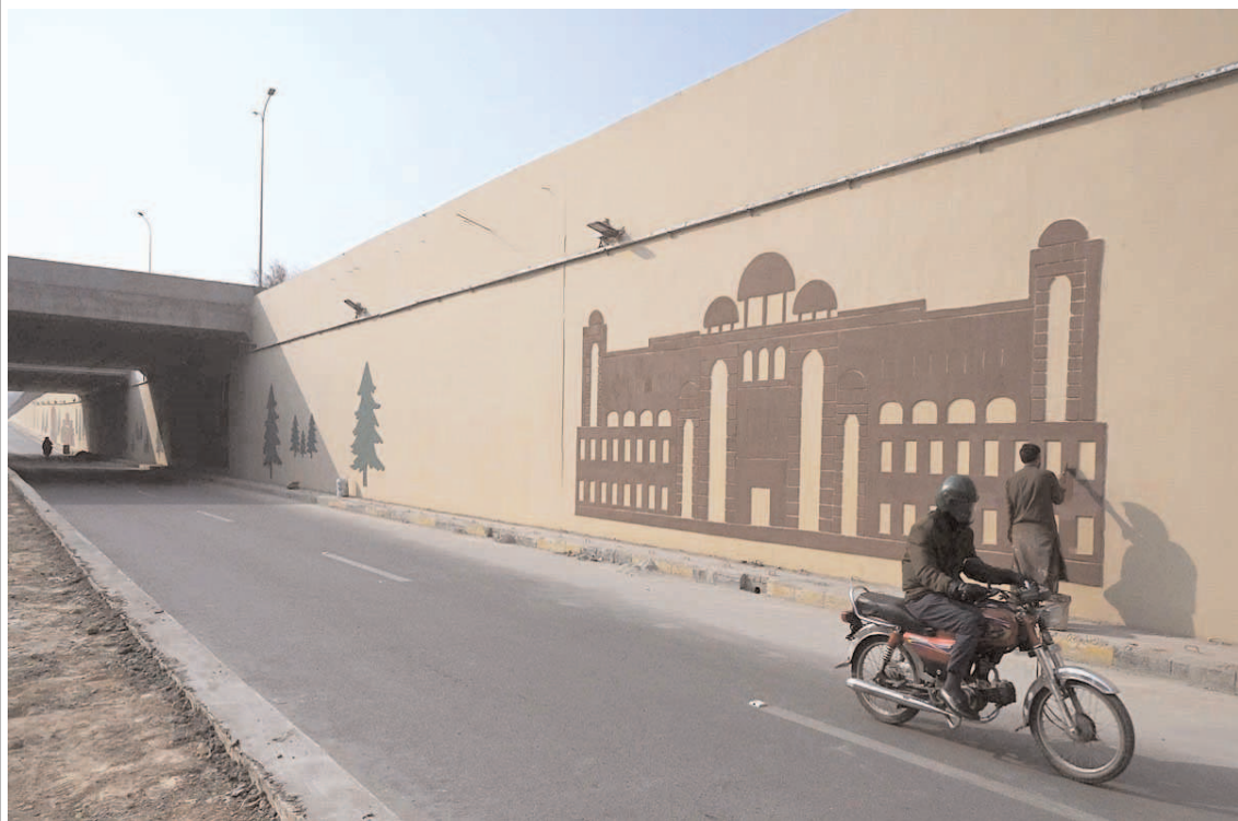
ISLAMABAD: Worker busy paint on wall of 7th Avenue Underpass in the Federal Capital.

The PHA was planting maximum saplings and enhancing greenery, particularly in parks and green belts of the city, he added. During the visit, the officers concerned of PHA were also present.