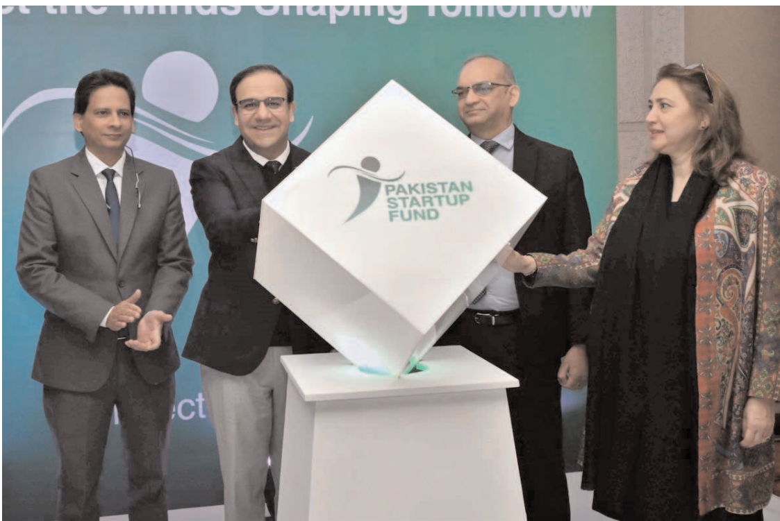
ISLAMABAD: Caretaker Federal Minister for IT & Telecommunication Dr. Umar Saif Launch Pakistan Startup Fund during ceremony organized by Ignite and Ministry of IT & Telecommunication.

ISLAMABAD (APP): The Director General (DG) of Federal Government Employees Housing Authority (FGEHA) on Tuesday visited the sector G-14 Markaz and reviewed the development work in the sector. Project Director briefed the Director General on the project and informed the management that the work of G-14 Center is in the final stages. The Director General Federal Government Employees Housing Authority advised that the work of horticulture and street lights should be completed as soon as possible and on this subject the Director General Housing Authority highlighted the importance of the project, said a press release issued here. Later, the Director General visited Sector F15 and urged for speedy completion of the work. Director General Federal Government Employees Housing Authority appreciated the work of Project Director, Director Land, Director Revenue, Director Planning, Director Security and Director Finance.