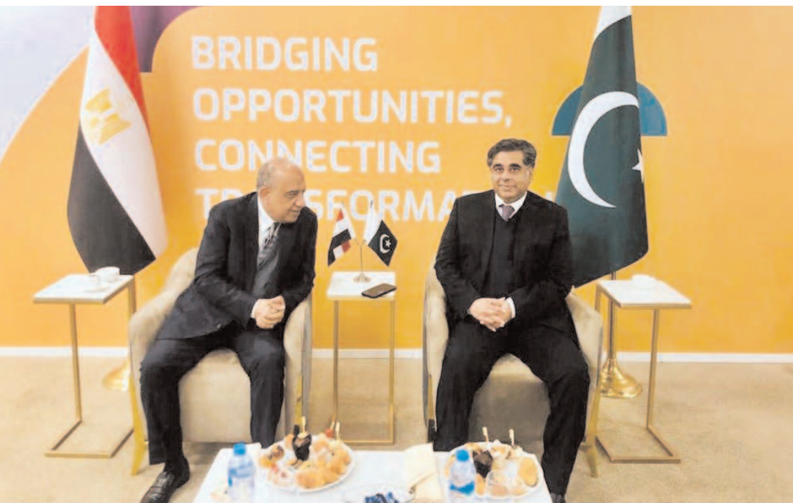
CAIRO: Federal Minister for Commerce Industries and Investments Dr. Gohar Ejaz meeting with Minister of Public Enterprises of Egypt Mahmoud Mostafa Kamal Esmat at 4th Pakistan Africa Trade Development conference and single country exhibition.

Mindshare operates as an agency under the umbrella of GroupM Pakistan, renowned for its digital and media services provided to businesses across Pakistan. GroupM Pakistan serves as a regional entity of GroupM Global, operational in regions including Asia, Australia, the Middle East, and Europe.