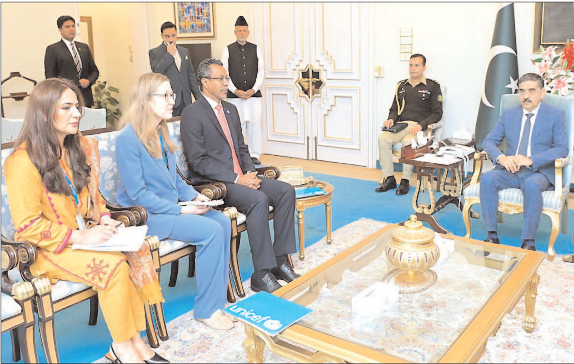
ISLAMABAD: UNICEF's Representative in Pakistan Abdullah Fadil called on Caretaker Prime Minister Anwaar-ul-Haq Kakar.

People's Party has also fielded former MNA Qadir Khan Mandokhel in NA-242 constituency. According to sources, two allied parties have also agreed that the PML-N candidates will contest on the National Assembly seats of Mirpur Khas, Nawabshah and Sukkur districts, while the MQM will field its candidates on provincial assembly seats in these districts.