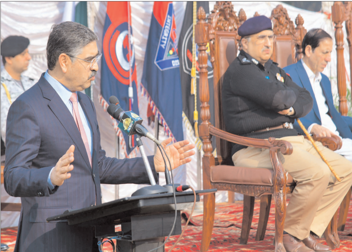
PESHAWAR: Caretaker Prime Minister Anwaar-ul-Haq Kakar addressing the KP Police Darbar ceremony.