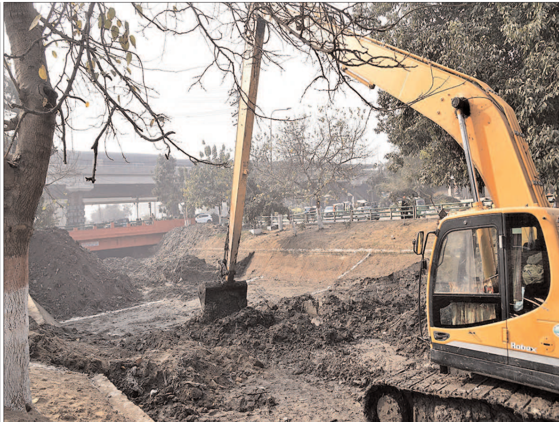
LAHORE: A view of cleaning work of canal going on during the annual silt cleaning (bhal safai) campaign.