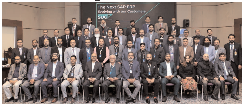
foster innovation and collaboration within the SAP community