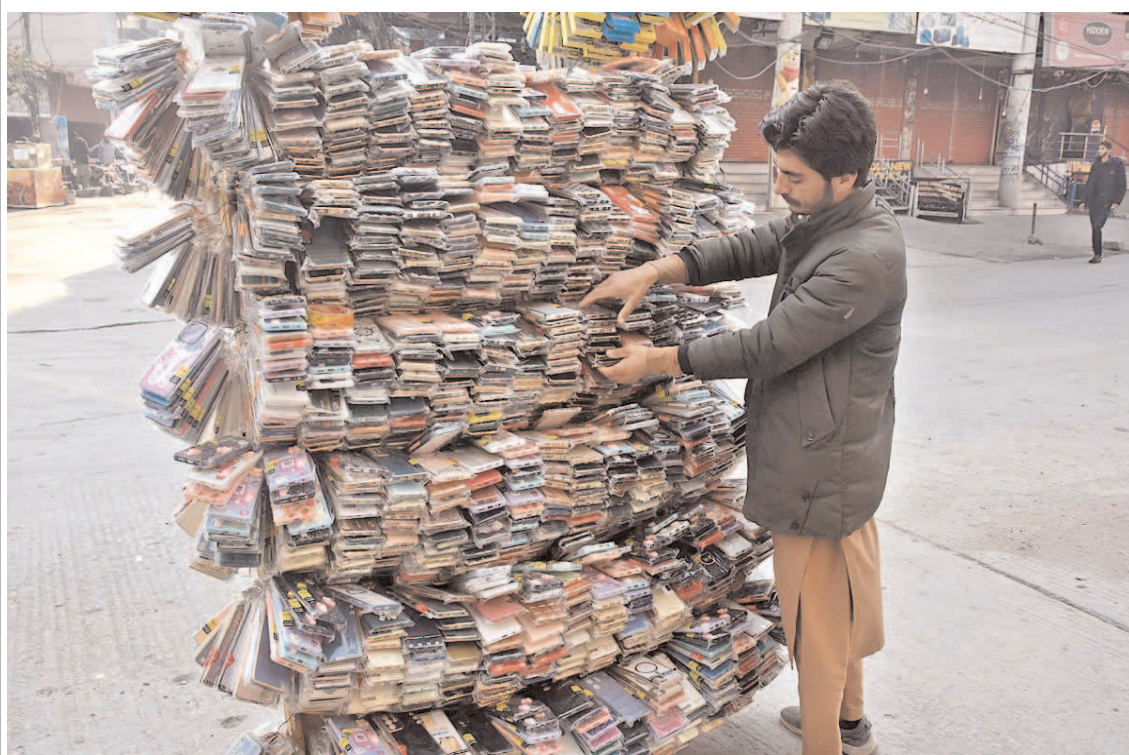
RAWALPINDI: A vendor selling mobile accessories at Commercial Market.