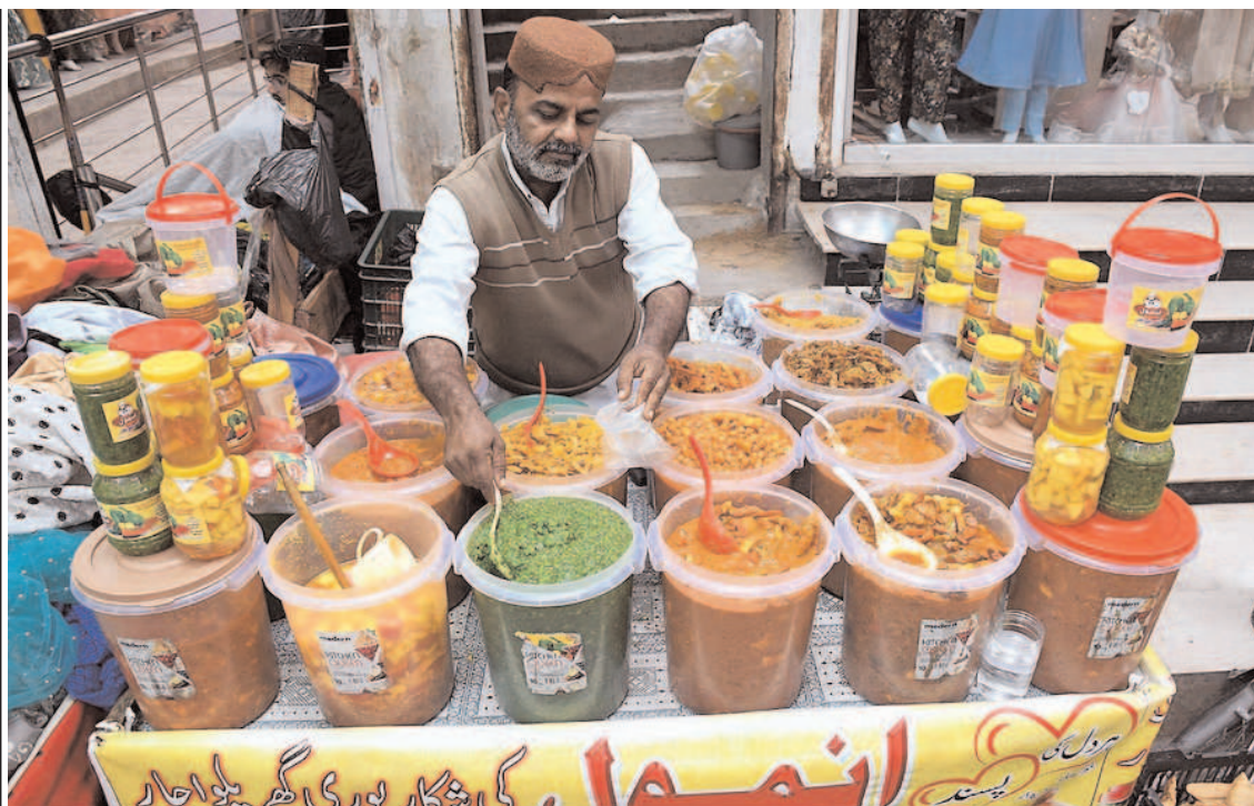
LARKANA: A vendor displaying various pickles to attract customers at Resham Gali.

The price of per tola and ten gram silver remained constant at Rs.2,650 and Rs.2,271.94 respectively.