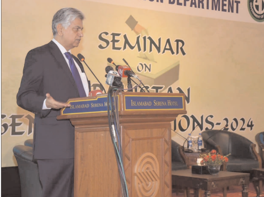
ISLAMABAD: Caretaker Federal Minister for Information and Broadcasting, Murtaza Solangi addressing during a seminar.

The IHC, in its order, set aside the special court's order and declared all the proceedings after December 14 "to be of no legal consequence". It may be noted that two PTI leaders accused of an offence related to the alleged misuse of diplomatic cable for political purposes have been indicted twice in the case and pleaded not guilty in both instances. The trial was started afresh on December 14 following the framing of charges against Khan and Qureshi for the second time on December 13.