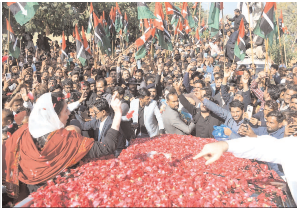
SANGHAR: Ms Aseefa Bhutto Zardari waving hands to public during public gathering.

New tourist's spots would be developed at Sola Tanar, Puchar and Jargo valleys besides walking tracks to promote eco-tourism and adventure sports in Swat. Camping pods would be established at new tourists' destinations besides Kalash culture events in Chitral would be held. The provincial government was spending huge amounts on development and construction of new roads to line tourism destinations with the Swat motorway. Tourism police was made operational at Malakand and Hazara divisions to facilitate tourists. He said Tourism police were deployed on key places of Swat to facilitate tourists and snowfall lovers during winter season. The officials advised tourists to bring warm clothes and sweaters while coming to Upper Swat these days in the wake of chilly weather.