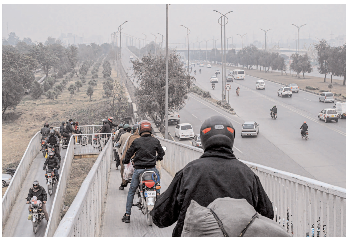
ISLAMABAD: A large number of Motorcyclists crossing the bridge at Srinagar Highway in the Federal Capital.

He demanded that those involved in the May 9 incidents should be brought to justice as without it, holding a free and fair election would be difficult.