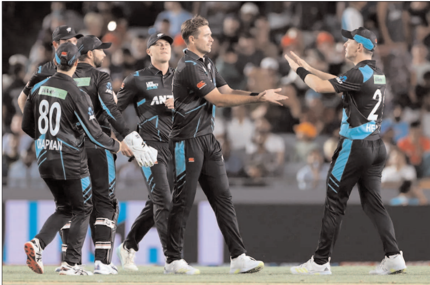
Tim Southee celebrates the wicket of Mohammad Rizwan.

There were starts for openers Saim Ayub (27) and Mohammad Rizwan (25) but Azam struggled to find support from his team-