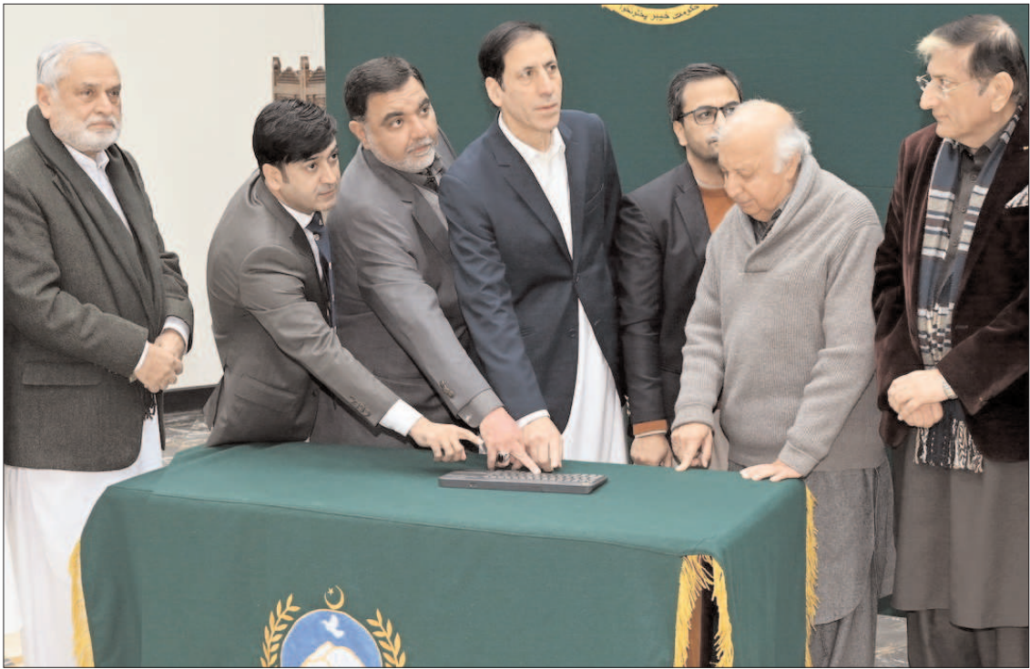
PESHAWAR: KP Caretaker Chief Minister Justice (R) Syed Arshad Hussain Shah launching 'Khushal Khyber Pakhtunkhwa Dashboard.'