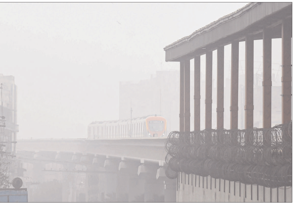
LAHORE: A view of thick fog during the morning fog in the provincial capital.