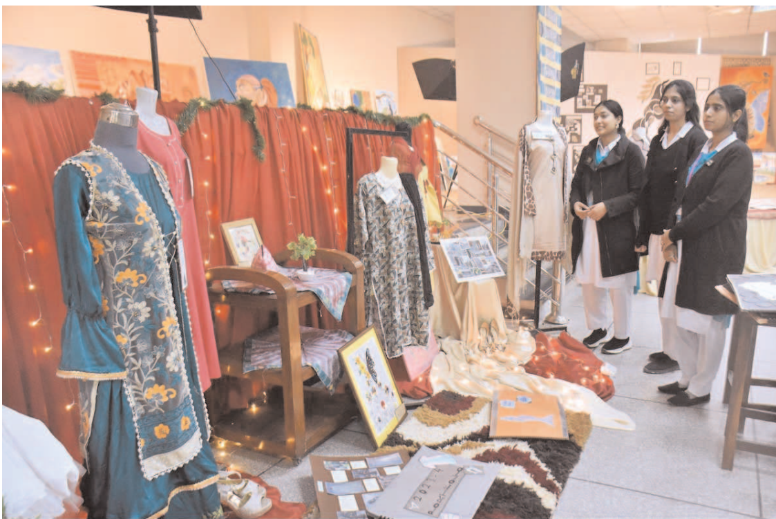
ISLAMABAD: Students visiting Annual Exhibition titled "Enchanted World of Art and Creativity" at FG College of Home Economics & Management Sciences F-II.