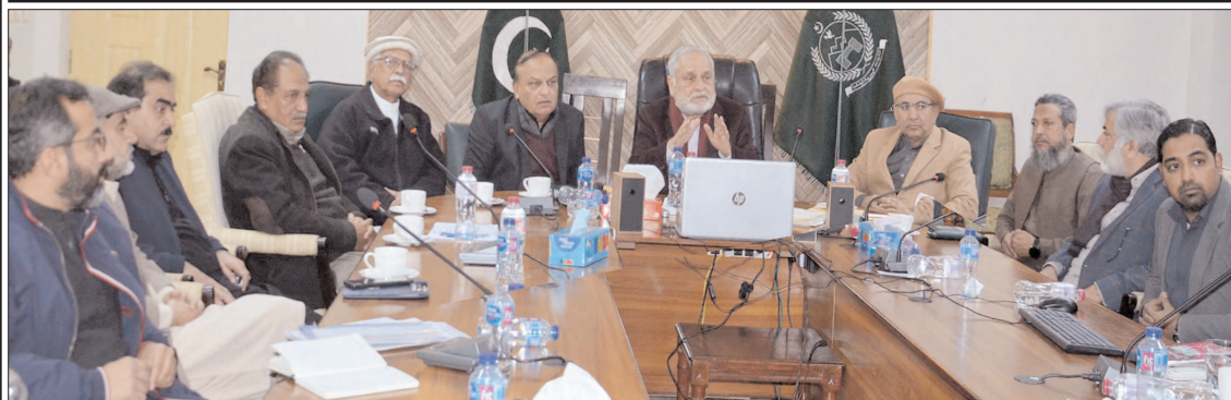
ABBOTTABAD: KP Caretaker Minister Amir Nadeem Durrani chairing a meeting.

of the drug and sealed the factory. The recovered heroin and chemical values millions of rupees in international market. The police confiscated recovered drug, chemical and after registering a case against three accused started efforts for their arrest.