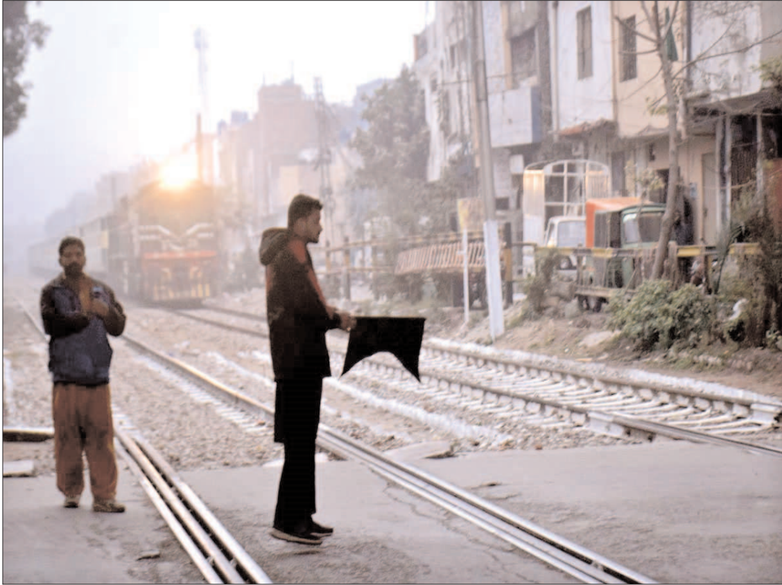
LAHORE: A view of train is running on the tracks Railway Station.

Assistant Director Mineral Development Kohat.