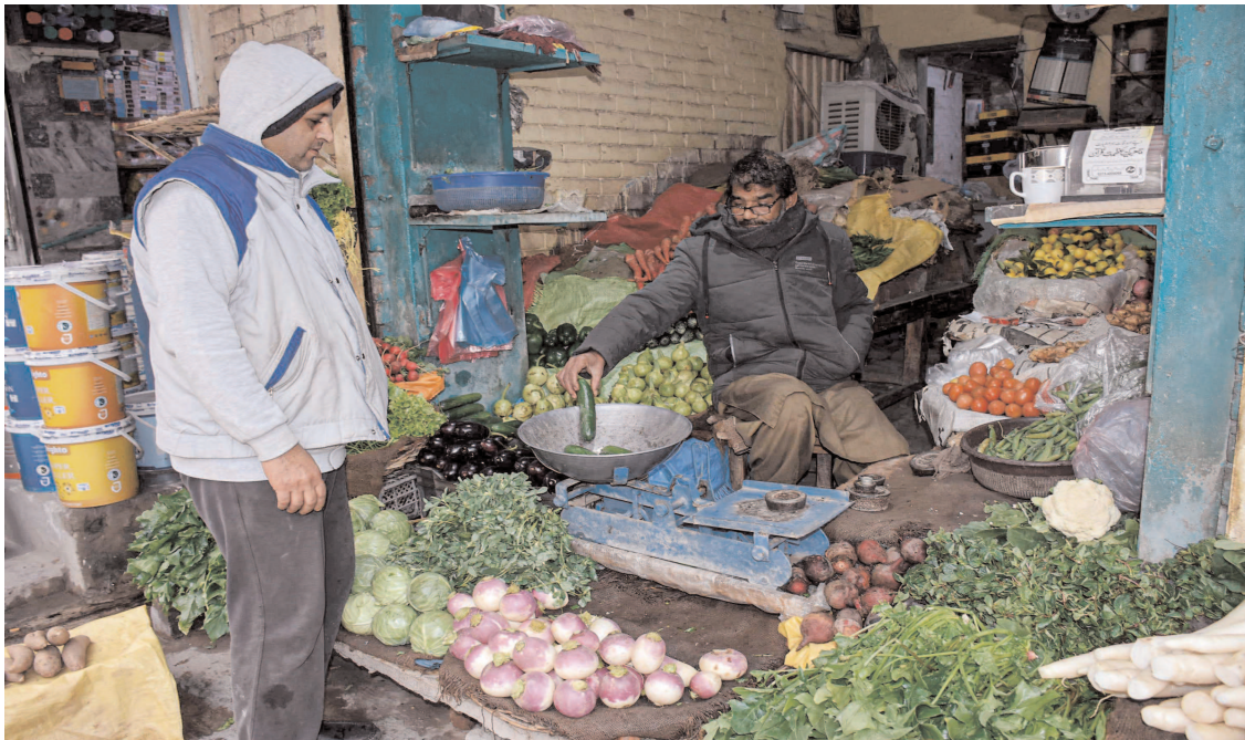
SIALKOT: A vendor is selling vegetables to the customer.

Meanwhile, the Khyber Pakhtunkhwa has also achieved wheat sowing over 100 per cent of its set targets and crop cultivation was completed over 1.93 million acres as compared to the set targets of 1.93 million acres during the current sowing season.