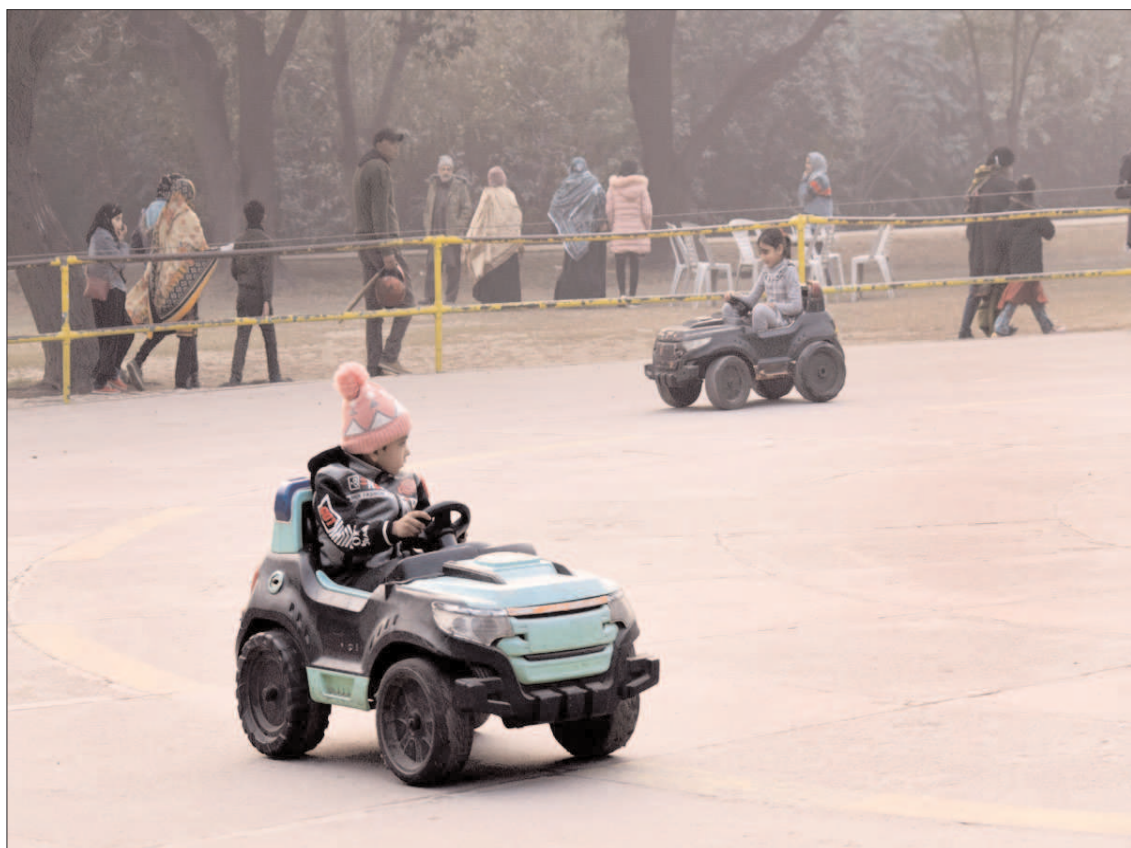
LAHORE: Children enjoying car riding at Gulshan-e-Iqbal Park.