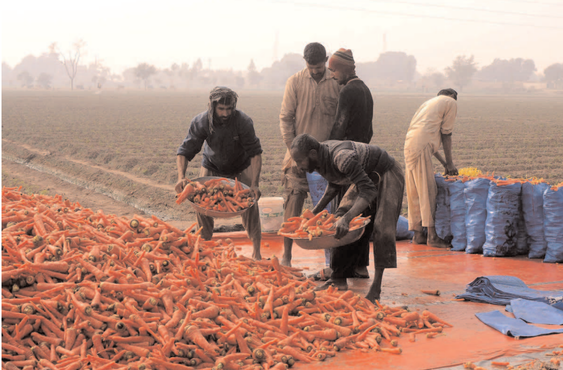
MULTAN: Farmers are busy packing carrots after collecting from the field to deliver the market.