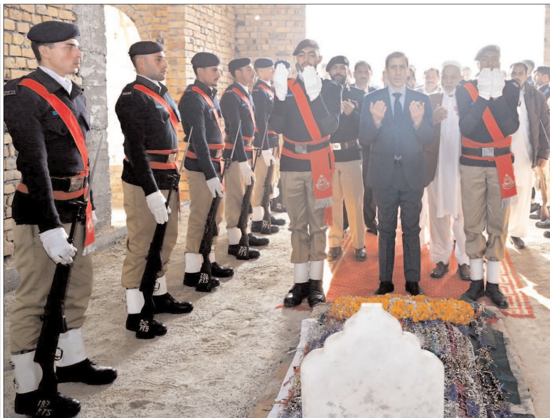
SWABI: KP Caretaker Chief Minister Justice (R) Syed Arshad Hussain Shah offering fateha at the mausoleum of Capt. Col. Sher Khan Shaheed.

The police also recovered two fuel units, six plastic tanks, and 98 plastic canes and bottles during the crackdown.