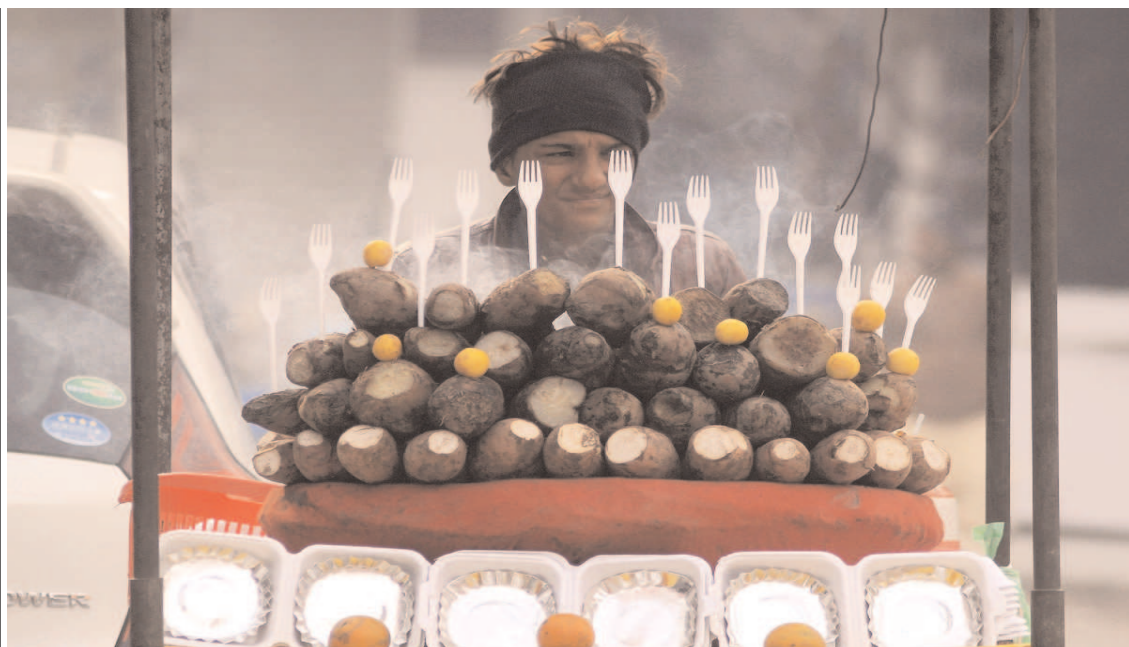
MULTAN: A young vendor selling charcoal-roasted sweet potatoes to attract customers at his roadside setup.

He also stressed the need for the practical training of students so that they could perform well during their practical life.