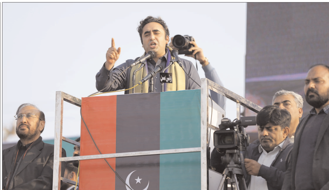
BAHAWALPUR: Chairman PPP Bilawal Bhutto Zardari addressing during public gathering.

Hamas's October 7 attack has killed at least 23,843 people, mostly women and children, according to the latest ministry toll. The war, in which Israel has vowed to destroy Hamas, began when the militants launched their unprecedented attack that resulted in about 1,140 deaths in Israel, mostly civilians, according to an AFP tally based on official figures. At Rafah's Al-Najjar hospital, mourners gathered and prayed around the bodies of slain relatives. One man stroked the body of a child, wrapped up like a white parcel. He kissed it, then placed it gently among others. Another man, Bassem Araf, held up a photo of another child. "She died hungry with bread in her hand."