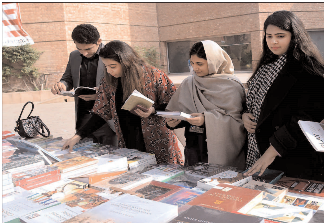
LAHORE: People selecting books from a Book Fair at Al-Hamra.

The decision aligns with the commitment to promote Sindh as a premier tourist destination, ensuring that visitors receive expert guidance, contributing to the overall growth and positive perception of tourism in the province.