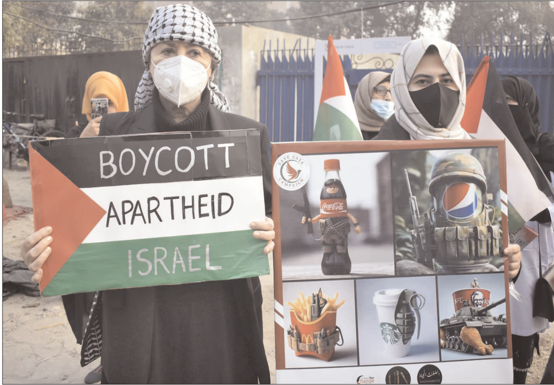
LAHORE: Activists of civil society holding a protest in support of oppressed Muslims of Gaza.