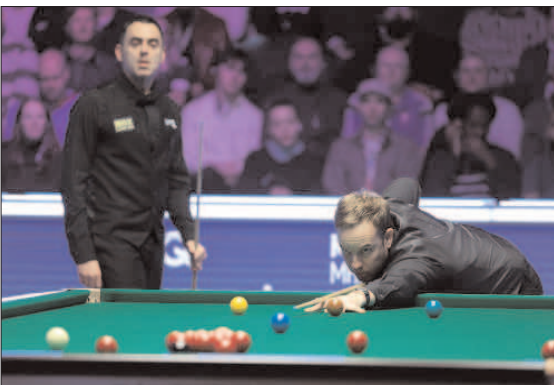
LONDON: Ronnie O'Sullivan of England watches Ali Carter of England play a shot lines up a shot during day eight of the MrQ Masters Snooker 2024.

Ben Sears' bowling. Pakistan captain Shaheen Shah Afridi added a quick-fire 22 from 13, including one four and two maximums, attempting to keep Pakistan in the game, until he fell to Milne. A four-wicket haul by Milne, complemented by two wickets each by Sears, Southee and Ish Sodhi helped dismiss Pakistan for 173, to award New Zealand their second consecutive victory. Allen was adjudged player of the match for his impressive performance. Pakistan and New Zealand play the third T20I on 17 January at University Oval, Dunedin. The first ball is expected to be bowled at 0500 PKT while the toss will take place at 0430 PKT. Scores in brief: New Zealand win against Pakistan by 21 runs New Zealand 194-8, 20 overs (Finn Allen 74, Kane Williamson 26 (retired hurt), Mitchell Santner 25; Haris Rauf 3-38, Abbas Afridi 2-43, Aamir Jamal 1-42, Usama Mir 1-39) Pakistan 173 all out, 19.3 overs (Babar Azam 66, Fakhar Zaman 50, Shaheen Shah Afridi 22; Adam Milne 4-33, Ben Sears 2-28, Tim Southee 2-31, Ish Sodhi 2-33) Player of the match – Fin Allen (New Zealand).