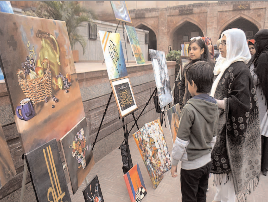
LAHORE: Visitors viewing paintings during Painting and Calligraphy Exhibition in collaboration with Formanite School System and Walled City Authority.

KARACHI (APP): The Pakistan Meteorological Department on Sunday predicted cold and dry weather for most parts of the Sindh province during the next 24 hours.