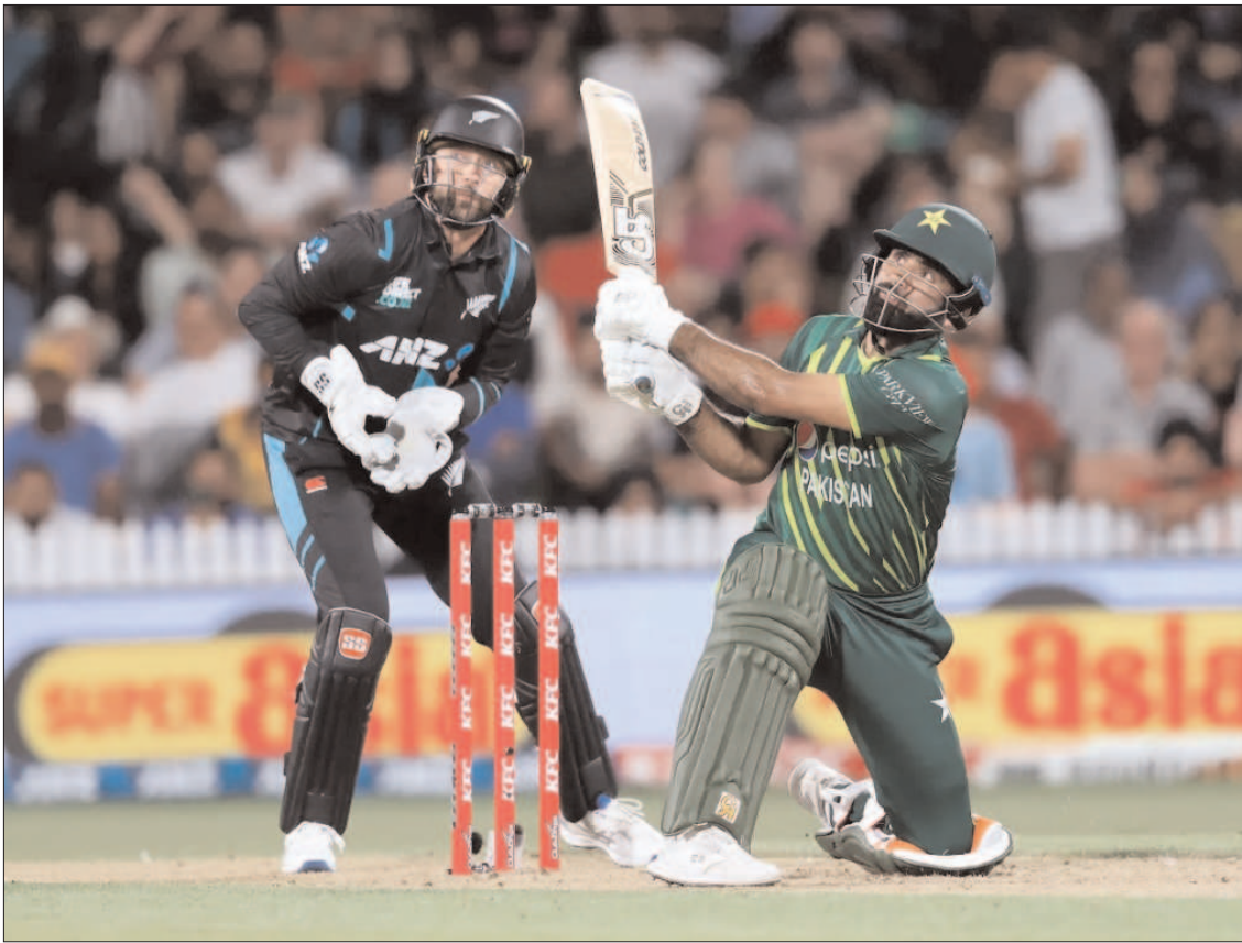
HAMILTON: Fakhar Zaman showed scant respect to spin.

Rohit achieves historic feat INDORE (Agencies): Indian captain Rohit Sharma became the first player in the history of T20I cricket to feature in 150 matches during the second T20I against Afghanistan here on Sunday. Rohit Sharma holds the record for the most capped T20I player across the globe, followed by Ireland's Paul Stirling with 134 matches. Meanwhile, Virat Kohli is the second-most capped Indian player with 116 matches after Rohit Sharma. Notably, Sharma and Kohli made their return to the T20I format during the ongoing series after a hiatus of more than a year.