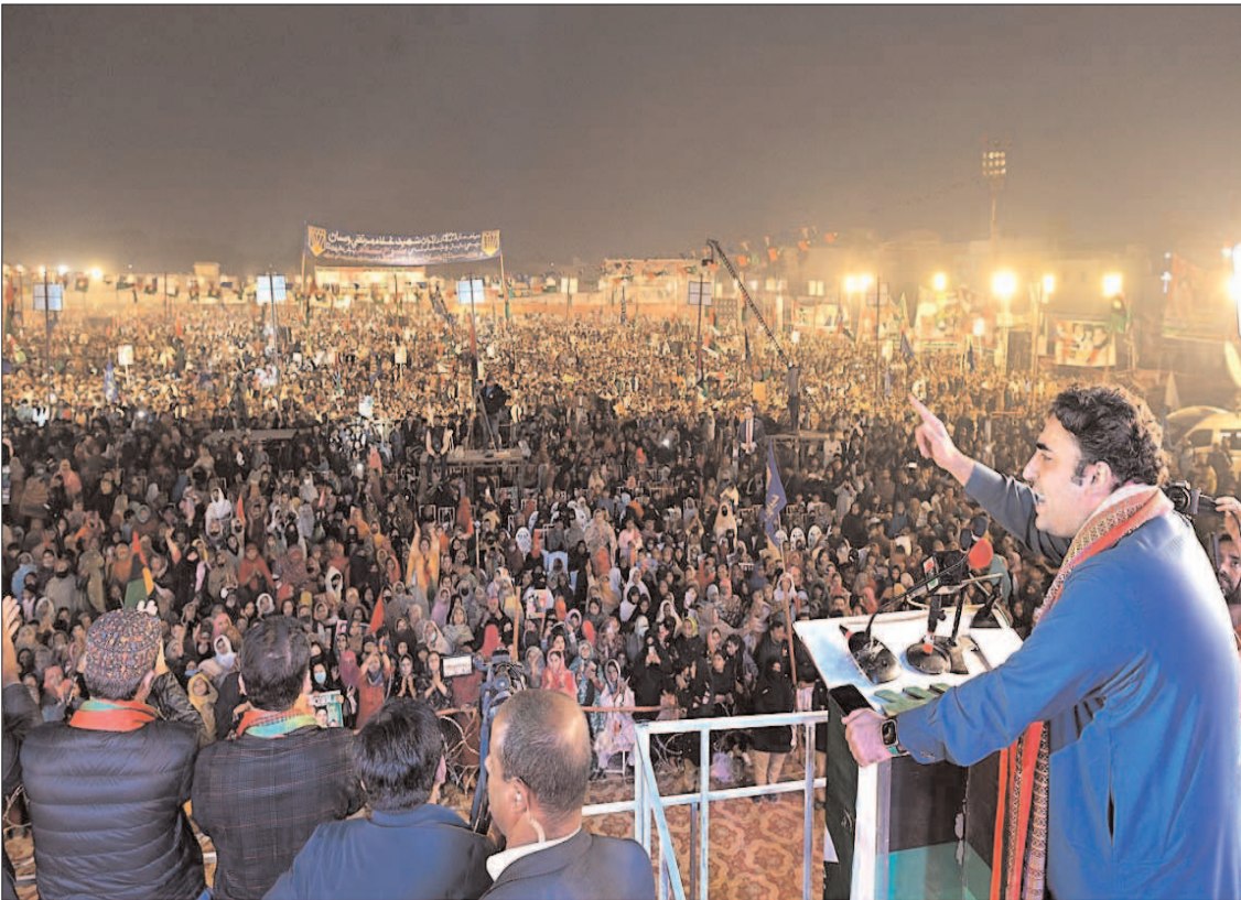
KHAIRPUR: Chairman Pakistan People's Party Bilawal Bhutto Zardari addressing to public gathering during Election Campaign.

"We will make all possible efforts to assist and empower our talented youth", he remarked and added that all the relevant institutions especially public sector universities have to be proactive; their role would be instrumental in this overall process. He urged upon Vice Chancellors to introduce more and more market-based courses for the ongoing admissions in universities. He further directed the authorities concerned for necessary steps to effectively utilize the scholarships already available within the various public sector universities as well as to attract new scholarships in different fields for facilitating the deserving talented youth of the province.