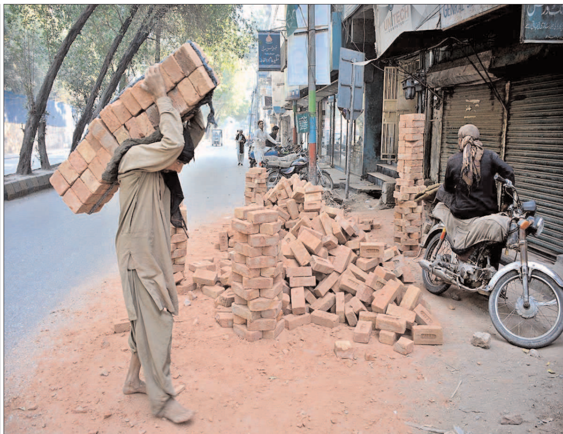
HYDERABAD: Labourer busy in shifting bricks during construction work of a house.