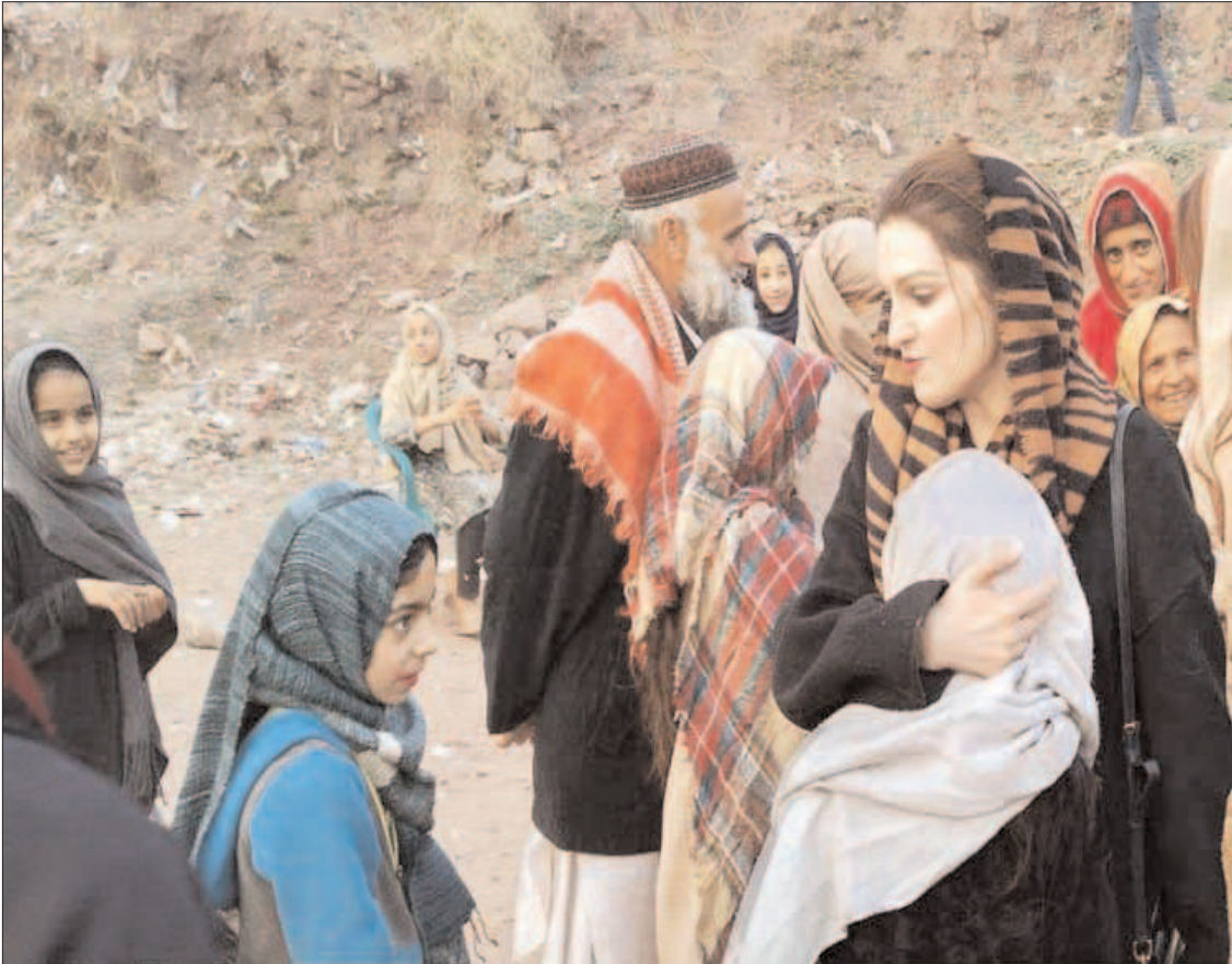
MUZAFFARABAD: Special Assistant to Prime Minister for Human Rights and Women Empowerment Mushaal Hussein Mullick interacting with the refugees of Kashmiri Refugees Camp.

Namibia rejected Germany's support to Israel's attacks in Gaza, the presidency of Namibia said in a statement on X. President of Namibia, Hage Geingob, expressed "deep concern with the shocking decision communicated by the Government of the Federal Republic of Germany yesterday, 12 January 2024, in which it rejected the morally upright indictment brought forward by South Africa before the International Court of Justice (ICJ) that Israel is committing genocide against Palestinians in Gaza."