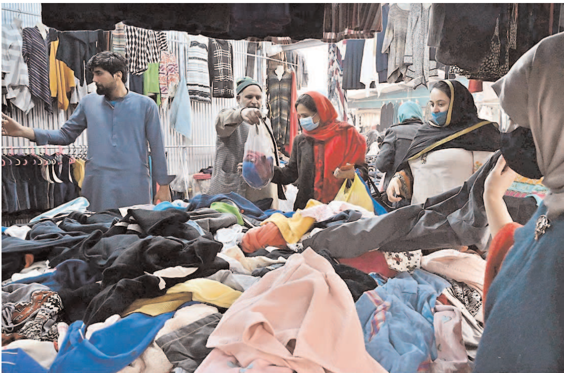
ISLAMABAD: Customers selecting and purchasing old clothes displayed by the Weekly Bazaar vendors to attract the customers.