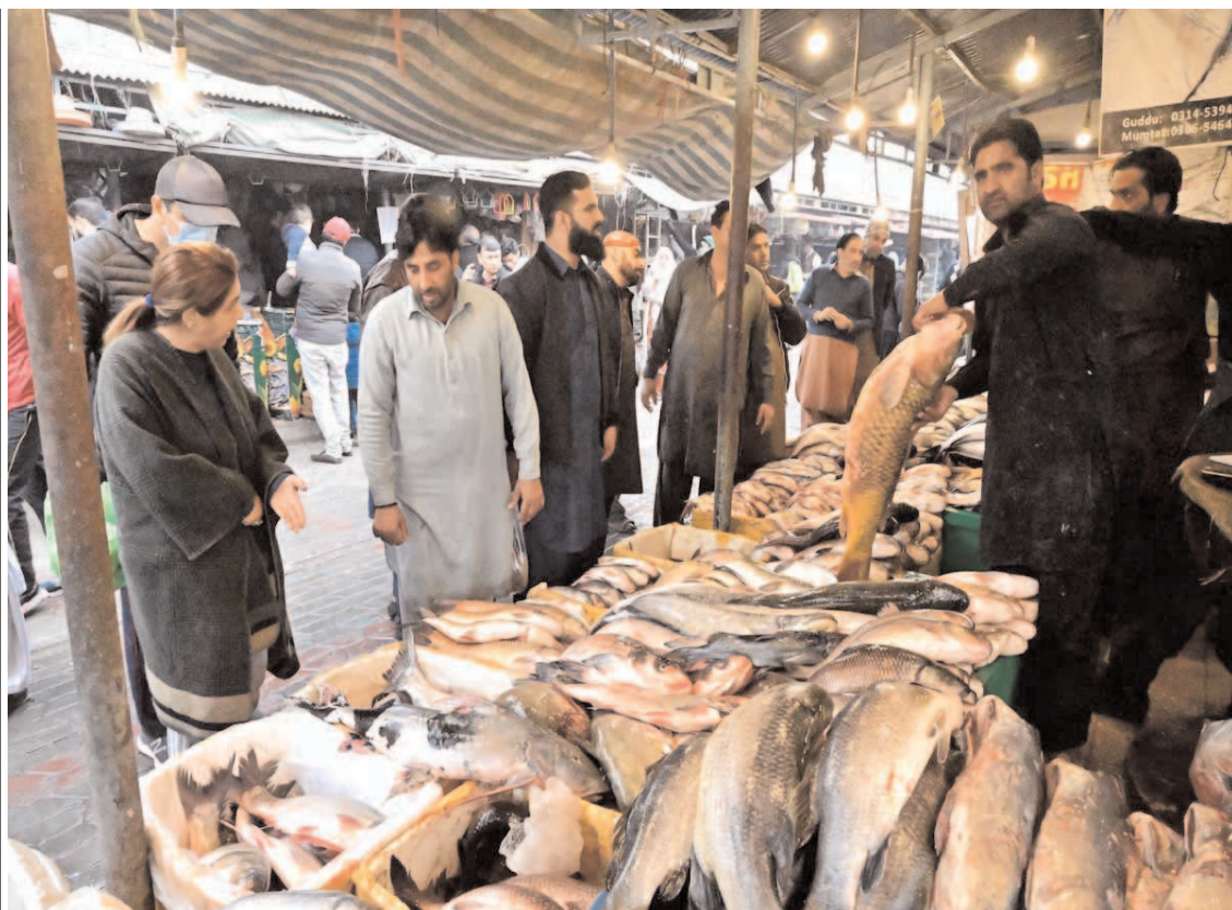
ISLAMABAD: Vendor displaying fish to attract the customers at weekly Bazaar in the Federal Capital.

He said that Pakistan's industry had been harmed by the high cost of doing business, which discouraged investment in capacity and capability and called for easing the burden of heavy taxes on the power sector. The BMP chief stated that the constant increase in power tariffs on the pretext of fuel adjustment had increased electricity prices and added to the already high cost of trade and industry.