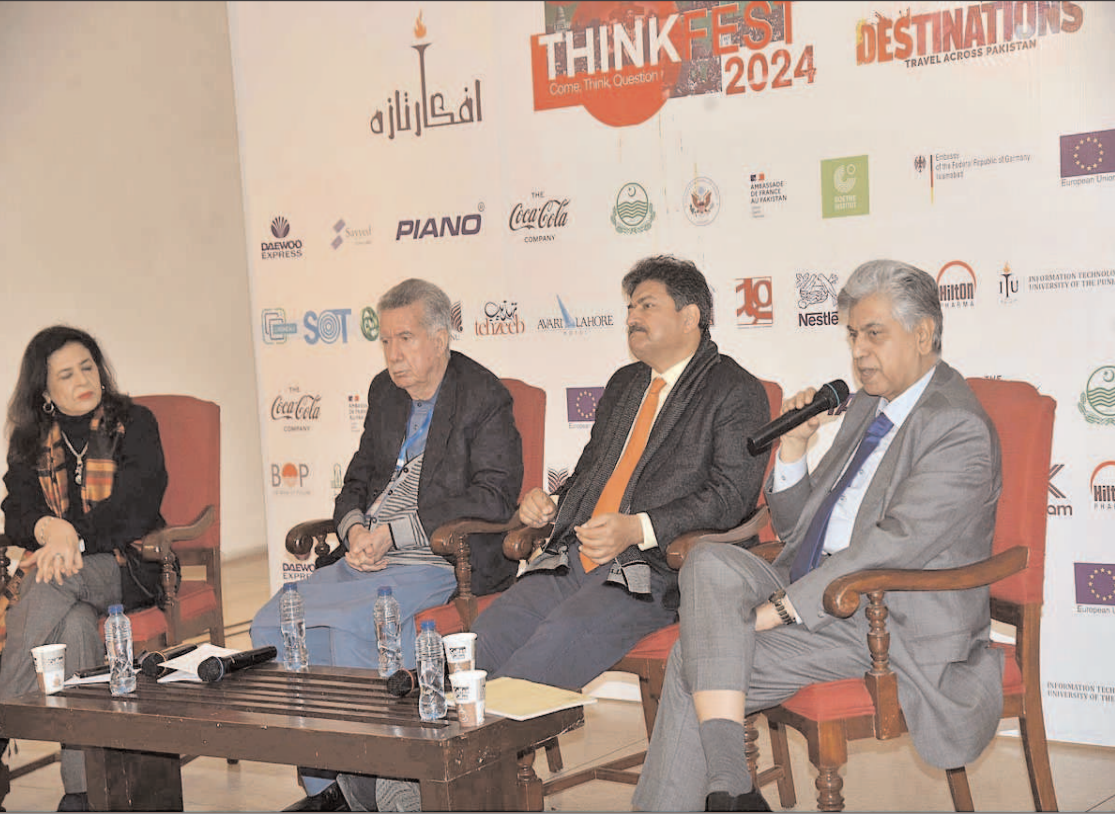
LAHORE: Caretaker Federal Minister for Information and Broadcasting, Murtaza Solangi addressing a Seminar (Muzakara) organized by Think Fest at Al Hamra Hall.

Earlier the caretaker federal minister, chief minister Punjab and information minister Punjab distributed among the journalists.