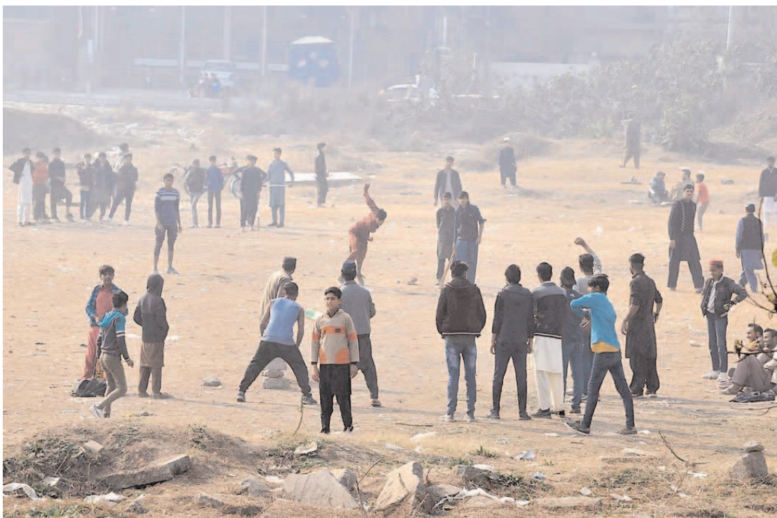
ISLAMABAD: Youngsters playing cricket at local ground in the Federal Capital.

At present, Allama Iqbal Library has 20,000 books while 50,000 books would be arranged for the library, he said adding, a separate space would be allotted in the library for the students. Establishment of business facilitation center at Rawalpindi Development Authority would help promote economic activities in the region, the spokesman said.