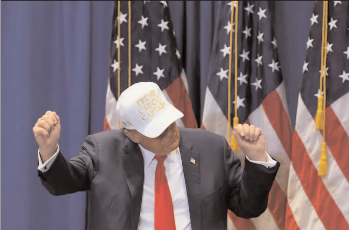
IOWA: Former U.S. President and Republican presidential candidate Donald Trump dances as he campaigns in Indianola, Iowa.