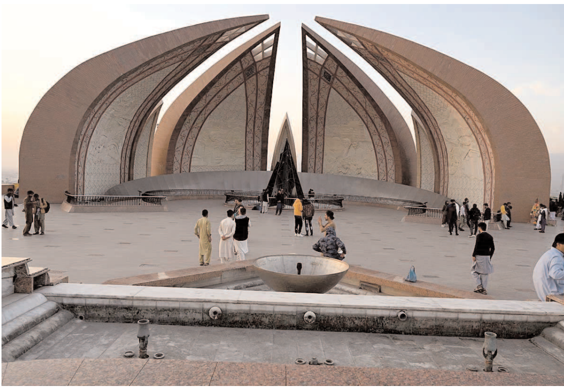
ISLAMABAD: An attractive view of the Pakistan Monument in the Federal Capital.