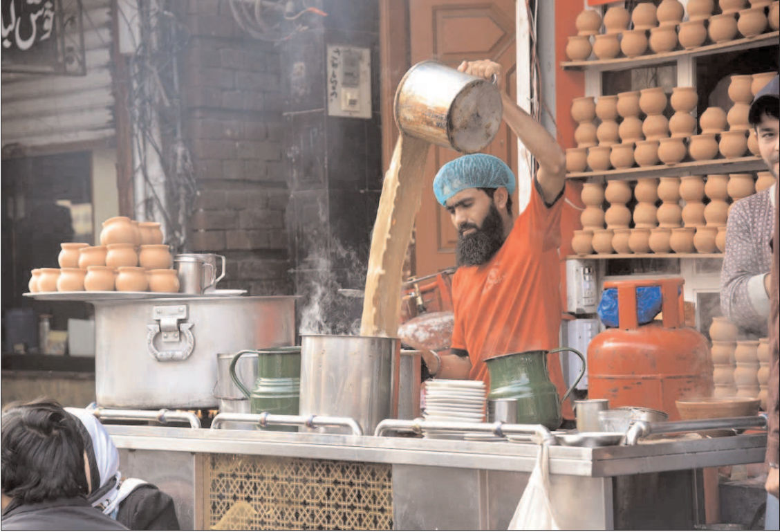
LAHORE: A vendor is busy making tea for customers in the city.

He further said that what Shahid Khaqan Abbasi said about Nawaz Sharif's tenure was not correct. "Abbasi was not criticizing the PML-N but himself," he maintained.