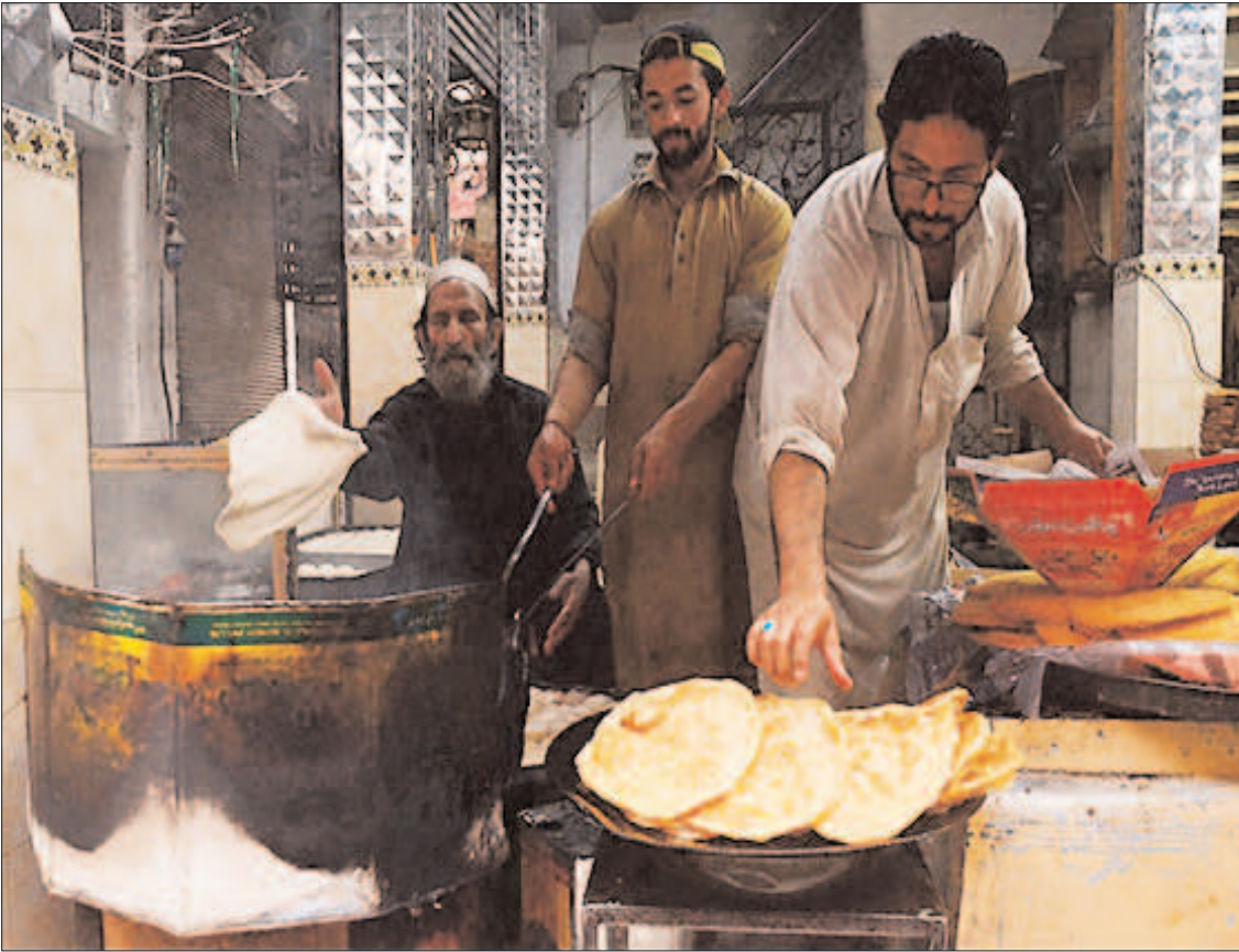
PESHAWAR: A vendor is busy preparing traditional food item for his cutomers at his workplace.

Originally slated to run from December 23 to 31, the winter vacations have now been prolonged to mitigate the impact of the harsh weather on students. As the academic institutions prepare to resume normal activities, the community remains vigilant, adapting to the persistent winter challenges.