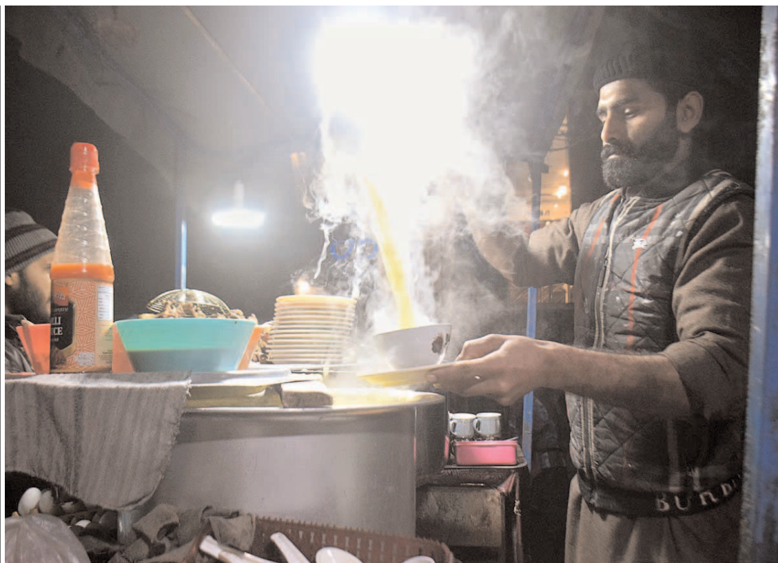
LAHORE: A vendor displaying chicken soup to attract the customers at his roadside setup during winter season in the Provincial Capital.