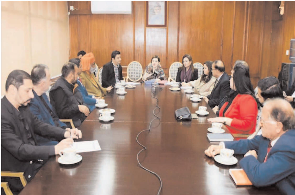
ISLAMABAD: Special Assistant to Prime Minister for Human Rights and Women Empowerment, Mushaal Hussein Mullick addressing the second consultative meeting of Kashmir Advisory Committee.

ISLAMABAD (APP): The Press Information Department (PID) is committed to foster electoral understanding among the masses through awareness campaigns ahead of the general elections in 2024. The PID, in this regard, has already launched a series of seminars to ensure active civic engagement and participation in the electoral process and elections slated for February 8. According to the PID, the stakeholders being invited to the seminars included representatives from mainstream political parties, the Election Commission of Pakistan, media, academia, civil society and the general public. It said these seminars would serve as a platform to educate citizens on the importance of voting, the electoral system, and the role of elected representatives. "By fostering public awareness, the seminars seek to empower individuals to make informed decisions, ultimately contributing to a more robust and accountable democratic system," the PID added. On January 11, the PID organized its first seminar titled 'Pakistan elections 2024: The Economic Reforms Political Parties' here at a local hotel in Islamabad which had across-the-board representation from the stakeholders.