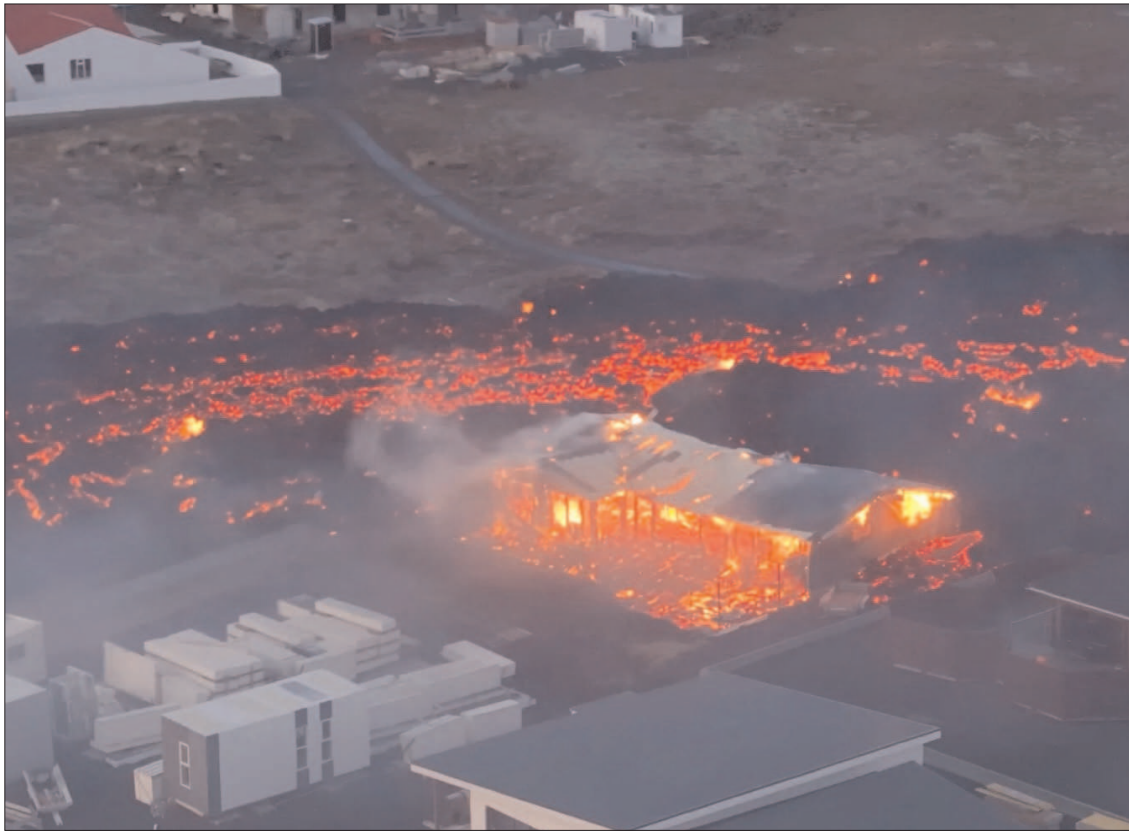
GRINDAVIK: A volcano has erupted in southwestern Iceland, sending semi-molten rock spewing toward a nearby settlement for the second time in less than a month.

Overall political situation of the country and Balochistan, upcoming general election and other issues of bilateral interests came under discussion during the meeting. Important decisions with regard to the strategies for national and provincial assemblies constituencies were made during the meeting. Emphasising the need for better coordination between National Party and PNawaz Sharif, Malik Baloch presented his point of view regarding ensuring transparency in the upcoming general elections before Sharif.