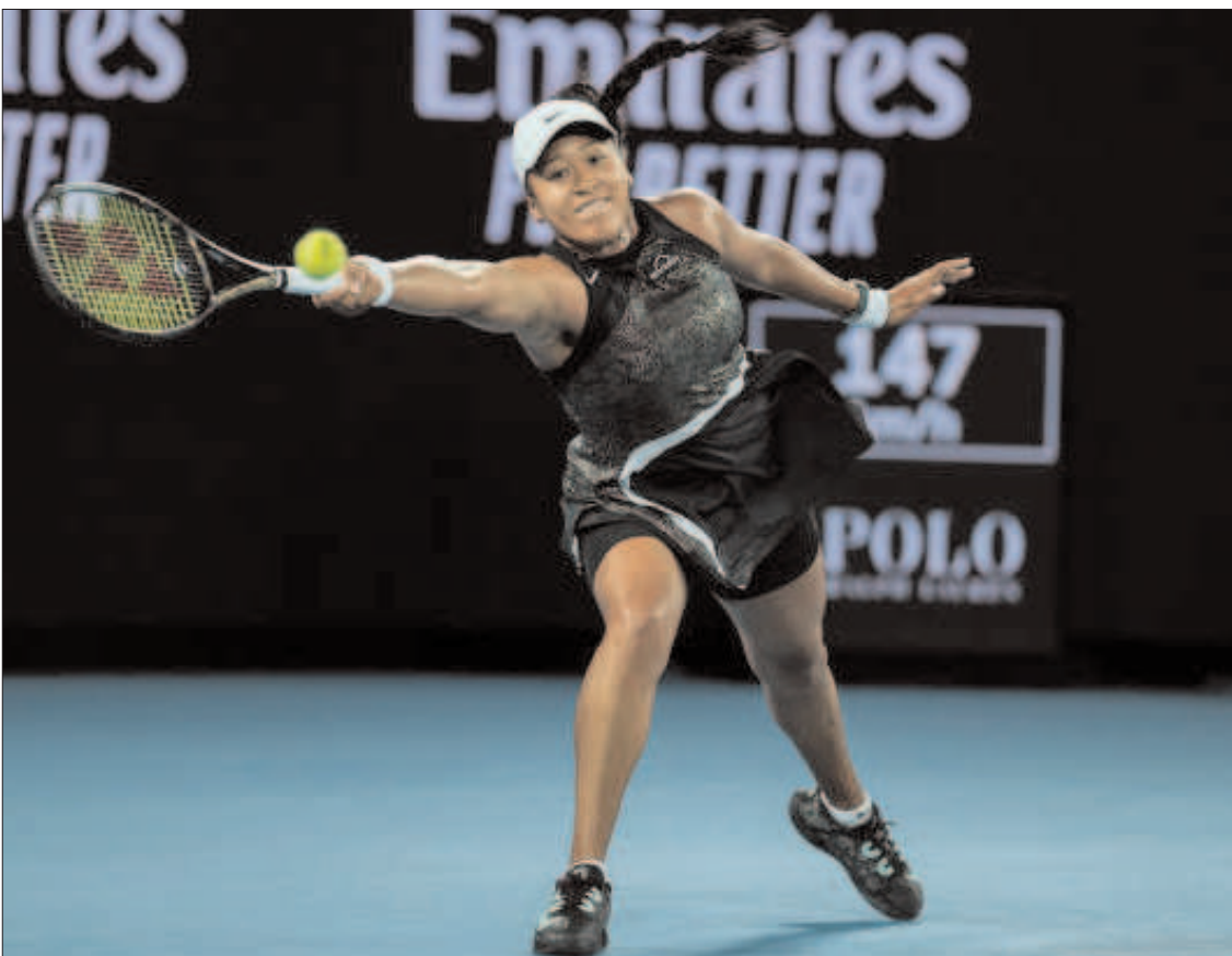
MELBOURNE: Naomi Osaka of Japan plays a forehand in the Women's Singles First Round match against Caroline Garcia of France during day two of the 2024 Australian Open.