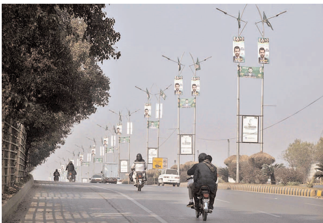
RAWALPINDI: A view of banners displayed on poles at Airport Road in connection with upcoming general elections.

In addition to the heightened fines, the Islamabad Capital Police plan to broadcast special radio programs on FM Radio 92.4 to educate the public about traffic regulations. Citizens are earnestly urged to respect traffic laws and actively contribute to transforming Islamabad into a safer and more civilized city.