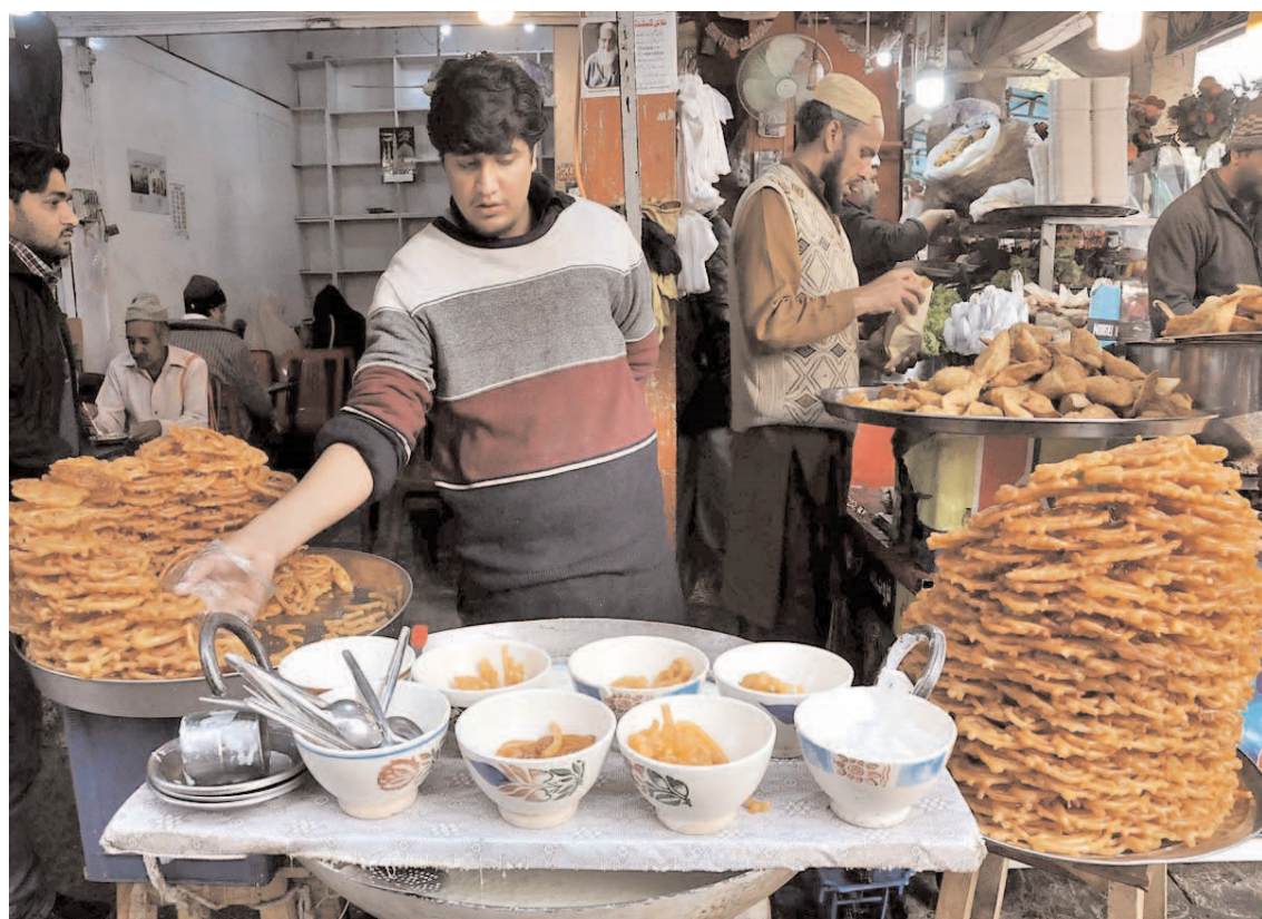
ISLAMABAD: A shopkeeper selling "doodh jalebi" in a local market of Federal Capital.

However, according to the Forex Association of Pakistan (FAP), the buying and selling rates of the Dollar in the open market stood at Rs280 and Rs282 respectively. The price of the Euro decreased by 76 paise to close at Rs307.08 against the last day's closing of Rs307.84, according to the State Bank of Pakistan (SBP). The Japanese Yen remained lost 01 paise and closed at Rs1.92, whereas a decrease of 98 paise was witnessed in the exchange rate of the British Pound, which traded at Rs357.20 compared to the last closing of Rs358.18. The exchange rates of the Emirates Dirham and the Saudi Riyal decreased by 03 paise each to close at Rs76.30 and Rs74.72 respectively.