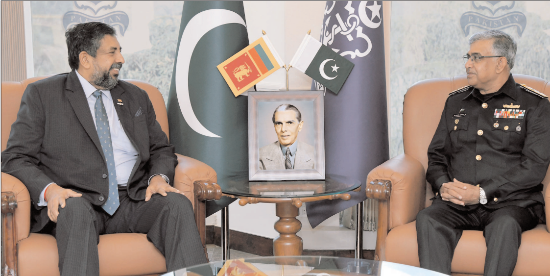
ISLAMABAD: Chief of Naval Staff Admiral Naveed Ashjaf exchanging views with High Commissioner of Sri Lanka to Pakistan, Admiral (R) Ravindra C Wijegunaratne at Naval Headquarters.

The countrywide protest broke out on May 9 after the former prime minister was taken into custody on the premises of the Islamabad High Court in the Al-Qadir Trust 'corruption' case. Corps Commanders House in Lahore and other military installations were also attacked by the violent protesters.