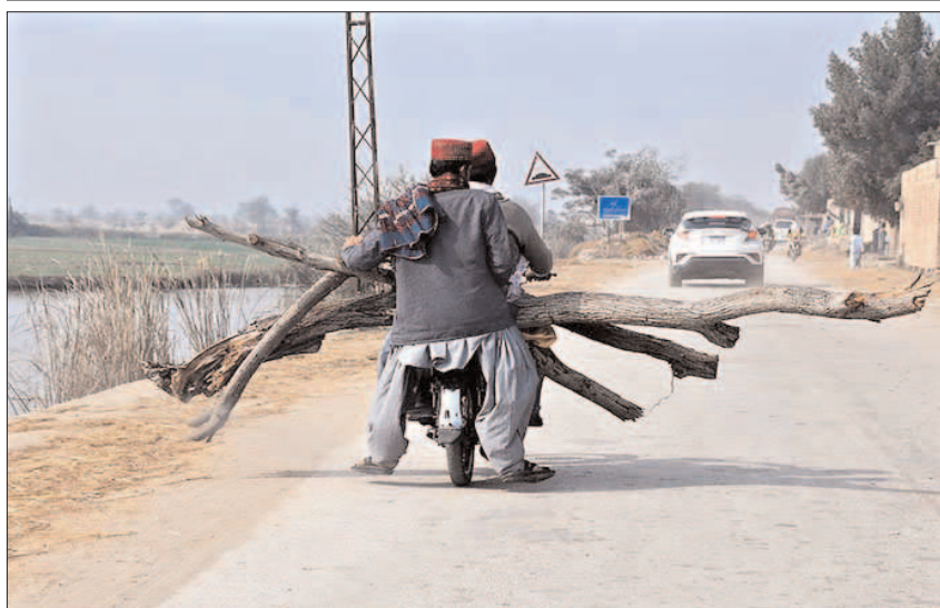
LARKANA: Motorcyclists on the way carrying long tree logs at Miro Khan Road.

DPO Mardan and DSP of Swabi told the meeting that poll-proof arrangements have been made for the protection of voters and staff at the normal, sensitive and most sensitive polling stations in both the districts and the higher authorities have also been contacted for more personnel. The final security plan will be issued after their delivery. The meeting expressed satisfaction over the preparations made so far. Commissioner said that peaceful conduct of elections is a national responsibility and everyone will work together for this purpose.