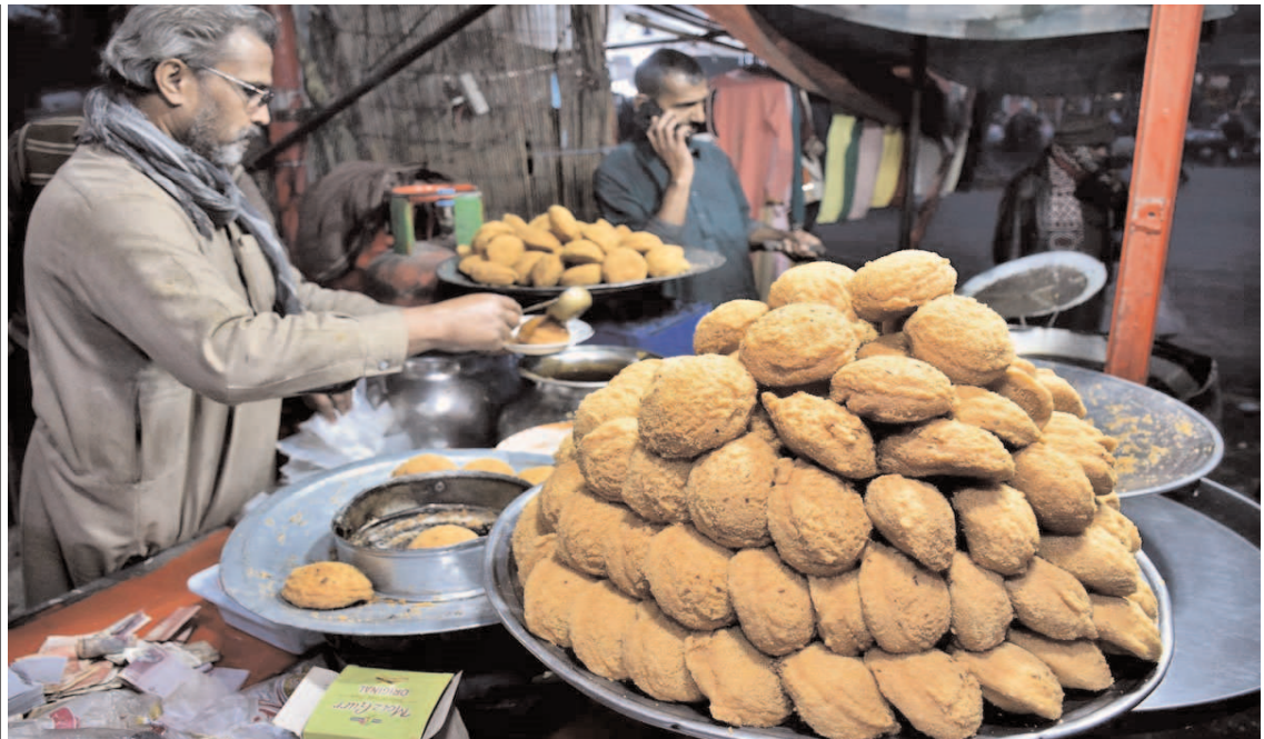
LAHORE: A vendor is busy in making and selling the traditional food item "Laddu Peethi" to the customers on his roadside setup at local market.