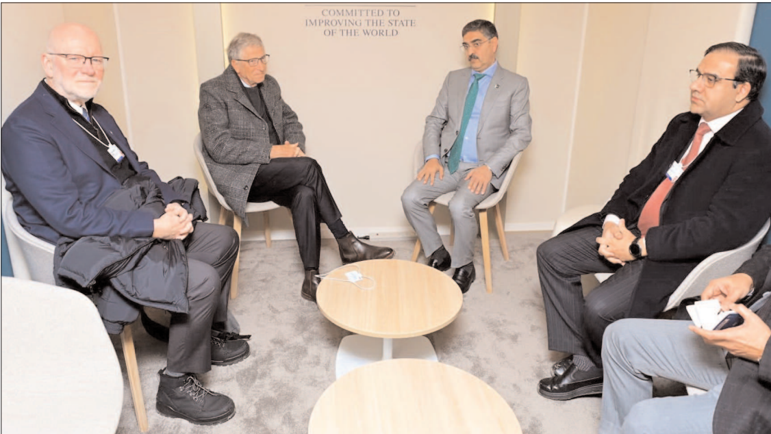
DAVOS: Co-chair of Bill and Melinda Gates Foundation, Bill Gates called on Caretaker Prime Minister Anwaar-ul-Haq Kakar on the sidelines of World Economic Forum.

LAHORE: Former President of Pakistan and President Pakistan Peoples Party Parliamentarians, Asif Ali Zardari inaugurated the election office of Chairman Bilawal Bhutto Zardari in constituency NA-127 Lahore. President Zardari addressing the workers of the party recalled the time when he was incarcerated in Lahore and the women and men workers used to call him at the time of the hearing of the cases against him. He also recalled that he had sowed a mango tree besides the Quaid-e-Awam Shaheed Zulfikar Ali Bhutto in jail. The two trees are now bearing fruit.