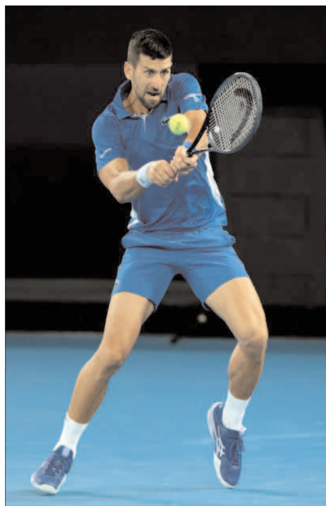
MELBOURNE: Djokovic plays a backhand in their round two singles match against Alexei Popyrin.

Three uncharacteristic unforced errors from Djokovic's racquet gave Popyrin three set points but he was unable to capi-