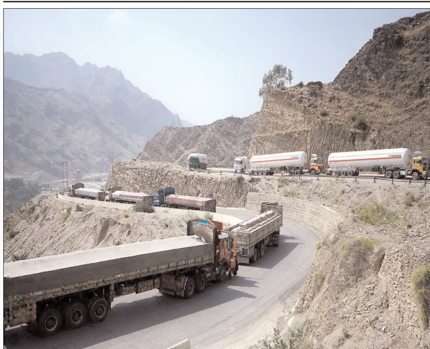
LANDI KOTAL: A view of closed Torkham border.

He said that the traffic issue in the city is getting worse with each passing day and needs to be addressed once and for all. "We need to have a comprehensive plan keeping in view the future requirements of the city as well as requisites of urban mobility," the chief minister remarked and added that all the stakeholders should have to play their proactive role in this regard.