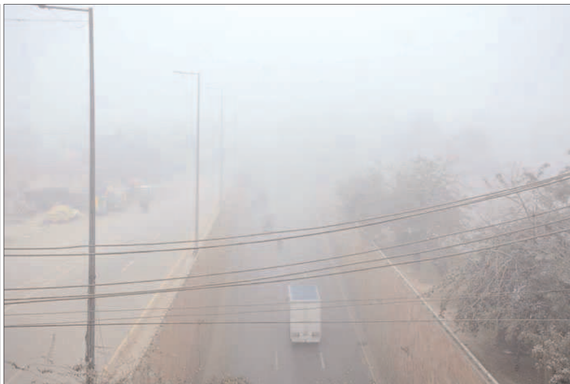
FAISALABAD: A view of thick fog that engulfs the whole city during early morning.

According to PCG spokesperson, the coast guards on intelligence tip-off conducted operation in mountainous Golanch of Pasni, district Gwadar. During operation, 1700 kilogram hashish valuing Rs 8.217 billion in international market was recovered.