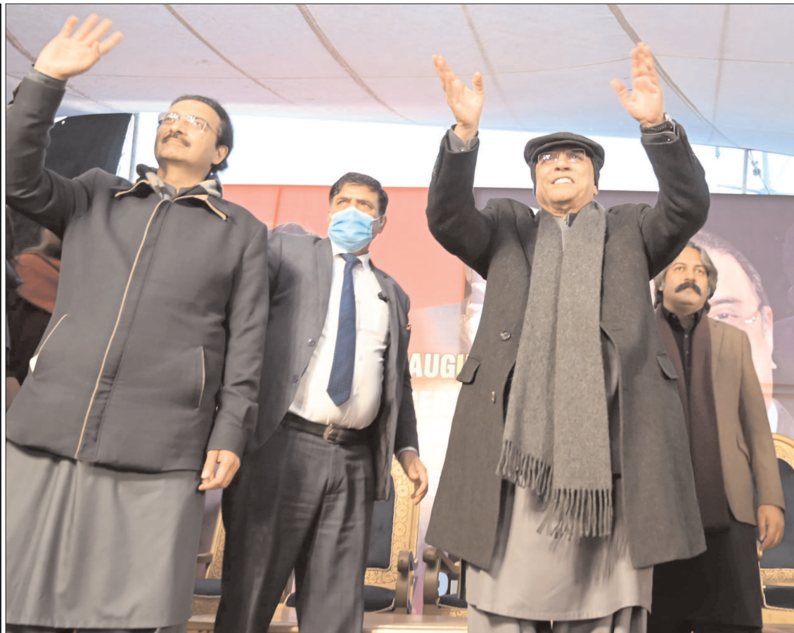
LAHORE: President Pakistan People's Party Parliamentarians, Asif Ali Zardari clapping with supporters during party's gathering.

The two leaders met on the sidelines of the World Economic Forum (WEF). PM Office Media Wing said in a press release. They reaffirmed their commitment to enhance high-level exchanges and bilateral cooperation in all areas of mutual interest, including, trade and investment, migration and mobility and higher education. Important regional and global developments were also discussed.