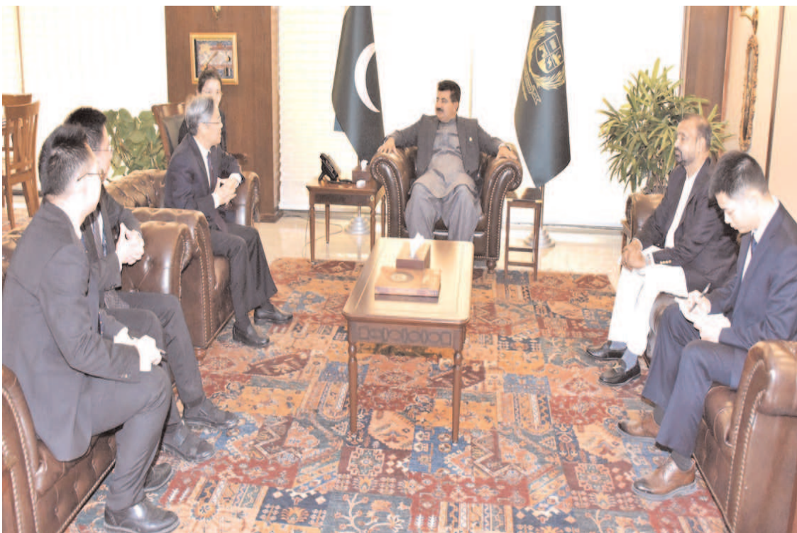
ISLAMABAD: Chinese Ambassador To Pakistan, Jiang Zaidong calling on Chairman Senate of Pakistan, Muhammad Sadiq Sanjrani, at the Parliament House.