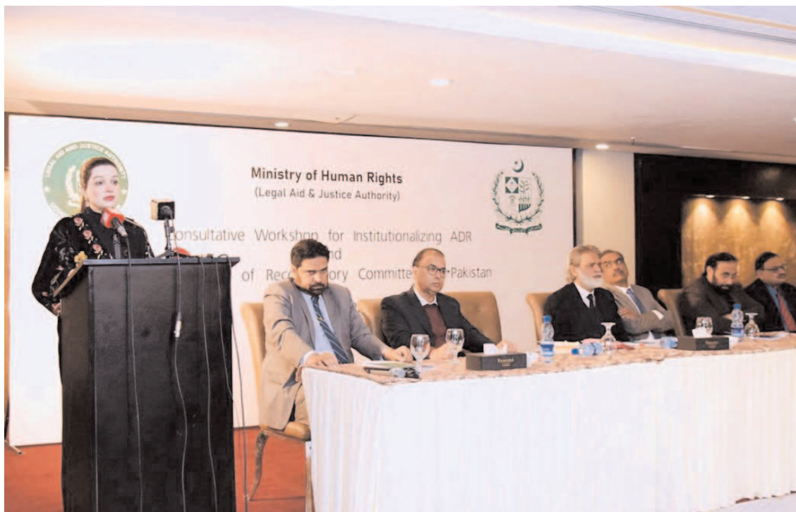
ISLAMABAD: SAPM for Human Rights and Women Empowerment, Mushaah Hussein Mullick addressing a workshop on Alternative Dispute Resolution (ADR) organized by LAJA, Ministry of Human Rights.

After obtaining necessary clearances from relevant authorities, the NSA will grant registration to satellites, allowing operators to access services from these registered satellites. The move comes after the caretaker federal cabinet approved Pakistan's first-ever space policy on December 13, 2023. The policy, encapsulated in the National Space Program 2047, reflects the government's unwavering commitment to advancing space activities within the country.