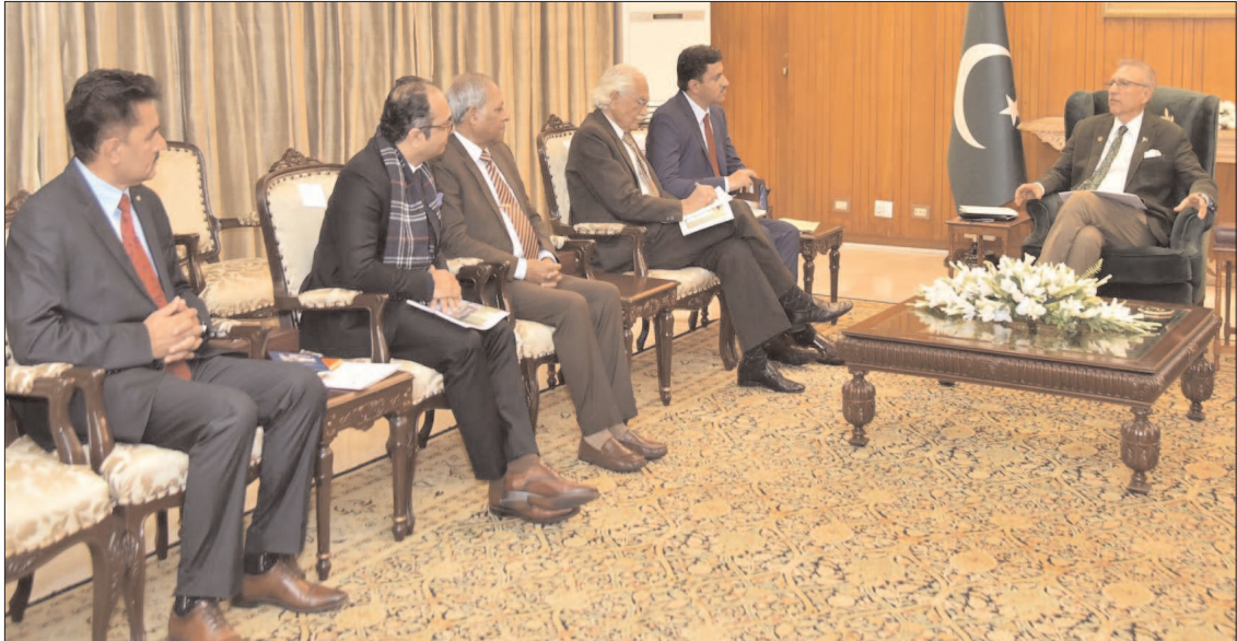
ISLAMABAD: A delegation of Kashmir Education Foundation called on President Dr. Arif Alvi, at Aiwan-e-Sadr.