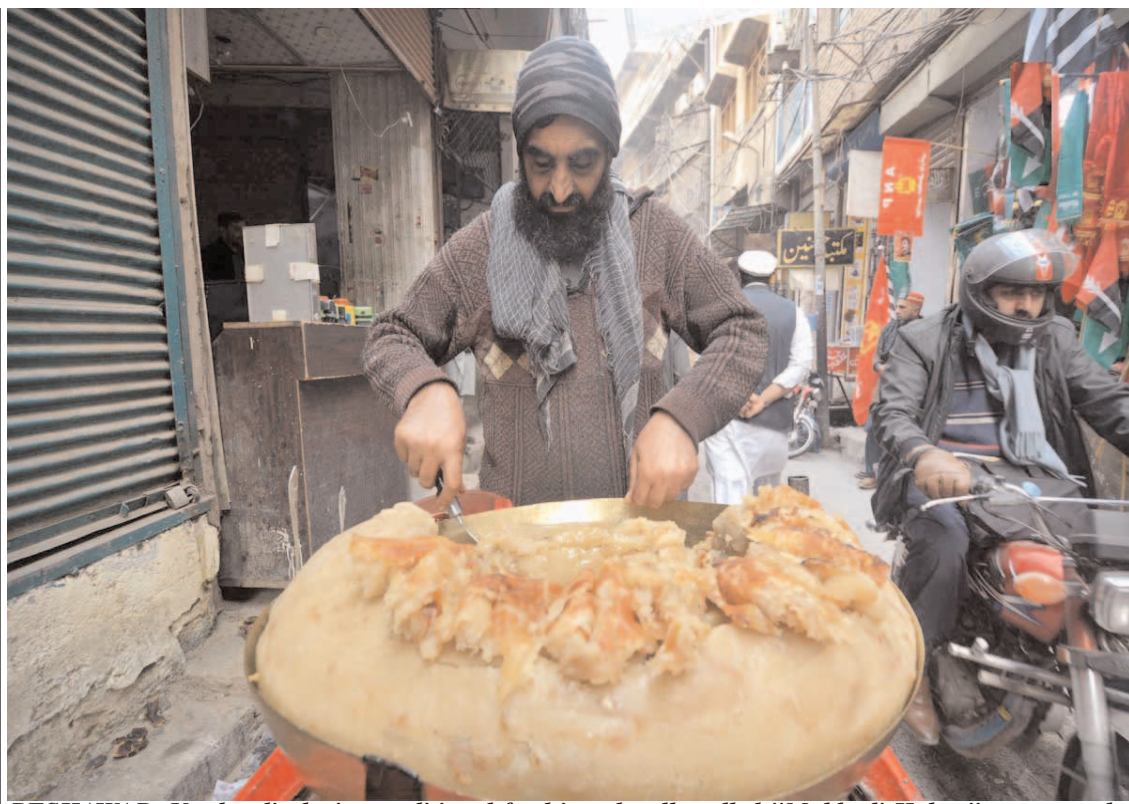
PESHAWAR: Vendor displaying traditional food item locally called "Mukhadi Halwa" to attract the customers at Qissa Khawani area.

The inaugural lecture enabled a thought-provoking exploration of the dynamic relationship between Islam and the work of the humanities, showcasing IBA's commitment to fostering intellectual dialogues and advancing knowledge.