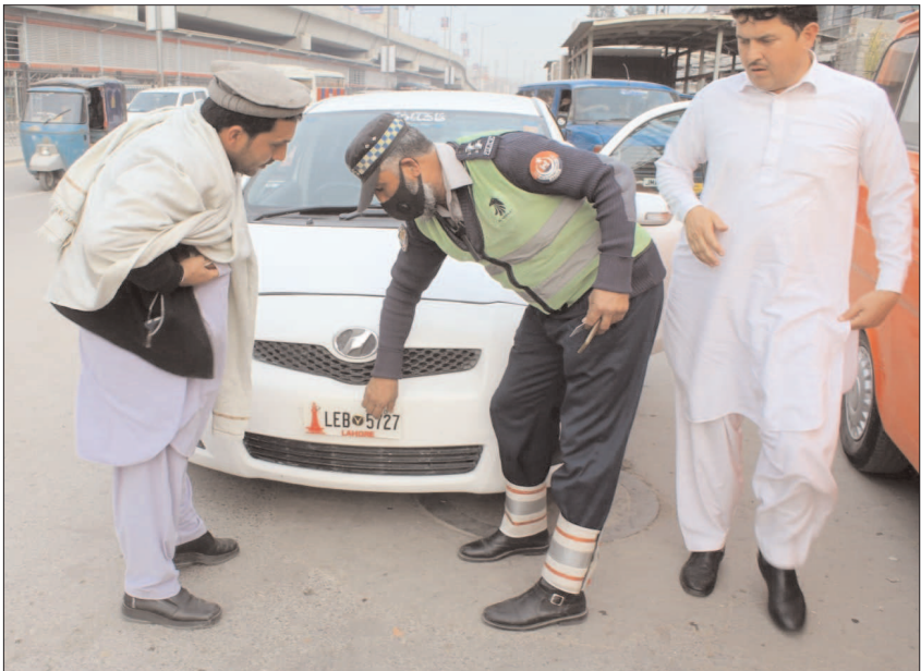
PESHAWAR: A traffic police official removing fancy number plate from a car during campaign.