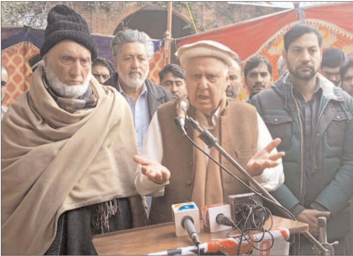
CHARSADDA: Chairman of Qaumi Watan Party, Aftab Ahmad Khan Sherpao talking to media persons.