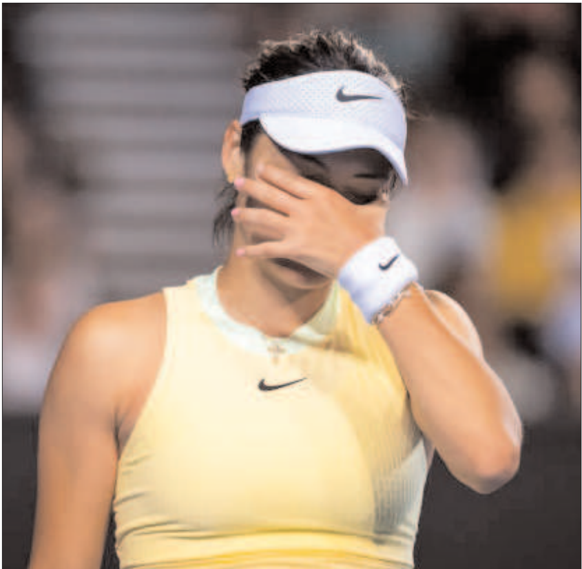
MELBOURNE: Emma Raducanu of Great Britain in action against Yafan Wang of China in the second round on Day 5 of the 2024 Australian Open.