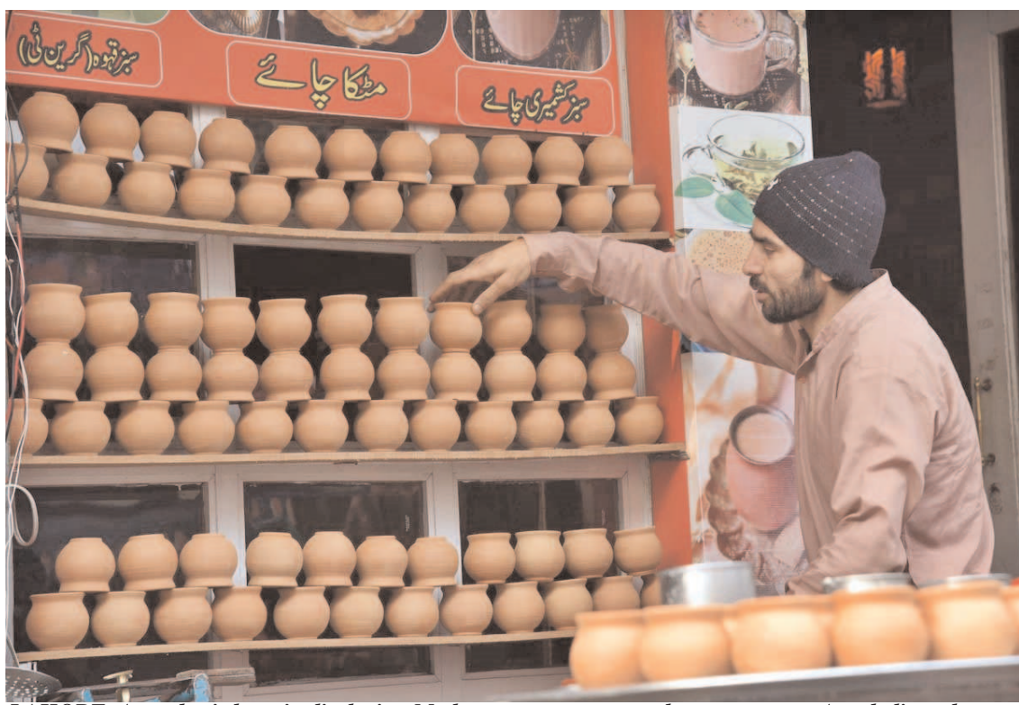
LAHORE: A vendor is busy in displaying Matka tea cups to attract the customers at Anarkali market.