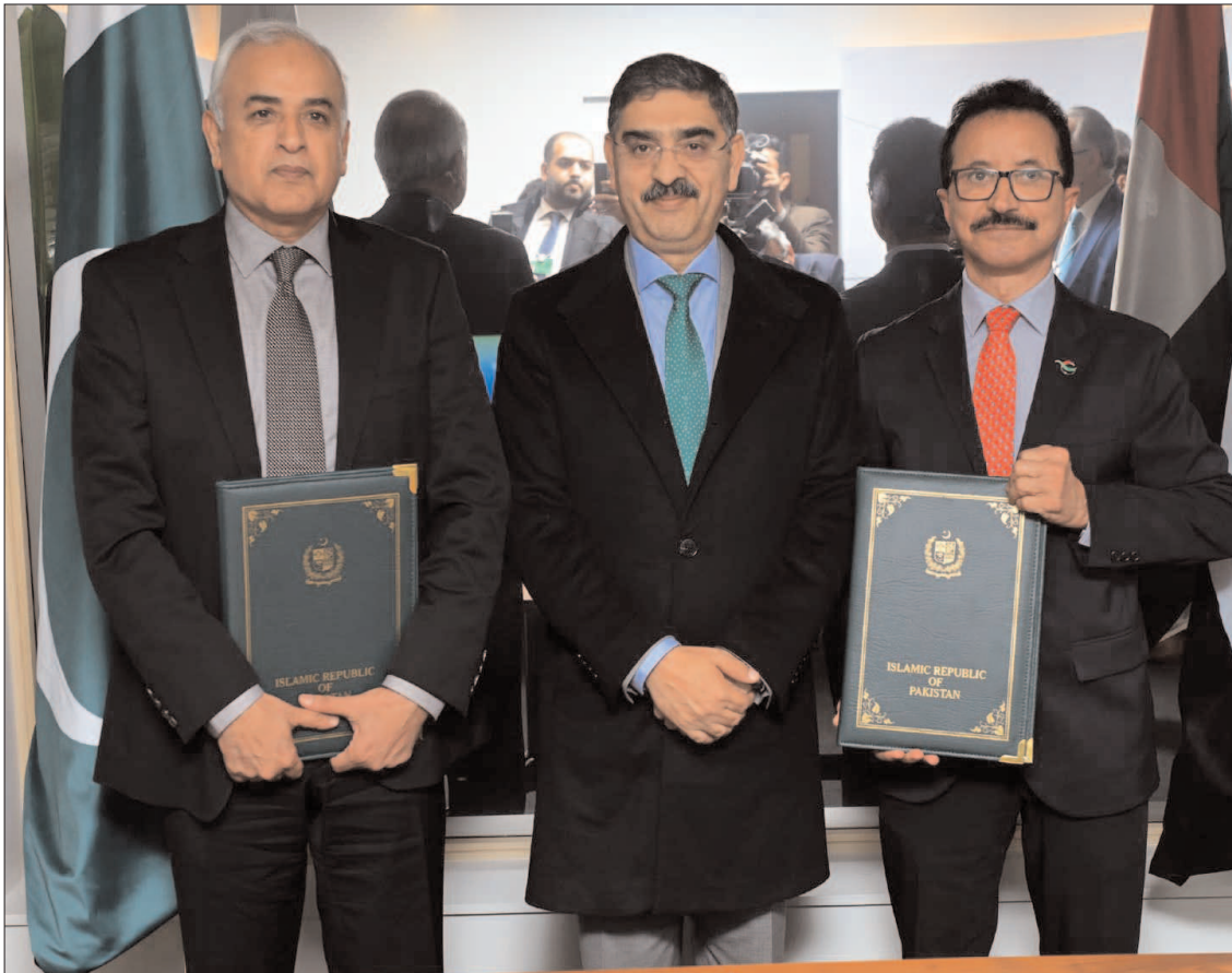
DAVOS: Caretaker Prime Minister witnessing the signing of inter-government framework agreements between ministries of Communication, Railways and Maritime Affairs of Pakistan and Dubai, represented by DP World.

Vol. XXXIX No. 362 Regd. No. 241 RAJAB 07 1445 -- FRIDAY, JANUARY 19 2024 PESHAWAR EDITION 12 PAGES PRICE. 30