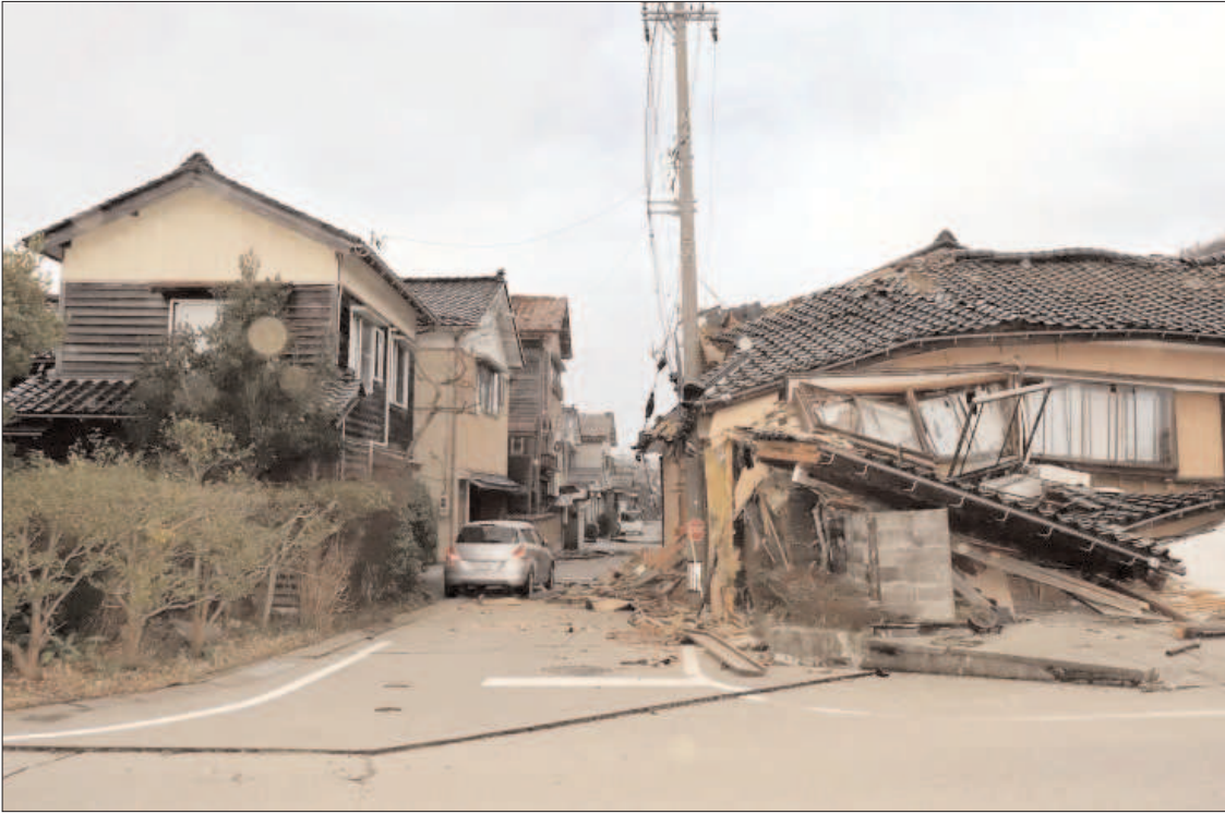
TOKYO: A view shows badly damaged buildings along a street in the city of Wajima in Ishikawa prefecture after a major 7.6 magnitude earthquake struck the Noto region.

Hokuriku's Shika plant in Ishikawa, located the closest to the quake's epicentre, had already halted its two reactors before the quake for regular inspection and saw no impact from the quake, the agency said. South Korea's meteorological agency said the sea level in some parts of the Gangwon province on the east coast may rise. Japan is one of the countries in the world most at risk from earthquakes. A huge earthquake and tsunami struck northeastern Japan on March 11, 2011, killing nearly 20,000 people, devastating towns and triggering nuclear meltdowns in Fukushima. — Aljazeera