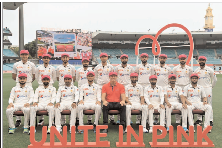
SYDNEY: The Pakistan players pose with Glenn McGrath as they gear up for the Pink day.