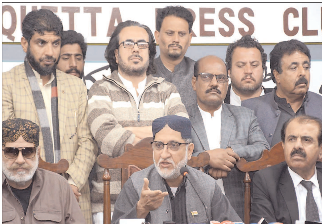
QUETTA: Chief of Balochistan National Party (Mengal) Akhtar Mengal addressing a press conference.

The speakers condemned the PTI and JI for ignoring the Lower Dir district in development. They said the ANP provided gas facilities to several areas despite the fact that people of Dir had never voted for it. The speakers said the ANP would provide basic facilities to people of Dir irrespective of their political affiliation. They asked the participants to give a chance to the ANP candidates so that they could serve the area.