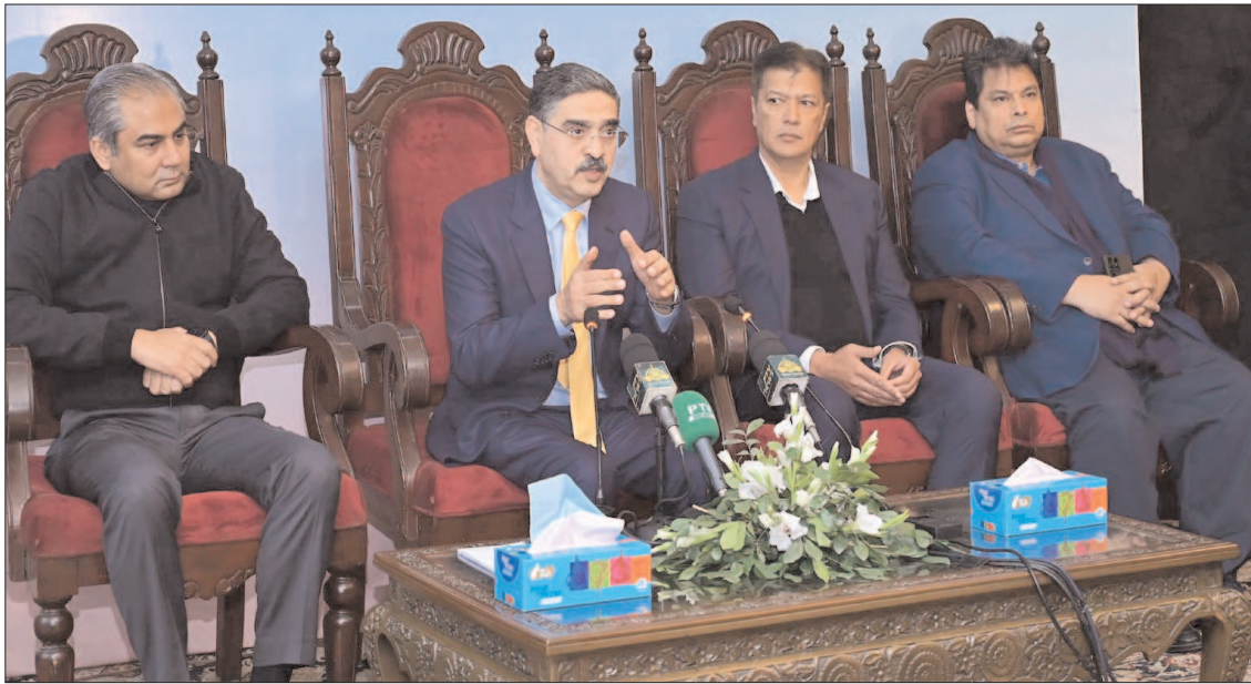
ISLAMABAD: Caretaker Prime Minister Anwaar-ul-Haq Kakar talking to media persons during his visit to Business Facilitation Centre.

ECP's acceptance of Nawaz's papers challenged F.P. Report