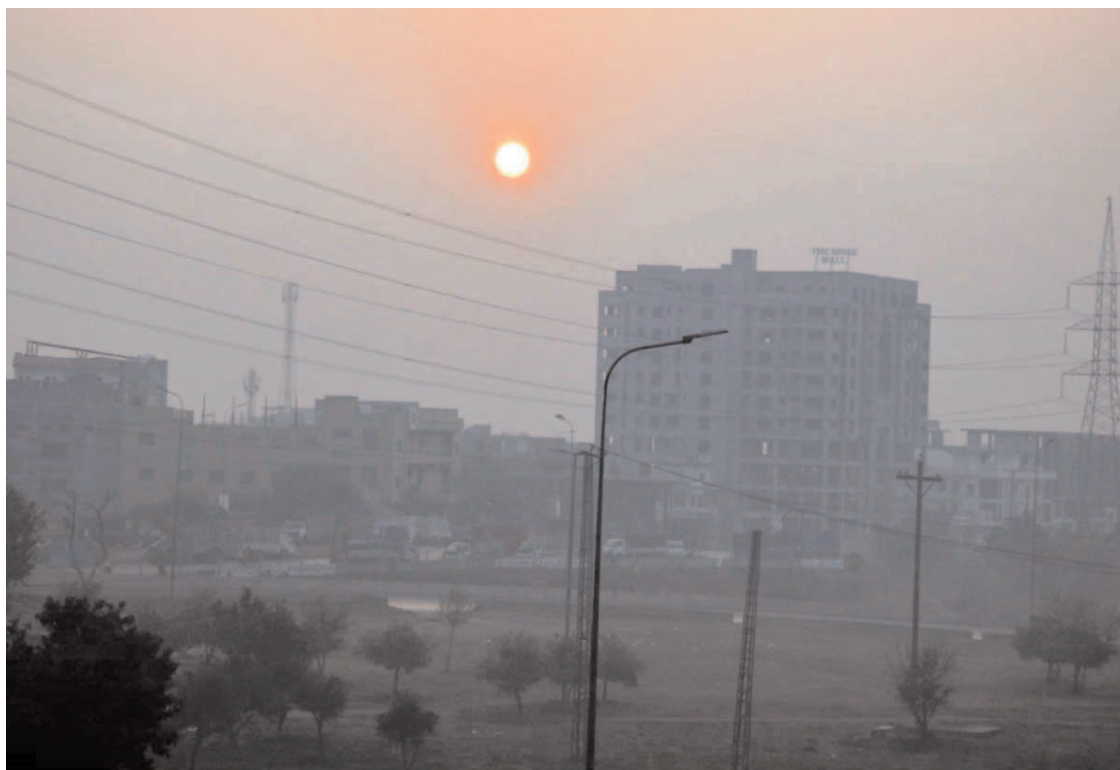
ISLAMABAD: A view of first sunrise of year 2024 through KhanaPul.