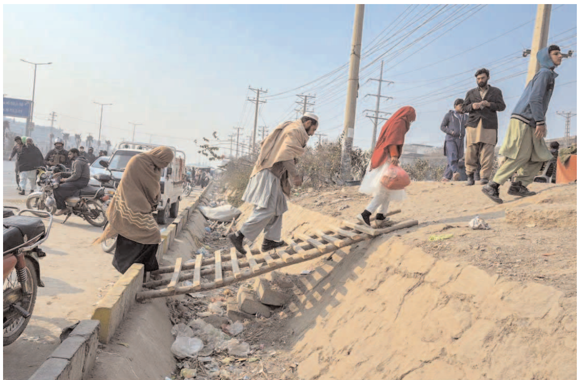
ISLAMABAD: People crossing nullah through temporary wooden ladder along road at Pirwadhai.

Due to contaminated water resource in the catchment areas as well as heavy density of minerals in the ground water, there is an urgent need for regular testing and verifying of all drinking water sources through effective mitigation measures. Simply by doing this, we can save extra money spent on water borne diseases, control wastage and conserve our precious resource to provide healthy environment to our people.