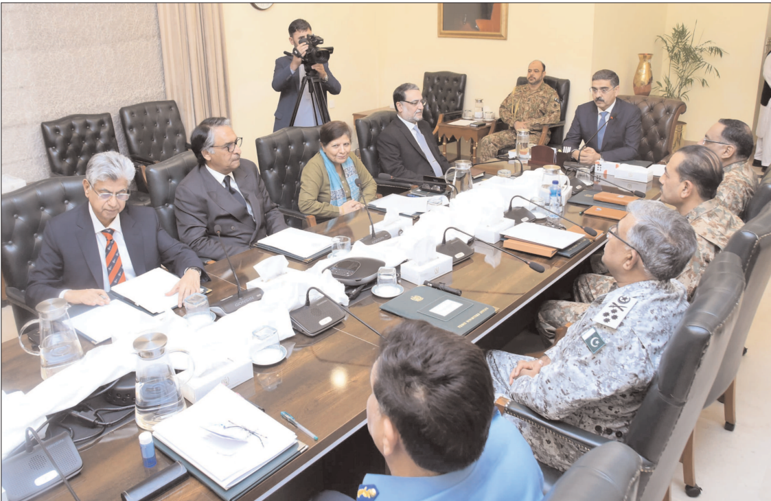
ISLAMABAD: Caretaker Prime Minister Anwaar-ul-Haq Kakar chairing a meeting of National Security Committee.

Highlighting the artificial rift between the PPP and the PML-N, he argued that the masses are well-informed in the age of social media. He claimed that both former ruling parties have nothing substantial to present in terms of past performance, relying on false promises to capture public attention. However, he expressed confidence that this time, the people will not accept them, as Pakistanis have grown weary of dynastic rule.