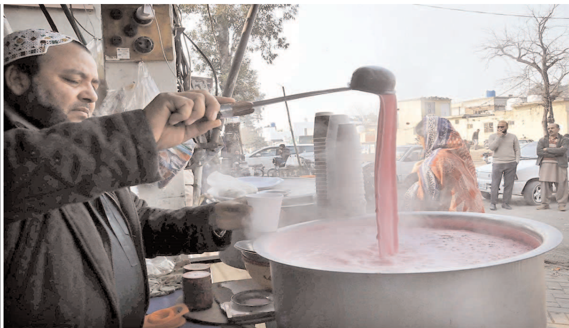
ISLAMABAD: A vendor making and selling Kashmiri tea at his roadside setup at Aabpara Market in Federal Capital.

the exports of $397.307 in the same month of last year. It may be recalled here that during the period under review, the exports increased by 5.17 per cent to $14.981 billion compared to the exports of $14.244 billion during the corresponding period of last year, according to the latest PBS data. On the other hand, the imports narrowed by 16.28 per cent and were recorded at $26.129 billion compared to $31.209 billion last year. Meanwhile, on a year-on-year basis, the exports from the country increased by 22.21 per cent in December compared to the exports of the same month of last year. The exports during the month were recorded at $2.812 billion as against the exports of $2.301 billion in December 2022.