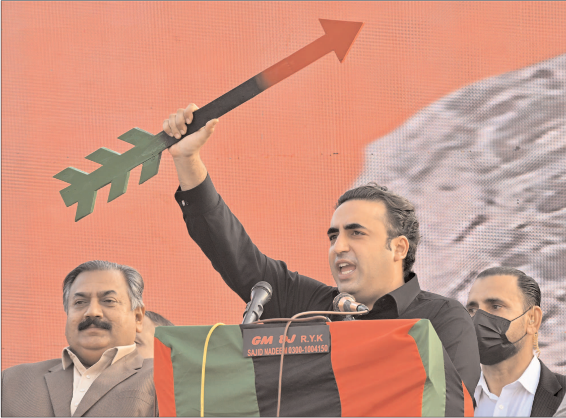
LIAQATPUR: Chairman Pakistan Peoples Party, Bilawal Bhutto Zardari addressing a public gathering of the party.

It is painful for us that our neighbors are suffering so much," he said. "But how else can we defend ourselves if our enemies decided to entrench themselves in an infrastructure of terror of unbelievable size and scope?" he said.