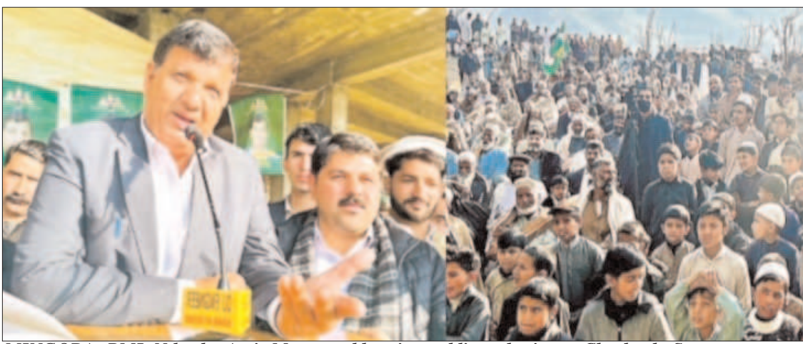
MINGORA: PML-N leader Amir Muqam addressing public gathering at Charbagh, Swat.

recovered NCP items from truck number 8660-DIK including 93 sacks of parachute cloth, 13 sacks of China salt and 04 tyres. The estimated worth of the recovered goods was around Rs 6.5 million which was later handed over to the customs authorities for further legal action.