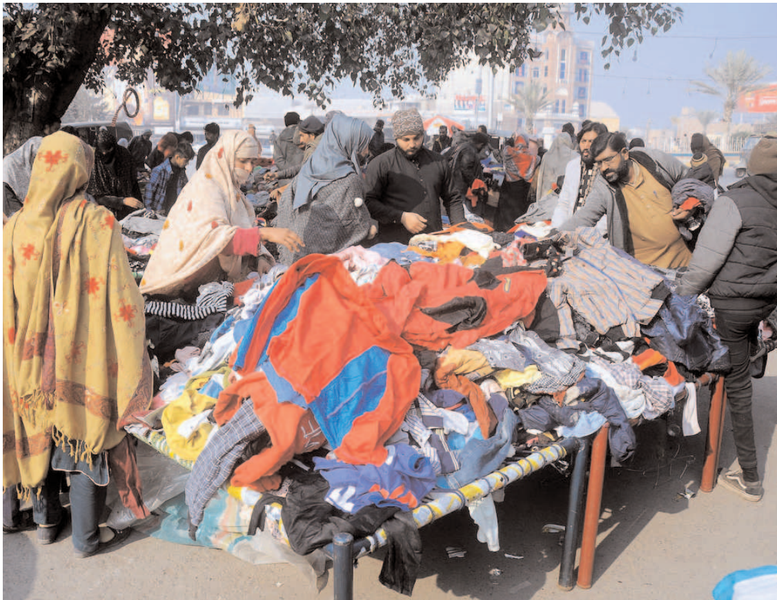
MULTAN: People selecting and purchasing old warm clothes from vendor at Hussain Agahi.

He noted that although both countries were desirous to have a sustainable and long-lasting FTA but it was yet to materialize. "The potential benefits of a swift conclusion to the FTA talks are immense, which can boost the existing volume of bilateral trade", he opined, adding that under FTA negotiations, sizeable tariff concessions should be given to Pakistan's value-added export products.