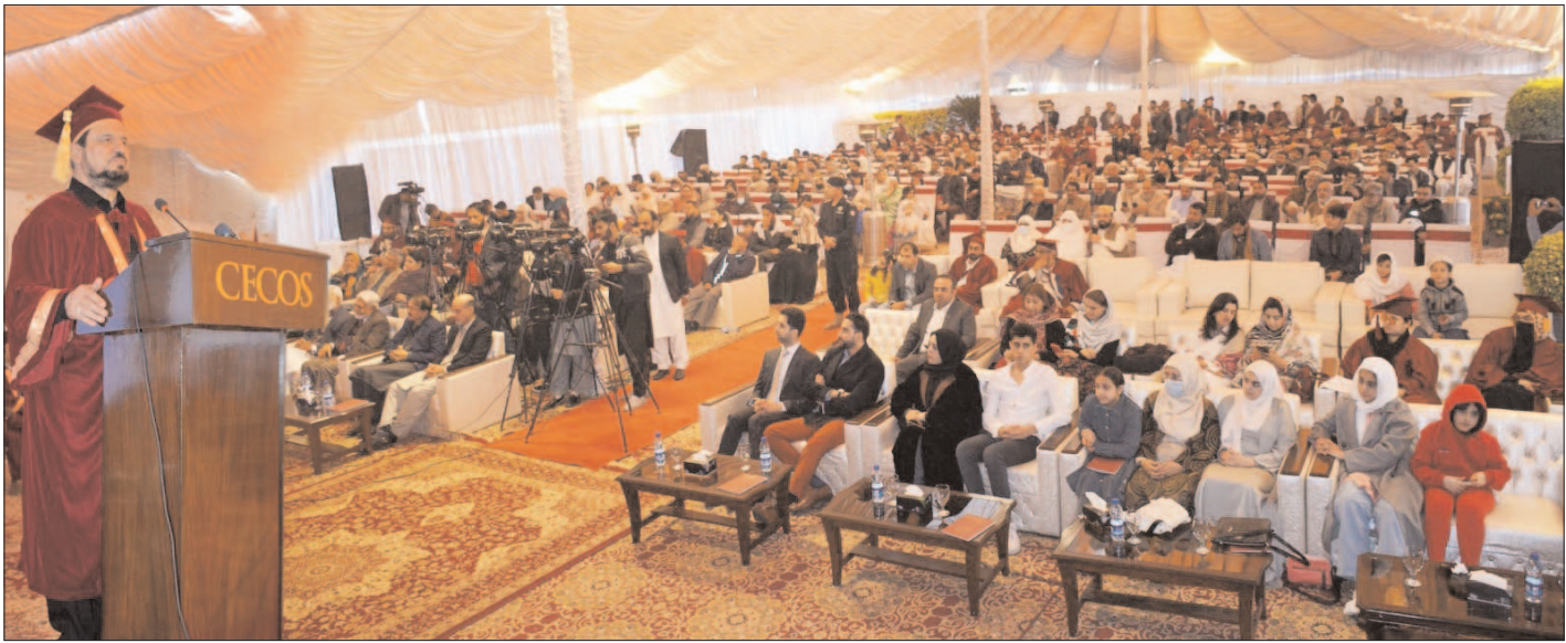
PESHAWAR: Governor Khyber Pakhtinkhwa, Haji Ghulam Ali addressing of the CECOS University convocation in 2024 in Hayatabad.