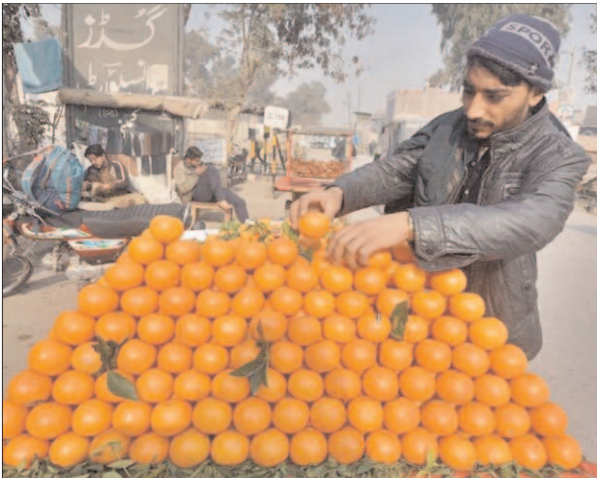
PESHAWAR: A vendor displaying oranges to attract the customer at Haji Camp.

According to details, Ahmad son of Roohullah five years of age was playing mortar when it was blasted while his mother along with one other woman was critically injured in the mishap. The injured women were shifted to nearest hospital for treatment while their condition is report out of danger.