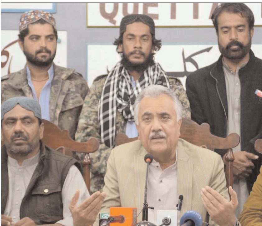
QUETTA: Former senator and National Party leader Kabir Muhammad Sahi addressing a press conference.

in all six districts of Naseerabad division, effective steps should be taken to maintain peace. He noted that the Election Commission has kept the transport rate higher than other provinces in consideration of communication difficulties in Balochistan. Earlier, the meeting was briefed that the agreement for installation of CCTV cameras at sensitive polling stations had been finalized and all the deputy commissioners have been asked to nominate a focal person for the operation of CCTV cameras in the next 24 hours.