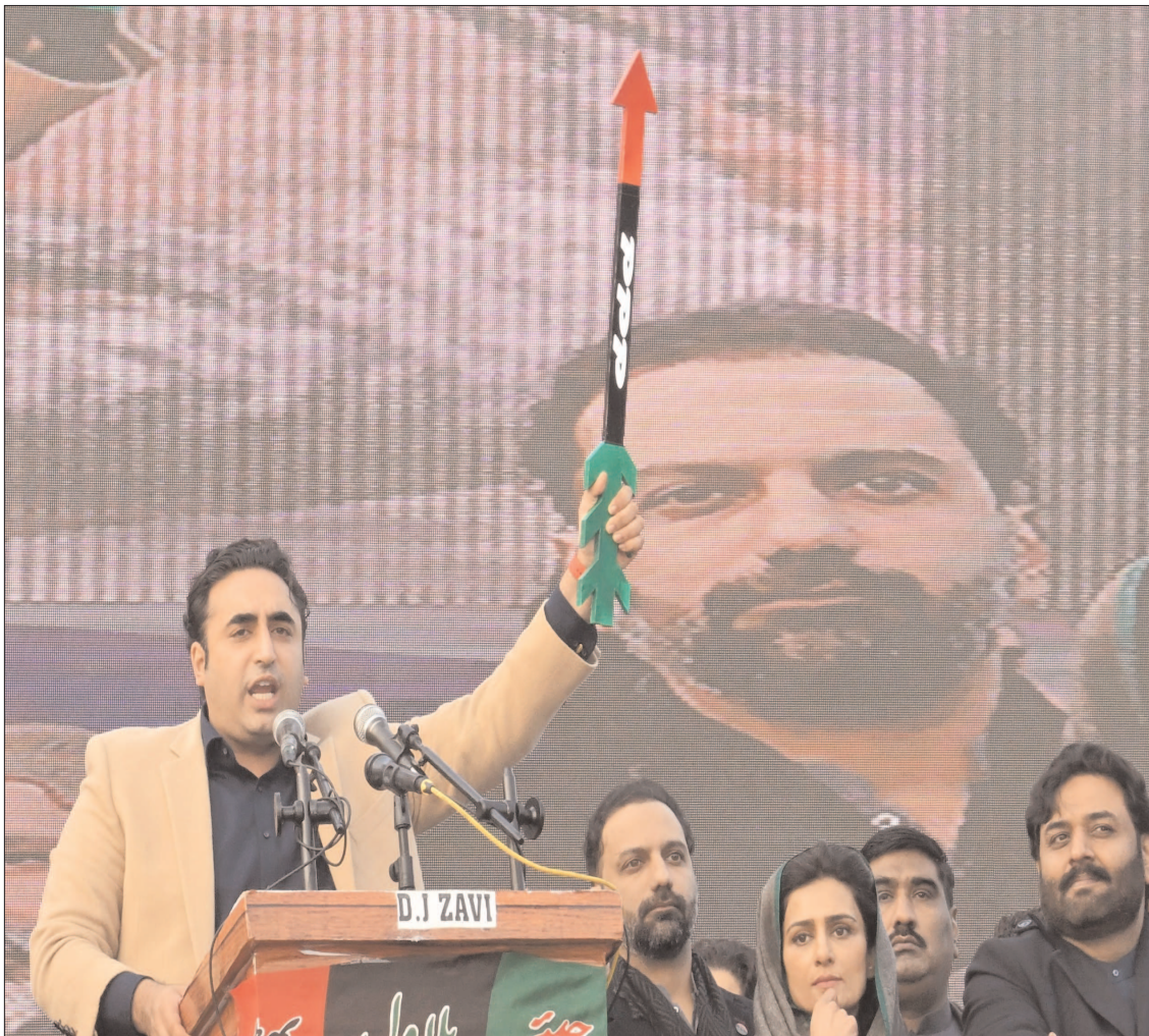
KOT ADDU: Chairman Pakistan Peoples Party, Bilawal Bhutto Zardari addressing a public gathering.