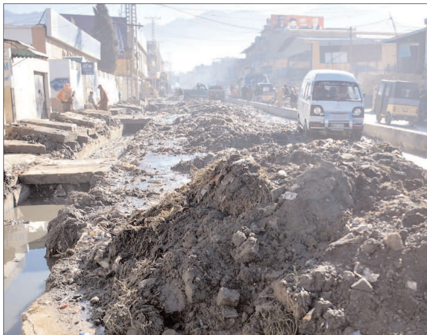
QUETTA: A view of waster material on the main Saryab Road, needs attention of authorities concerned.

Senator Samina Mumtaz Zehri further said that Pakistan is a peace-loving country, but this desire of ours should not be considered as weakness. We have all weapons and power, enemies know it, friends also think. She said that Iran is our brother and neighboring country and this problem should be resolved at the foreign level for which both countries have to take positive steps because the enemy can take advantage of any kind of tension between the two brother countries. Senator Samina Mumtaz Zehri expressed hope that Iran will take effective action against terrorists and hideouts of organizations involved in anti-Pakistan activities within its borders so that terrorists cannot succeed in their nefarious intentions against Pakistan.