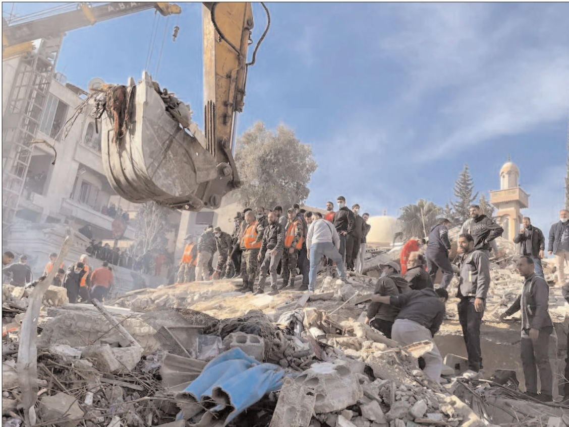
DAMASCUS: A heavy-duty machine removing debris of a destroyed building after an apparent Israeli attack killed members of Iran's Revolutionary Guard Corps in Syria.