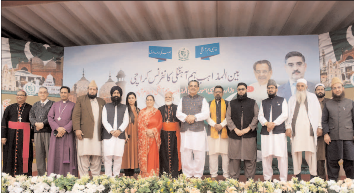
KARACHI: The Caretaker Federal Minister for Religious Affairs and Interfaith Harmony Aneeq Ahmed in a group photo with Ulema, Bishops, Pandits, Sikh, Parsi and other Minority leaders during 'Interfaith Harmony Conference'.

The Governor Punjab said that one should look at ones shortcomings only in a way to improve them. He urged the students to pay special attention to character building. He said that degree gives new opportunities but success comes with good character. He said that the success of students is connected with the success of humanity. He said that students should be grateful to their parents and after parents; they should thank their teachers who enabled them to move ahead.