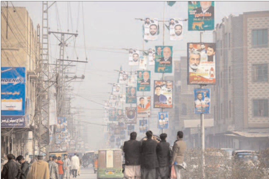
PESHAWAR: A view of different political parties banners displayed on street lights for upcoming General Election-2024 at Dalazak Road.