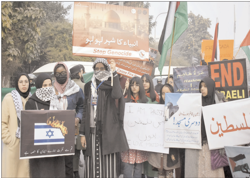
LAHORE: Members of civil society holding placards during protest against Israel's attack on Gaza.

Referring to the lack of freedom of speech in the country, the top court judge said the endless process of censor kicked off after the state's censoring Quaid-e-Azam Muhammad Ali Jinnah's August 11, 1947 speech. Reminiscing his first case as a judge, he said it was a bail plea and a 16-year-old suspect was before the court for putting up a banner against an apex court judge. The subordinate court rejected the plea saying he had committed a crime against the entire judiciary, he said adding that nobody tried to find out who got the banners made.