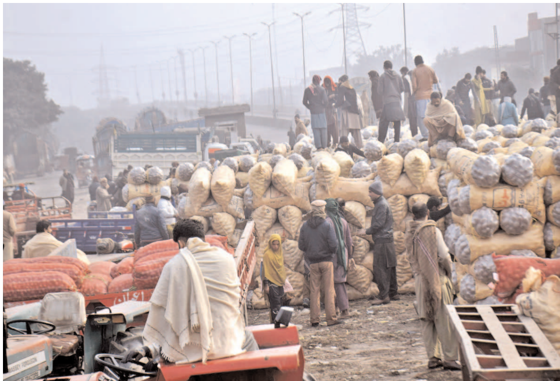
LAHORE: Vendors displaying potato sacks for bidding at vegetable Market.

He said that the dynamic automotive sector in Pakistan produces a wide range of quality components. Collaboration with Rwandan importers in this sector can lead to the provision of reliable automotive parts, contributing to the growth of Rwanda's automotive industry.