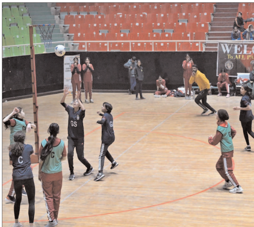
ISLAMABAD: Players of KGS and Habib school netball teams in action during National Inter School Girls Netball Championship Final at Liaquat Gymnasium.

"They will give everything for Hong Kong."