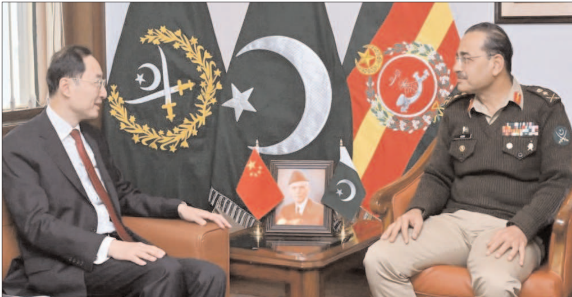
RAWALPINDI: Mr Sun Weidong, Vice Foreign Minister of the People's Republic of China called on General Syed Asim Munir, NI (M), Chief of Army Staff, at GHQ.