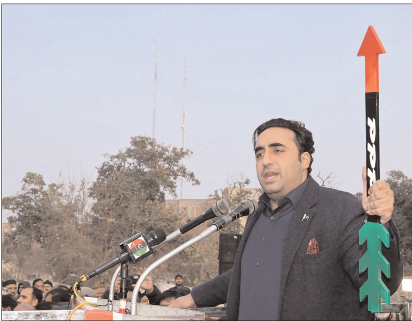
SAHIWAL: Chairman Pakistan People's Party, Bilawal Bhutto Zardari addressing a public gathering.