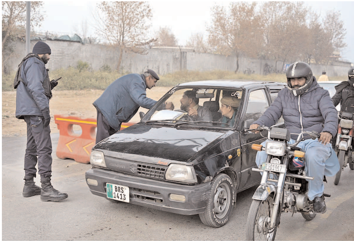
ISLAMABAD: Police officials busy searching vehicles during routine security check in the Federal Capital.