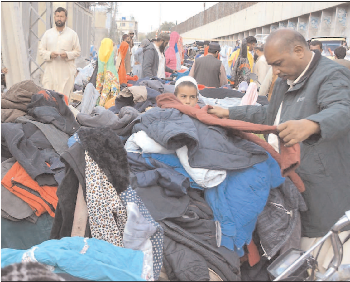
QUETTA: A man selecting and purchasing jackets' from a roadside vendor.