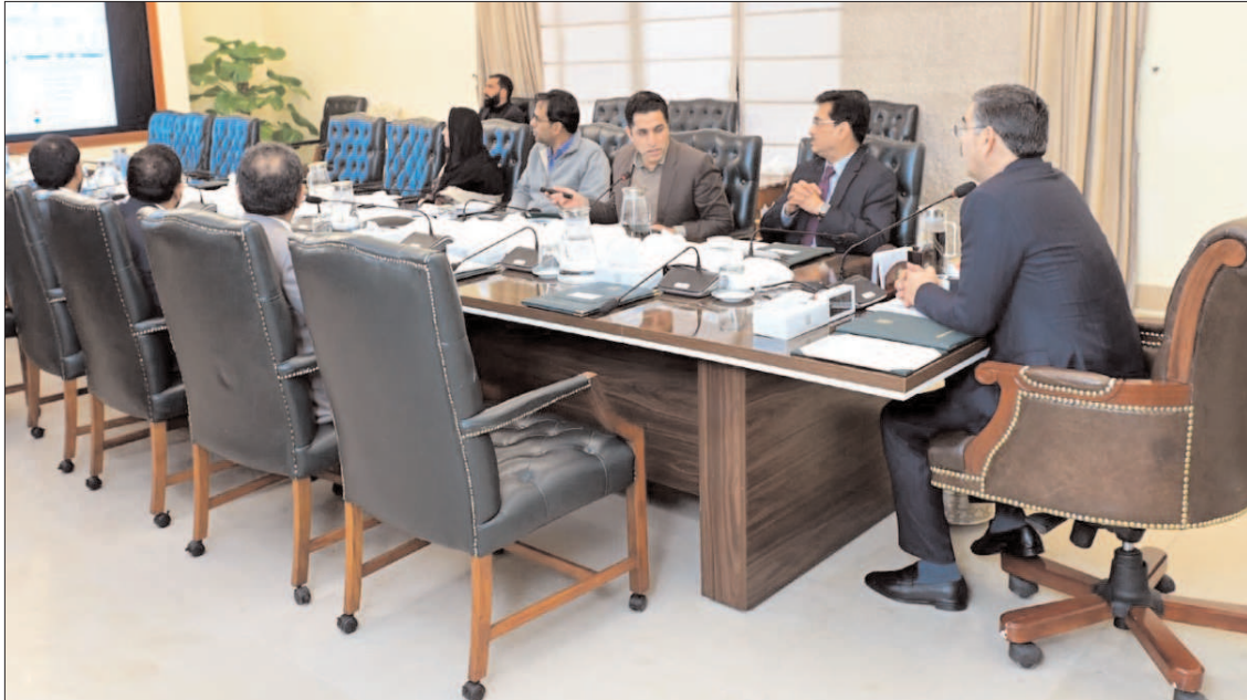
ISLAMABAD: Caretaker Prime Minister Anwaar-ul-Haq Kakar chairs a meeting of Capital Development Authority.