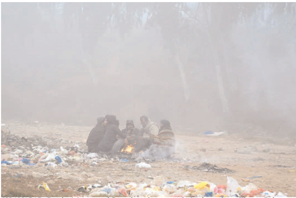
ISLAMABAD: People sitting around fire to keep them warm during heavy fog at Khanna Pul.

The officials from Ministry of Federal Education and Professional Training, World Bank, Foreign Commonwealth Development Organization, UNESCO, UNICEF besides other stakeholders, attended the event. The provincial education departments officials also joined the event through video links.