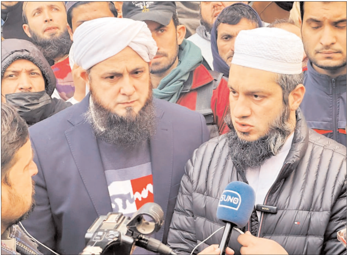
PESHAWAR: Mayor Haji Zubair Ali talking to media persons at Saddar mobile market after horrific fire.