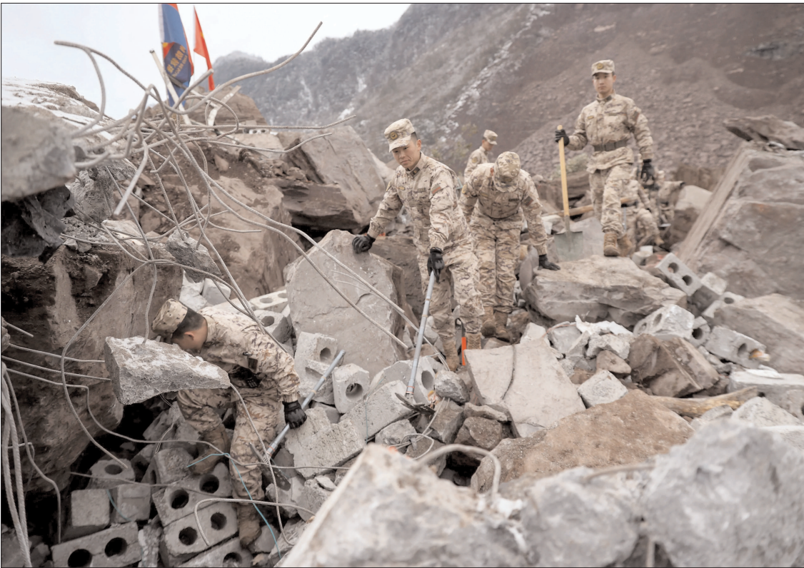
BEIJING: Chinese military personnel search for missing people following a landslide in Liangshui village, in China's Yunnan province.