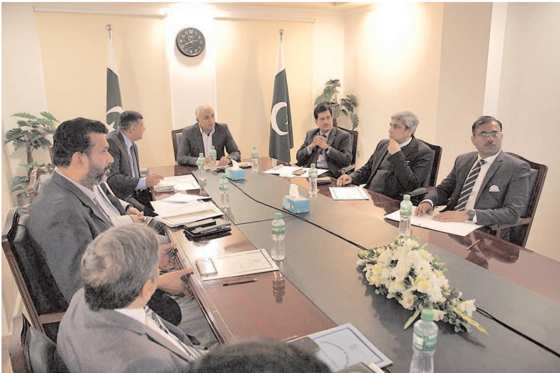
ISLAMABAD: Federal Minister for Communications Shahid Ashraf Tarar being briefed regarding the working of Control room established by Ministry of Interior to monitor the overall security situation during Elections.