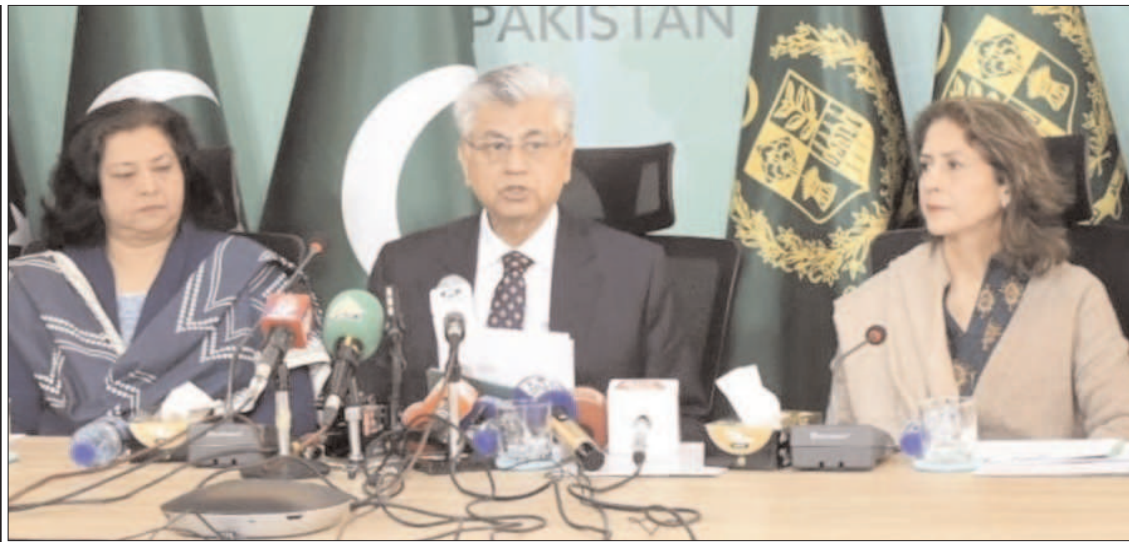
ISLAMABAD: Caretaker Federal Minister for Information and Broadcasting, Murtaza Solangi addressing a press conference.

extreme shortages of medicine in Lahore, where several children are being treated for various pneumonia, chest and other viral infections. The signs and symptoms of pneumonia vary from mild to severe, depending on factors such as the type of germ causing the infection, and your age and overall health.