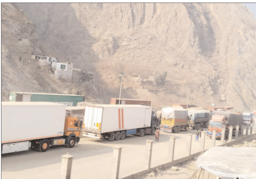
LANDI KOTAL: Export and import loaded trucks start crossing the border, after suspension of 10 days.