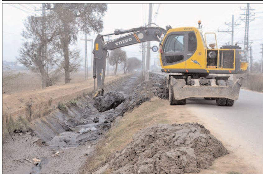
MULTAN: Worker is busy cleaning the Canal with the help of Machinery at old Shujaabad road.

In a separate incident, last week, three people died after a passenger bus plunged into the river in Bahawalpur. According to the rescue officials, the accident took place near Nowshera Jadeed, Bahawalpur, where an over-speeding passenger bus overturned and plunged into the river leaving three killed and 17 others injured. Meanwhile, the rescue personnel shifted the injured individuals to the Bahawal Victoria Hospital for immediate medical assistance.