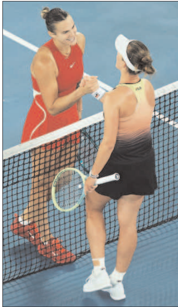
Aryna Sabalenka (L) embraces Barbora Krejickova of Czech Republic after winning their quarterfinals singles match.

umph on Rod Laver Arena 12 months ago, hit 20 winners and broke Czech 2021 French Open champion Krejickova's serve six times in a devastating quarter-final display. That was in sharp contrast to last-four opponent Gauff's victory, with the fourth seed saying she hopes to have "got the bad match out of the way" as she aims to become the first women's player since Naomi Osaka three years ago to win back-to-back majors. The other two quarter-finals in a women's singles draw blown open by a string of high-profile early exits take place on Wednesday. One of China's Zheng Qinwen, Russia's Anna Kalinskaya, Ukraine's Dayana Yastremska and Czech Republic's Linda Noskova - none of who have ever played in a Grand Slam semi-final - will meet Gauff or Sabalenka in Saturday's showpiece.