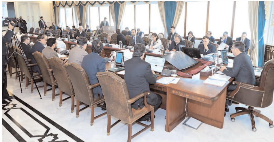
ISLAMABAD: Caretaker Prime Minister Anwaar-ul-Haq Kakar chairing a meeting of federal cabinet.

LAHORE: PML-N has finally officially announced that its party manifesto will be unveiled on January 27. The manifesto committee, led by Senator Irfan Siddique, was established by PML-N in October to formulate the party's vision. While establishing a web portal, the PML-N has sought suggestions from professionals, experts, overseas Pakistanis and citizens for the party's election manifesto 2024.