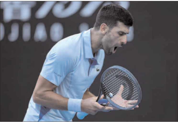
Djokovic reacts during their quarterfinals singles match against Fritz

MELBOURNE (Agencies): Novak Djokovic continued his bid for a record-extending 11th Australian Open title with a confident win over American 12th seed Taylor Fritz. The Serb, seeking a 25th Grand Slam to move past Margaret Court's record of 24, won 7-6 (7-3) 4-6 6-2 6-3 in hot conditions to reach the semi-finals. He will play fourth seed Jannik Sinner on Friday after the Italian defeated Russian fifth seed Andrey Rublev. "I suffered a lot in the first couple of sets," top seed Djokovic, 36, said. "I said [to my team] that this match was not an enjoyable match for me at all. "It was really difficult to find the right timing. It was really hot while the sun was still out. "We all know Taylor has got one of the best serves in the world. I knew the kind of a threat he poses when he serves on such a high quality." Djokovic has won his past 33 singles matches at Melbourne Park and is a clear favourite to defend his title. Sinner beat Rublev 6-4 7-6 (7-5) 6-3 in a match that finished at close to 01:30 local time on Wednesday morning after the start of the night