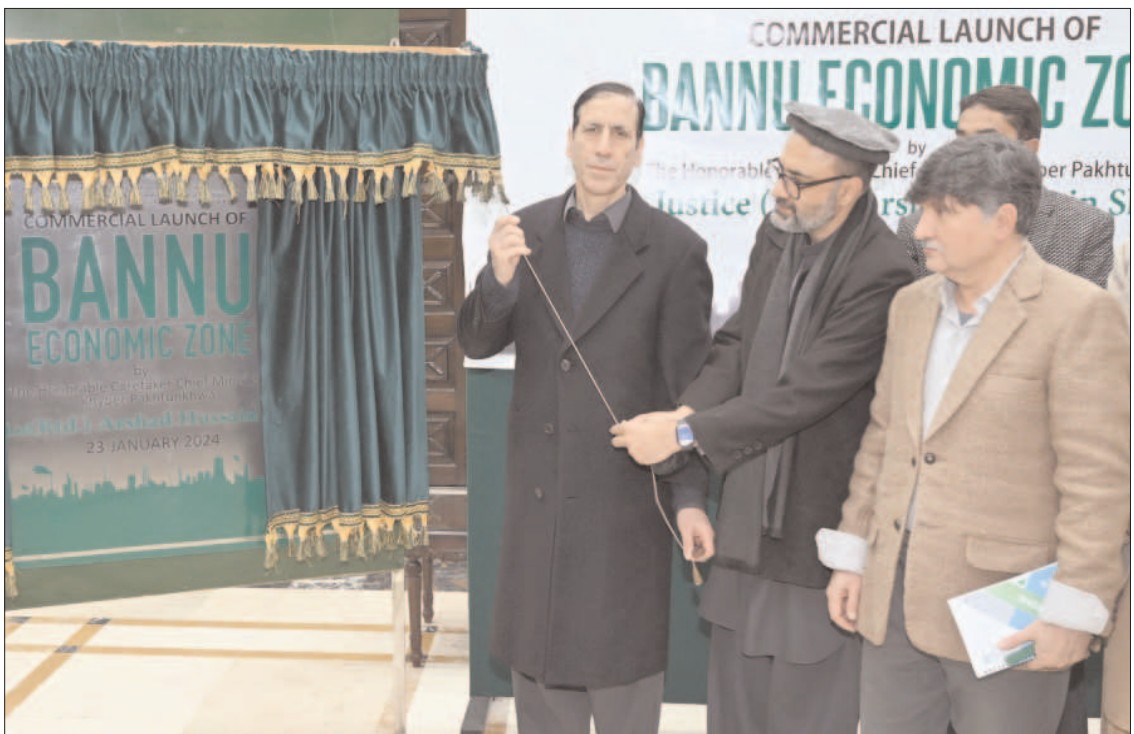
PESHAWAR: KP Caretaker Chief Minister Justice (R) Syed Arshad Hussain Shah performing commercial launching of Bannu Economic Zone.

Police said the incident occurred in Aligaram area of Kabal tehsil adding that bodies of the couple were shifted to Kabal Hospital for medico-legal procedure.