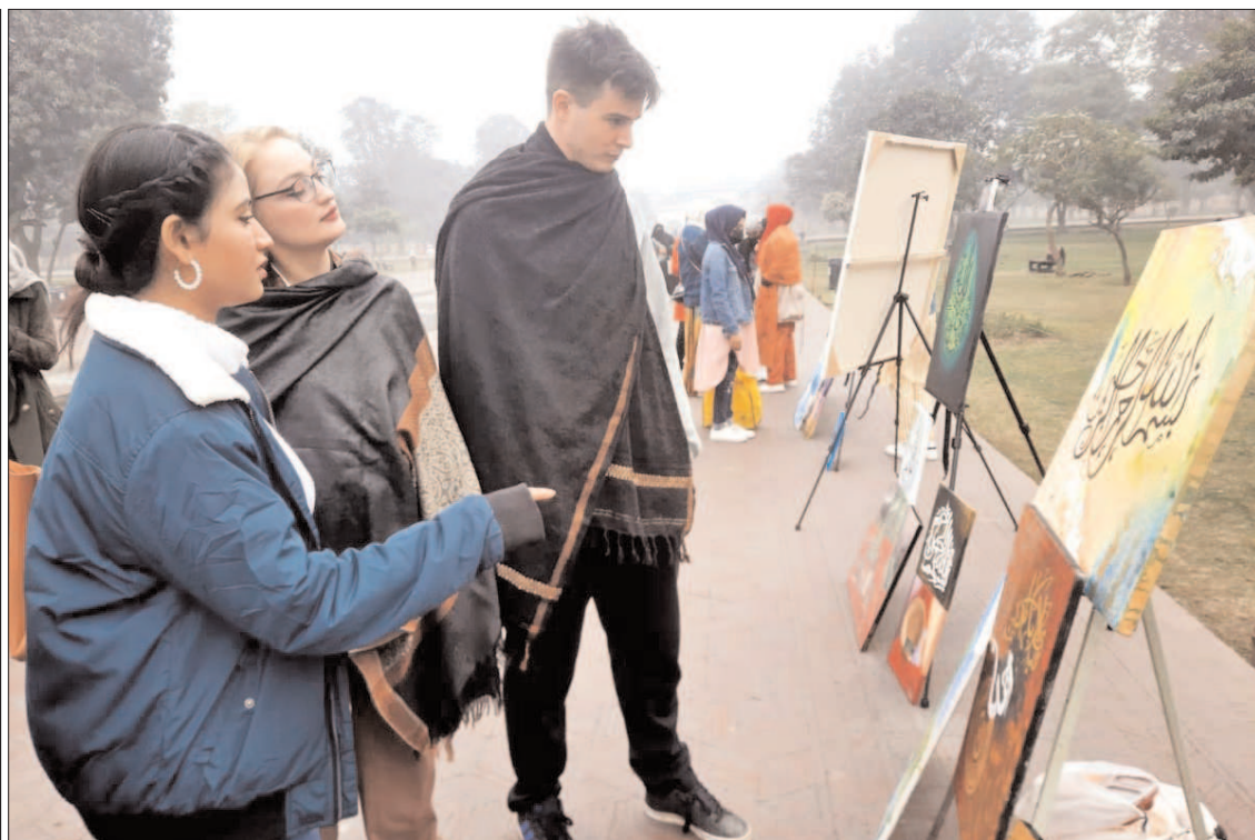
LAHORE: Painting & Calligraphy Exhibition organized by the The Formanite School System with the collaboration of Walled City Authority Shalamar Garden.