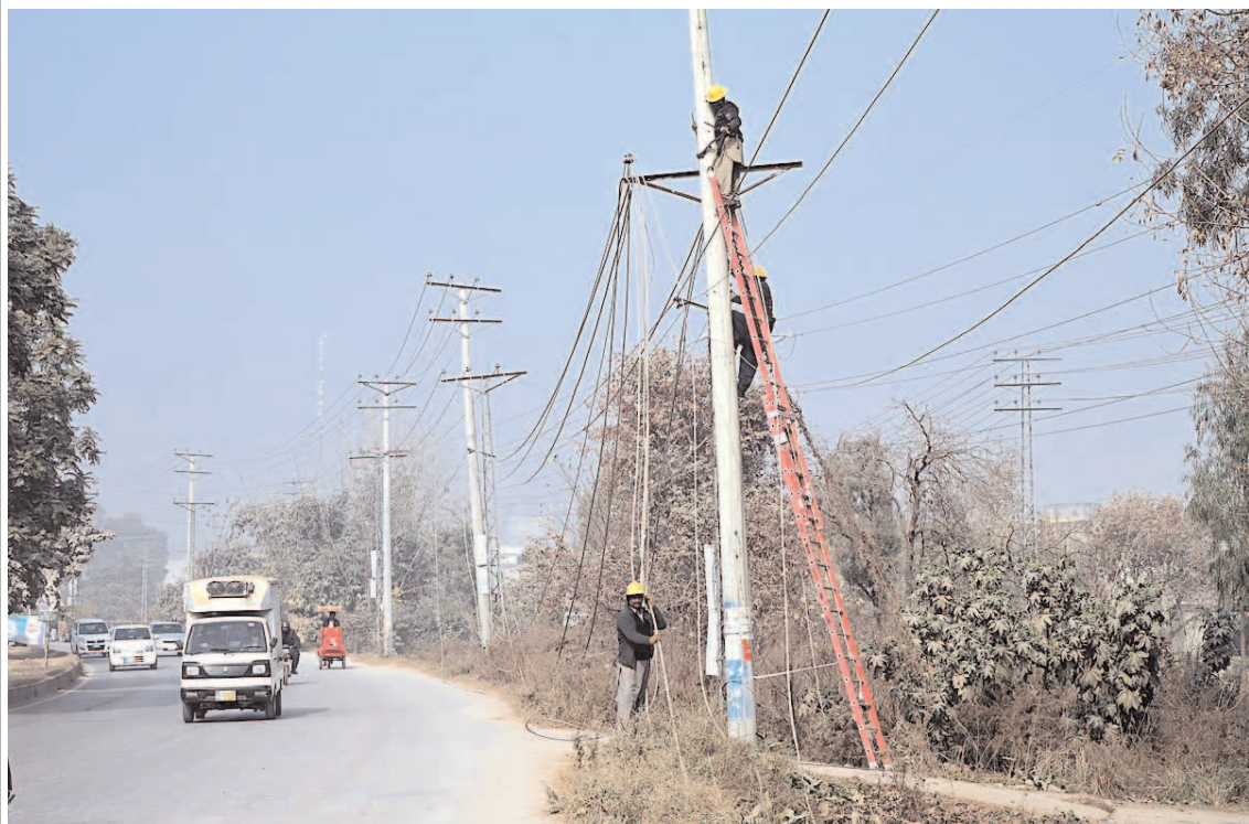
ISLAMABAD: IESCO workers repair the electric line at Park Road in Federal Capital.