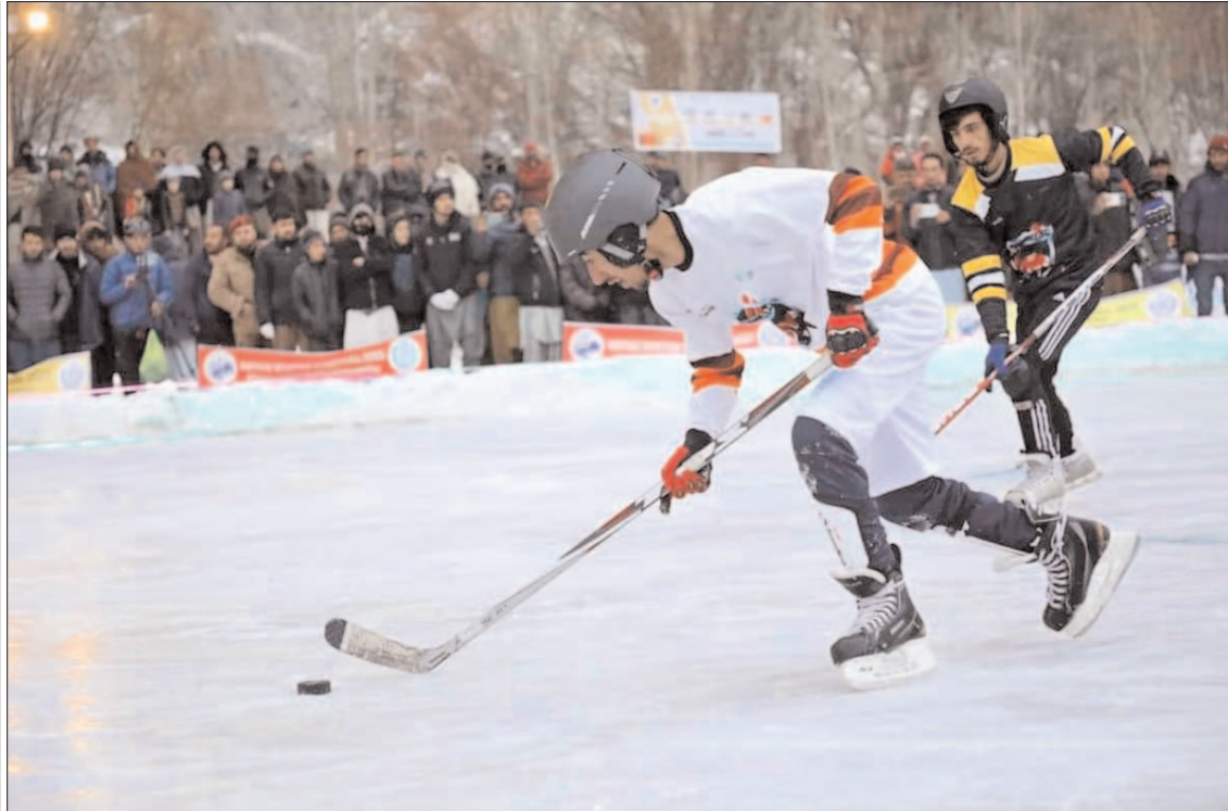
SKARDU: Youngsters in action during the practice day of Ice Winter Festival in connection to promote winter tourism in the area.

2024 Olympics, losing 3-2 to New Zealand in the third/fourth place match of the qualifiers on Sunday. It marks the third consecutive time Pakistan has missed out on Olympic qualification, having previously failed to secure a place in Rio 2016 and Tokyo 2020. In the qualifiers, Germany defeated Pakistan 4-0 in the semi-finals, earning a crucial point to advance to the final four. After losing the first match against Great Britain 6-1, Pakistan secured their first win in the competition by beating China 2-0. From the pool matches, Pakistan finished second in Pool A behind Great Britain, with four points, while China and Malaysia secured three and one point, respectively.