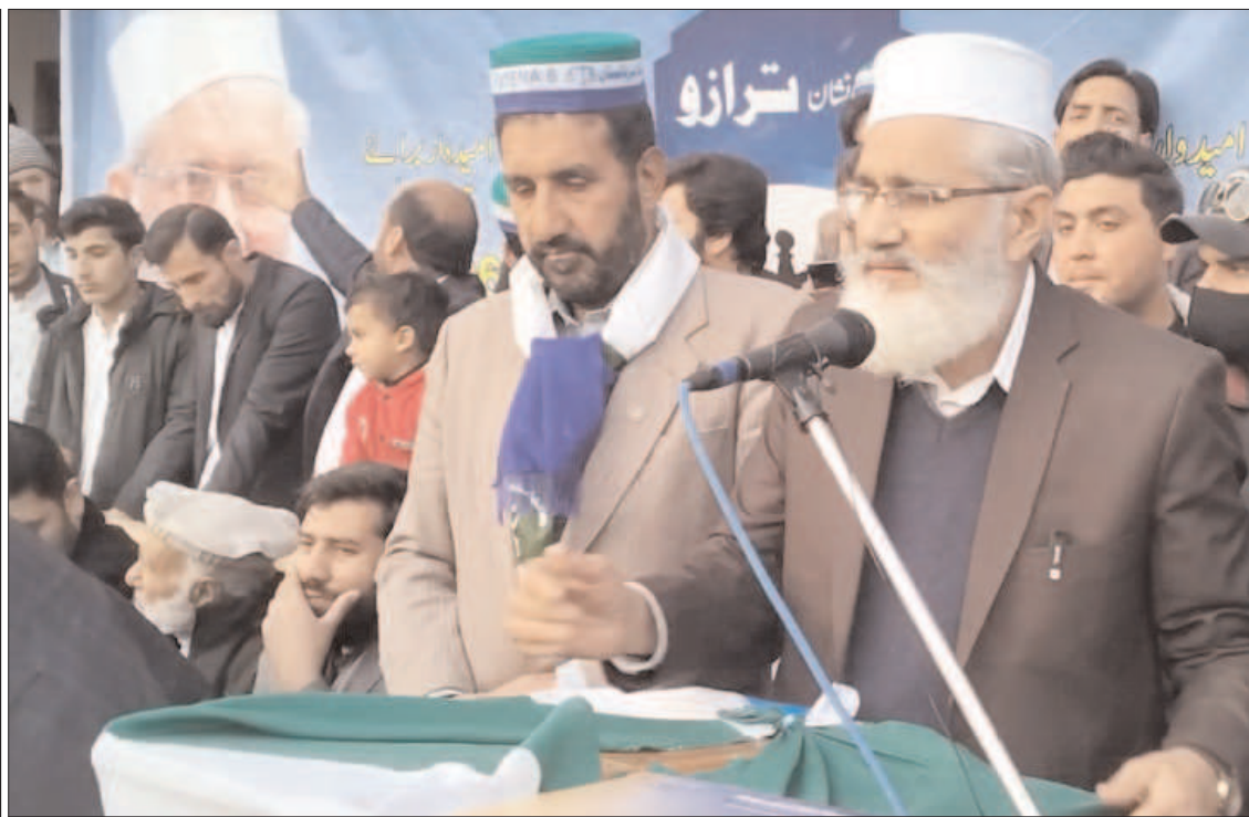
LOWER DIR: Chief of Jamat-e-Islami, Sirajul Haq addressing during workers' convention at Manial Maidan.

Drugs are being used in the city, which destroys the youth generation. He further said that the prices of food and daily household items are increasing in the district, but the administration is silent and all the poor are forced to eat bread once a day. He has demanded from the caretaker chief minister of Sindh and the DIG police Larkana division to take steps to control the rising inflation and unrest in Larkana district so that the troubled people can get peace.