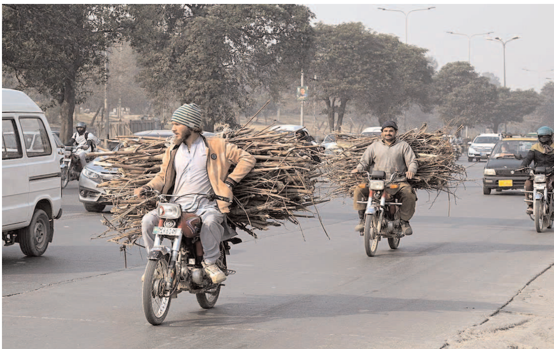
ISLAMABAD: Two motorcyclists on the way at Islamabad Expressway loaded with dry branches of tree for domestic use in Federal Capital.

Raising awareness among the general public about the mandate and scope of the institution's work through regular interaction with electronic, and print media and periodic awareness lectures will add value to these efforts.