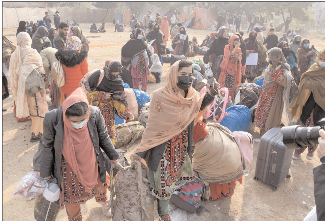
ISLAMABAD: Relatives of Balochistan missing persons carrying their luggage, going towards hometown after end of protest.