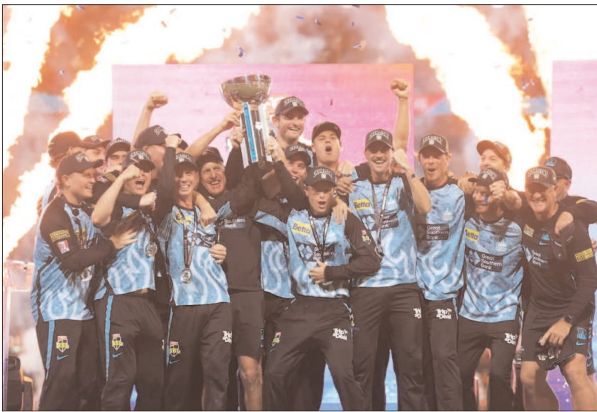
SYDNEY: Brisbane Heat celebrate with the BBL trophy.

considering the option of not flying to India. "I'm pretty devastated that Bash has had to go through this," Ben Stokes told reporters in Hyderabad. "When I first found the news out in Abu Dhabi, I did say we shouldn't fly until Bash gets his visa, but that was a little bit tongue in cheek," the England captain said. "I know it's a way bigger thing, doing that. That was probably just (my) emotions around the whole thing. "There was never a chance that we were not going to travel around this, but Bash knows he's had our full support." It is worth mentioning here that a late issuance of India Visa to Shoaib Bashir resulted in him failing to make a cut into England's Playing XI for the first Test against England.