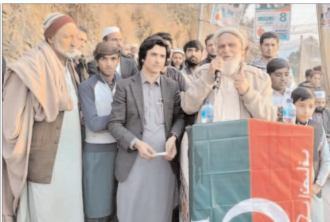
SHANGLA: Candidate for National Assembly Syed Fareen Khan addressing public gathering during election campaign.

He also directed to utilize resources for procurement of electoral material to designated places and necessary arrangement for safety of election staff. He also directed steps to ensure uninterrupted polling according to code of conduct issued by election commission.