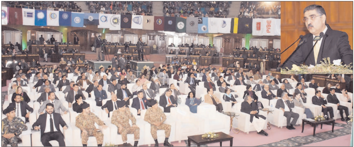
ISLAMABAD: Caretaker Prime Minister Anwaar-ul-Haq Kakar addressing Pakistan National Youth Convention 2024.