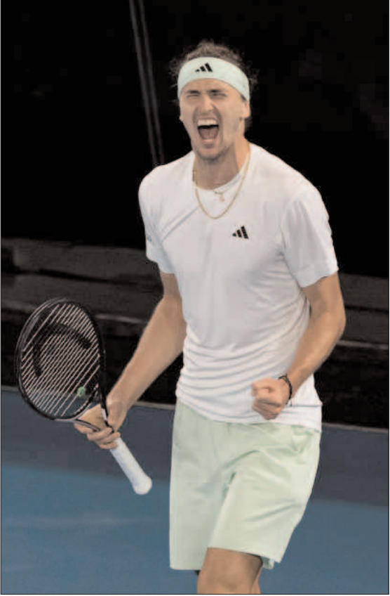
Alexander Zverev celebrates match point during the quarterfinals singles match.

M E L B O U R N E (Agencies): Carlos Alcaraz was knocked out of the Australian Open when Alexander Zverev held off a spirited comeback by the Spaniard to win an absorbing quarter-final at 01:20 local time.