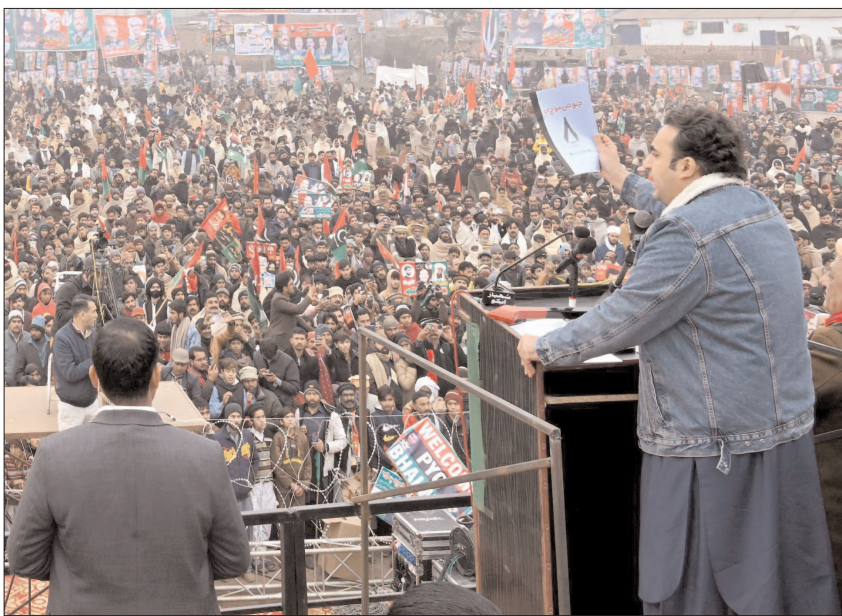
SARGODHA: Chairman Pakistan People's Party, Bilawal Bhutto Zardari addressing a gathering at Bhalwal.