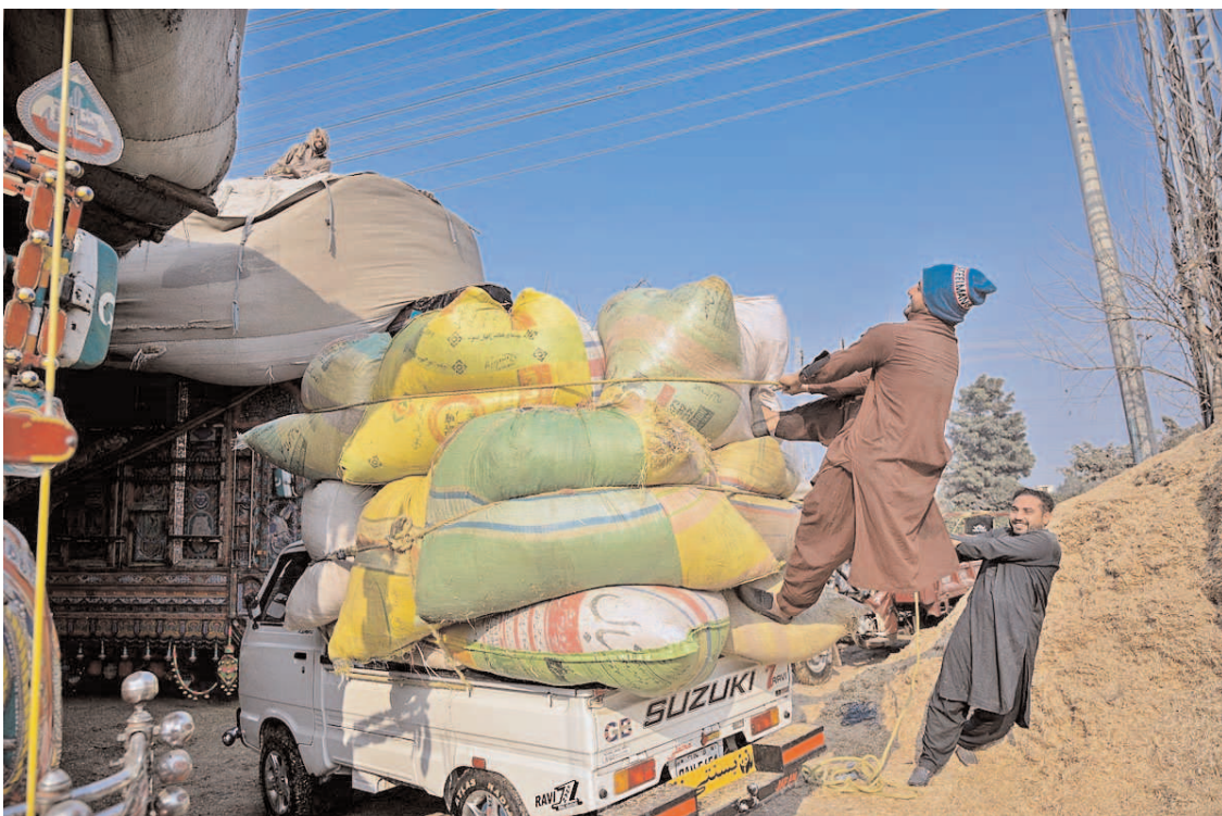
ISLAMABAD: Labourers busy in tiding the bags of chaff (husk from wheat) loaded on vehicle in Federal Capital.

RAWALPINDI (APP): Anti-Narcotics Force (ANF) while conducting an intelligence-based operation managed to recover 7500 intoxicated tablets, over one metric ton chemicals, 300 grams methamphetamine and arrested two accused, said an ANF Headquarters spokesman here on Wednesday. He informed that a drug dealer carrying intoxicated tablets was arrested from Peshawar's Changan Chowk. On pointation of the arrested accused, a sting operation was conducted against a drug dealer group. The group was involved in the processing and branding of the drugs made from methamphetamine. Another drug supplier was arrested as a result of the sting operation and 7500 intoxicated tablets (PSP) were seized from the possession of the arrested accused. During the operation, 300 grams methamphetamine and more than one metric ton liquid and powder chemicals were also recovered. The arrested suspects were engaged in marketing of the new types of intoxicated tablets in important cities across the country. They were especially targeting the youth in the educational institutions.