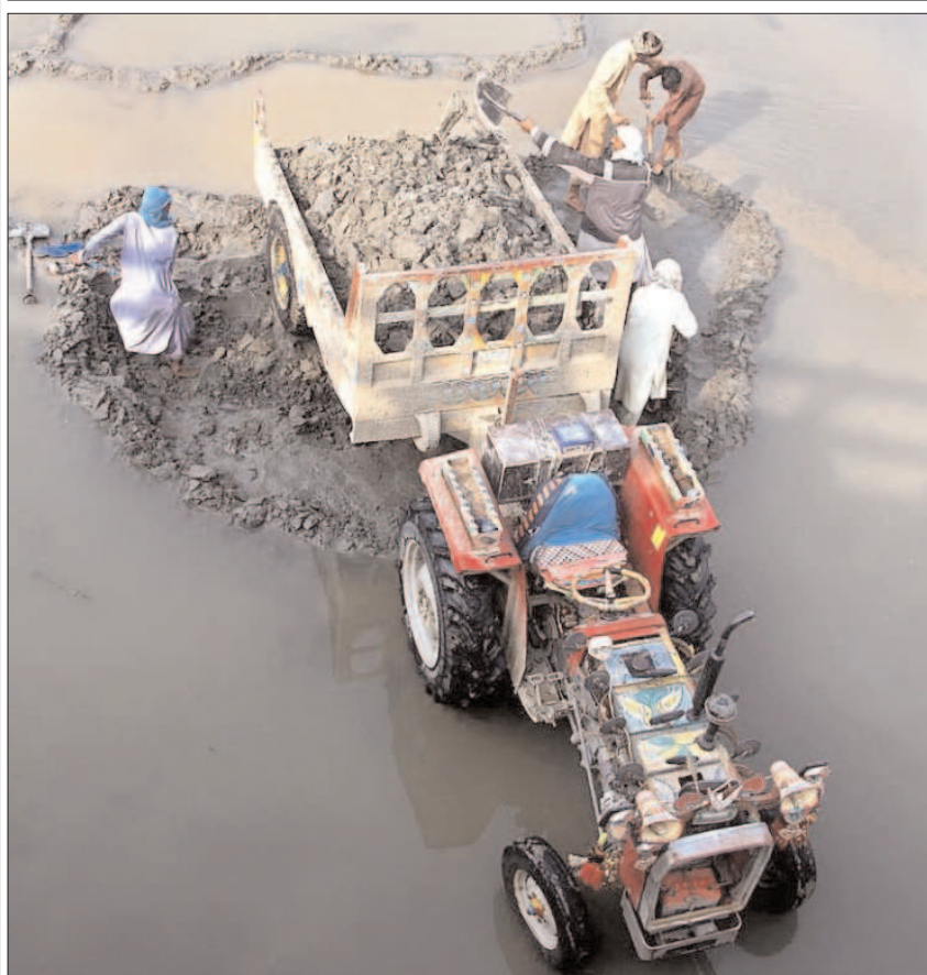
LARKANA: Labourers busy in loading sand on tractor trolley from Rice Canal.

environment and Climate change. The event also includes the exhibition of cultural stalls, musical events, fireworks, and more. Thousands of people from all walks of life witnessed the winter sports event. The purpose of the event is to promote winter tourism potential of Gilgit Baltistan through and tourism promotion events so as the GB may be branded as four season tourism hub globally.