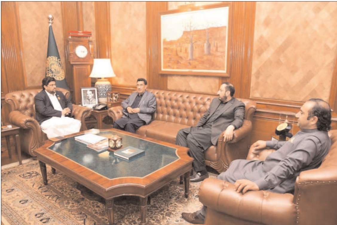
KARACHI: Governor Sindh Kamran Khan Tessori meeting a delegation of Ministers from Gilgit-Baltistan at the Governor House.