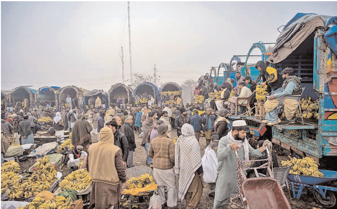
ISLAMABAD: Vendors displaying bananas for auction at Fruit and Vegetable market Pirwadhai in Federal Capital.