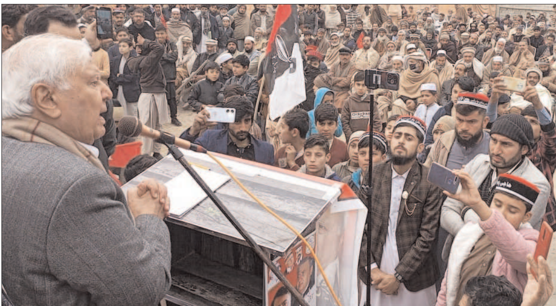
CHARSADDA: Qaumi Watan Party Chairman Aftab Ahmad Khan Sherpao addressing party workers in Doaba.

SIALKOT (APP): Former defence minister and senior leader PML-N Khawaja Muhammad Asif said the biggest court of the country will be held on February 8, and people will give their verdict who will serve them during the next five years. Addressing the PML-N youth convention in Union Council Rangpura on Friday night, he said February 8 would be the victory day of Nawaz Sharif with the power of people's vote. PML-N candidate from NA-71 constituency Kh Asif said people would be judge on Feb 8 to decide would served them in the past and who destroyed the country.