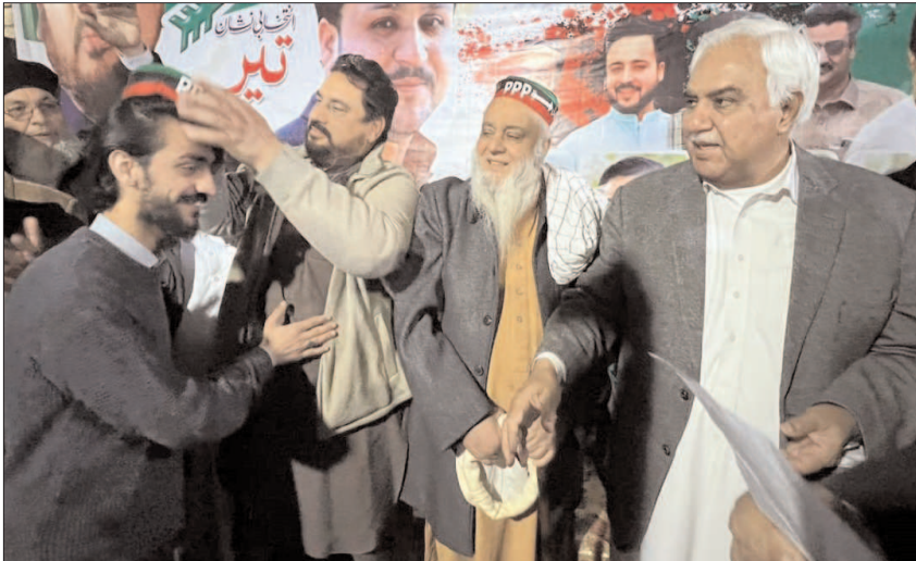
PESHAWAR: PPP candidates wearing party caps to newly joining members during public gathering.

PESHAWAR: Alkhidmat Foundation opened a vocational and skill development centre for women in Chamkani, a suburban area of provincial metropolis. The centre would provide dress-making training, beautician and computer courses to females aiming for their empowerment and create employment opportunities for them. The skill development centre has all the needed facilities and is registered with Trade Testing board.