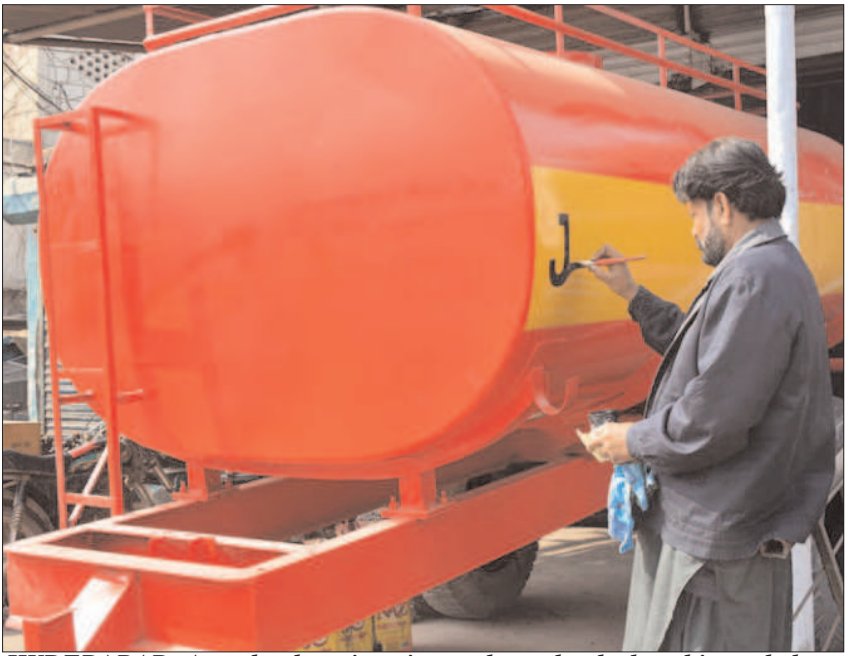
HYDERABAD: A worker busy in paint on the tanker body at his workplace.