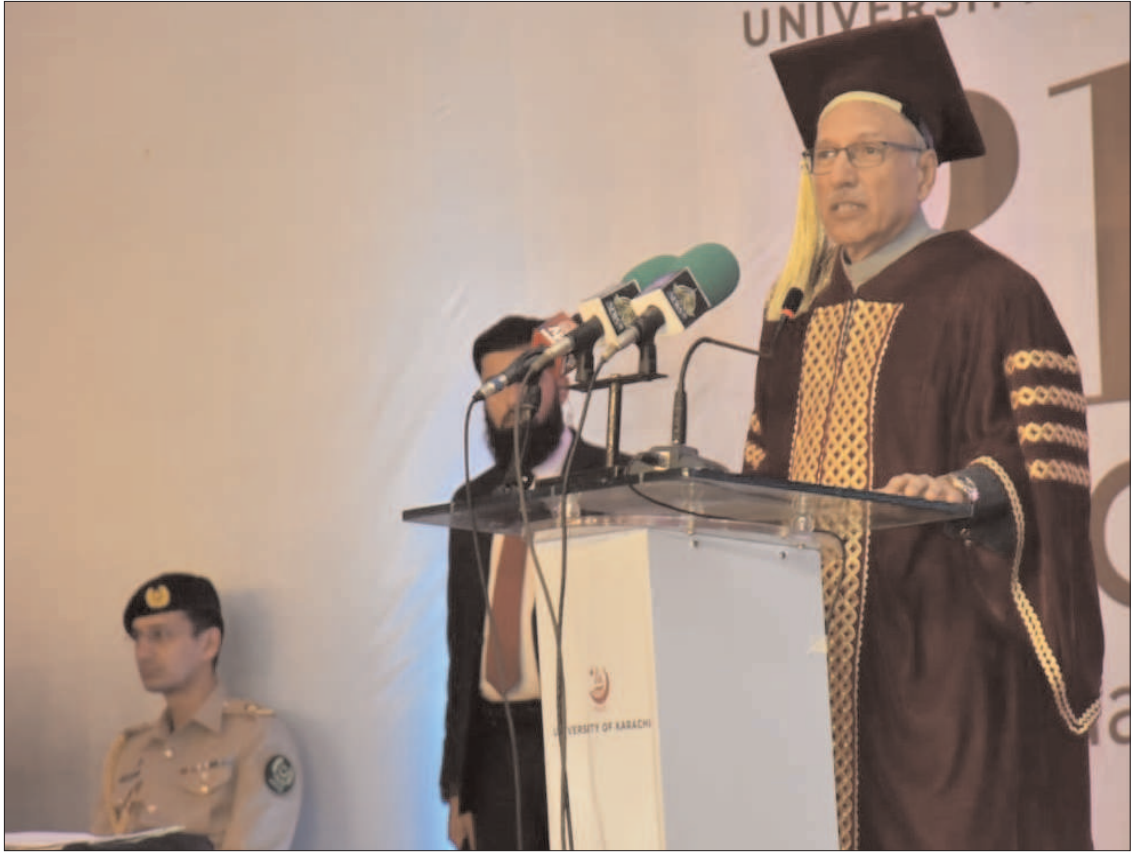
KARACHI: President Dr. Arif Alvi addressing the 31st convocation ceremony of University of Karachi.