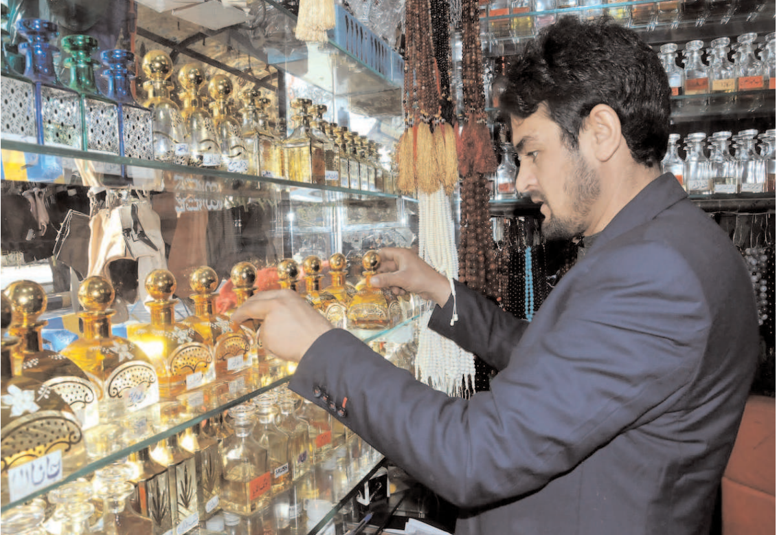
ISLAMABAD: A shopkeeper arranging and displaying perfumes to attract the customers at his shop in the Federal Capital.