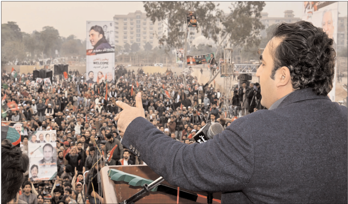
PESHAWAR: Pakistan People's Party Chairman, Bilawal Bhutto Zardari addressing public gathering.

Vol. XXXIXI No. 06 Regd. No. 241 RAJAB 16 1445 -- SUNDAY, JANUARY 28 2024 PESHAWAR EDITION 12 PAGES PRICE. 30