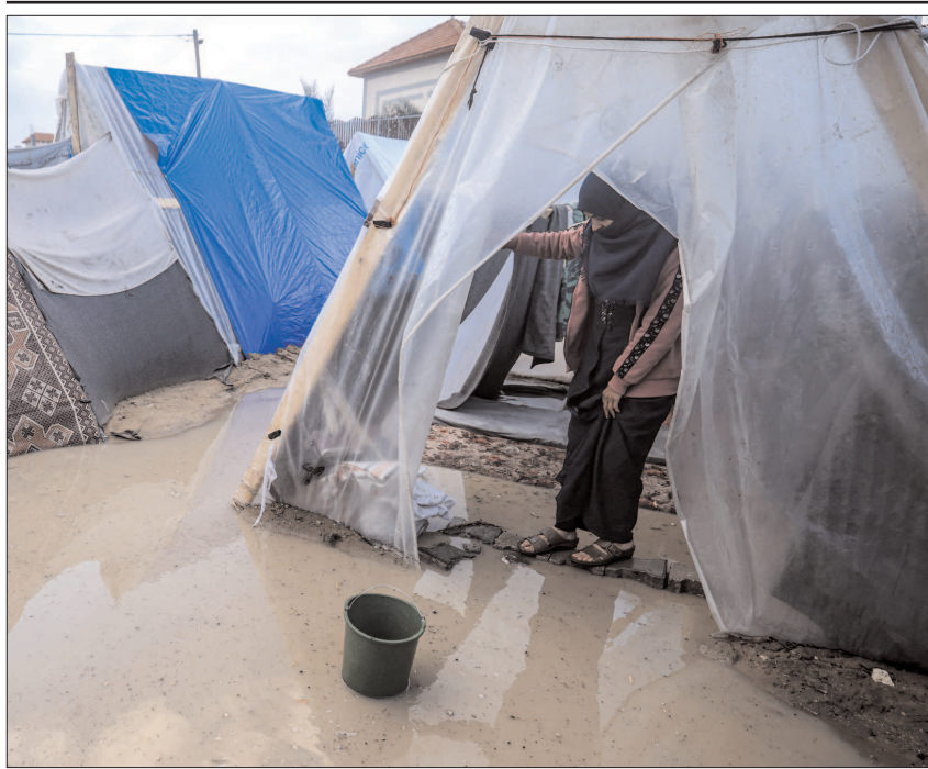
GAZA: A displaced Palestinian woman stands at the entrance of a tent flooded by heavy rain in Rafah.

The Pakistani and Iranian diplomats joined their duties in Tehran and Islamabad, respectively, after returning to the capitals late on Friday. The neighbouring countries had shortly halted diplomatic ties, recalling their envoys, after an "unprovoked" cross-border attack from Iran, which followed the "precision military strikes" on terrorists' hideouts in Sistan-Baluchestan by Pakistan as a response. Returning to Tehran, Amb Muddasir had pledged stronger ties with Iran on Pakistan's behalf. — Agencies