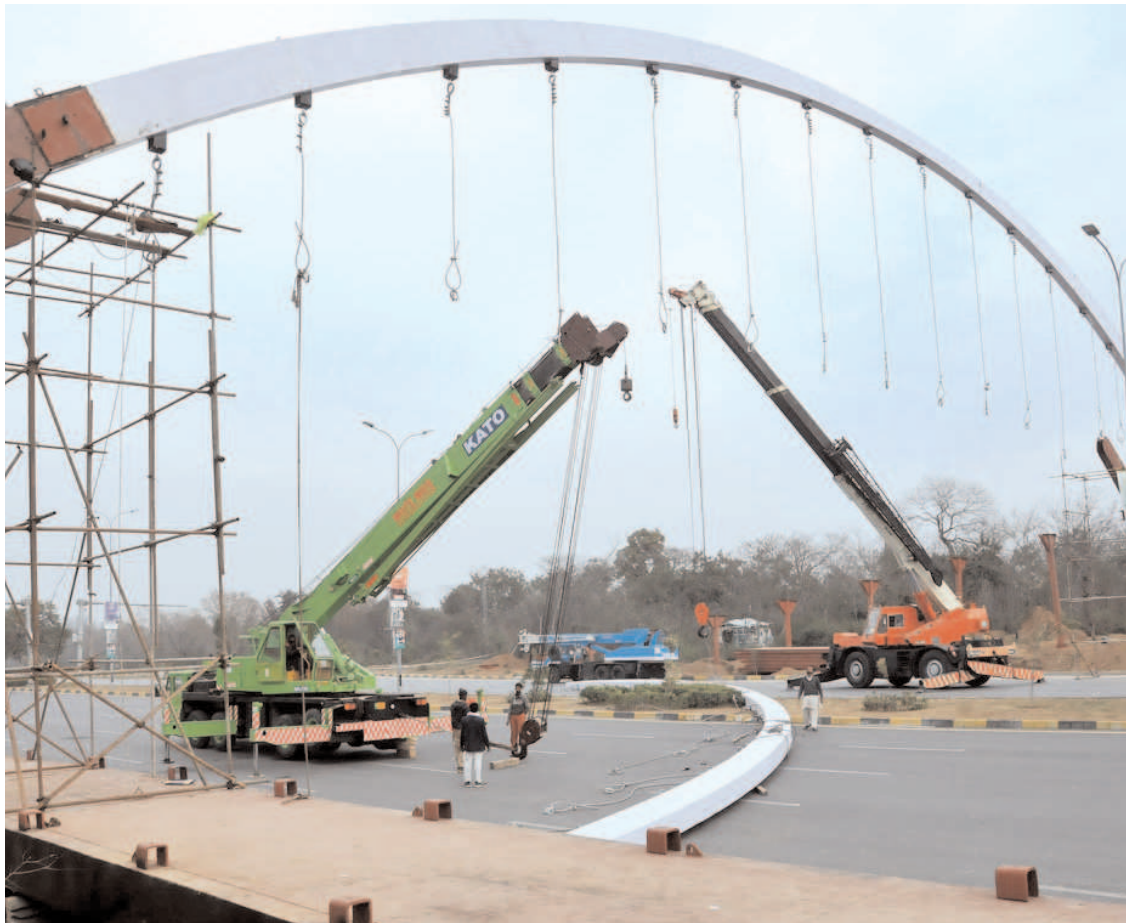
ISLAMABAD: CDA workers busy installing pedestrian bridge with the help of cranes at Srinagar Highway in the Federal Capital.

ISLAMABAD (APP): China's telecommunication industry logged steady expansion in 2023, driven by emerging businesses, official data showed. The combined business revenue of firms in the sector totaled 1.68 trillion yuan (about 236 billion U.S. dollars) last year, rising 6.2 percent year on year, according to the China Ministry of Industry and Information Technology. Emerging sectors such as big data, cloud computing and the Internet of Things continued to post strong performances, with total revenue climbing 19.1 percent year on year in 2023, China.org reported.