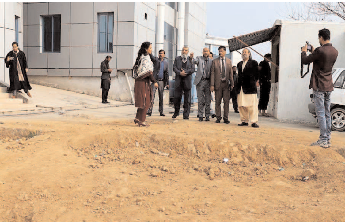
ISLAMABAD: Federal Minister Madad Ali Sindhi Visited the Federal Government College of Home Economics and Management Sciences.

The official source said, "Pakistan Railways will use all the social media platforms including print, electronic media, twitter, Facebook, poster and pamphlets to create an awareness among the citizens about a safe train journey." He said the department has also asked all the divisional superintendents to ensure checking of luggage of passengers at entry points with scanners, metal detectors and walkthrough gates.