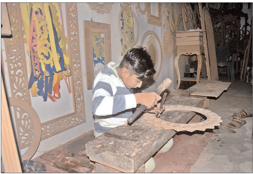
LAHORE: Young artisan busy carving design on wood at his workshop.

He asked people if they see adulterated items being made somewhere, report it to PFA on its 1223 helpline.