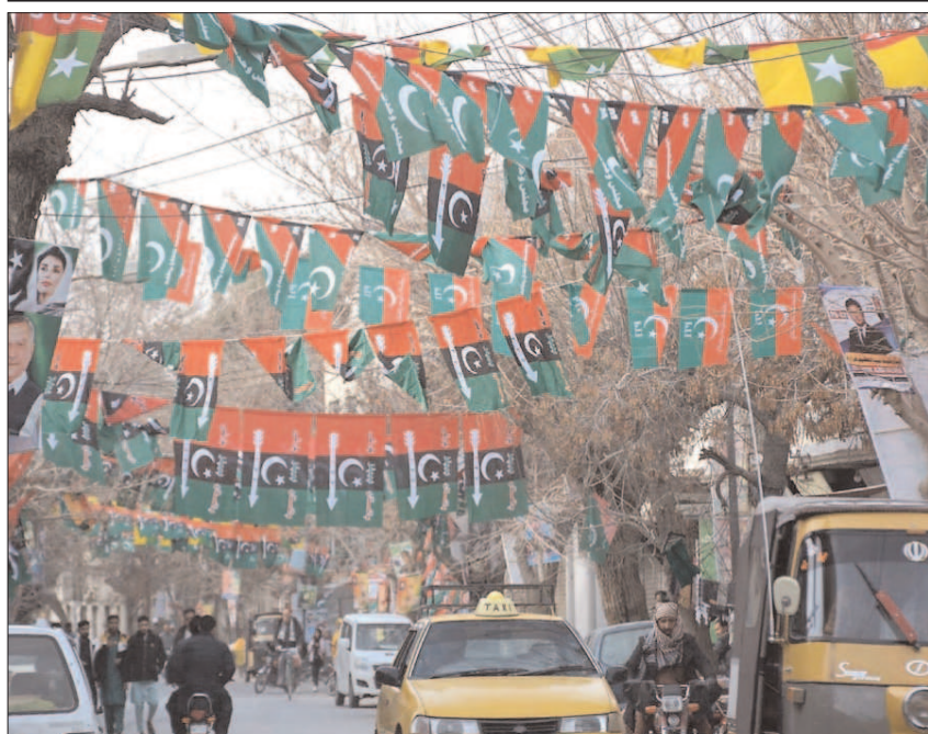
QUETTA: A view of flags of different political parties on the road for upcoming elections.

He appreciated sub divisional officers of Bannu (urban) and Naurang sub divisions for result oriented actions against electricity stealers. Later he inspected the PESCO circle offices' buildings and vehicles. On the occasion, the employees' leaders demanded construction of a new building for offices and replacement of old vehicles with new ones.