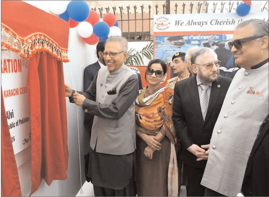
KARACHI: President Dr. Arif Alvi inaugurating Sundas Foundation Centre for providing blood and hematological services to patients.