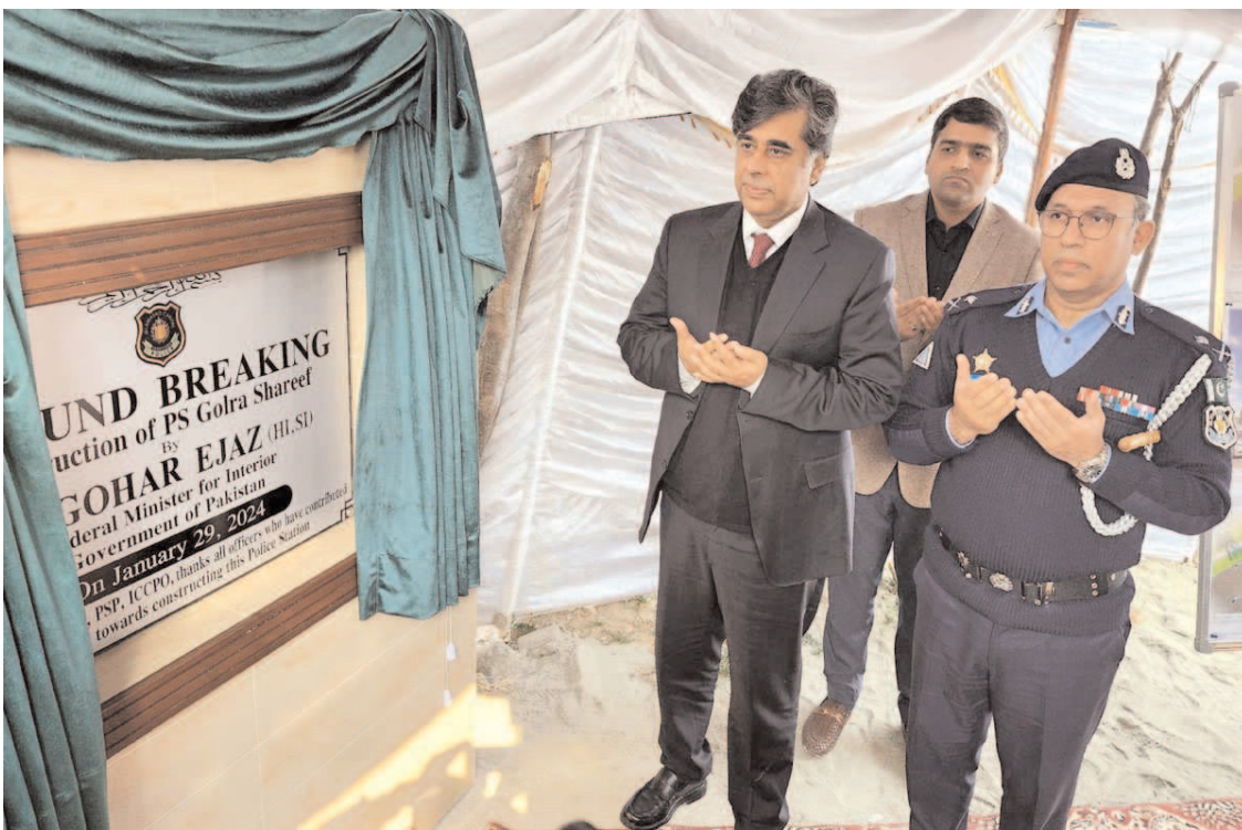
ISLAMABAD: Caretaker Interior Minister Dr. Gohar Ejaz offering dua during ground breaking ceremony of new building of Police Station Golra.

ISLAMABAD (APP): Pakistan Telecommunication Authority (PTA) along with the Federal Investigation Agency (FIA) conducted a successful raid against the grey trafficker at NES-PAK Housing Society, Lahore. During the raid, 188 Active SIMs, nine VoIP Gateways (32 ports), 05 Laptops and 2 Network Switches were recovered. Two persons have been arrested at the spot, said a news release issued here on Monday. FIA is further investigating the matter. The successful raid against the illegal setup is a part of PTA's efforts to prevent the circumvention of the Multi-Finger Biometric Verification System (MBVS) and is made possible because of continuous monitoring, commitment and persistent efforts by PTA in curbing the menace of grey traffic thus curtailing the loss to the national exchequer.