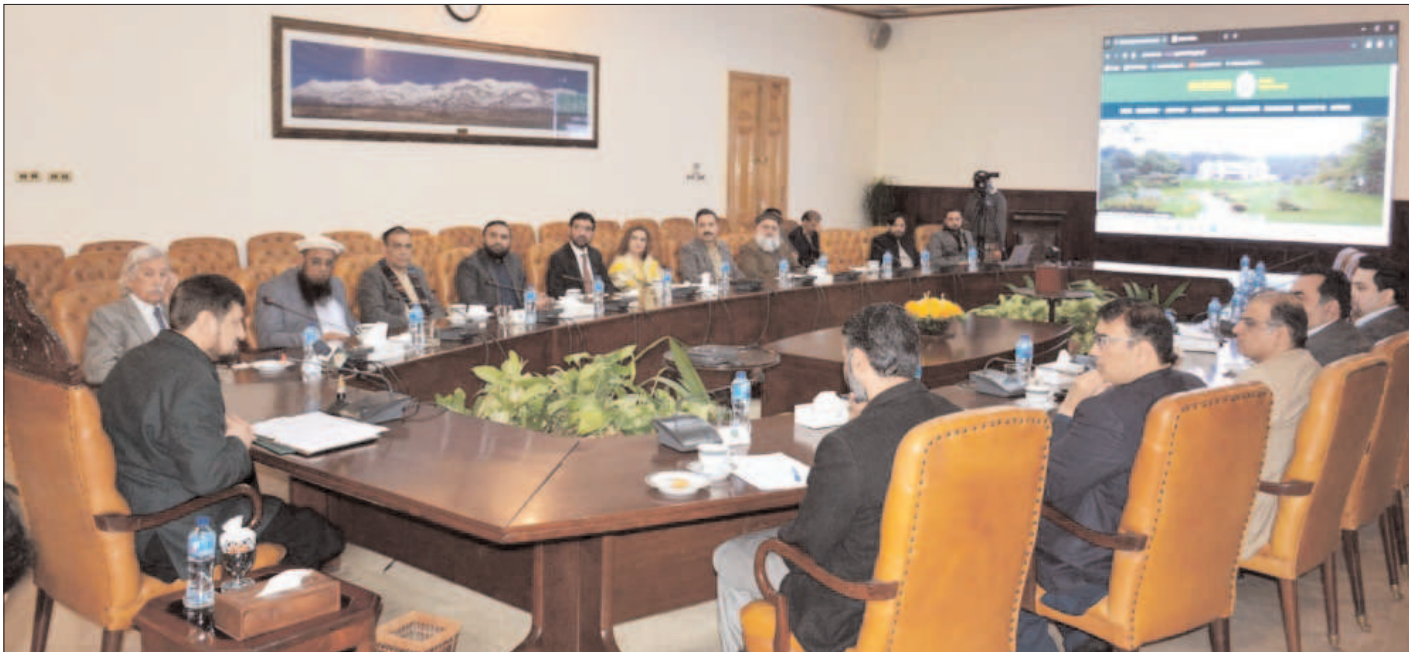
PESHAWAR: Governor Haji Ghulam Ali addressing a ceremony after inaugurating the website of Governor Secretariat in Peshawar.