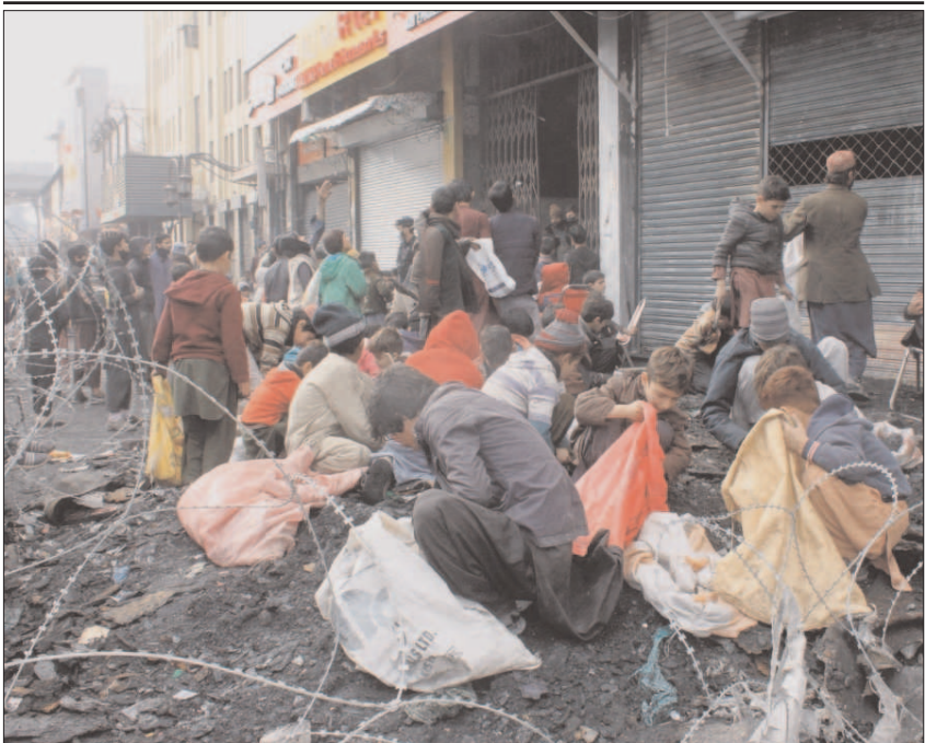
PESHAWAR: Children searching valuable items after fire incident in Times Centre.

The maximum and minimum temperatures recorded in centigrade at different stations of Khyber Pakhtunkhwa were Peshawar 18/09, Chitral 12/03, Timergara 10/03, Dir 09/01, Mirkhani 11/01, Kalam 04/06, Drosh 10/01, Saidu Sharif 14/03, Pattan 16/06, Malam Jabba 02/04, Takht Bhai 16/09, Kakul 17/01, Balakot 14/08, Parachinar 08/00, Bannu 22/05, Cherat 13/02.