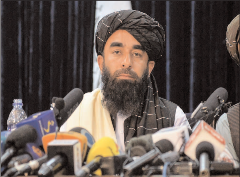
KABUL (Pajhwok): The Islamic State, also known as Daesh, no longer poses any threat to Afghanistan, the interim government said on Monday.

Afghan forces had significantly beefed up border security. Zabiullah Mujahid made the statement while commenting on an Indian newspaper's report regarding Pakistan's attempt to pave the way for ISIS fighters' entry into Afghanistan. The Sunday Guardian quoted TTP sources as saying the Pakistan army clashed with Afghan forces on Jan. 20 to enable Daesh terrorists to steal into Afghanistan. In reaction to the report, Mujahid said: "Afghanistan's borders are secure. Our security forces are alert and prepared to deal with any kind of threat ..." IEA officials, including the defence minister, say the militant outfit has been vanquished in Afghanistan.