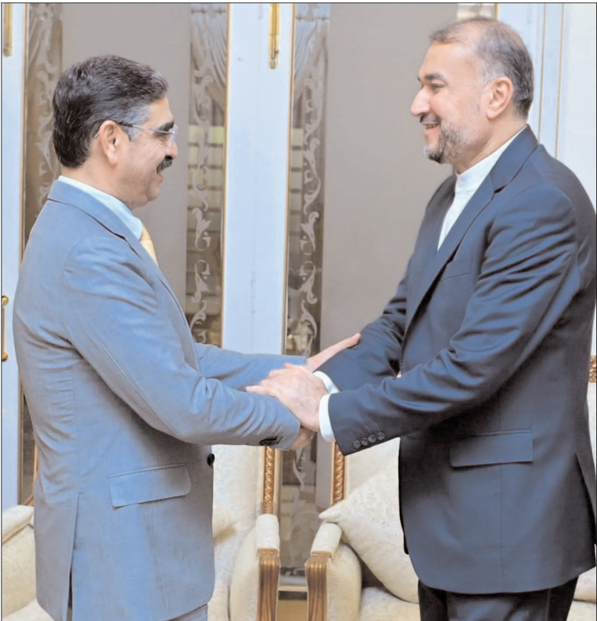
RAWALPINDI: Foreign Minister of Iran, HE Amir Abdollahian called on Caretaker Prime Minister Anwaar-ul-Haq Kakar.