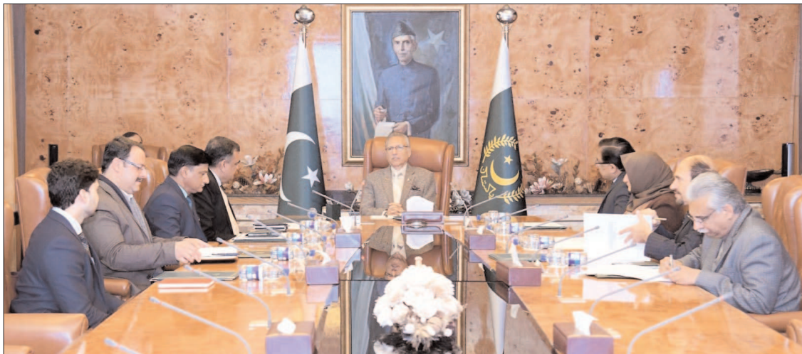
ISLAMABAD: President Dr. Arif Alvi being briefed about the role and performance of National Book Foundation, at Aiwan-e-Sadr.