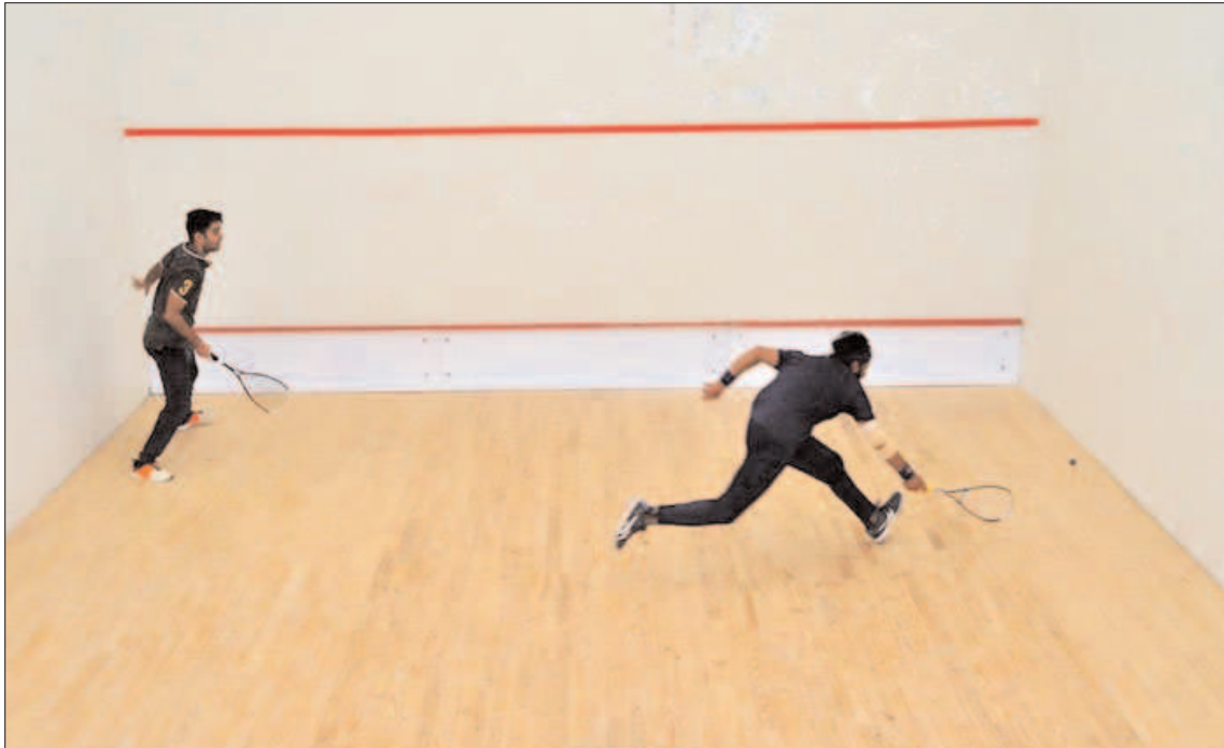
SARGODHA: Players in action during Sargodha Squash League organized by Sargodha Division Squash Association at Squash Complex Sports Stadium.