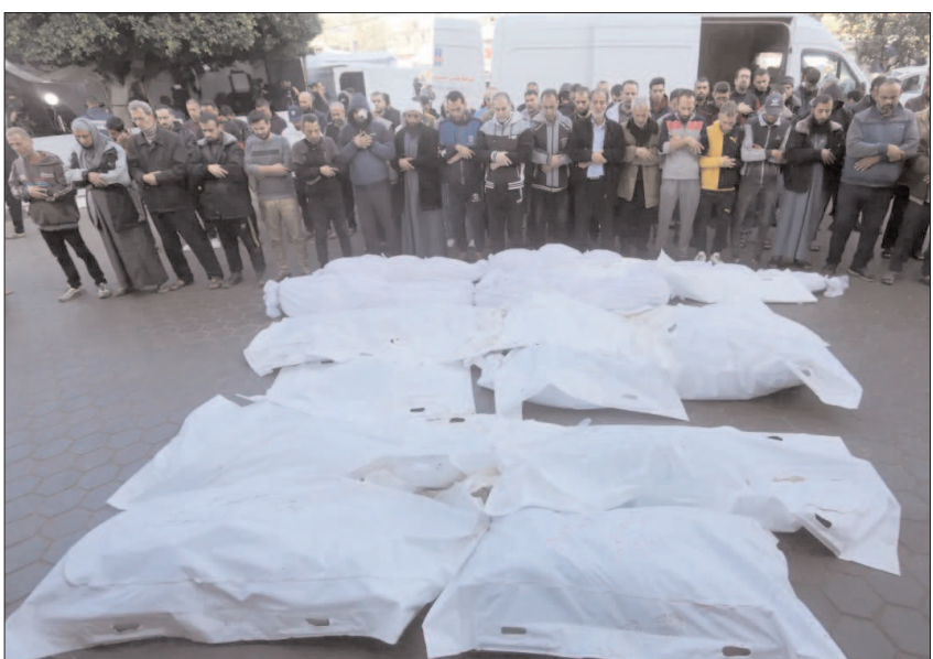
GAZA: People and relatives offering funeral prayer of their loved ones after bodies were taken from Al-Aqsa Martyrs Hospital's morgue after Israeli attacks.