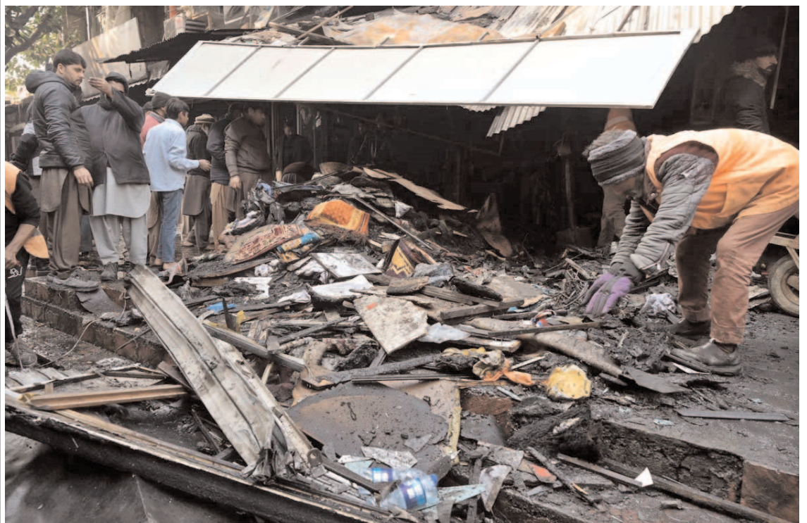
ISLAMABAD: CDA workers busy in operation to extinguish after fire at Aabpara market.

"In case of fog and smog, people are advised to take some precautionary measures and vaccinate their children", he added. The expert also suggested plenty of rest, warm beverages, steam baths, or the use of humidifiers in houses for air moisture and timely consultations with doctors. Replying to a question, he mentioned that Pneumonia begins with symptoms of fever, cough and difficulty breathing. Not only adults can get pneumonia, but children and the elderly can also experience it. Interim Minister for Primary and Secondary Healthcare and Population Welfare Dr Jamal Nasir added that smog was an additional factor in the increased respiratory diseases.