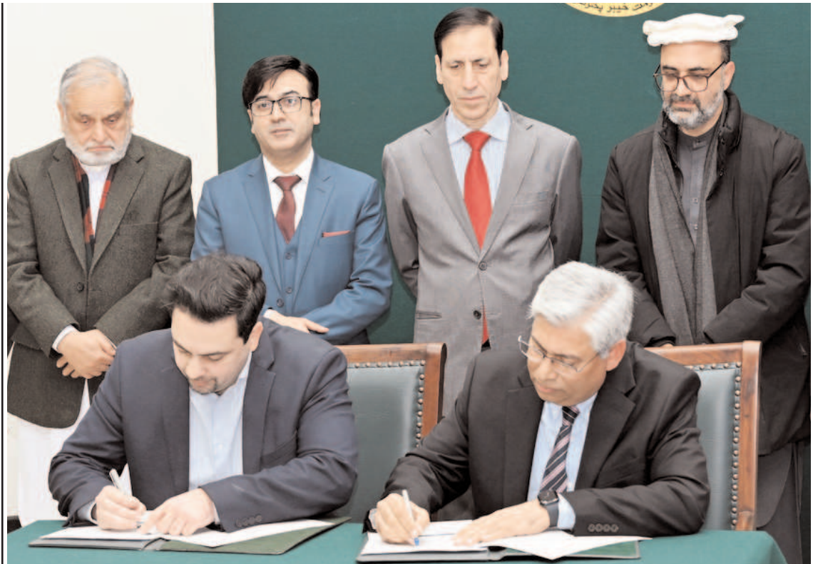
PESHAWAR: Caretaker Chief Minister Khyber Pakhtunkhwa Justice (R) Syed Arshad Hussain Shah witnessing MoU signing between KPITB and Pak-Austria Fachhochschule Institute for implementation of youth training and employment program.