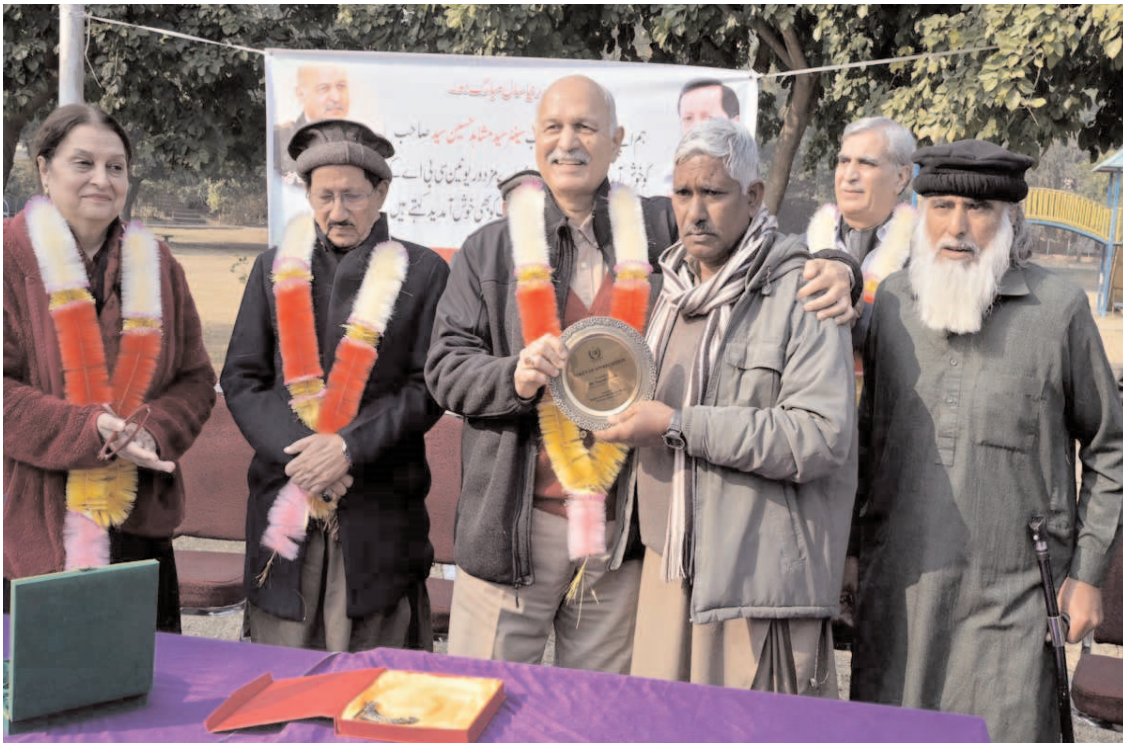
ISLAMABAD: Chairman Parliamentary Committee on China-Pakistan Economic Corridor (CPEC), Senator Mushahid Hussain Sayed presenting a shield to CDA sanitation workers during the farewell party at E-7 Park.

ISLAMABAD (APP): Dense foggy conditions, continuing in Punjab, plains of Khyber Pakhtunkhwa and upper Sindh in coming days, as per the Pakistan Meteorological Department (PMD)'s forecast, can cause health issues among the citizens. The PMD in its advisory issued on Wednesday warned that exposure to the foggy environment can cause health issues among the citizens. Due to the stable atmosphere, prevailing dense foggy conditions will continue over Punjab including Islamabad, plains of Khyber Pakhtunkhwa and upper Sindh. A rain-bearing westerly system is likely to enter Balochistan on January 04 and may affect parts of Balochistan till January 05. Under the influence of this weather system, light to moderate rain/wind/thunderstorm with snowfall over hills is expected in Chaghi, Quetta, Chaman, Ziarat, Qilla Abdullah, Qillah Saifullah, Loralai, Pishin, Mastung, Zhob, Kalat, Musa Khel, Kharan, Harnai, Sibbi, Noshki, Khuzdar and Makran coast on January 04 and January 05.