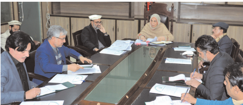
PESHAWAR: Caretaker Minister Justice (R) Irshad Qaisar presiding over a meeting of PHA Mega City.