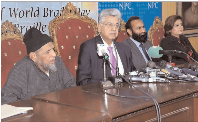
ISLAMABAD: Caretaker Federal Minister for Information and Broadcasting addressing an event organized by Pakistan Disabled Foundation for special persons at National Press Club.