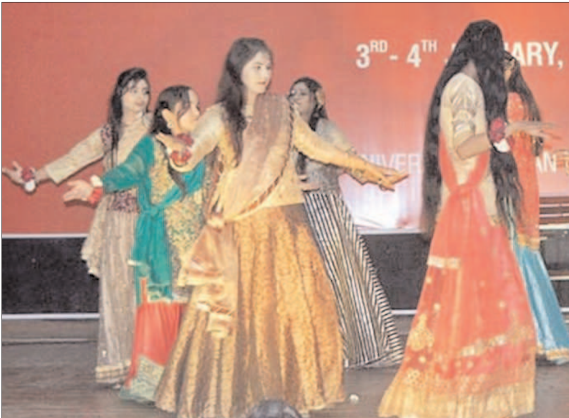
MULTAN: Students performing in tableau during the 10 Years celebrations of The Women's University.

MULTAN (APP): Commissioner Multan division Engr Amir Khattak Thursday directed the deputy commissioners to begin inspection of all petrol pumps in their respective districts and penalize those using flawed or willfully tampered measurement equipment to fleece the people. Chairing a performance review meeting, the Commissioner said that petrol pumps involved in giving lesser quantity of petrol to motorcyclists and four wheelers would be penalized as per law.