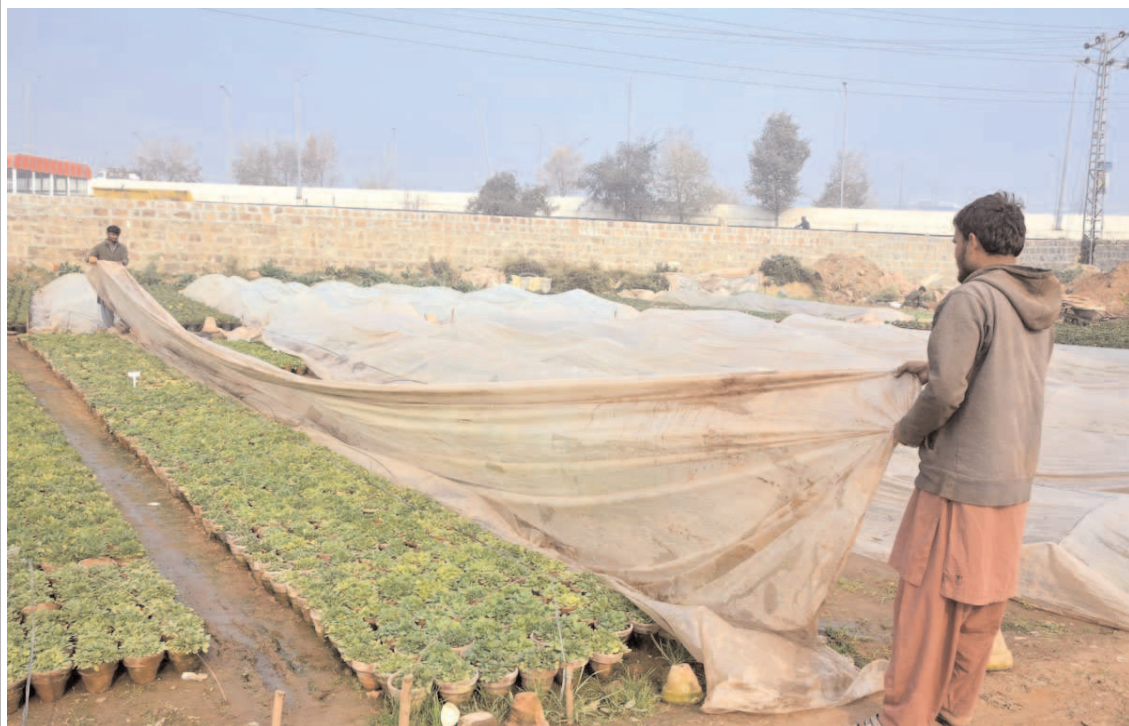
ISLAMABAD: Nursery workers busy in covers plants with plastic sheet to protect from cold weather at Peshawar Mor in Federal Capital.

vide the latest education facilities." PAVH also emphasized the importance of organizing workshops and courses to train employees, teachers, and students in the government and private sectors, not only in urban cities but in far-flung areas where these people are still not recognized. "The day's goal was to enable blind individuals with determination who are patrons of these libraries to access and enjoy reading these stories and novels," he added. Replying to a query, he said, "Braille represents alphabetical and numerical symbols using six touch-sensitive dots to represent each letter and number, including music, mathematics, and science symbols."