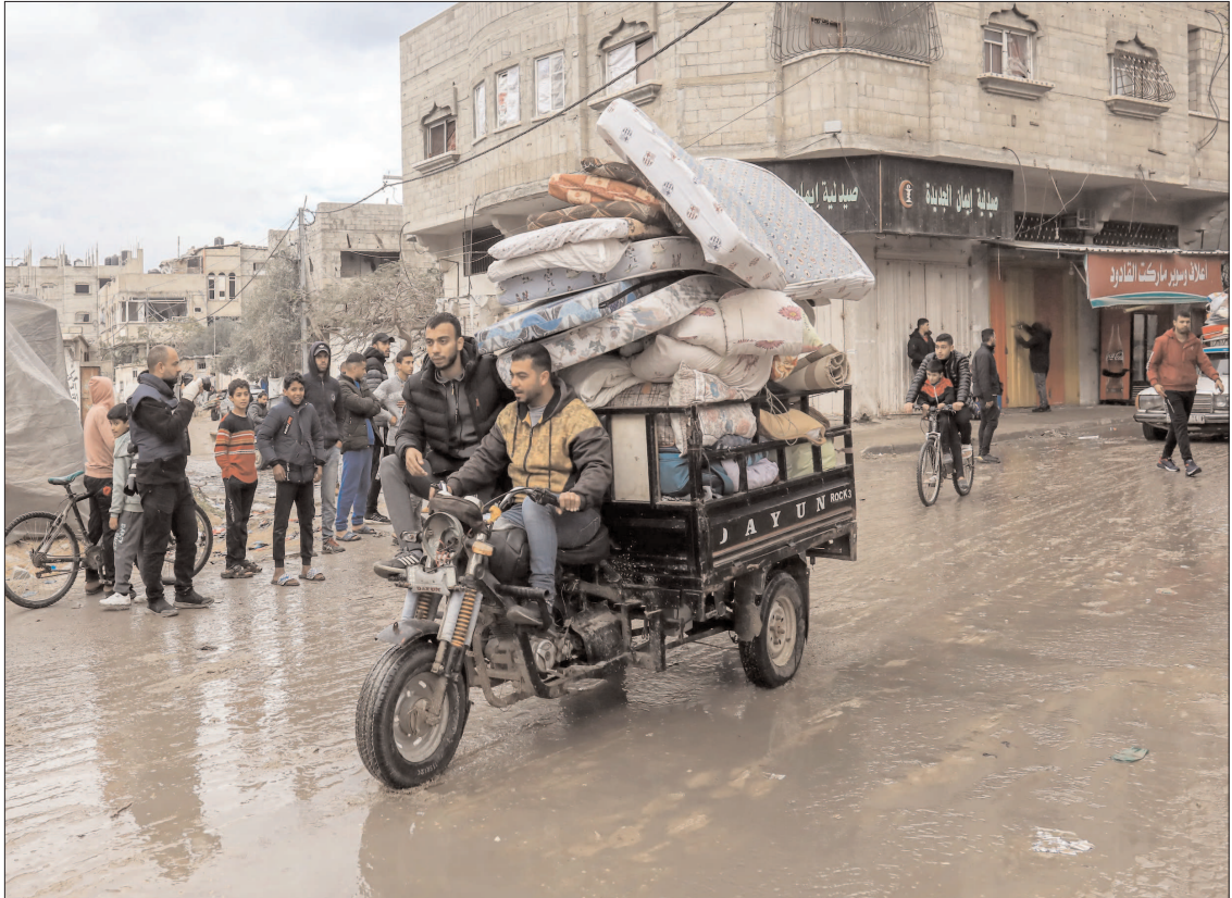
GAZA: Displaced citizens carrying their belongings as they once again flee to the south following a night of heavy bombardment by Israeli forces.