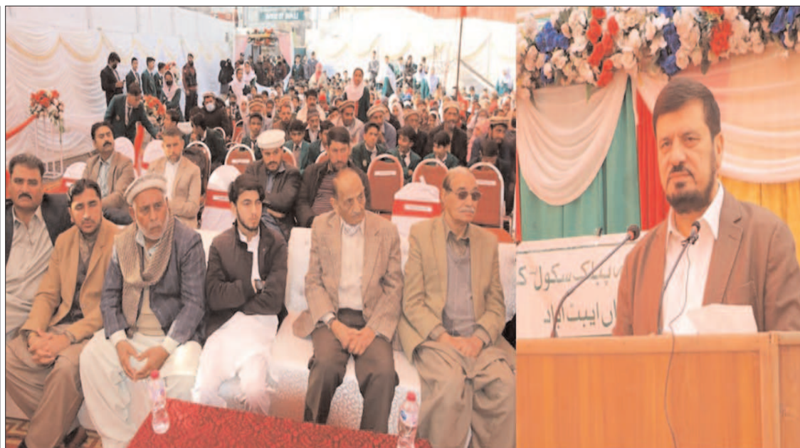
ABBOTTABAD: Governor Khyber Pakhtunkhwa Haji Ghulam Ali addressing the annual day ceremony at Pak Saudia Public School and College.

Chief Secretary also directed the Health Department to ensure that children are administered polio drops at all railway stations and bus terminals. He also instructed education department officials to ensure that polio drops were administered to children in both private and government schools during the campaign. He also appreciated the cooperation of local government representatives during the polio campaign.