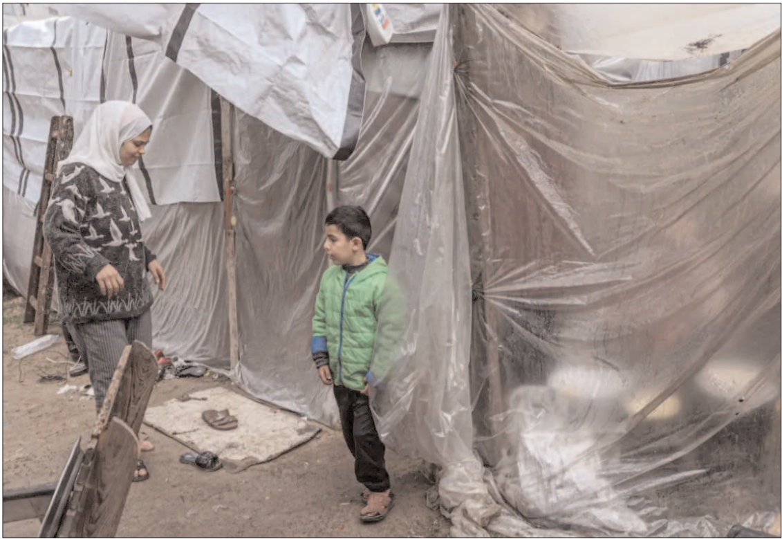
GAZA: Displaced Palestinians shelter behind plastic sheets in the zoo in Rafah.