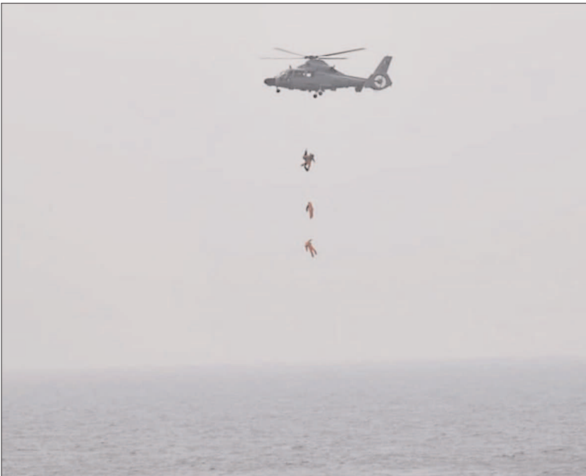
KARACHI: Search and rescue operation conducted during exercise Barracuda-XII in Arabian Sea under basupicbes bof Pakistan Navy and Pakistan Maritime Security Agency.

The sea phase of BARRACUDA XII reinforces the commitment of all involved national and international stakeholders to uphold international maritime regulations. As the curtains draw on this successful endeavor, the lessons learned and relationships built during this exercise will serve as a foundation for continued cooperation in addressing future challenges in maritime safety and environmental protection.