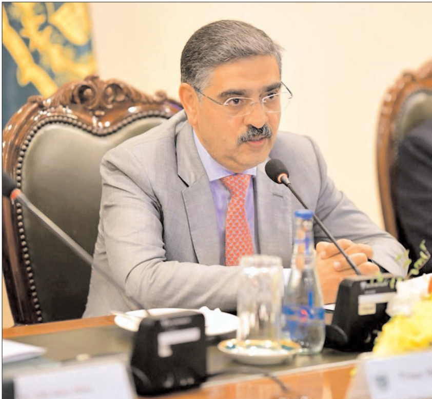
ISLAMABAD: Caretaker Prime Minister Anwaar-ul-Haq Kakar addressing 'Envoys Conference'.