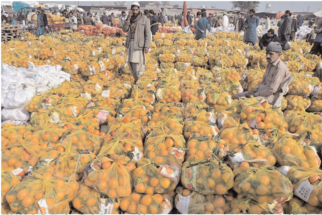
ISLAMABAD: Vendors displaying seasonal fruit oranges to attract customers at Islamabad Fruit and Vegetable Market.

He also suggested the ministry to devise strategies for promotion of Pakistani products, calling upon trade officers to take advantage of opportunities offered by China-Pakistan Economic Corridor (CPEC). He said that previously, foreign investors mostly poured money into the sectors which did not pose a risk to their profit margins due to rupee depreciation such as the power sector. It is hoped that Pakistan's economy will now gain growth momentum, which should encourage foreign investors to invest in new projects, he added.