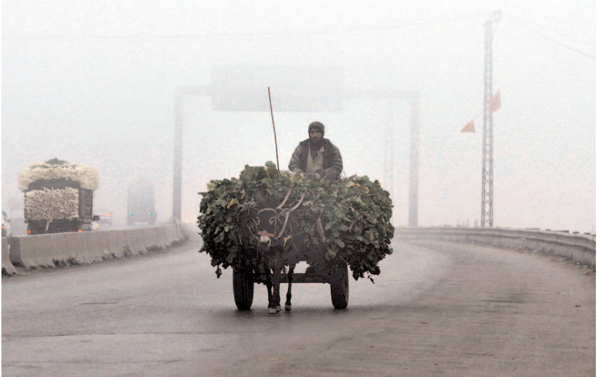
PESHAWAR: Donkey cart holder on way carrying green fodder for delivery purpose at Ring Road.

and also inquired about the attitude of the service delivery center staff. The visitors expressed their satisfaction about the behavior of the staff and other services provided there.