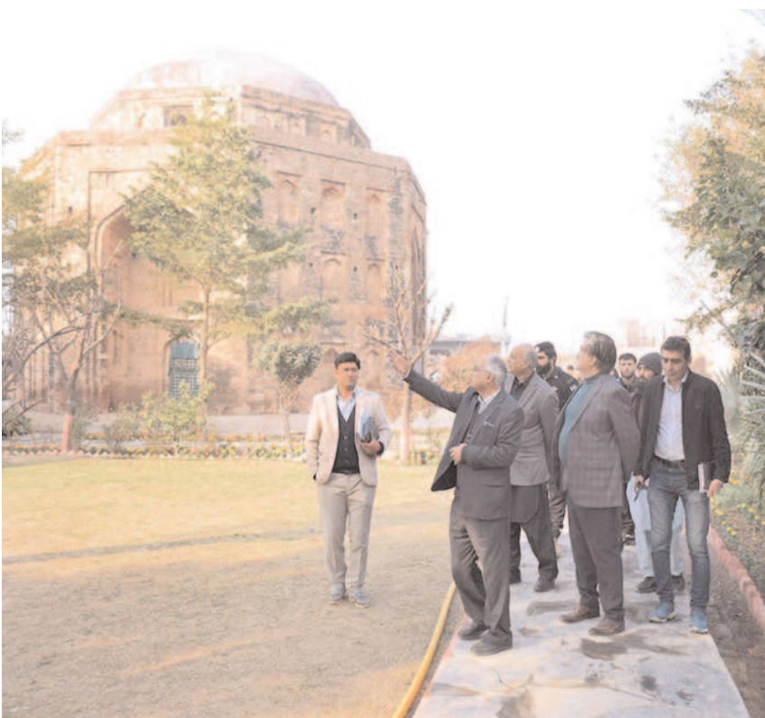
RAWALPINDI: Caretaker Federal Minister for National Heritage and Culture Jamal Shah visits Rawat Fort to revive conservation work.

The event concluded with children presenting various poems and songs in Turkish and Urdu. Parents appreciated the organizers and trainers for providing such a wonderful opportunity.