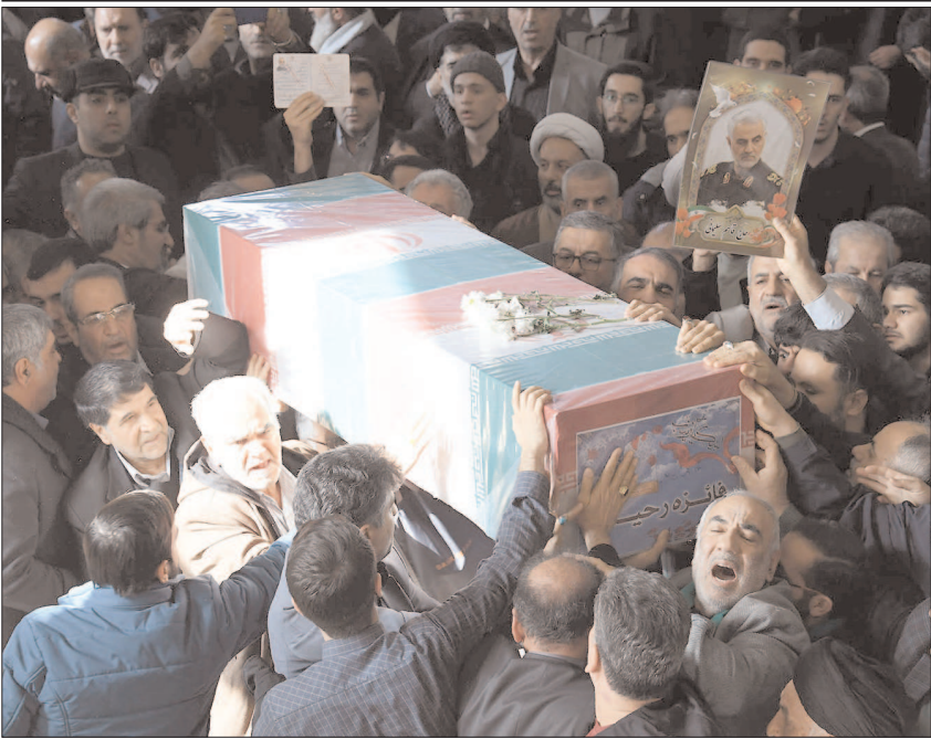
TEHRAN: People carrying the coffin of Kirman blasts victim for funeral prayer.

The Chief Minister made it clear that with the enhancement of Medical and Dental seats, the set criteria and quality of education would not be compromised at any cost.