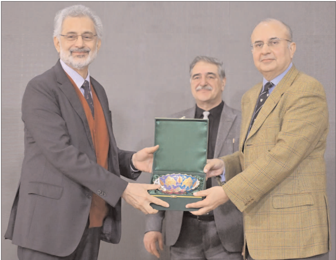
ISLAMABAD: Justice Syed Mansoor Ali Shah presenting a copy of souvenir to Chief Justice of Pakistan, Qazi Faez Isa in conference at Federal Judicial Academy.