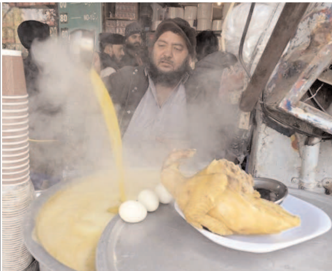
ISLAMABAD: A vendor displaying chicken yakhni to attract the customers at his roadside setup during winter season in Federal Capital.

Meanwhile, travelers, accompanied by families primarily arriving from various districts of Central Punjab and northern Khyber Pakhtunkhwa, were observed in significant numbers in the valleys of Kalam, Madain, Bahrain, and Malam Jabba in Upper Swat. This occurred amidst light to moderate rains and snowfall, resulting in a notable drop in temp.