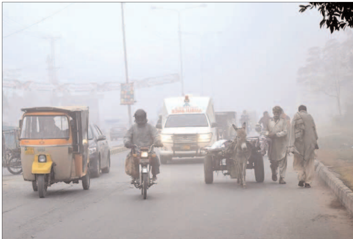
LAHORE: A view of dense fog covering surrounding areas of Road during morning time.

Email: careers.peshawar@shaukatkhanum.org.pk