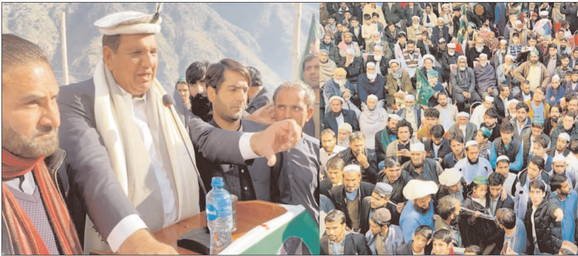
SHANGLA: PML-N leader Engineer Amir Muqam addressing a public gathering at Bisham.

BAHAWALNAGAR (INP): One person was killed in a road accident in Bahawalnagar on late Friday night. According to details, the accident occurred at the Chishtian Road in Bahawalnagar where a speeding car hit a bicycle from behind, killed one person on the spot. Police and rescue teams reached the spot and shifted the dead body to hospital.