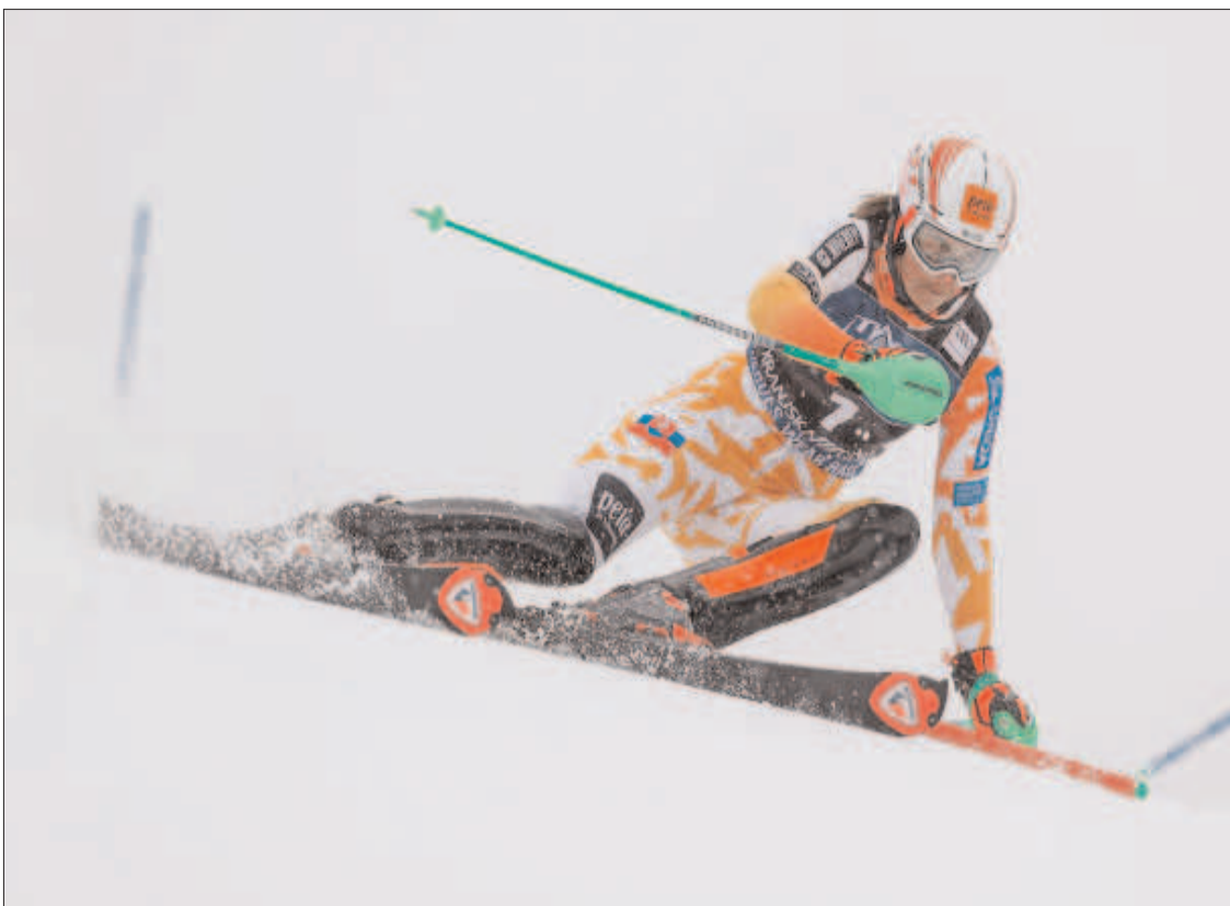
KRANJSKA GORA: Petra Vlhova of Team Slovakia in action during the Audi FIS Alpine Ski World Cup Women's Slalom.

NEW DELHI (Agencies): The Board of Control for Cricket in India (BCCI) on Sunday announced a 16-member squad for the upcoming three-match T20I series against Afghanistan, featuring returning Virat Kohli and Rohit Sharma. The star batters are set to make their return to the T20I format during the series after a hiatus of more than a year. They haven't played the format since India's semi-final defeat against England in the T20 World Cup in November 2022, prioritizing ODI and Test cricket. Rohit Sharma will lead the team, while Hardik Pandya and Suryakumar Yadav, who captained India in his absence are out with injuries. Pandya led India in T20I cricket since the T20 World Cup 2022, however, he was ruled out during the ICC World Cup 2023 with an ankle injury, which led to Yadav being named captain. Yadav and Pandya both are nursing ankle injuries currently and are expected to achieve full fitness prior to the T20 World Cup. The three-match series against Afghanistan will be India's last T20I series ahead of the upcoming T20 World Cup 2024, which is scheduled to be played in the USA and West Indies. Meanwhile, Afghanistan named a 19-member squad for the series, commencing on January 11 in Mohali. India T20I Squad : Rohit Sharma (c), Shubman Gill, Yashasvi Jaiswal, Virat Kohli, Tilak Varma, Rinku Singh, Jitesh Sharma (wk), Sanju Samson (wk), Shivam Dube, Washington Sundar, Axar Patel, Ravi Bishnoi, Kuldeep Yadav, Arshdeep Singh, Avesh Khan, and Mukesh Kumar.