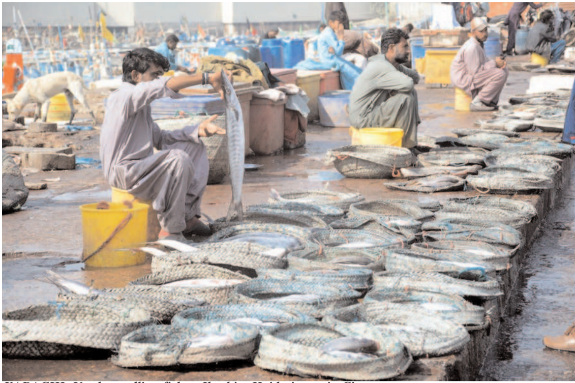
KARACHI: Vendors selling fish at Ibrahim Haideri area in City.