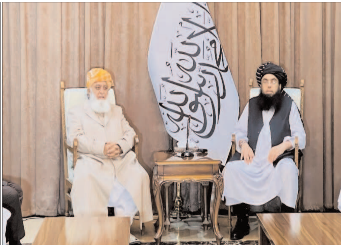
KABUL: JUI-F chief Maulana Fazlur Rehman meets Afghan officials in Kabul.

LAHORE (APP): An appellate tribunal on Sunday dismissed an appeal against acceptance of nomination papers of Pakistan Muslim League-Nawaz (PML-N) Vice President and Chief Organiser Maryam Nawaz for National Assembly constituency NA-119 (Lahore). The tribunal upheld the returning officer decision of accepting Maryam's nomination papers for the constituency.