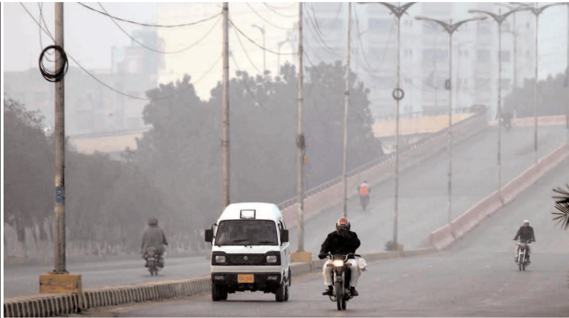
HYDERABAD: A view of fog in Hyderabad City.