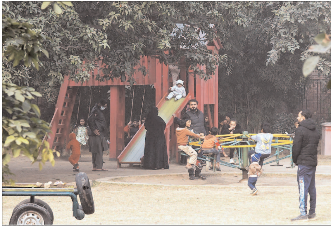
LAHORE: Children enjoy swings at Local Park in the city.

She mentioned that the candidates could check their entry test marks (scores) on the official web portal, www.uokadmission.edu.pk , on Monday, January 8, 2024. Furthermore, she mentioned that the admission list for the evening program 2024 would be put on display on January 13, 2024.