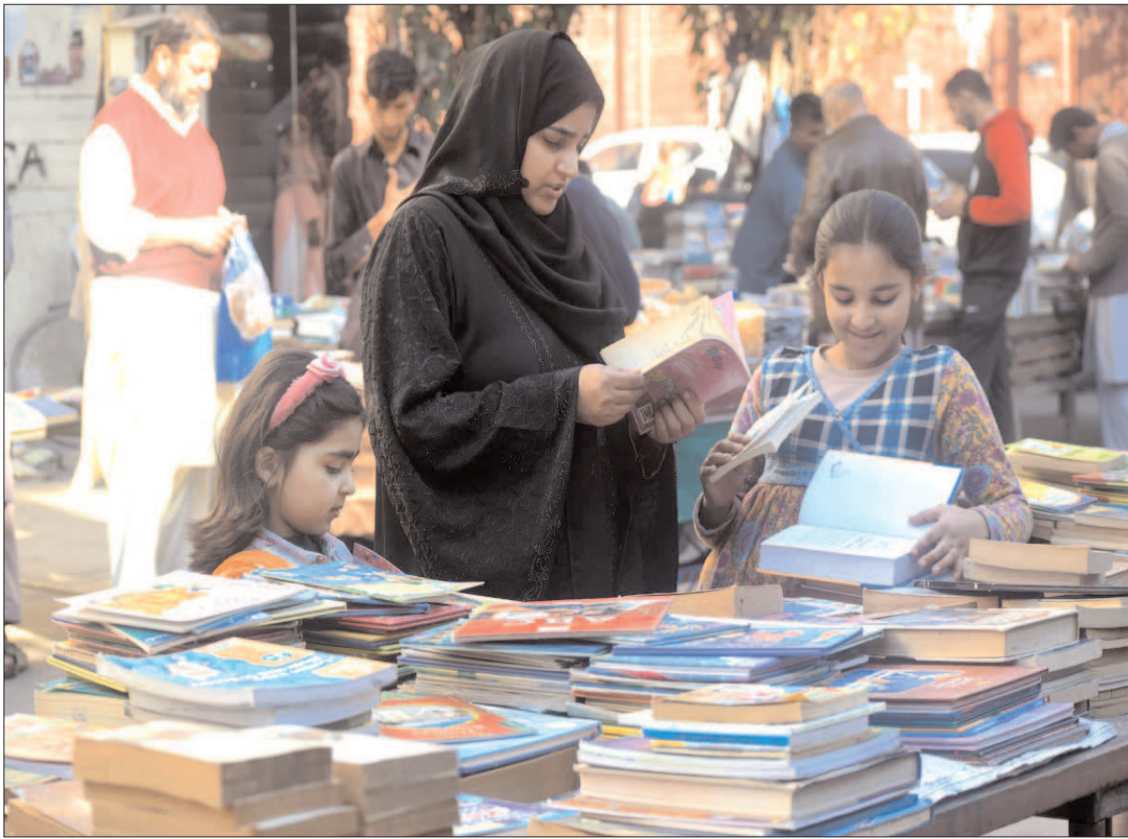
LAHORE: Family selecting and purchasing old books from a roadside setup at Mall Road.

Imarat Hoon Farm Houses, Khan Builders, Kashmir Homes/Imam Hassan Towns, Usmania Fort Housing Scheme, Haider Residencia, Khalid Colony, Al-Baraka Garden, Zam Zam Villas, Eman Garden, Chinar Enclave, Gulshan-e-Abbas, Potohar Valley, Dua Garden, Anmol Garden, Ameen Housing, Watan Enclave, Cighu Farm House, Green Oaks (Harutus Flora), Manan City, Shakir Farms, and others.