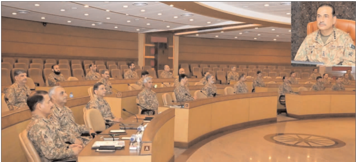
RAWALPINDI: General Syed Asim Munir, Chief of Army Staff presiding over the 262nd Corps Commanders' Conference in GHQ.

Vol. XXXIXI No. 10 Regd. No. 241 RAJAB 20 1445 -- THURSDAY, FEBRUARY 01 2024 PESHAWAR EDITION 12 PAGES PRICE. 30