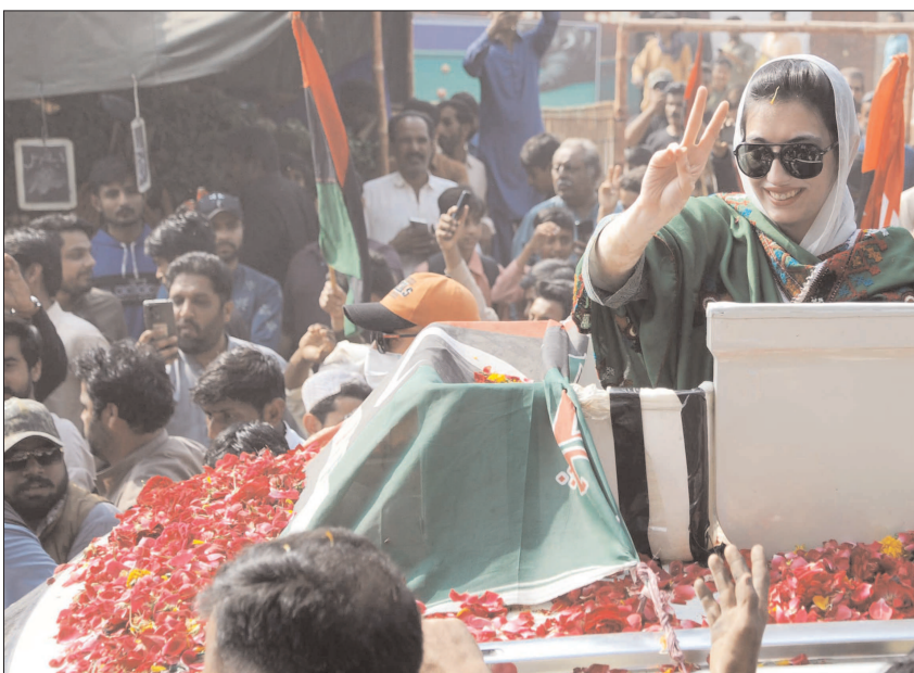
HYDERABAD: Leader of Pakistan People's Party Aseefa Bhutto Zardari making victory sign to supporters during election rally.

Bilawal said that he is contesting the elections because Pakistan is under threat. We are passing through the worst economic crisis because of the same politics of hate and division. The people of Pakistan bear the burden of this poverty, inflation and unemployment. The terrorism is raising its head just because of this traditional politics. We had chased out the terrorists from FATA, PATA and the entire KP but Imran Khan allowed them back. I will stop these terrorists and will crush them, Chairman Bilawal resolved. No country can be run by the politics of hate, division and personal vendetta.