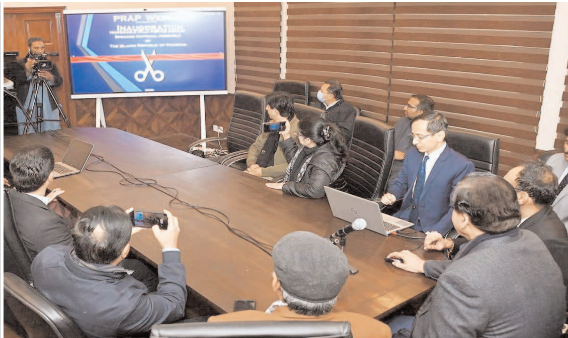
ISLAMABAD: Speaker National Assembly Raja Pervez Ashraf launching the web portal for the Parliamentary Reporters Association (PRA).

Tourists while enjoying snowy weather and adrenaline junkies alike say that Malam Jabba has a variety of options for the discerning traveler, said another visitor. Another local said Swat is also the best travel destination during winter. "The valley offers a variety of spots. This year we visited Malam Jabba for some fun and adventure and even went on the chairlift." According to PTDC and district administration of Rawalpindi, tourist are advised to use extra warm clothes, keep the window of the cars open for fresh air and continually clean snow from the exhaust pipe of vehicles. The tourists are also asked to switch off the engine while standing still and not use heaters for more than ten minutes in an hour.