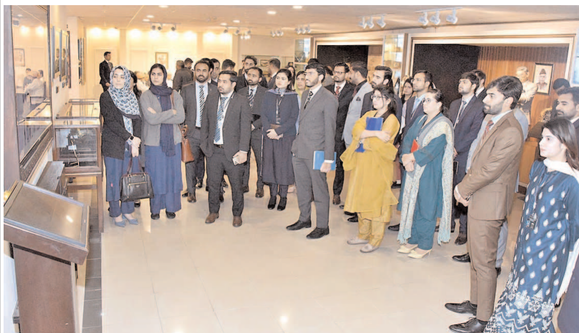
ISLAMABAD: Group of probationary officers of 51st Common Training Programme (CTP) visiting senate museum at Parliament House.

cluded the incubation phase, marking a significant milestone in the SECP's fintech initiatives. During the live market testing phase, these fintech companies will extend their services to a limited number of customers for a specified period. This real-world trial aims to evaluate the effectiveness and viability of these innovative business models, ensuring they meet regulatory standards while providing valuable financial solutions to consumers.