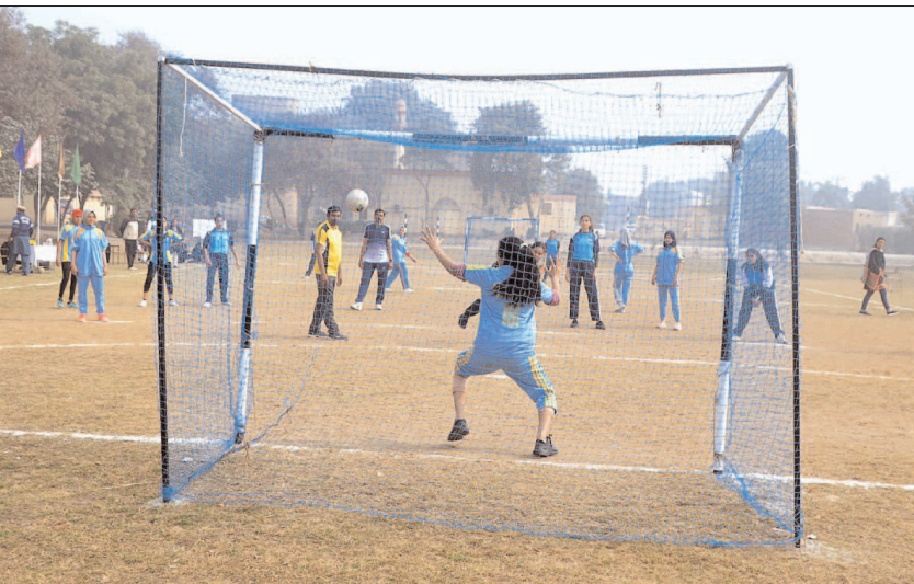
MULTAN: Players in action in handball match played between Mardan Board and Lahore Board teams during Pakistan Inter Board Girls Handball C'ship.

While Root is more renowned for his efforts with the willow, the 33-year-old collected five wickets against India with his more than handy spin - and even opened the bowling for England during the second innings.