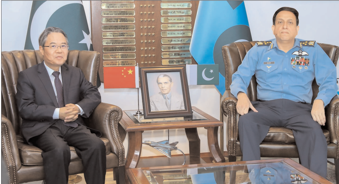
ISLAMABAD: Ambassador of China, Mr. Jiang Zaidong, called on Air Chief Marshal Zaheed Ahmed Baber Sidhu, Chief of the Air Staff, Pakistan Air Force at Air Headquarters.