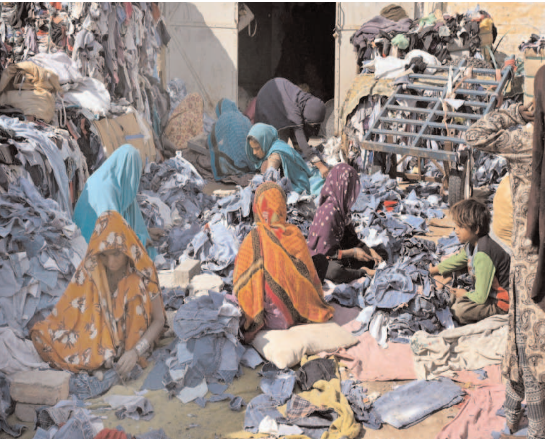
HYDERABAD: Women workers sorting old clothes at their work place site area.