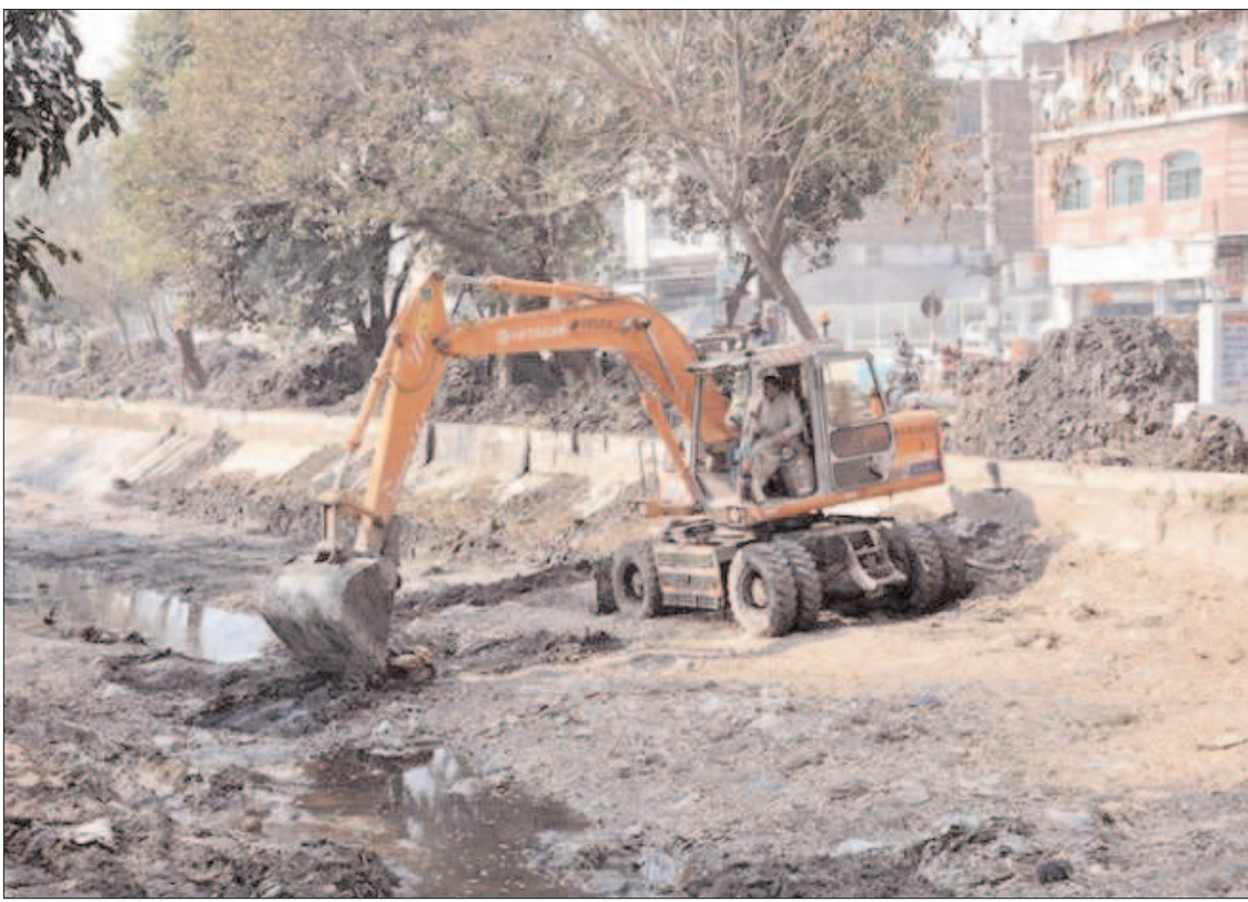
FAISALABAD: Irrigation department worker cleaning Rakh Branch canal with the help of caterpillar during canal cleaning campaign.