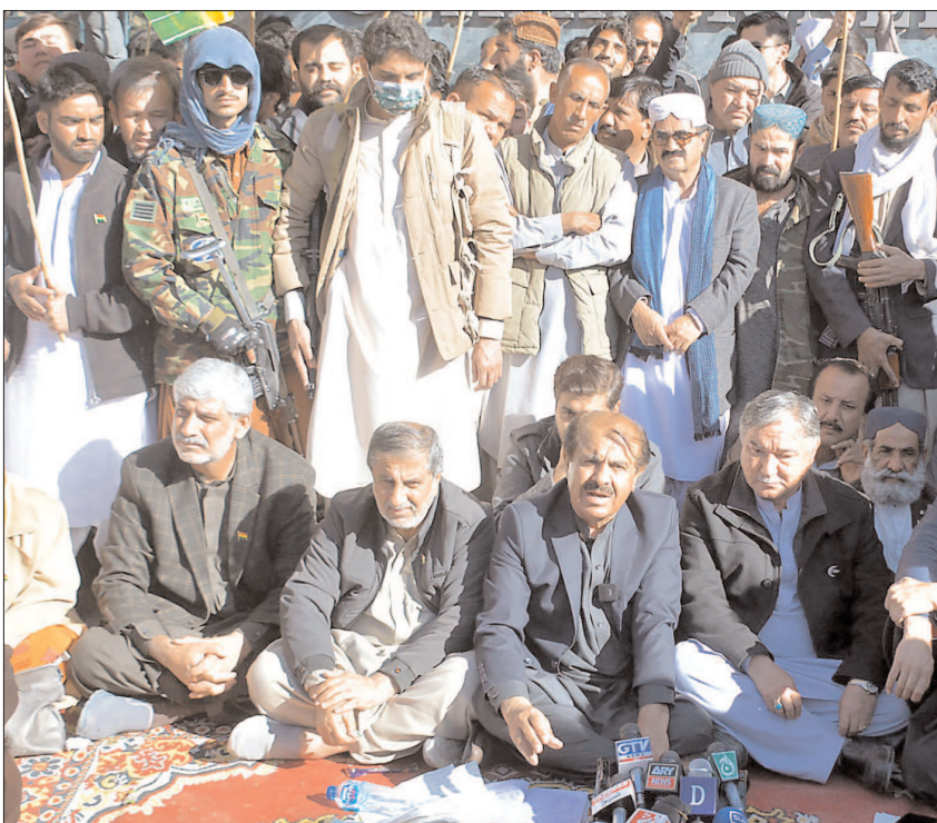
QUETTA: Leaders of various political parties holding a press conference against alleged alteration of election results.