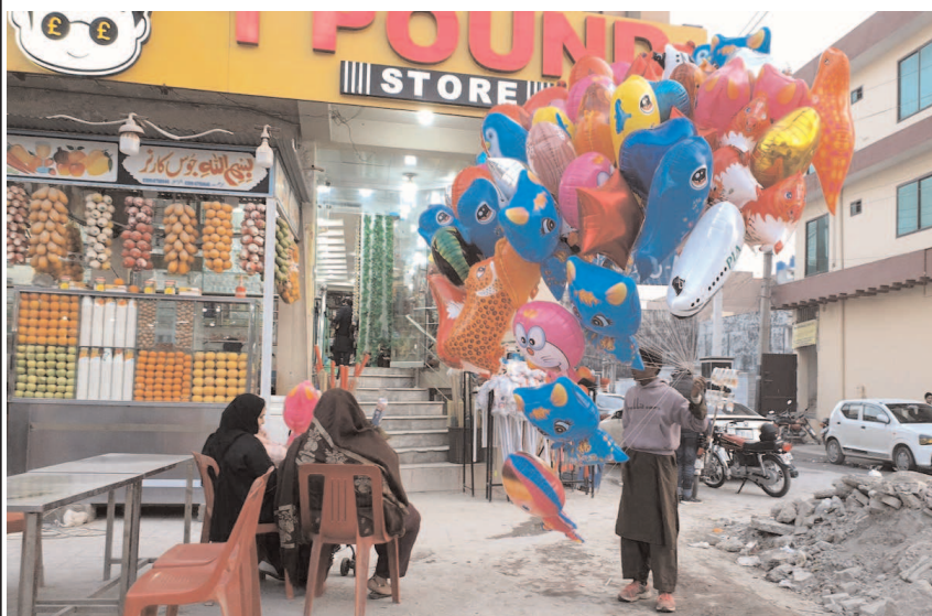
ISLAMABAD: A youngster displays colourful balloons to attract the customers at Ghouri Town area.