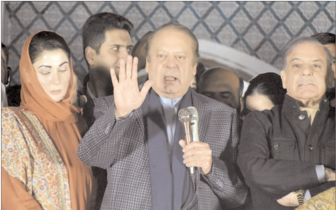
LAHORE: PML-N chief and former Prime Minister Nawaz Sharif addressing party workers.

Vol. XXXIXI No. 19 Regd. No. 241 RAJAB 29 1445 -- SATURDAY, FEBRUARY 10 2024 PESHAWAR EDITION 12 PAGES PRICE. 30