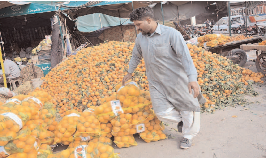
FAISALABAD: A vendor displaying oranges at his roadside stall to attract the customers.

ISLAMABAD (APP): The per tola price of 24 karat gold remained unchanged at Rs.215,500 on Friday, the All Sindh Sarafa Jewellers Association reported. Likewise, the price of 10 grams of 24 karat gold and 10 gram 22 karat gold also remained constant at Rs.184,756 and Rs.169,360 respectively whereas the price of per tola and ten gram Silver also remained unchanged at Rs.2,600 and 2,229.08 respectively. The price of gold in the international market witnessed no change and was traded at $2,053, the Association reported.