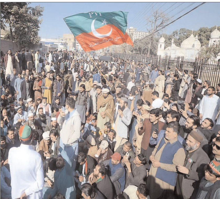
PESHAWAR: Supporters of Pakistan Tehreek-e-Insaf holding a protest outside Election Commission office.