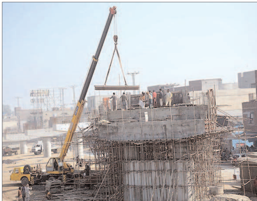
FAISALABAD: Labourers busy in construction of Abdullah Pur Jhumra Road Flyover during development work in the city.

India executed Muhammad Afzal Guru on February 9, 2013 and Muhammad Maqbool Bhatt on February 11, 1984 in the infamous Tihar Jail of New Delhi and buried their bodies in premises of the prison.