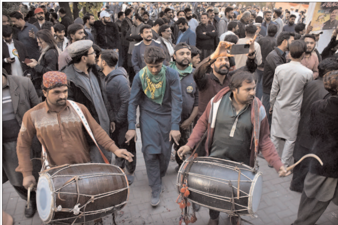
LAHORE: Supporters of Former Prime Minister Nawaz Sharif's celebrates PML-N's success in General Election 2024 gathered at Model Town.