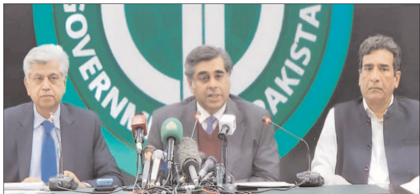
ISLAMABAD: Federal Minister for Interior, Dr. Gohar Ejaz and Federal Minister for Information and Broadcasting Murtaza Solangi addressing a press conference.

Dogar secured 143,613 votes, defeating Jahangir Khan Tareen obtained 50,166 votes. Meanwhile, PTI backed independent candidate Latif Khosa secured victory against PML-N candidate Khawaja Saad Rafique in NA-122 Lahore. Khosa got 117,109 votes while Saad Rafique secured 77,907 votes. Amid a surprising move, Saad Rafique in a message on X (formerly Twitter) congratulated Latif Khosa on his victory. "I wholeheartedly accept my defeat," he said.