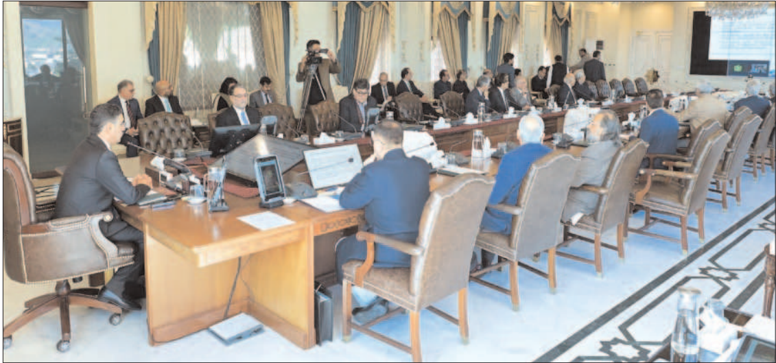
ISLAMABAD: Caretaker Prime Minister Anwaar-ul-Haq Kakar chairing the meeting of federal cabinet.