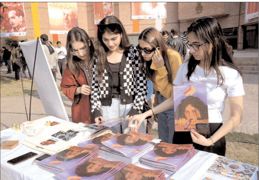
LAHORE: Girls visiting stall during Faiz Mela at Al-Hamra.

He said that the project of establishing schools and clinics in mosques had been initiated by the Badshahi Mosque of Lahore and will be expanded across the country.