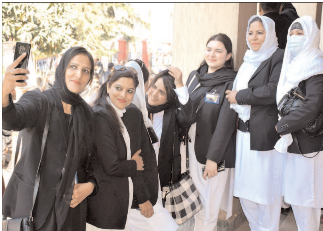
MUZAFFARABAD: Lawyers taking selfie during annual election of Central Bar Association.

gency meeting with party leaders to consult on challenging the election results in NA-127. The PPP leadership is also expected to adopt a stance on their reservations regarding election results in the Punjab region. Furthermore, there is a potential chance of a post-election meeting between the leadership of PPP and PML-N in Punjab.