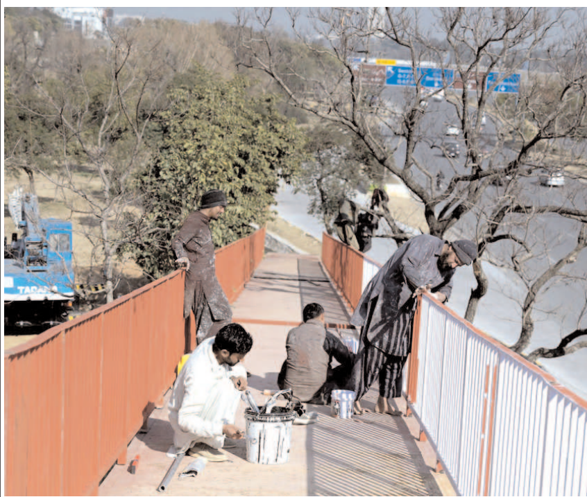
ISLAMABAD: Workers paint the grills of a pedestrian bridge on Srinagar Highway.

This visible demonstration of civic duty underscored the commitment of voters to shaping the future of their homeland through democratic means.