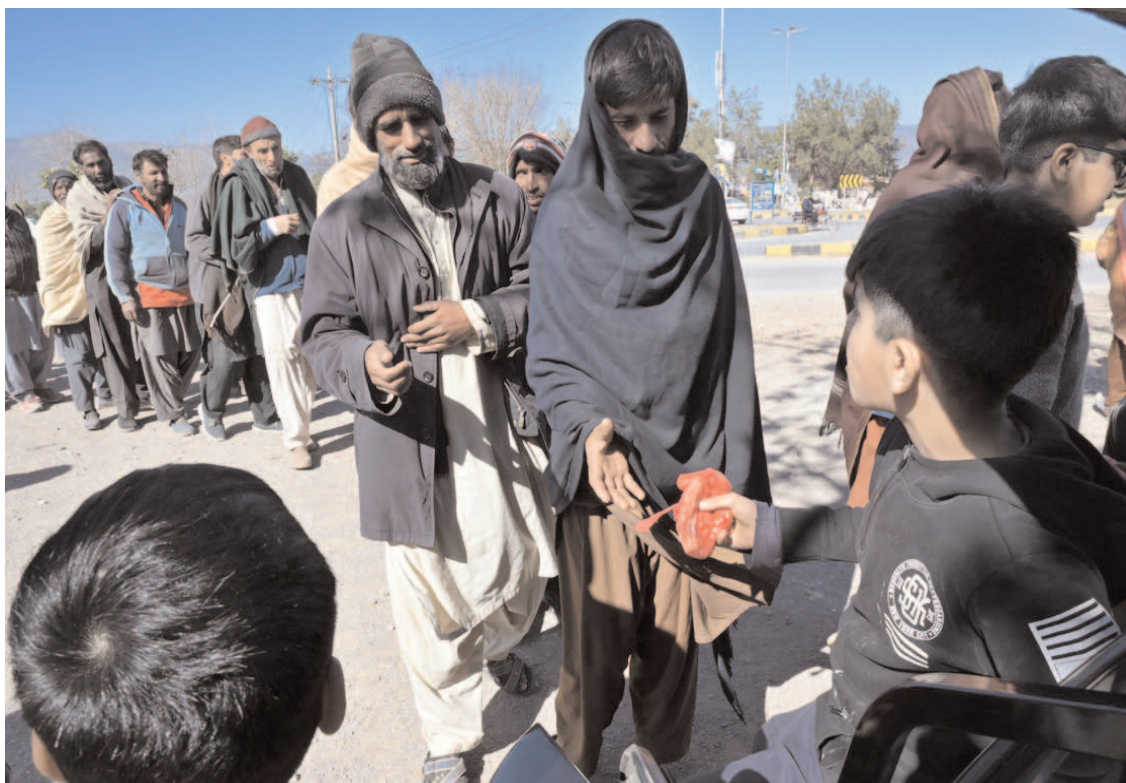
ISLAMABAD: A large number of people in queue to get free food at G-11.