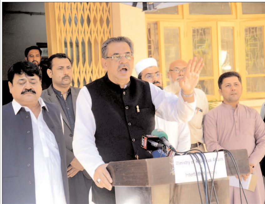
KARACHI: The Caretaker Federal Minister for Religious Affairs and Interfaith Harmony Aneeq Ahmed talking to media persons.

Earlier, Jamaat-e-Islami (JI) announced sit-in protests outside the ECP office, demanding a thorough review of the results of the general election 2024.