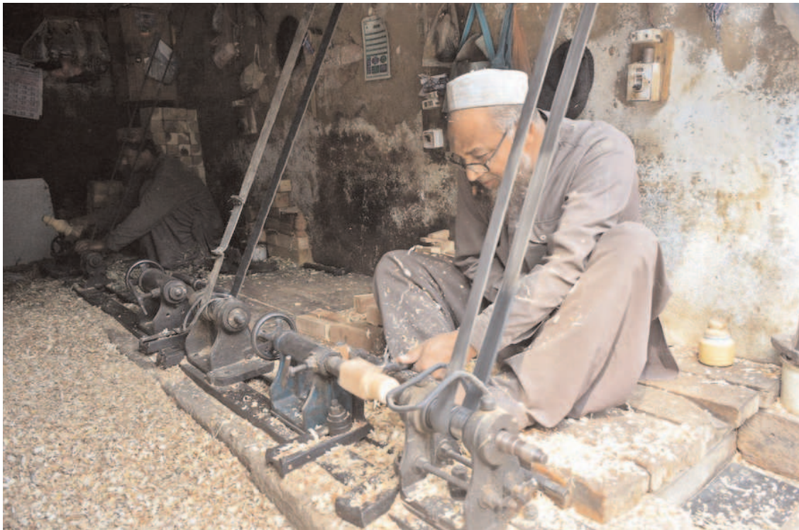
HYDERABAD: A carpenter busy in making part of a traditional bed (charpai) at his workplace.

While the country's international bonds make up just 3.4% of its total public debt - dwarfed by the near 13% it owes to China, external debt amortisation is high in percent of FX reserves, according to calculations. China is a major creditor for Pakistan and has in recent times rolled over loans to the country, as have the United Arab Emirates and Saudi Arabia. Political fragmentation might make it harder to push through painful and unpopular but necessary measures such as widening the tax base, analysts said.