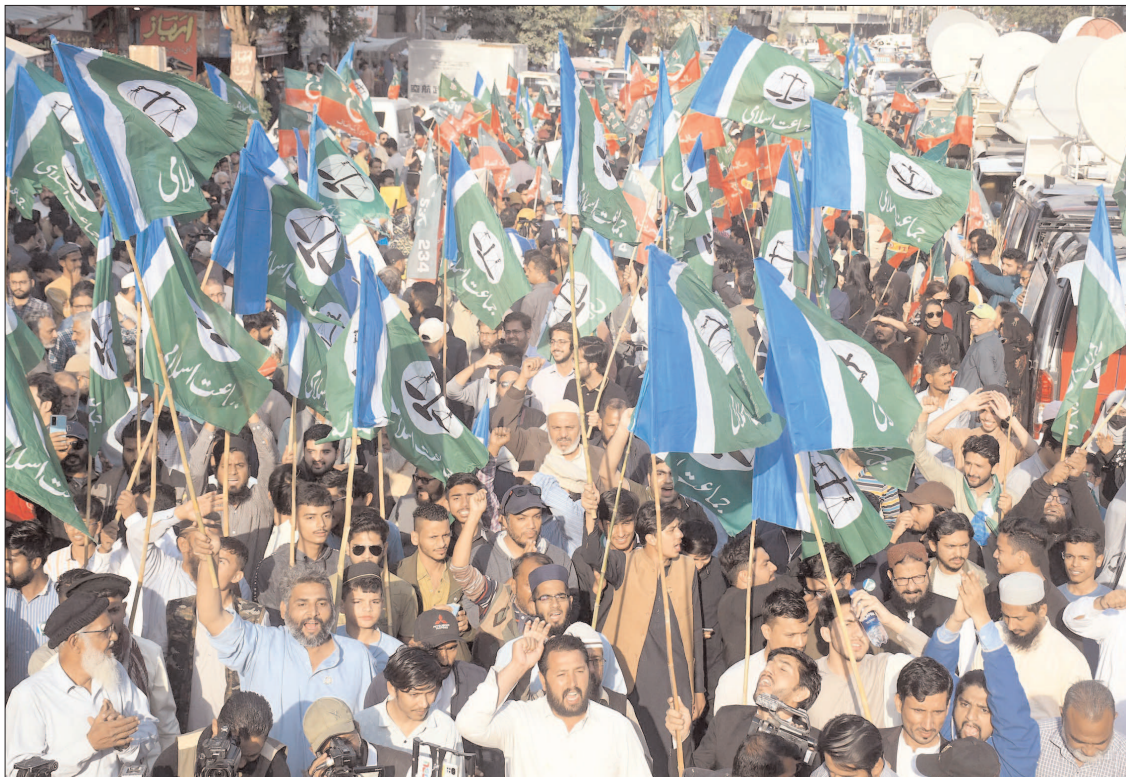
KARACHI: Supporters of Jamat-e-Islami holding a protest against rigging in general elections outside Election Commission Office.

The COG chairperson underscored the importance of a legal and administrative environment conducive to citizens' right to run for office and vote. He noted the implementation of codes of conduct for political parties and the media, with calls for more stakeholder engagement. The complete recommendations to ensure transparency in this regard will be included in the final report. While commending the ECP's efforts to improve election management through the Election Management System (EMS), he acknowledged operational challenges on Election Day, which will be elaborated on in subsequent observations.