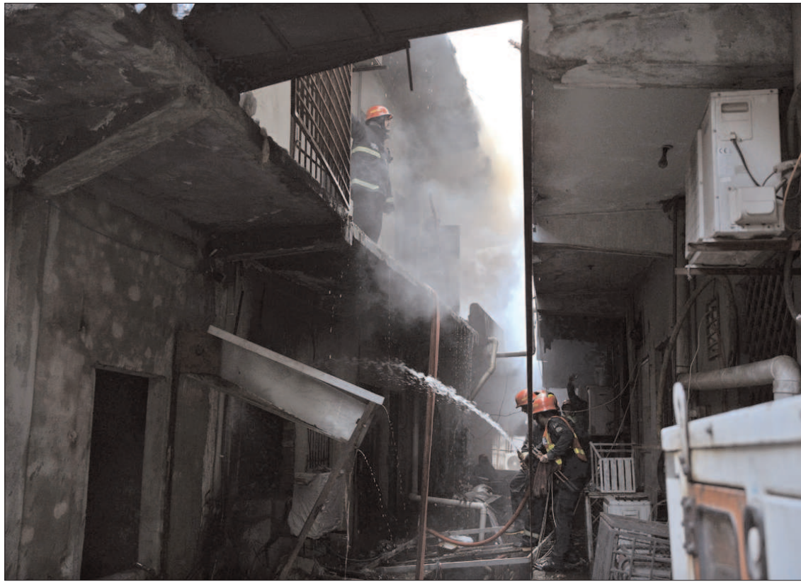
RAWALPINDI: Firefighters struggling to extinguish the fire that erupted in shops at Mughal Sarai Market Raja Bazaar.