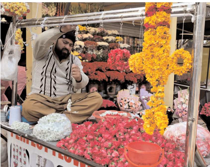
ISLAMABAD: A vendor preparing garland to attract the customers at Supper Market in Federal Capital.

Rawalpindi district police and administration were making tireless efforts in the city's development, he added. He said that the high-quality safe city project was completed with amazing speed and one year's work was completed in just 45 days.