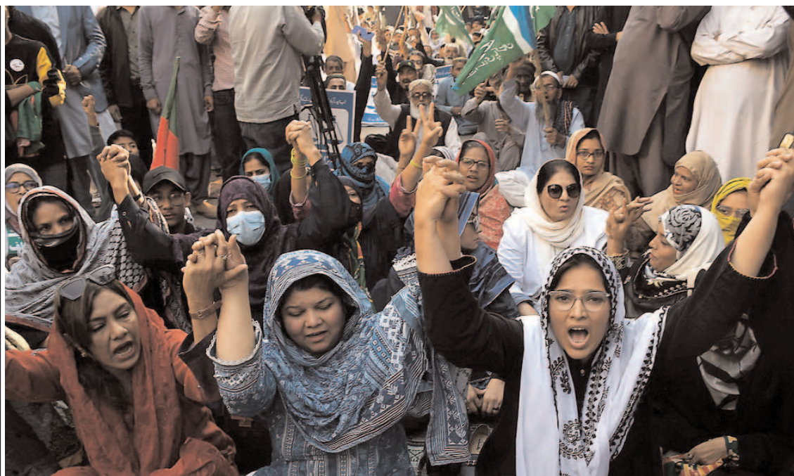
HYDERABAD: Supporters of PTI and Jamaat-e-Islami hold a protest demanding free and fair results of elections.

"It is time to tell our youth that smoking is dangerous to their health, especially mental health," they said. On this occasion, a painting exhibition was also held to raise awareness about mental health.