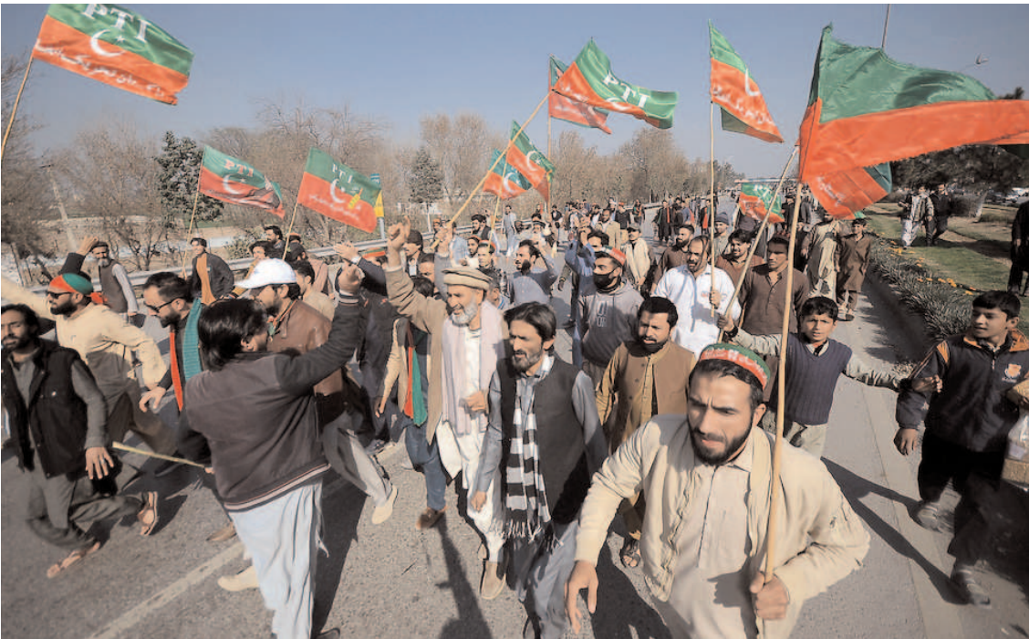
PESHAWAR: Supporters of PTI gather to protest as they allege rigging in general elections.