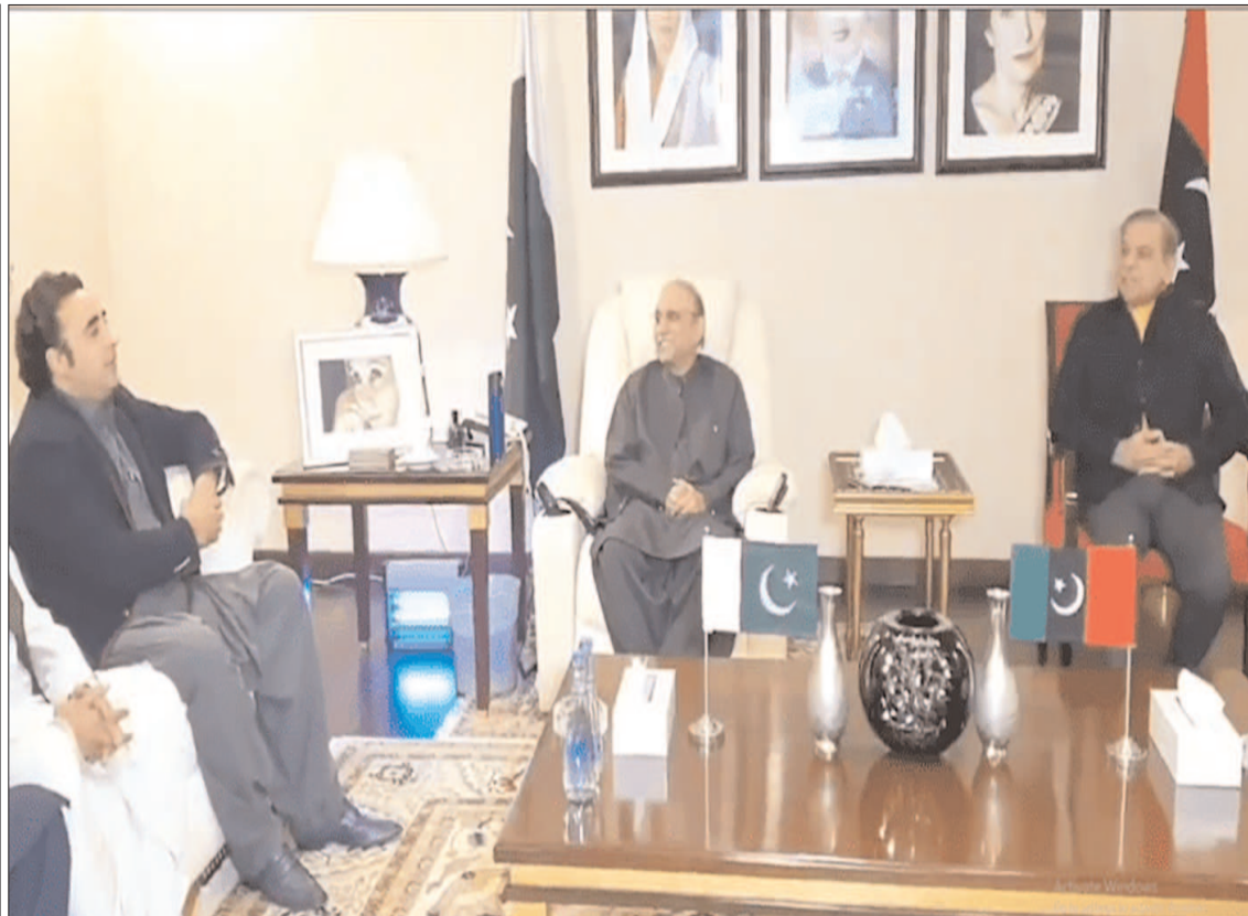
LAHORE: PML-N's Shehbaz Sharif meets with PPP leaders Asif Ali Zardari and Bilawal Bhutto-Zardari at Bilawal House in Lahore on Sunday.

Earlier, on their arrival in Raiwand, Pakistan Muslim League (N) supremo Muhammad Nawaz Sharif, President Shehbaz Sharif along with the party leaders welcomed the MQM leaders.