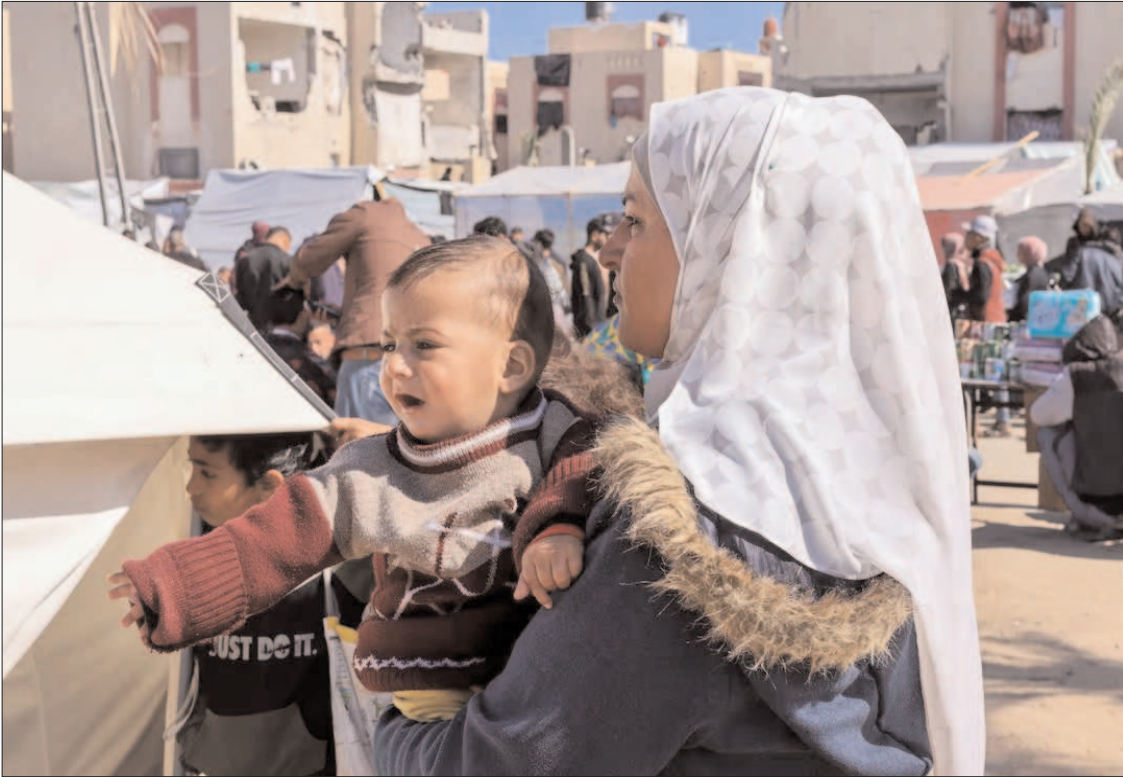
RAFAH: A displaced Palestinian woman holds her son as she waits to get him examined by a doctor, outside a medical tent, amid the ongoing conflict between Israel and Hamas, in Rafah in the southern Gaza Strip.

Jamaat-e-Islami will approach the concerned judicial forums to get rectified results, he said and accused their candidates have being deliberately defeated in the elections by manipulating results. Due to the protest sit-in, the traffic system remained affected in the areas of the protests and people were advised to take alternate routes.