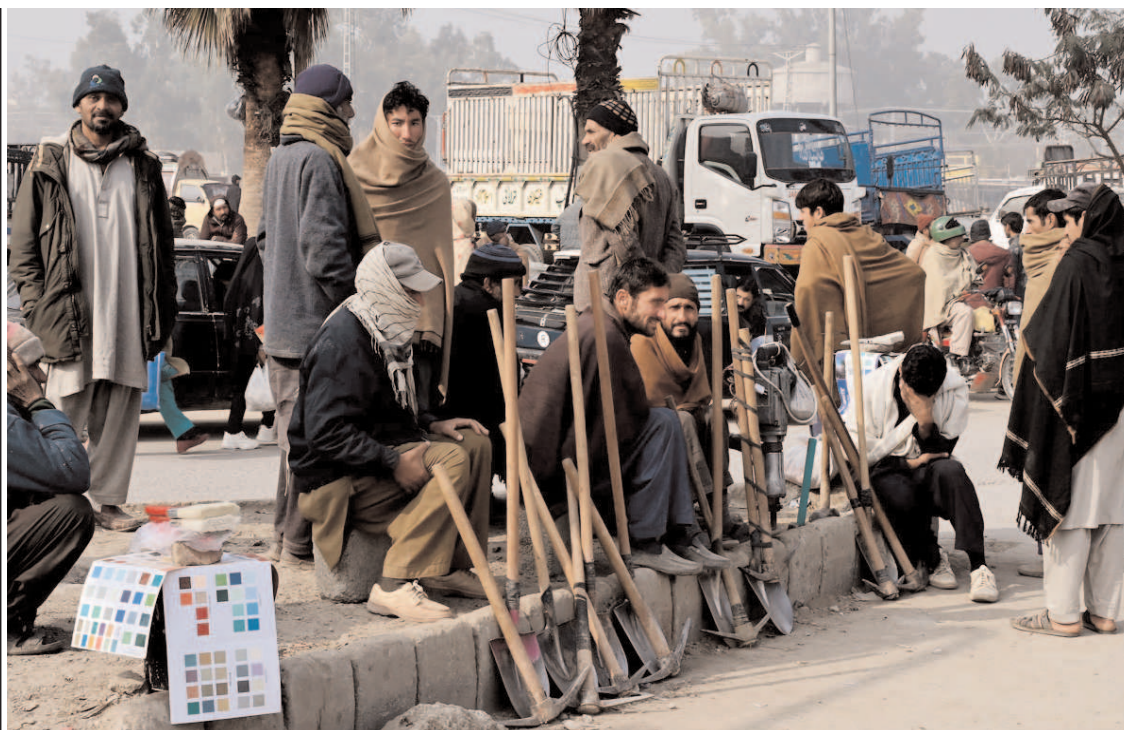
ISLAMABAD: Labourers along with their tools sitting on roadside waiting for clients to be hired for work during morning time.