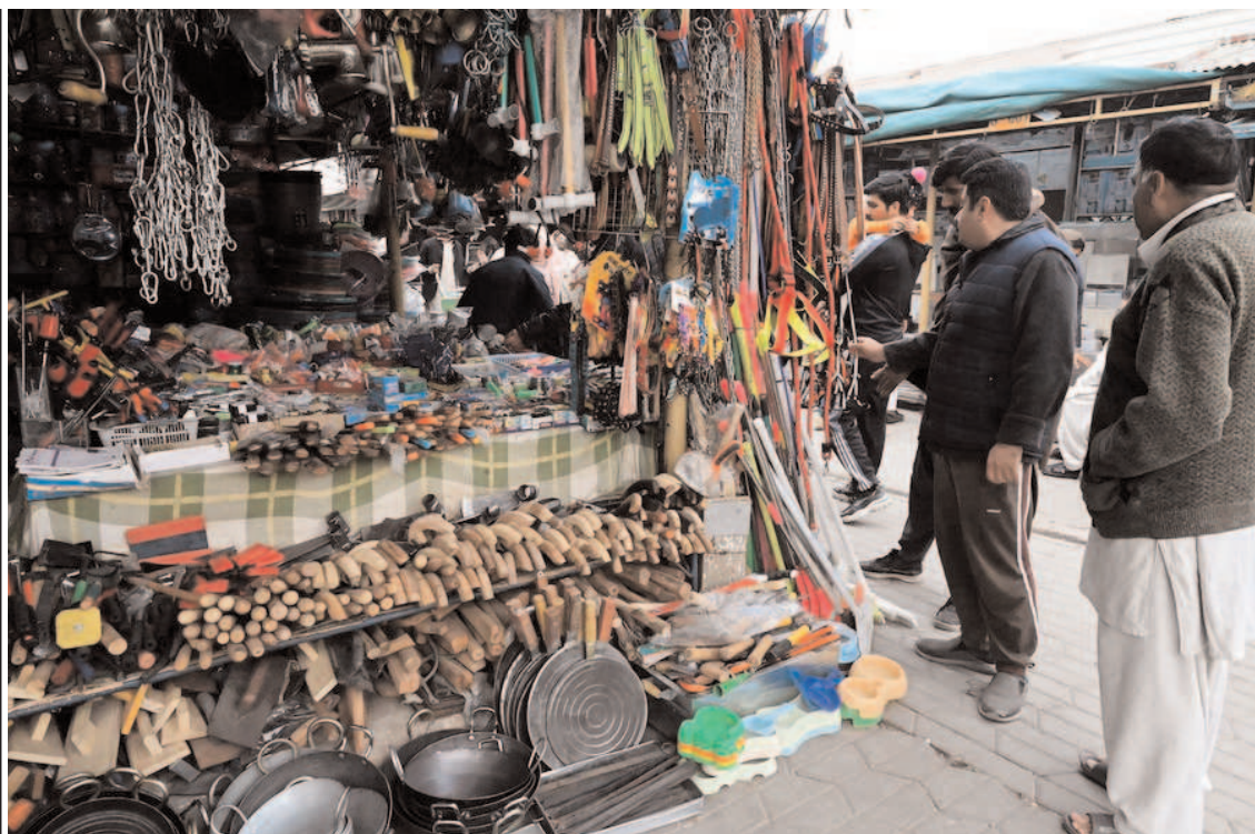
ISLAMABAD: People busy shopping at Sunday Bazar G-9 in Federal Capital.

They have invaluable insights into the ground realities and can give their input on how policies can be tailored to better suit local contexts and needs. This bottom-up approach ensures that policies are more responsive, adaptive, and sustainable in the long run, he concluded.