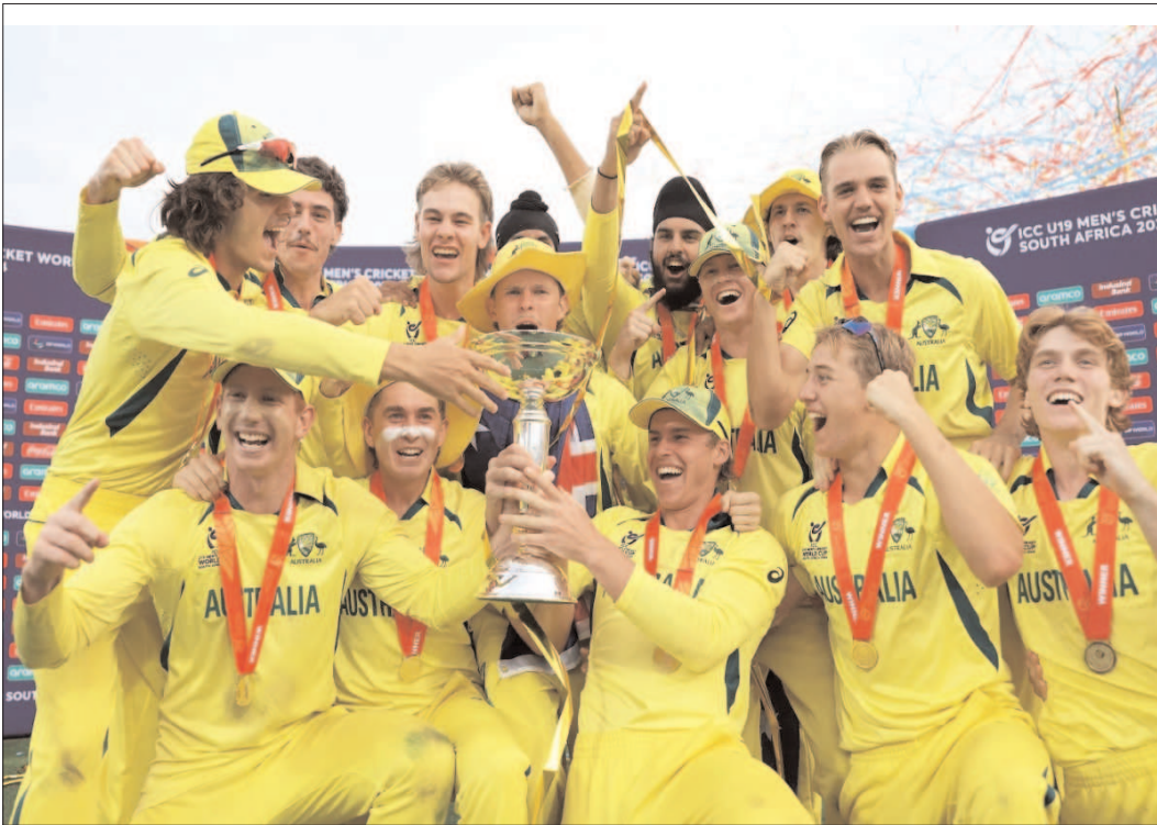
Australian players celebrate with the trophy.