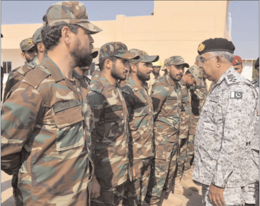
KARACHI: Chief of Naval Staff, Admiral Naveed Ashraf interacting with troops at forward post during exercise SEASPARK 2024.

Chief of the Naval Staff was given a briefing by the Orange and Blue Naval Force Commanders on the conduct of operations by respective forces. Thereafter, Naval Chief visited Ketu Bandar Post and Battalion Headquarters of Pak Marines at Shah Bandar where he was briefed on combat readiness for defence of Creeks areas which constitutes the South Eastern maritime boundary with India. During the visit, Naval Chief interacted with troops deployed in difficult marshy areas and appreciated their devotion and high morale.