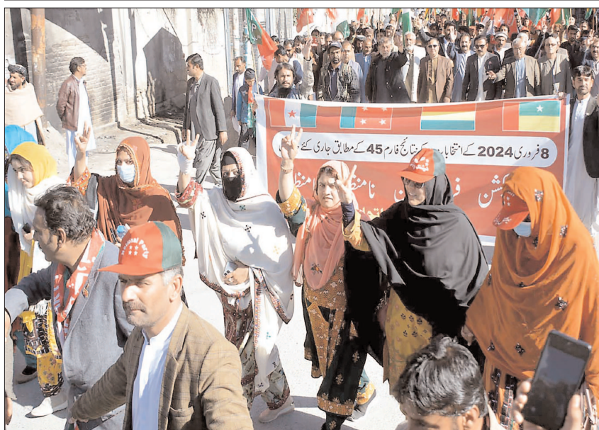
QUETTA: Workers of Four Party Etihad talking part in a protest against alleged rigging in general elections.