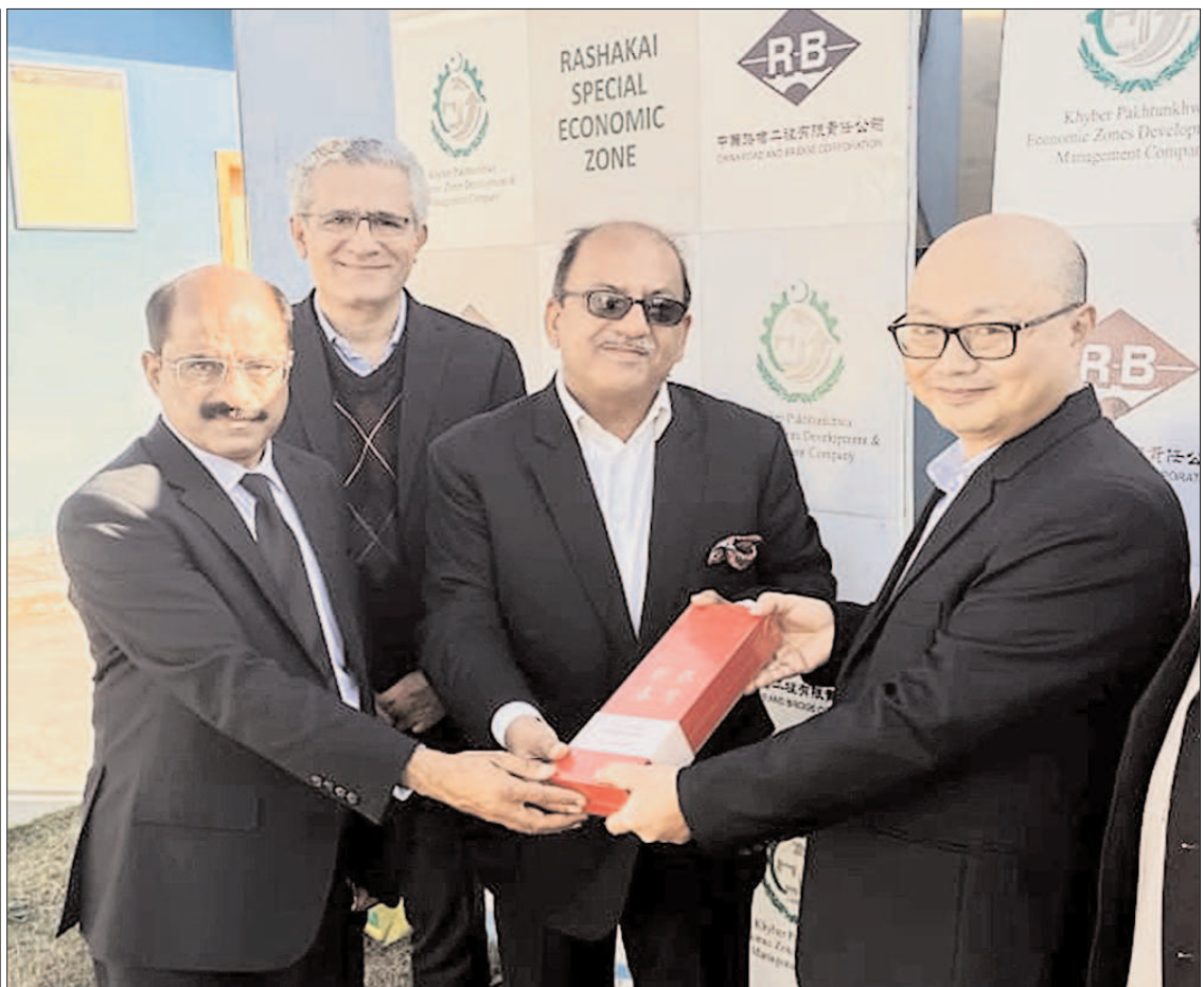
NOWSHERA: The Pakistan China Friendship Association (PCFA) Khyber Pakhtunkhwa and Khyber Pakhtunkhwa Economic Zone Development & Management Company (KPEZDMC)celebrate Chinese Spring Festival 2024 at Rashakai Special Economic Zone (RSEZ).