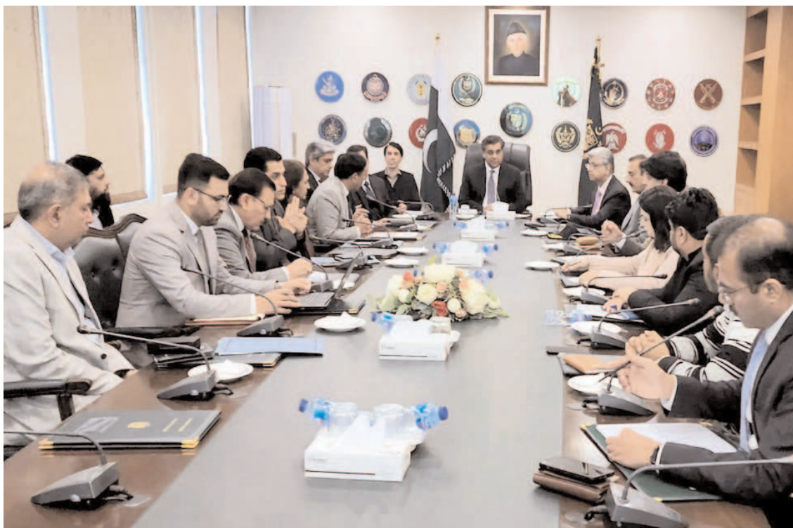
ISLAMABAD: Federal Minister for Interior Dr. Gohar Ejaz chairing a meeting on Integrated Sanitation And Water Supply System for Islamabad and Rawalpindi.

ISLAMABAD (APP): The National University of Science and Technology (NUST) has called on all voices of Pakistan to become part of its efforts to amplify the importance of Women in Climate Action by participating in an 'Article Writing Competition'. According to an official of NUST, the article writing competition, being arranged in collaboration with the Gender Intersectionality and Climate Change (GICC), is aimed at stimulating thoughtful discourse on the intersectionality of gender and climate resilience. The last date for submission of the articles is February 29. The details of the event can be accessed through the website: gicc.nust.edu.pk. The article writing competition is part of the "Women in Climate Action - Celebrating Resilience" event being arranged by the NUST and GIZ Pakistan on the occasion of International Women's Day (March 8) in Islamabad. This empowering event aims to recognize and applaud the significant contributions of women in climate action, emphasizing their leadership, innovation, and impact on creating sustainable and climate-resilient communities.