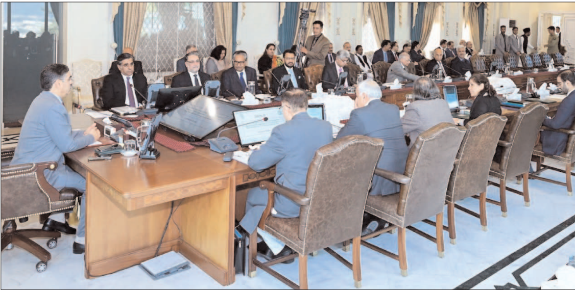
ISLAMABAD: Caretaker Prime Minister Anwaar-ul-Haq Kakar chairing a meeting of federal cabinet.

In the meeting, the participants paid tribute to the caretaker government for its efforts for facilitating investment in the country, resolving the problems of industrialists, reforming the FBR and taking measures to restore the economy. The meeting was informed in detail about the large scale industry of steel and copper in Pakistan, the fourth largest export sector, of which copper exports volume alone was $1.35 billion in the last financial year.