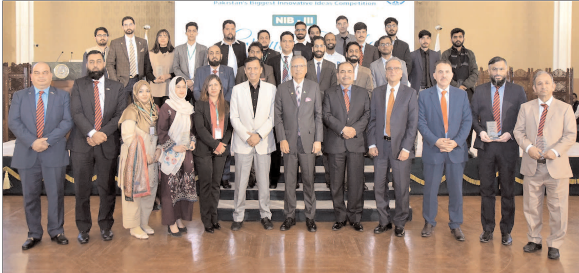
ISLAMABAD: President Dr. Arif Alvi in a group photo with the winners and organizers of National Idea Bank Season III, at Aiwan-e-Sadr.