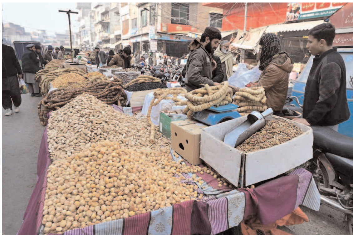
RAWALPINDI: Vendors displaying dry fruits on roadside in Rajabazar area to attract customers.

Rs76.06 and Rs74.49. Gold rates up by Rs.300 to Rs.211,100 per tola: The per tola price of 24 karat gold increased by Rs.300 and was sold at Rs.211,100 in the local market on Thursday against its sale at Rs. 210,800 on last trading day. The price of 10 grams of 24 karat also increased by Rs.257 to Rs.180,984 from Rs 180,727 whereas that of 10 gram 22 karat gold went up to Rs.165,902 from Rs. 165,666, the All Sindh Sarafa Jewellers Association reported. The price of per tola and ten gram silver remained unchanged at Rs2,580 and Rs.2,211.93 respectively. The price of gold in the international market increased by $3 to $2,013 against its sale at $2,010 the previous day, the Association reported.