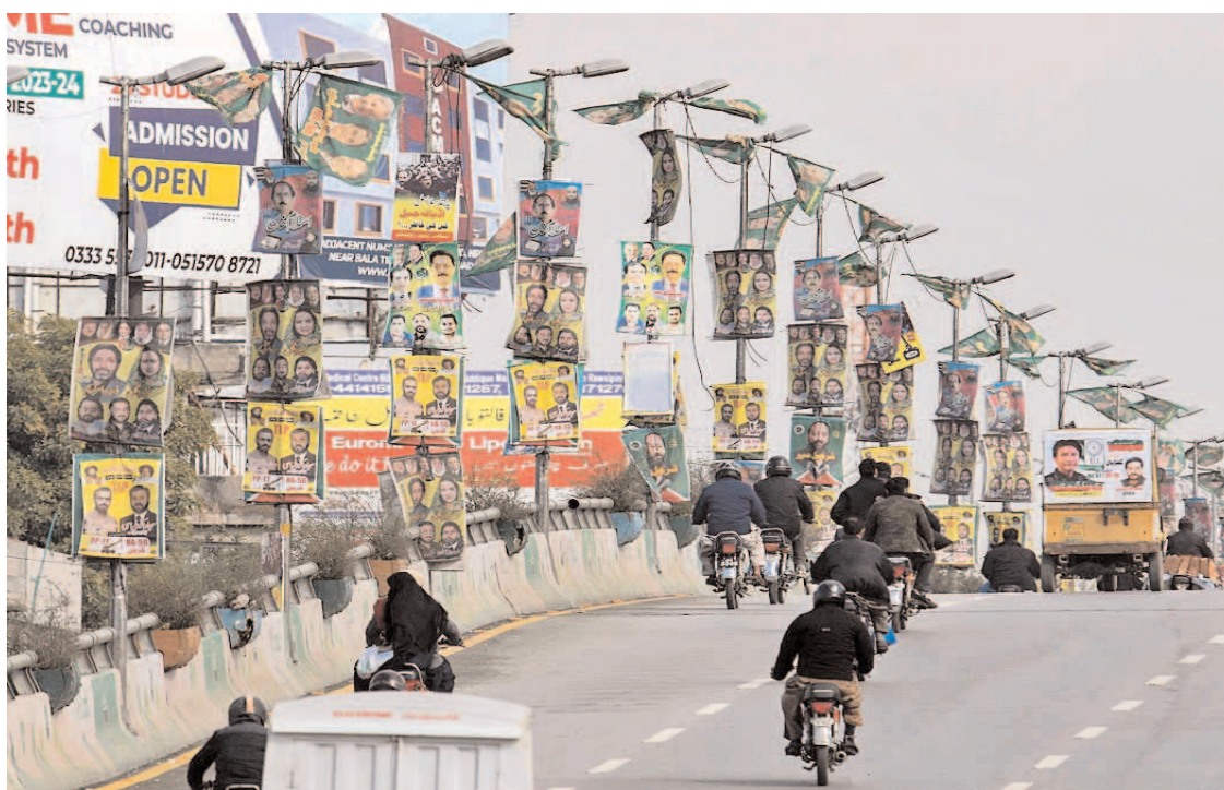
RAWALPINDI: A view of banners of candidates on the street lights at 6th Road in connection with upcoming General Elections-2024.