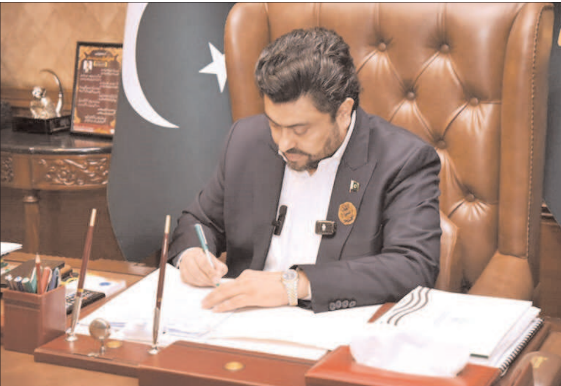
KARACHI: Sindh Governor Kamran Khan Tessori signs after approval of Registration (Sindh Amendment) Ordinance 2024 at Governor House.

LAHORE (APP): During a timely operation at 15 Call, Punjab Safe Cities Authority (PSCA) apprehended a rickshaw driver involved in stealing a woman's belongings. According to a spokesperson of the PSCA, a woman hired a rickshaw from MM Alam Road, Hussain Chowk. Near Ichhra, the woman unloaded her belongings and went home. Taking advantage of the situation, the rickshaw driver fled with the remaining items, including a laptop. The Safe City team traced the route of the rickshaw and apprehended the driver. Details of the rickshaw involved in the theft, along with video footage and images, were provided to the investigation officer. The spokesperson for Safe Cities stated that Ichhra Police, during their operation, arrested the rickshaw driver and recovered the stolen items. The affected woman expressed her gratitude to Safe City and the police. Citizens are urged to immediately report any violations of the law around them on 15.