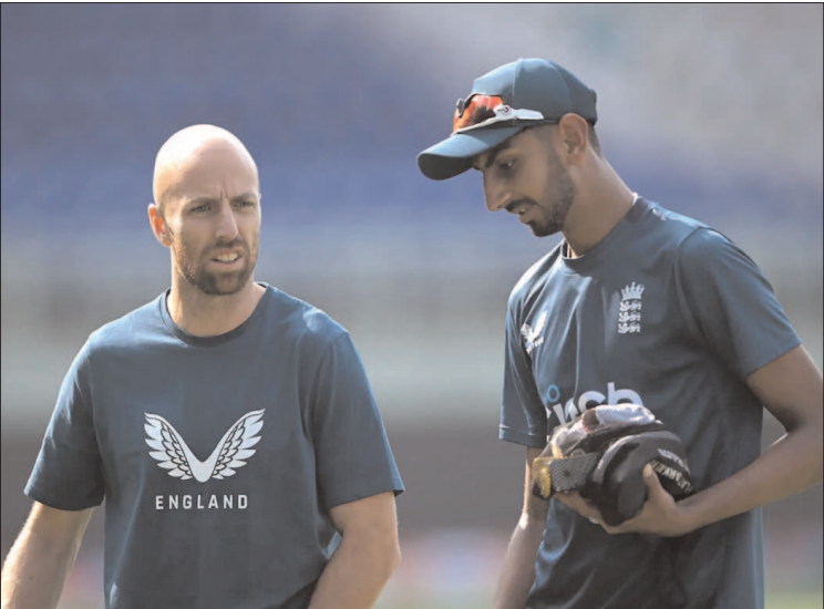
England bowler Shoaib Bashir is congratulated by Jack Leach during England practice ahead of the second test match

The Oklahoma City Thunder triumphed 105-100 over the Denver Nuggets thanks to 34 points from Shai Gilgeous-Alexander. The Orlando Magic beat the San Antonio Spurs 108-98, the Minnesota Timberwolves claimed a 121-87 victory over the Dallas Mavericks, and the New Orleans Pelicans ended a three-game losing run by overcoming the Houston Rockets 110-99.