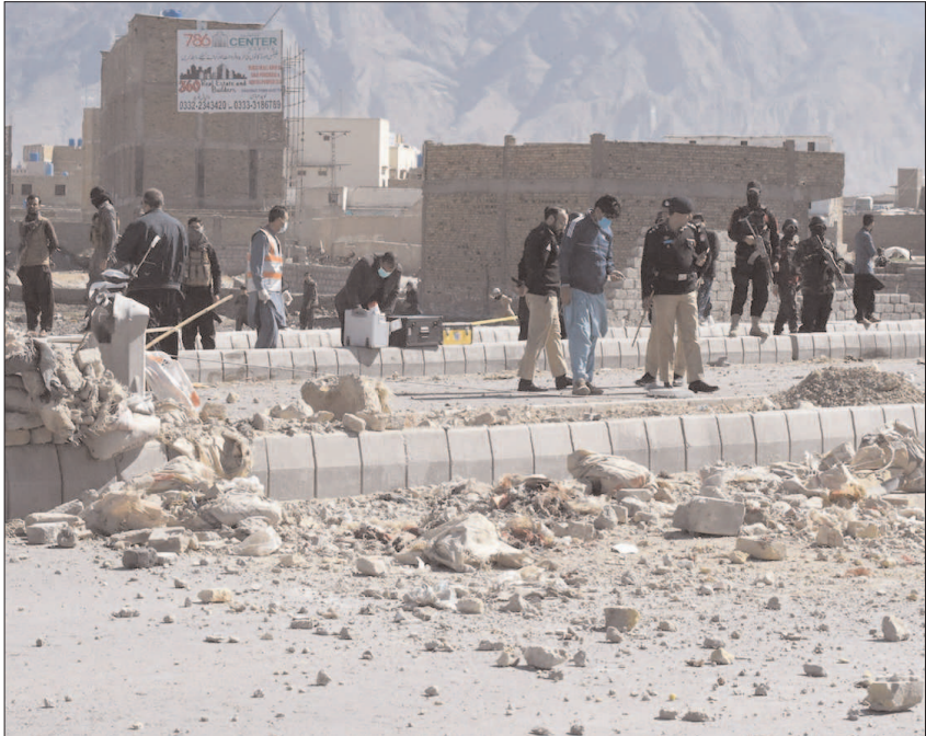
QUETTA: Security personnel inspecting the site of a bomb blast.