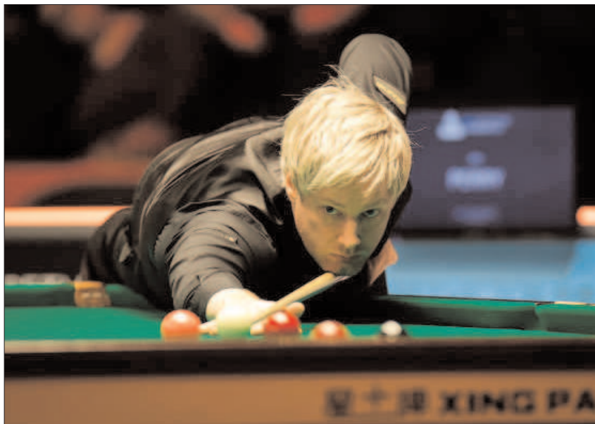
BERLIN: Neil Robertson plays a shot in the third round match against Joe Perry on day four of 2024 BetVictor German Masters at Tempodrom.

"My relationship with Babar, Rizwan and other players is very good. We played together for five years. Babar, Imam, Hassan, Shadab, Faheem, Ruman, Anwar, we all share a very good bond," he shared.