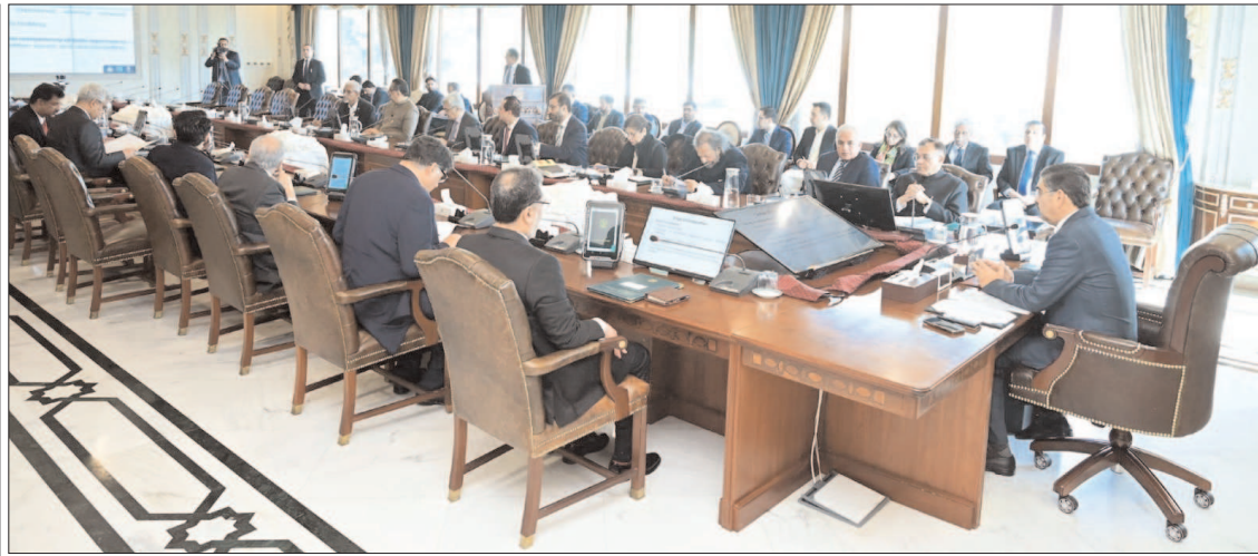
ISLAMABAD: Caretaker Prime Minister Anwaar-ul-Haq chairing a meeting of federal cabinet.

About 33 lakh children have been deprived of education, he claimed. The people in Sindh are being oppressed by the Pakistan People's Party. They are being harassed for the elections. And for the 61 seats of the National Assembly, tickets have been issued to the candidates for 51 of the 61 seats, he added that no other party has done as much as the MQM has oppressed the people because there are bodies in sacks in Karachi.