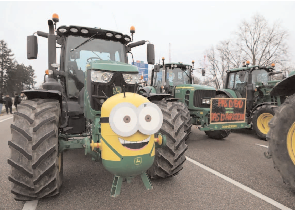
PARIS: Protesters block the A35 highway with tractors near Strasbourg in eastern France.

China routinely conducts patrols of the South China Sea even as tensions simmer between it and the Philippines, which recently had its own joint military patrol in the region with its ally - the United States - drawing the ire of China. The spokesperson said the Coast Guard will firmly safeguard national sovereignty and maritime rights and interests.