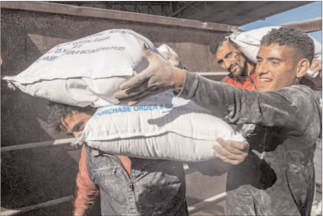
GAZA: Workers unload bags of humanitarian aid that entered Gaza by truck through the Karem Abu Salem border crossing in southern part of Palestinian territory.

QUETTA: A protest sit-in of four parties alliance continued on Monday outside the office of Deputy Commissioner Quetta/District Returning Officer, Quetta, pressing the authorities to issue election-2024's results of different constituencies of the province in accordance with Form-45. According to detail, four parties alliance, including Pushtunkhwa Milli Awami Party, Balochistan National Party (Mengal), National Party and Hazara Democratic Party, have been observing the protest sit-in at Anscomb Road area of Quetta outside the office of Deputy Commissioner Quetta/District Returning Officer, Quetta for the last eleven days.