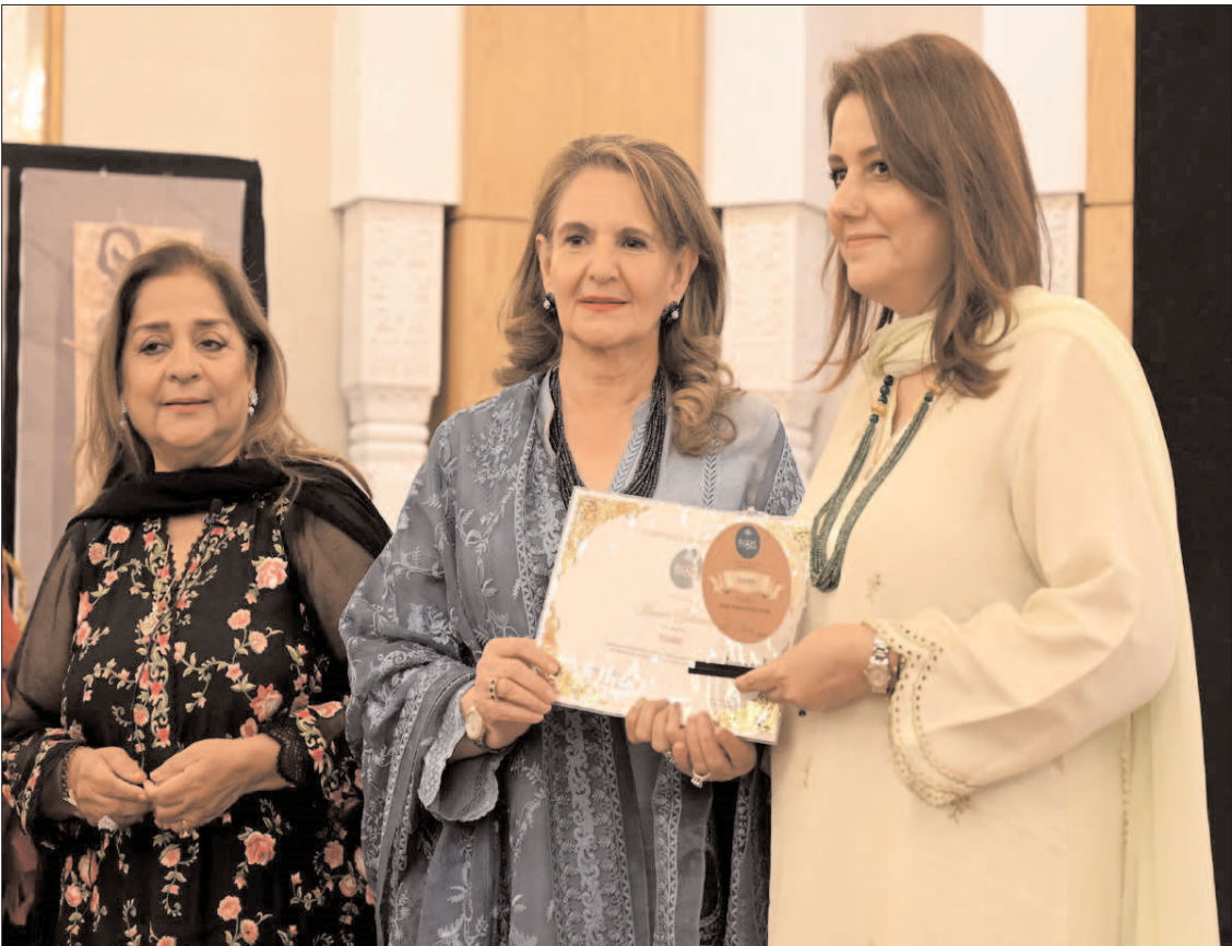
KARACHI: First Lady Begum Samina Arif Alvi distributing awards and certificates of appreciation among the members of Floral Art Society of Pakistan who won the Bloom Oman competition.