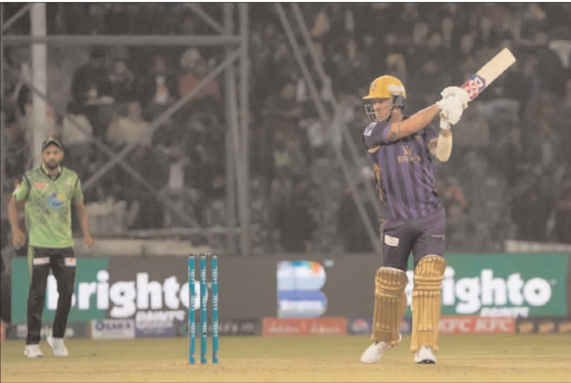
LAHORE: Jason Roy slices one away, Lahore Qalandars vs Quetta Gladiators PSL 2024.