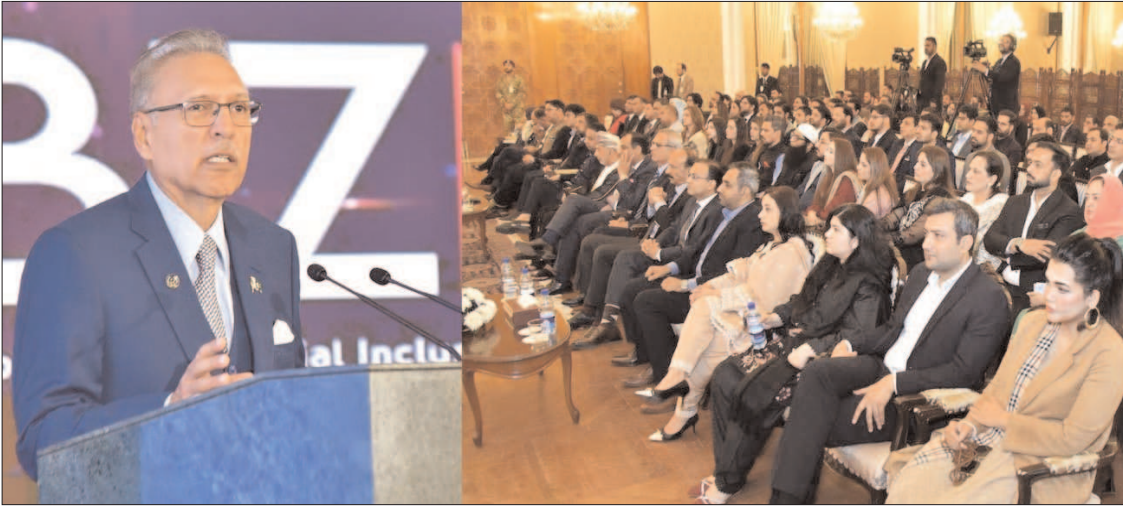
ISLAMABAD: President Dr. Arif Alvi addressing the 3rd edition of Hosting Business Net 2024, a platform to promote financial inclusion and digital transformation, at Aiwan-e-Sadr.