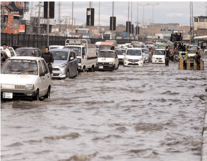
PESHAWAR: A view of vehicles’ passing through accumulated rain water.

PESHAWAR (INP): Seven-day anti polio vaccination drive would start from March 02 in the provincial capital to vaccinate 901,986 children under the age of five against the crippling disease. The campaign would continue till March 08 under the supervision of district administration. 2506 health teams with adequate security would administer the polio drops, said the office of the deputy Commissioner. Deputy Commissioner Afaz Wazir has appealed to the parents to get their children vaccinated for eradication of the disease.