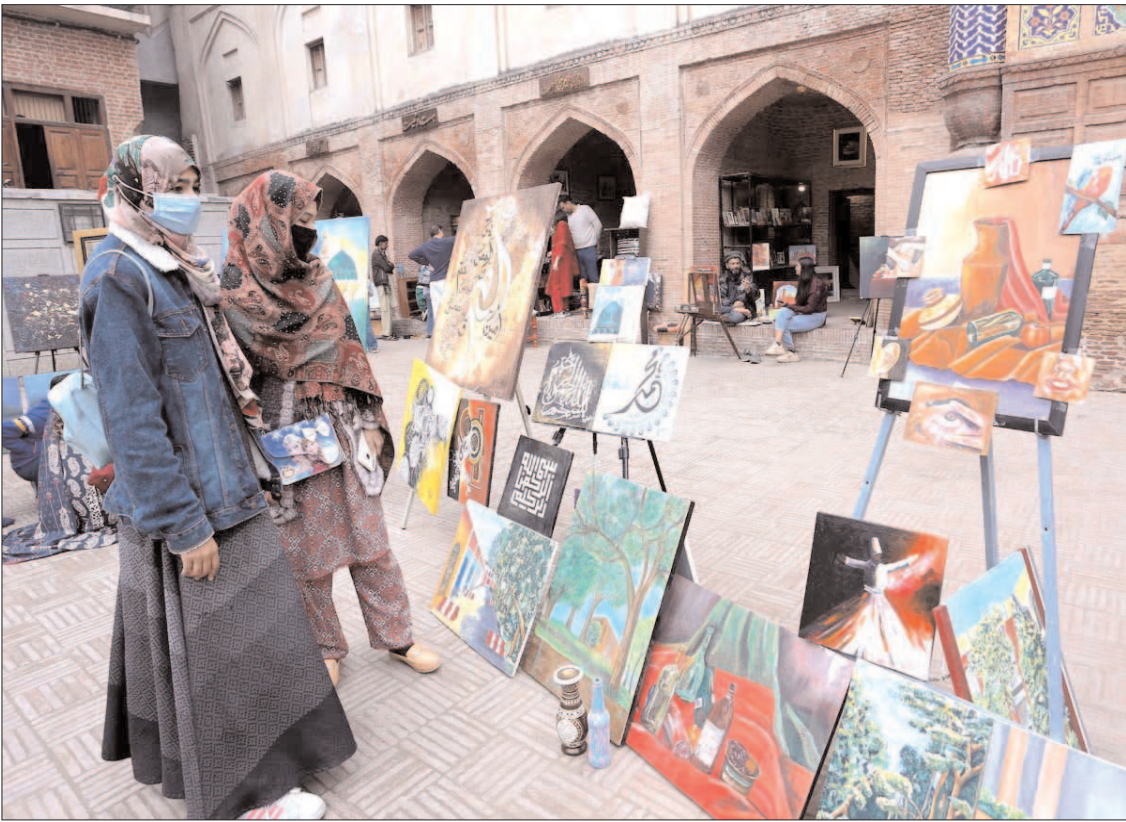
LAHORE: Women viewing artwork during Painting and Calligraphy Exhibition in collaboration with The Formanite School System and Walled City of Lahore Authority.