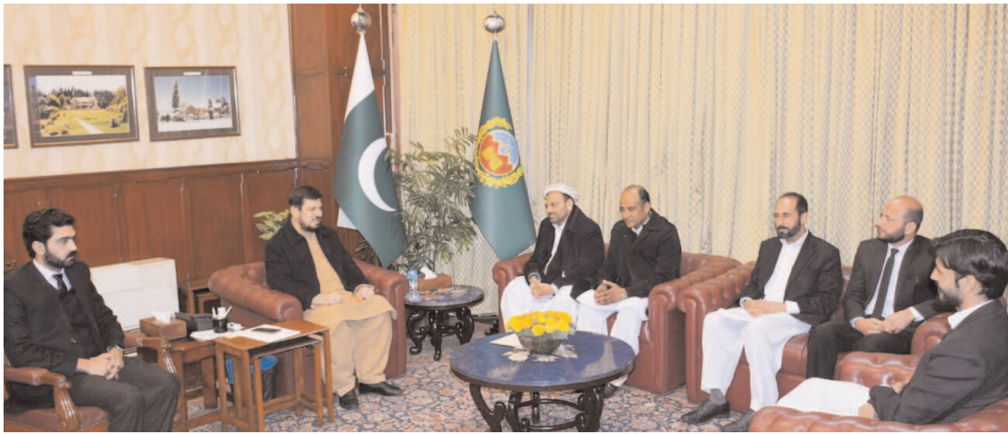
PESHAWAR: Delegation of Charsadda District Bar Association meeting with Governor Khyber Pakhtunkhwa Haji Ghulam Ali at Governor’s House.