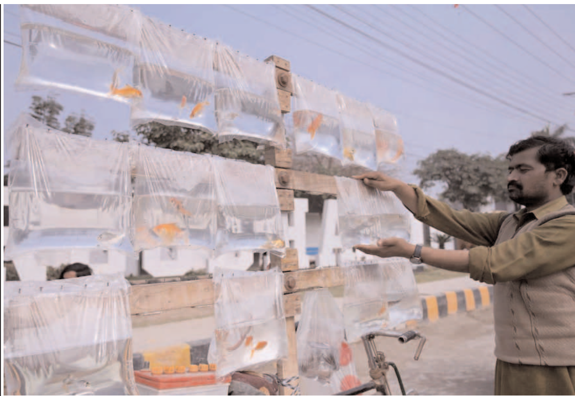
SARGODHA: A vendor selling fishes at Club Road.

Registration Open for Lahore: Interested individuals can register for the upcoming WIBCON conference in Lahore until February 27th, 2024. Visit marketing@pstd.com.pk for more information.