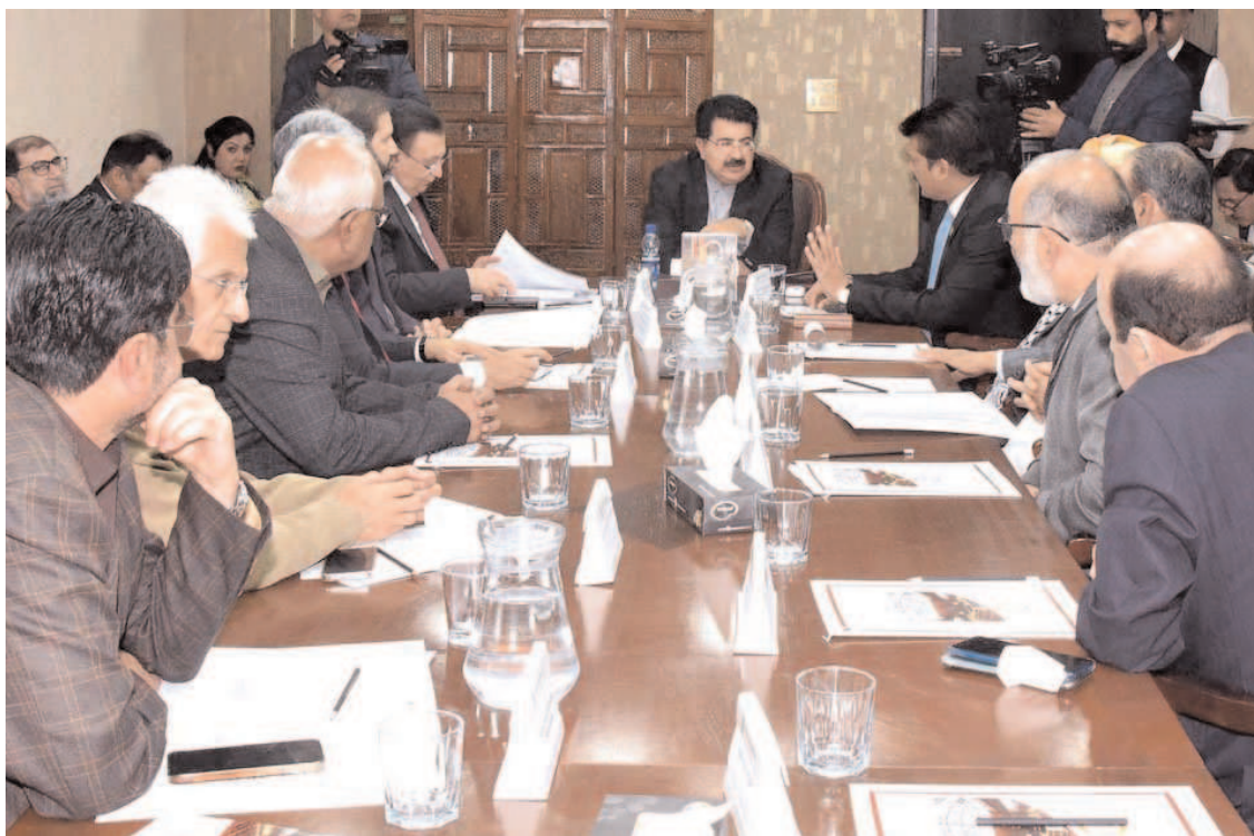
ISLAMABAD: Chairman Senate, Muhammad Sadiq Sanjrani presiding over a Senate House Business Advisory Committee meeting at Parliament House.