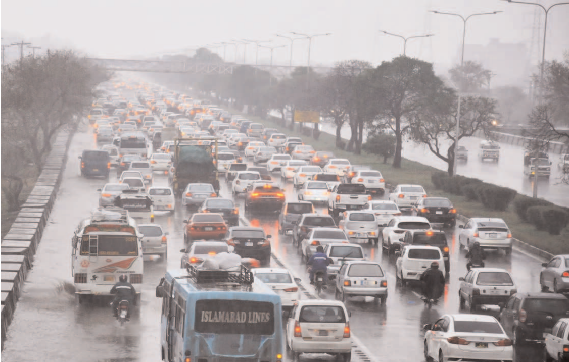
ISLAMABAD: A view of massive traffic jam at Islamabad Expressway during rain that experienced in the Federal Capital.

He said the other facilities included benefits and incentives provided through policy for disabled employees' families, monthly grants to widows scale-wise, the establishment of primary and high schools, industrial schools to teach handicrafts, sports activities, pick and drop facility for schools/offices, installation of water filters plants, a special provision of five medical seats in Riphah Islamic Universities with the reduction of 50 percent in admission and tuition fees.