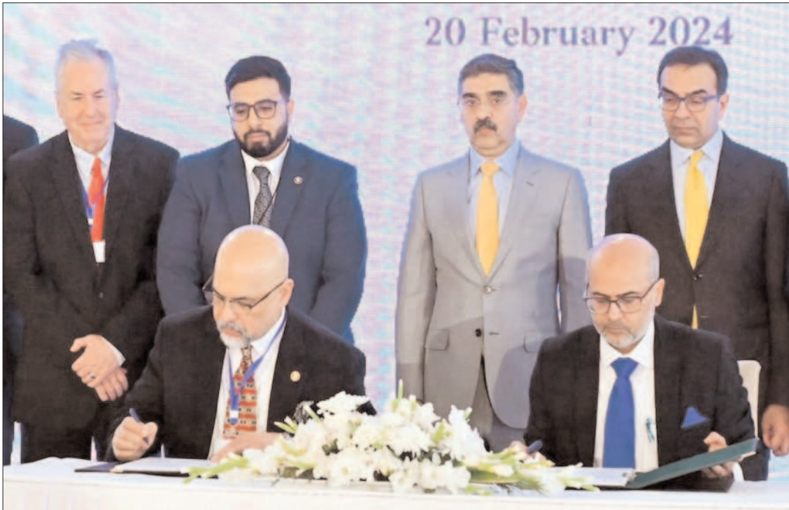
ISLAMABAD: Caretaker Prime Minister Anwaar-ul-Haq Kakar witnessing signing ceremony between Pakistan Mineral Development Corporation and Miracle Saltworks Collective Inc. (USA) for joint venture agreement for the value addition and export of pink salt.