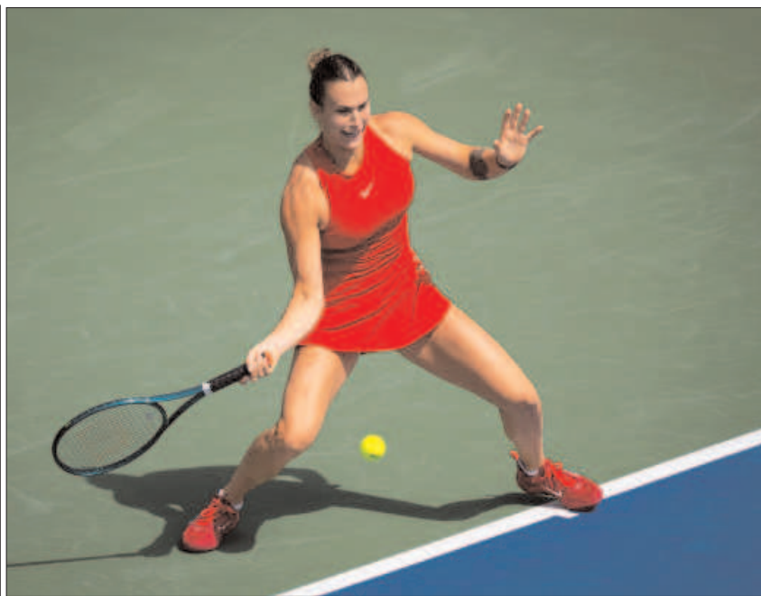
DUBAI: Aryna Sabalenka in action against Donna Vekic of Croatia in the women's singles second round match.

LAHORE (Monitoring Desk): The National U16 One Day Cup 2023-24 is set to kick off on 21 February across three cities, Karachi, Faisalabad and Lahore. The 16 regional teams are divided into three pools with Pool A and B comprising five teams each while Pool C has six teams. In the 50-over tournament, Pool A games will be played in Karachi. The Pool B teams are stationed in Faisalabad while the Pool C games will take place in Lahore. The Pool games will end on 29 February and will be followed by a Triangular stage, set to take place in Faisalabad from 3 March to 7 March. The final of the tournament will be played on 9 March at Bohranwali Ground in Faisalabad.