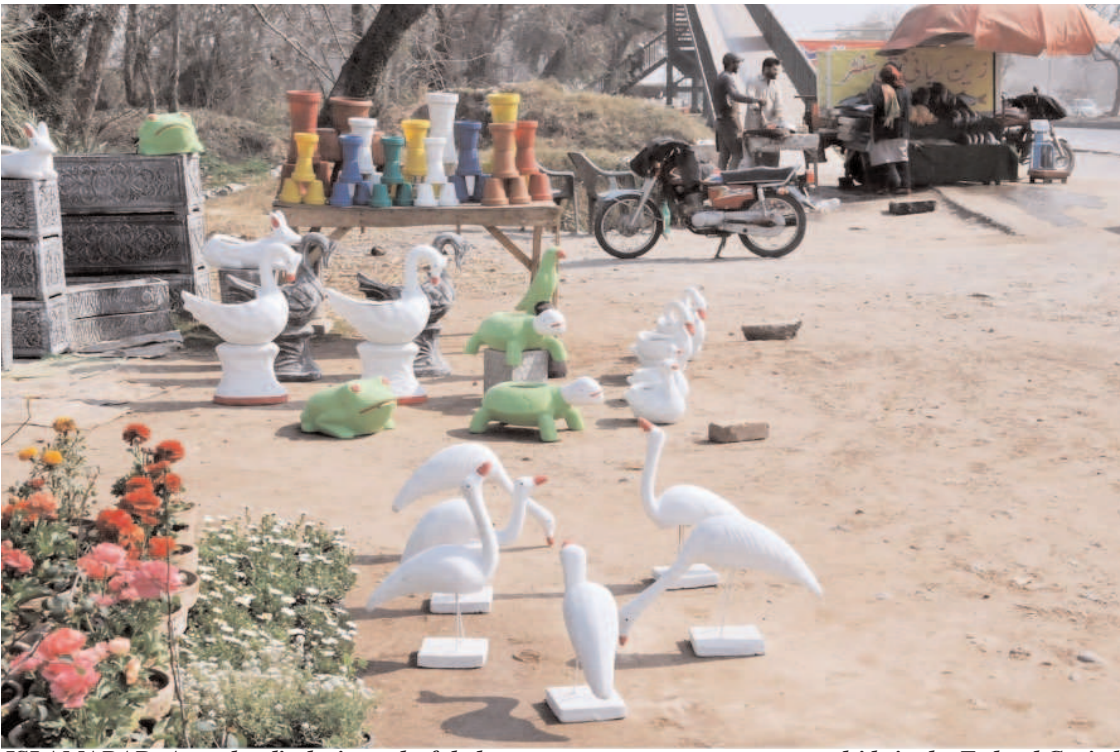
ISLAMABAD: A vendor displaying colorful plant pots to attract customers at roadside in the Federal Capital.

The lowest minimum temperatures recorded were Leh -09 C, Kalam -08, Astore, Gupis, Malam Jabba -05, Skardu and Bagrote -03 C.