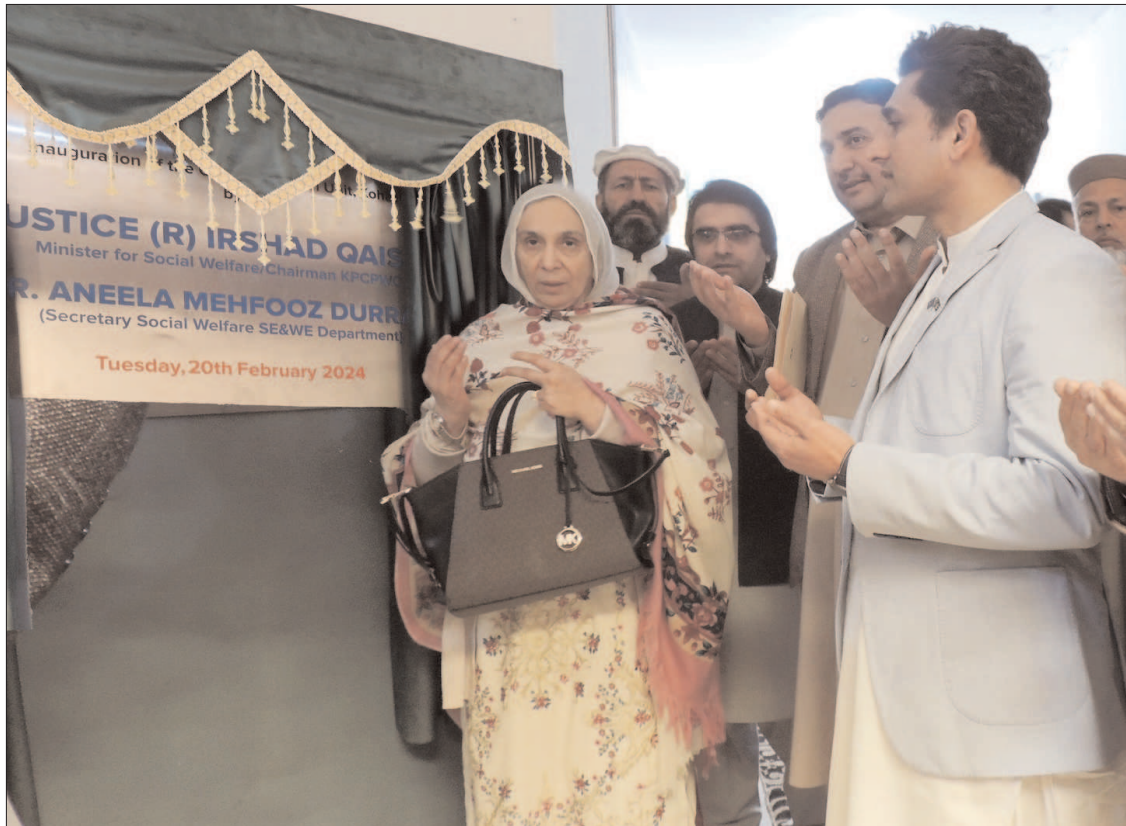
KOHAT: Khyber Pakhtunkhwa Caretaker Minister for Social Welfare, Special Education and Prisons Irshad Qaiser inaugurating Child Protection Unit at Nishtar Special Education Center.