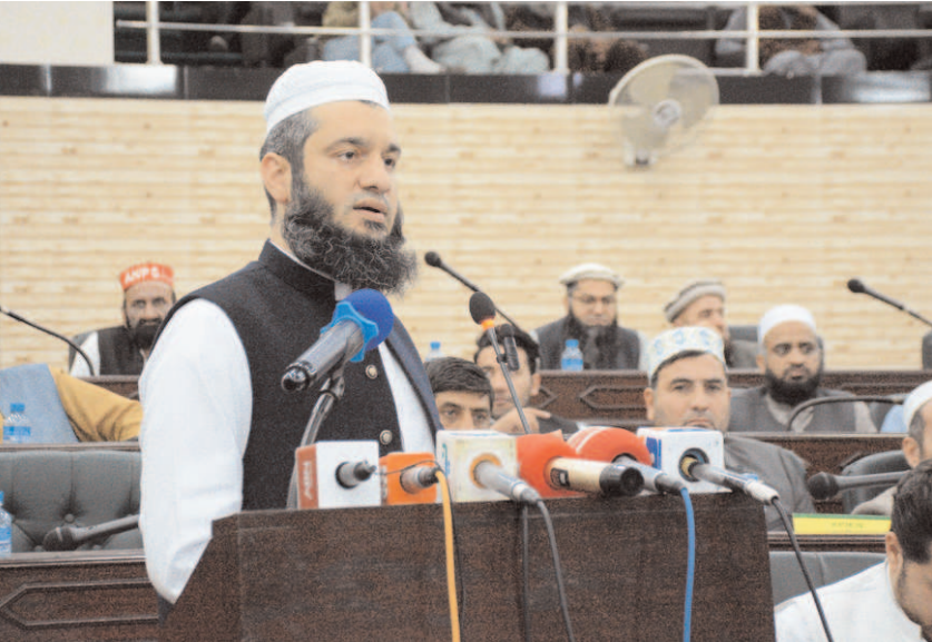
PESHAWAR: Mayor Haji Zubair Ali addressing City Council monthly meeting.