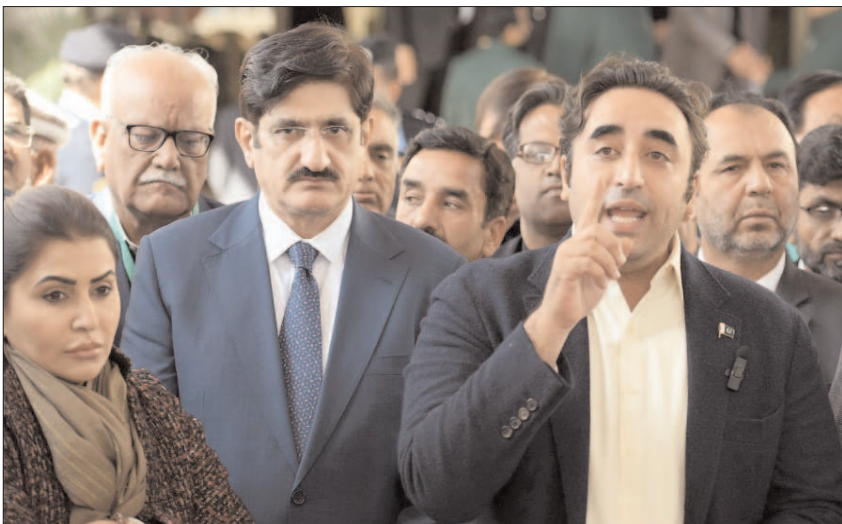
ISLAMABAD: Chairman PPP Bilawal Bhutto Zardari talking to media persons at Supreme Court.

This marks the third time the US has vetoed Gaza ceasefire proposals at the Security Council since the start of the war. The UN Security Council is now meeting to vote on a resolution brought by Algeria that calls for an immediate ceasefire in Gaza. The US ambassador the UN, Linda Thomas-Greenfield, has already telegraphed her intention to veto this resolution.