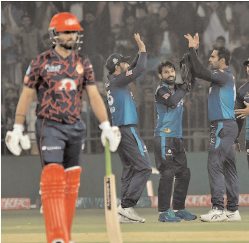
MULTAN: Multan Sultans team players celebrating after taking the wicket of Islamabad United batsman Colin Munro during the PSL Twenty20 cricket match.

LIVERPOOL (Agencies): Diogo Jota faces "months" on the sidelines after damaging his knee in Liverpool's win at Brentford, adding to manager Jurgen Klopp's mounting injury woes as they chase Premier League glory. Saturday's 4-1 win victory in London on Saturday came at a heavy cost as forward Jota and midfielder Curtis Jones were both forced off in the first half. Jones left the stadium on crutches after injuring his ankle and Jota departed on a stretcher, while forward Darwin Nunez was also withdrawn with a knock. Goalkeeper Alisson Becker, Trent Alexander-Arnold and Dominik Szoboszlai will be sidelined for Liverpool's home match against struggling Luton at Anfield on Wednesday while Thiago Alcantara and Joel Matip remain out of action. Speaking about the injury situation on Tuesday, Klopp, whose team are two points clear of second-placed Arsenal, said the situation was "not great". "I would like to sit here and say we have absolutely no issues but obviously we have some," the Liverpool boss said on Tuesday. "So, not available is obviously Ali (Becker). That's a muscle injury where we don't know exactly how long it takes but definitely not for the foreseeable time coming back. "Then we have Diogo with a knee issue, is ruled out. Curtis, with a bone/ligament issue, ruled out.