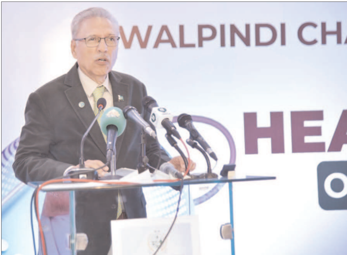
RAWALPINDI: President Dr. Arif Alvi addressing the National Health Summit on dental hygiene organized by Rawalpindi Chamber of Commerce and Industry.