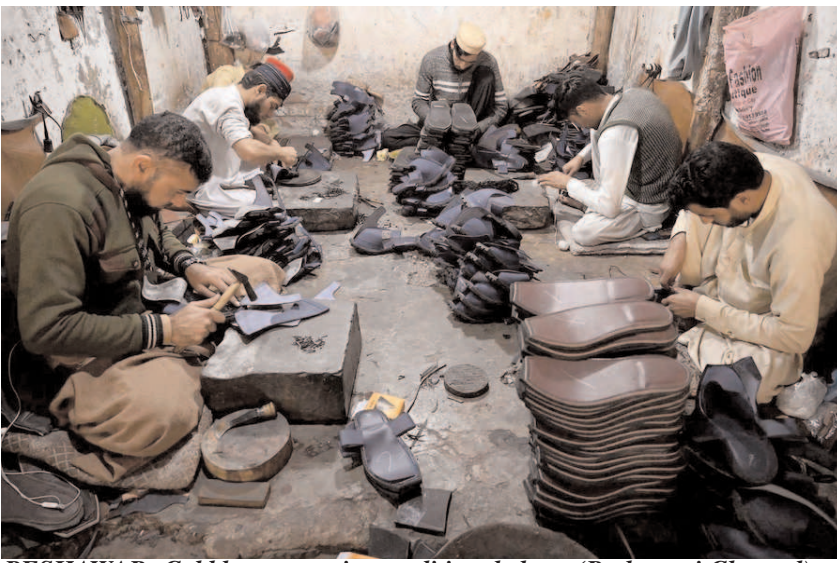
PESHAWAR: Cobblers preparing traditional shoes (Peshawari Chappal) at his workplace.

PESHAWAR (APP): The Khyber Pakhtunkhwa Food Safety and Halal Food Authority on Tuesday conducted a targeted inspection against adulteration in Peshawar, resulting in the seizure of a significant quantity of hazardous cold drinks. The pokesperson for the Authority provided details of the operation, stating that the food safety team in Peshawar recently conducted a raid at the Motorway Toll Plaza, inspecting vehicles transporting food and beverage items into Peshawar city. During the inspection, Food safety team confiscated over 1200 liters of substandard juice from one vehicle. The owner of the vehicle was heavily fined, and further legal action will be taken in accordance with the Food Safety Act. Director General of the Food Safety Authority, Shafiqullah Khan, praised the success of the operation and urged all teams to escalate their efforts in combating the adulteration mafia across the province. He stressed a zero-tolerance policy towards compromising health standards and promised stringent punitive measures against those involved in such activities.