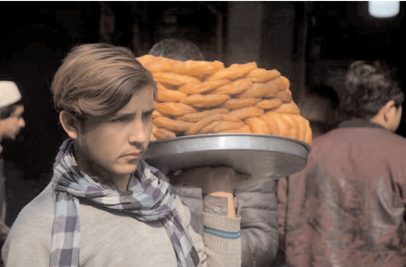
PESHAWAR: Youngster selling and displaying traditional sweet item donuts to attract customers at Khyber Bazaar.

Ittehad Council, PTI has opted to withdraw the case. The Sunni Ittehad Council, meanwhile, has also petitioned the Election Commission for specific seats, further highlighting the evolving political landscape in Khyber Pakhtunkhwa. This development comes as PTI solidifies its collaboration with independent candidates and seeks to bolster its position in the aftermath of the general elections.