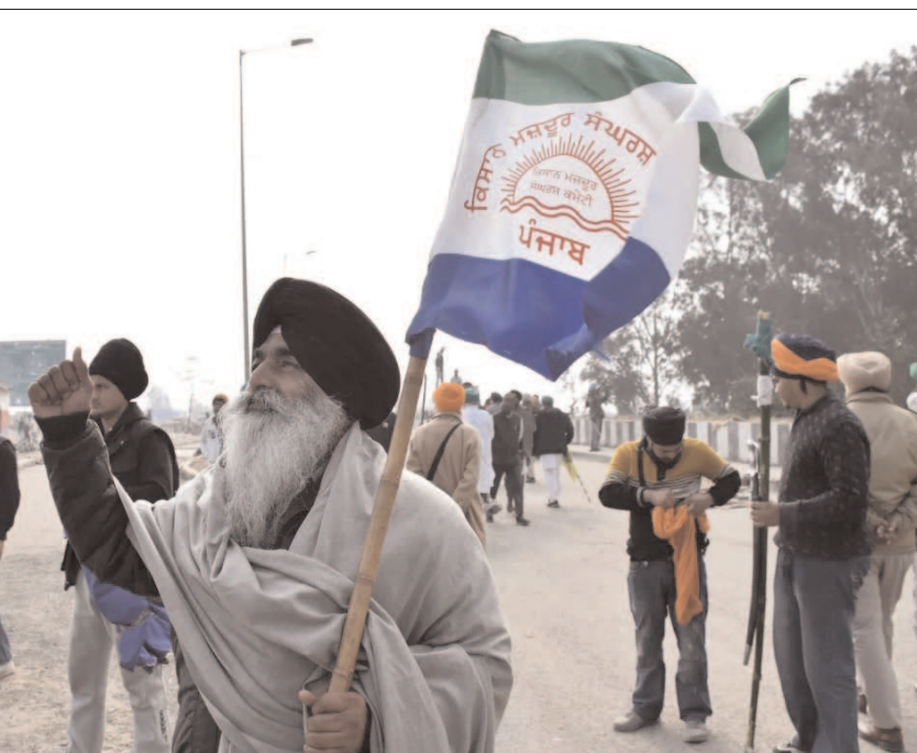
NEW DELHI: Indian farmers at the Shambhu Haryana-Punjab border point during a protest for acceptance of their demands.

The demands include a ceasefire, an Israeli withdrawal from Gaza, an end to Israel's blockade of the territory and safe shelter for hundreds of thousands of displaced Palestinian civilians. Israel has vowed to destroy Hamas in response to its unprecedented October 7 attack that resulted in the deaths of 1,160 people, mostly civilians, according to an AFP tally of official Israeli figures. Its retaliatory offensive has killed 29,195 people in Gaza, mostly women and children, according to the Hamas-run territory's health ministry.