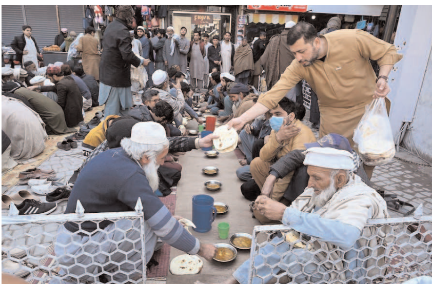
PESHAWAR: Volunteers distributing free food among deserving people in Sadar Bazaar.

PESHAWAR (INP): Railway Police in Peshawar conducted a successful operation at Peshawar City Station, apprehending two women for smuggling narcotics via train. The suspects were caught by SHO Jamal Abdul Nasir and other officers based on suspicion at the internal passage of Peshawar City Station. Upon inspection, more than 2 kilograms of narcotics were recovered from the possession of the women, including 1.6 kilograms of ice drug and 500 grams of heroin. The suspects had concealed the narcotics in plastic wraps hidden within women's undergarments and clothing. SSP Peshawar Mahrukh Kausar stated that the female suspects intended to transport the narcotics via Awam Express train from Peshawar to Gujranwala. Cases have been registered against both women at Cantt Railway Police Station Peshawar, and investigations have commenced.