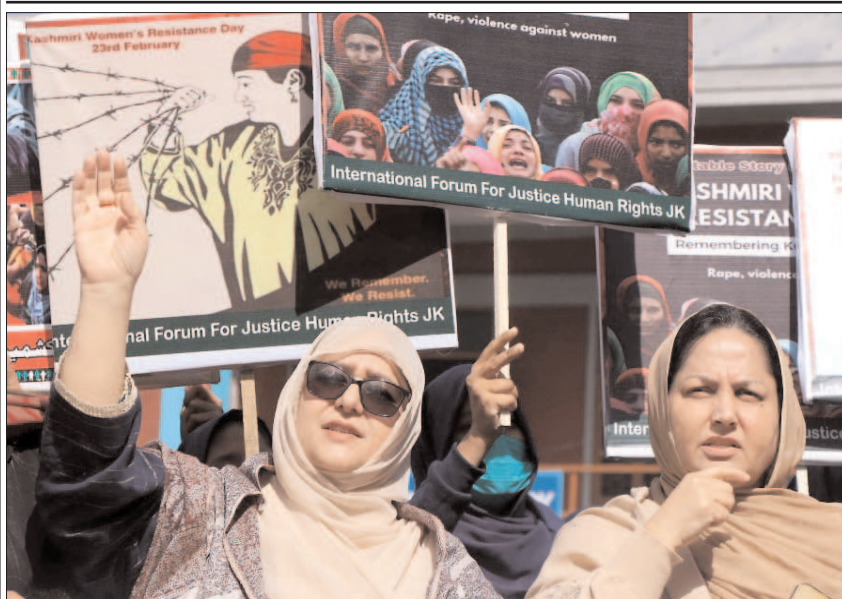
MUZAFFARABAD: Women activists of International forum for justice chanting slogans during a protest ahead of Kashmiri Women’s Resistance Day.