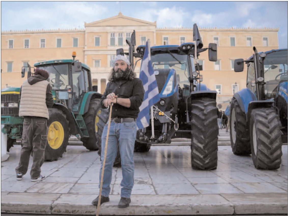
ATHENS: Greek farmers honked their tractor horns in front of the Hellenic Parliament, after spending the night in central Athens as their protest against rising fuel and production costs stretched into a second day.