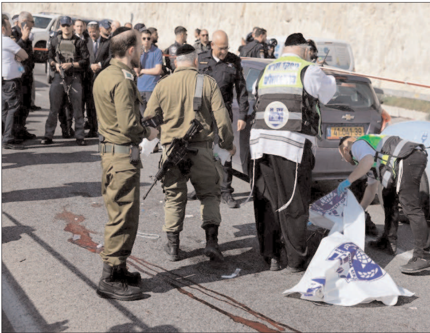
WEST BANK: Israeli officials working at the scene of a shooting attack by Palestinian gunmen near the Maale Adumim settlement.

The minister stated categorically that no one would be allowed to take the law into their hands and disturb the peace and tranquility of the country. "Pakistan is a peaceful country with rule of law and lawlessness and anarchy will not be allowed to be spread in the country," he added. He said all foreigners living in Pakistan should feel assured that they were safe and their security would be ensured by the Pakistan government.