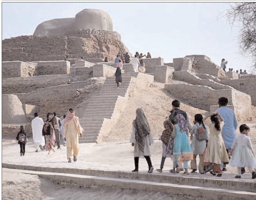
LARKANA: People visiting at the world famous archaeological site of Moen-Jo-Daro.