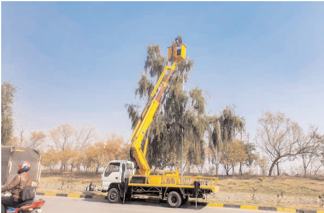
ISLAMABAD: CDA staffer busy installing new street lights near Faizabad in the Federal Capital.

The protection of important public and private property and embassies located in the high security zone is of paramount importance. The Citizens are also urged to cooperate with the police and report any suspicious activity on "Pucar-15".