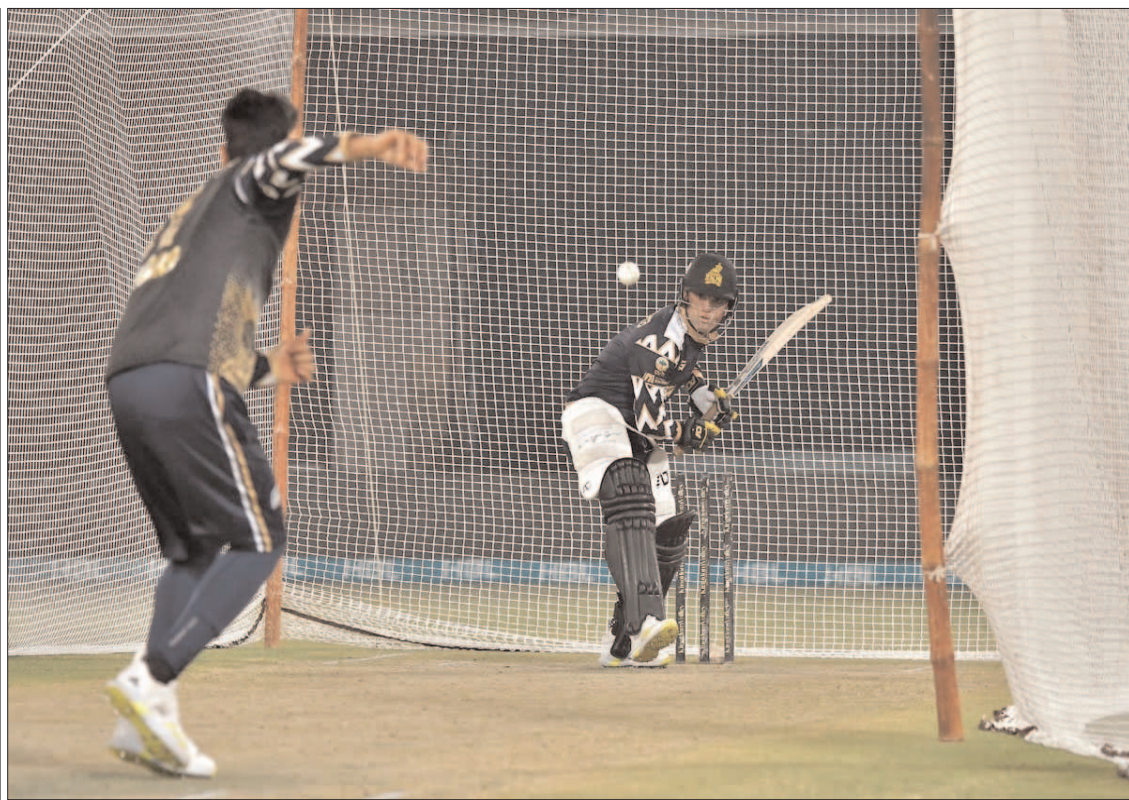
MULTAN: Players of Peshawar Zalmi participating in a practice session for the next match against Multan Sultans during PSL-9 T20 match at Multan Cricket Stadium.