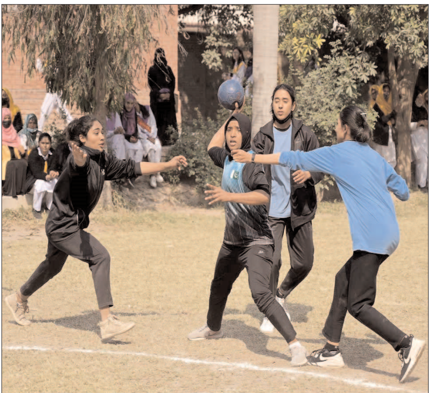
SARGODHA: Players in action during inter-collegiate Girls Handball tournament organized by Sargodha Education board at Govt Women College Farooq Colony.

The event was attended by esteemed guests, including media representatives, sports personalities, diplomats, and other stakeholders committed to promoting sports and international cooperation.