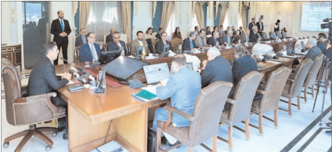
ISLAMABAD: Caretaker Prime Minister, Anwaar-ul-Haq Kakar chairing a meeting of federal cabinet.

Vol. XXXIXI No. 32 Regd. No. 241 SHABAAN 12 1445 -- FRIDAY, FEBRUARY 23 2024 PESHAWAR EDITION 12 PAGES PRICE. 30