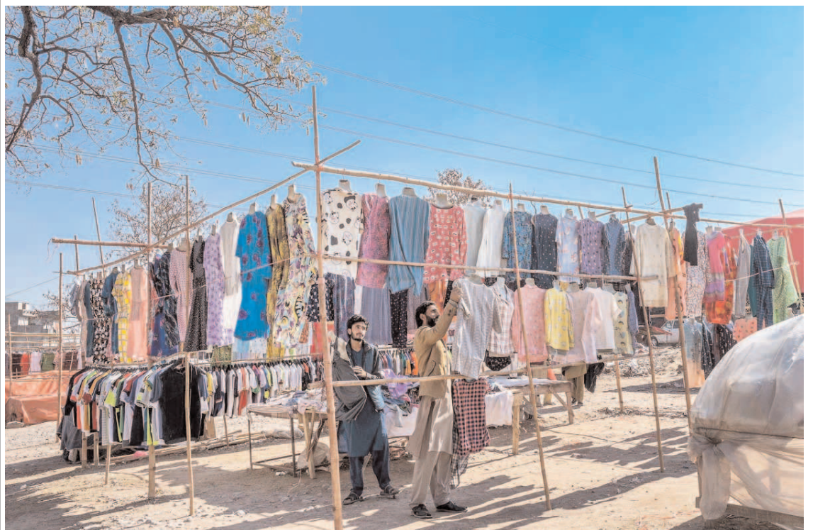
ISLAMABAD: A vendor displaying second-hand clothes to attract customers at Khanna Pul.