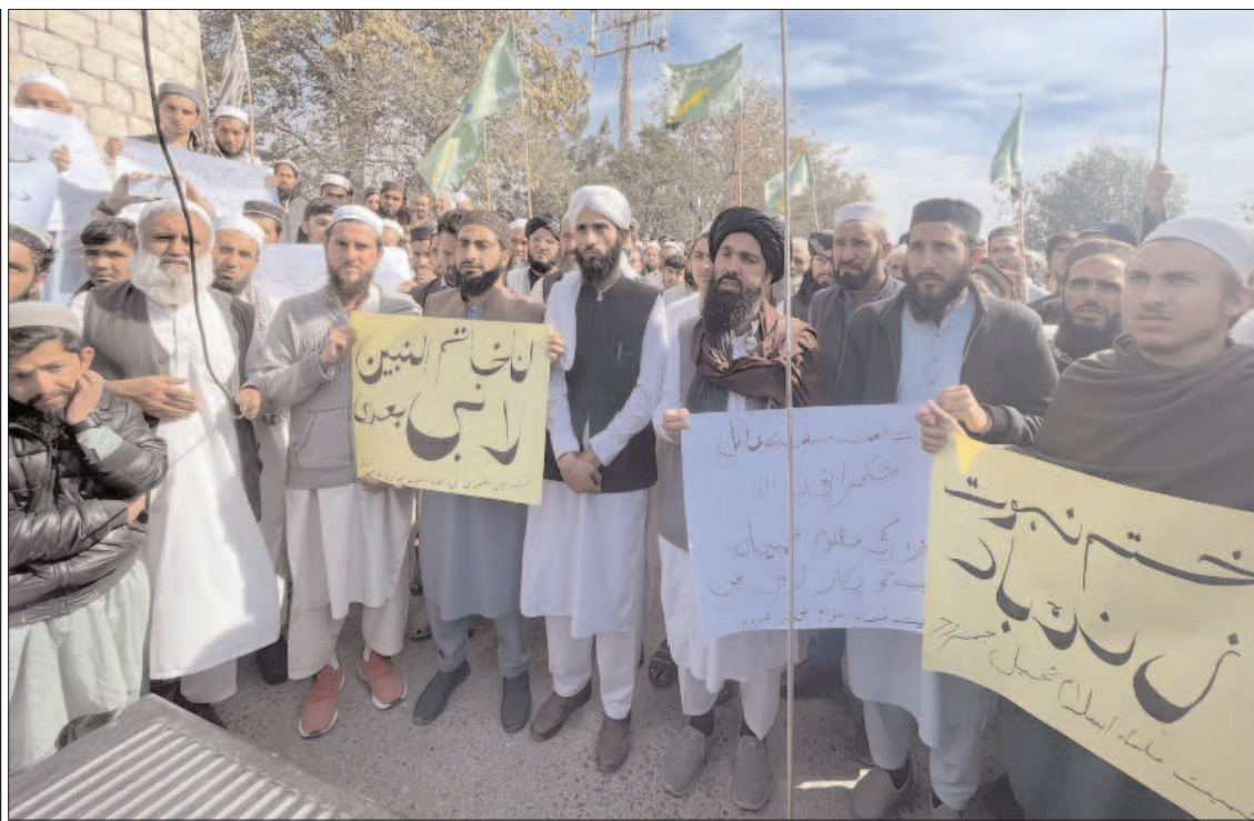
JAMRUD: Workers of religious party holding a protest rally at Bab-e-Khyber against disputed decision of Supreme Court.