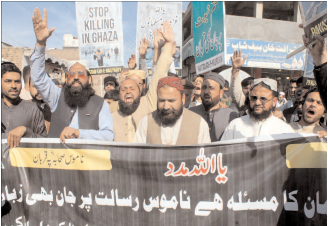
PESHAWAR: Activists of Pakistan Rah-e-Haq party holding a protest to show solidarity with Palestinian people.

The accused were arrested from Bathkela Malakand and Dargai Bazar, the official of the FIA said. He said during the raid, domestic and foreign currency was recovered from the accused. A total of 19,97,000 Pakistani rupees and 700 Saudi riyals were recovered from the accused, FIA official said, adding, Hundi reference and records related to foreign currency were also recovered from the two alleged accused.