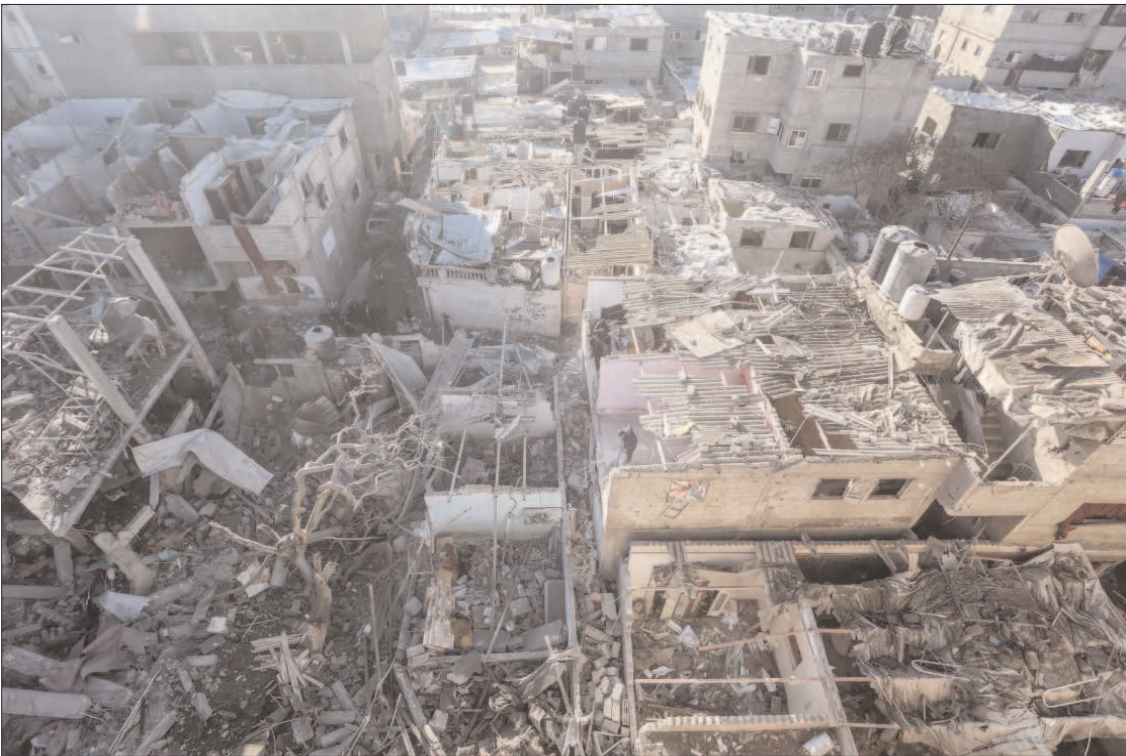
GAZA: A view of the destroyed Al-Farooq Mosque and damaged buildings after Israeli attacks on Shaboura neighbourhood in Rafah.

He said once they had left the capital other cities would follow, noting there "will be no more checkpoints and no more armed groups" on roads. The deal will see at least five armed groups quit Tripoli by the end of the Muslim holy month of Ramadan on 9 April, including one based in an area where 10 people were killed over the weekend.