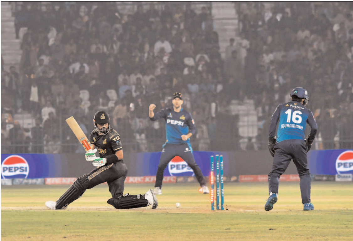
MULTAN: Peshawar Zalmi batter Babar Azam clean bowled by the Multan Sultans bowler Usama Mir during the PSL 9 T20 cricket match between Multan Sultans and Peshawar Zalmi at Multan Cricket Stadium.