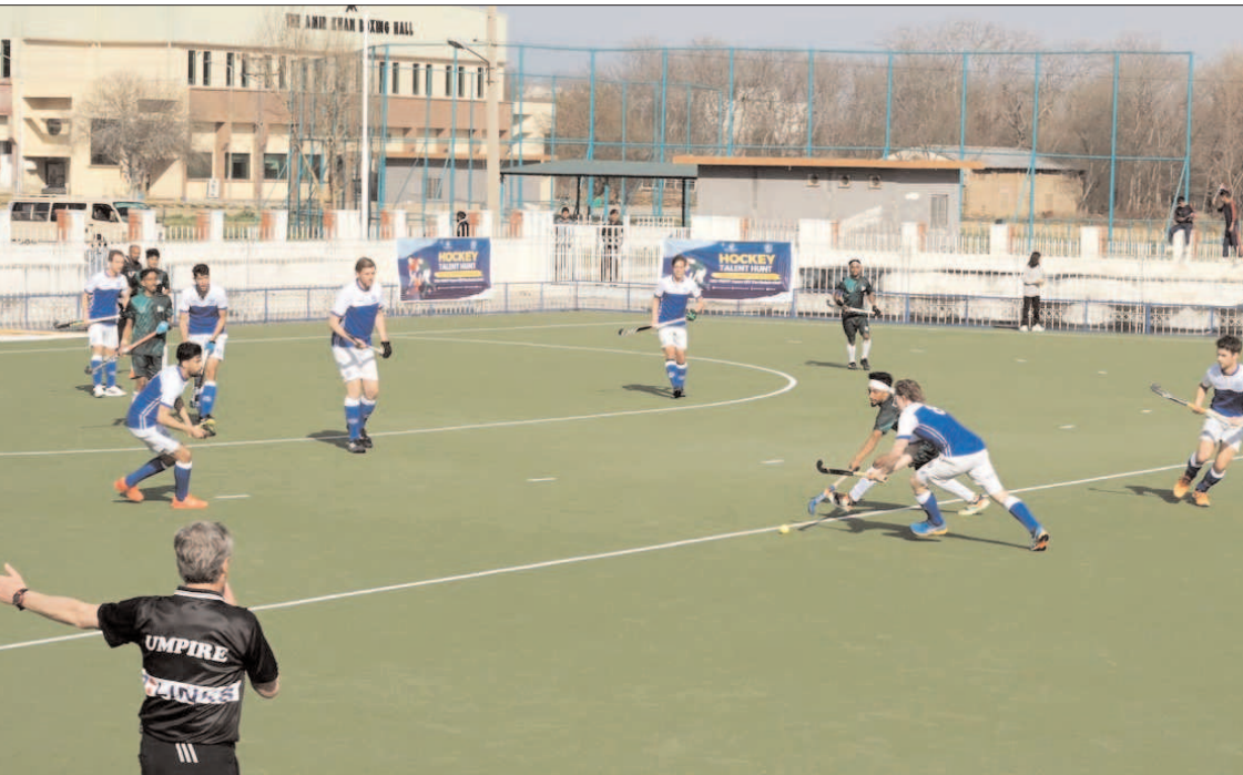
ISLAMABAD: Players in action during HEC-PMYP V/S The Dutch Club teams during Welkom Oldenzaalse Hockey Club Hockey Talent hunt youth sports league organized by Prime Minister'' Youth Program at Sports Complex.

It should be noted that under the supervision of the Khyber Pakhtunkhwa Badminton Association, these players are playing in the Directorate General Sports Badminton Academy, who have got the opportunity to come forward with the joint efforts of the coaches and the association and the support of the Directorate Sports.