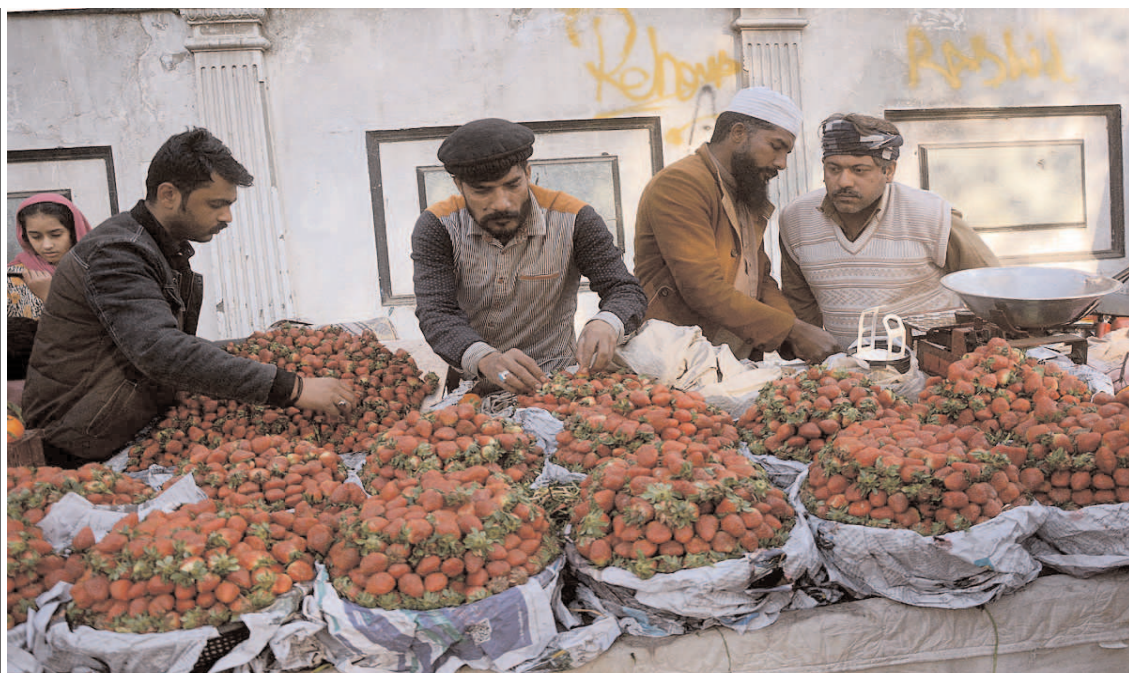
LAHORE: Vendors arranging and displaying strawberry to attract the customers.

Their contributions added immense value to today's discussions and furthered collective understanding of the challenges and opportunities in addressing climate change.