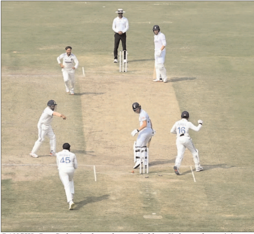
RANCHI: Ben Stokes is cleaned up as Kuldeep Yadav and co rejoice.

Bashir, 20, who missed England's win in the first Test due to a visa issue, trapped debutant Akash Deep lbw for his fifth wicket and kissed the ground in celebration.