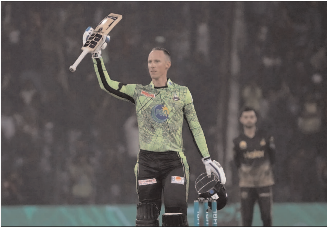
LAHORE: Rassie van der Dussen brought up the season's first century, Lahore Qalandars vs Peshawar Zalmi.