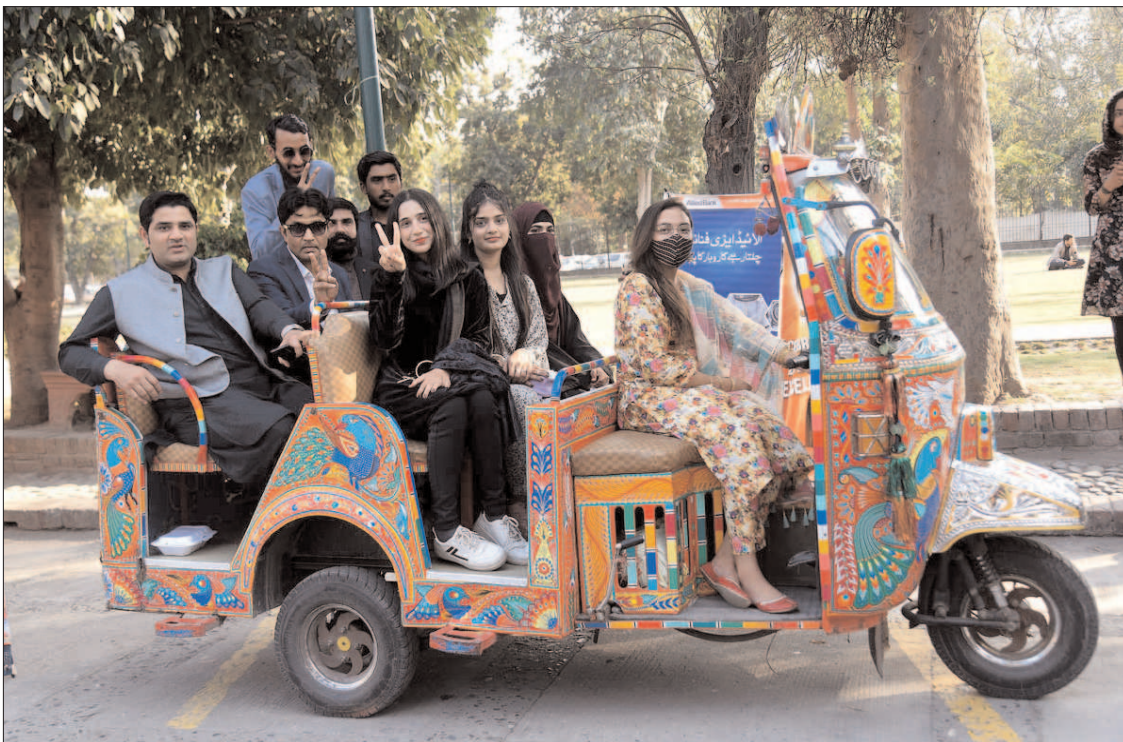
LAHORE: People enjoy traditional ricksaw ride during the Lahore Literary Festival at Al Hamra.