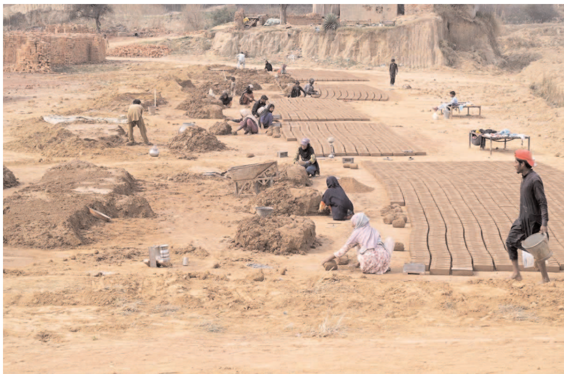
ISLAMABAD: Labourers busy preparing bricks at local bricks kiln.

women-led initiatives and art and photo exhibitions. About the other activities under this mega event, the official informed that an insightful panel discussion, successful storytelling session, art and photo exhibition and project and product exhibits will also be part of the event. The insightful panel discussion will be aimed at providing a comprehensive understanding of the multifaceted challenges and opportunities women face within the realm of climate action. The success storytelling session will highlight the women doing notable work in climate action and give them a platform to narrate their stories and experiences and the hardships they have faced in their tremendous efforts.