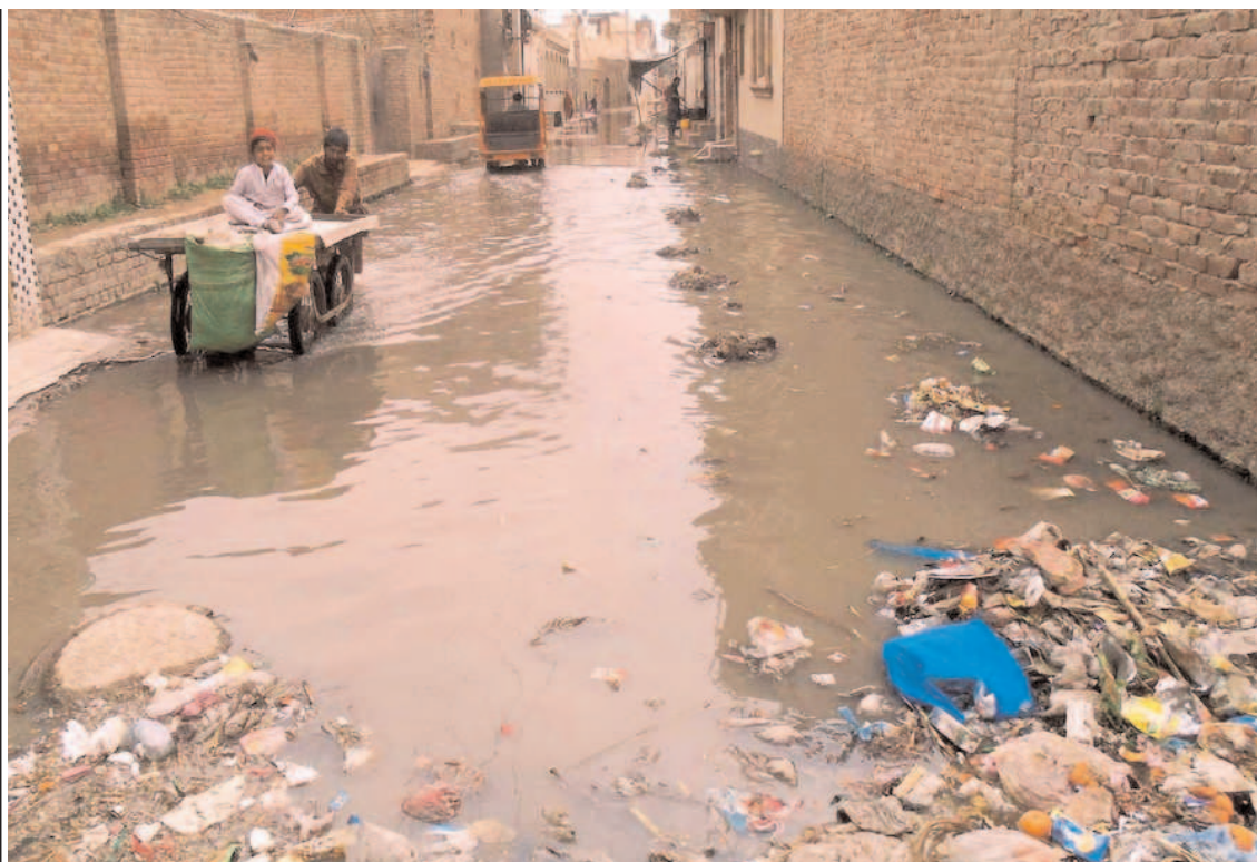
CHINIOT: A view of accumulated water and blocked sewerage at Riaz Shah Kothi Road needs attention of concerned authorities.

Cases were registered against the accused.