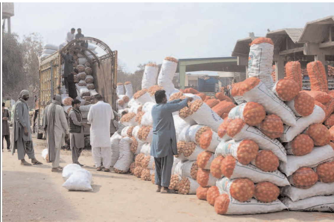
MULTAN: Laborers unloading onions from delivery truck at vegetable market.