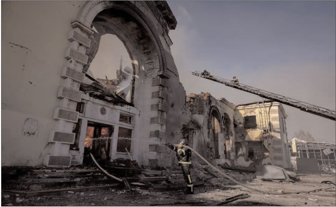
KOSTYANTYNIVKA: Firefighters work at the scene of a Russian missile strike that destroyed a train station, amid Russia's attack on Ukraine.