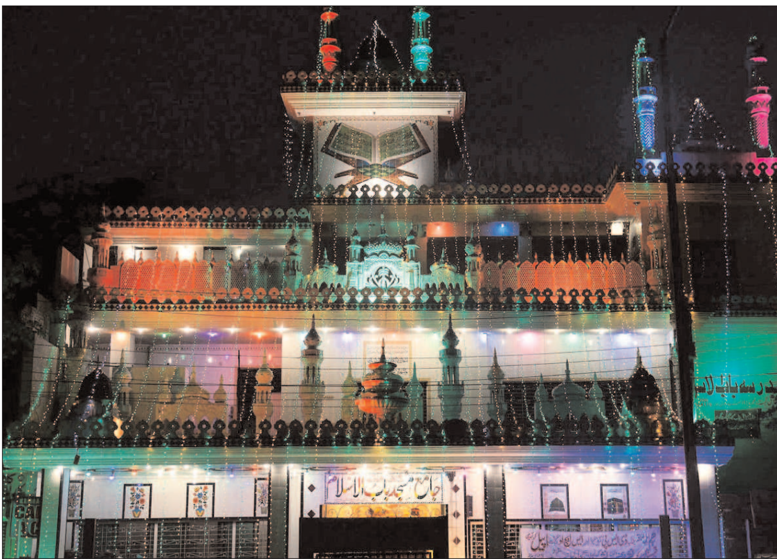
LAHORE: An illuminated view of mosque decorated with colourful lights in connection with Shab-e-Barat in the Provincial Capital.

Meanwhile, Punjab CM Mohsin Naqvi has congratulated children on the completion of the upgradation project of the Safari Park and Lahore Zoo.