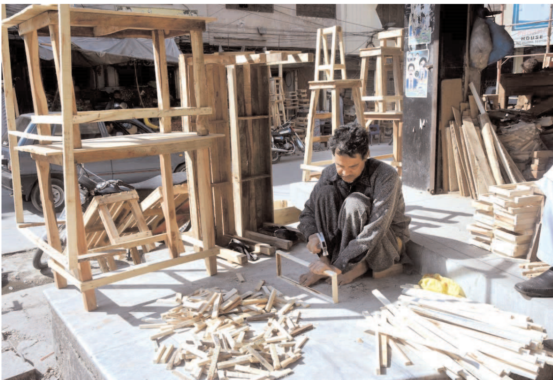
RAWALPINDI: Artisan busy making wooden bench at Banni Chowk.

ISLAMABAD (APP): ECO Science Foundation in collaboration with the Iranian Association of e-Learning (YADA), University of Isfahan will arrange the 17th International and 11th International Conference on "e-Learning and e-Teaching (ICLeT)" Focusing on Technology Enhanced Learning" from February 27-29. According to an official of ECOSF, the conference, scheduled to be held in Isfahan, Iran, will bring together leading academic scientists, researchers and scholars in the domain of interest from around the world. The conference will revolve around different themes including Artificial Intelligence and Advanced Technologies in e-Learning, Innovative Educational Approaches in e-learning, E-Learning and Informal Education, Generative AI and e-Learning, Psychological, Social, Legal, and Economic Aspects of e-learning, Best Practices in e-learning and Evaluation and Quality Improvement in e-Learning. This conference provides the premier interdisciplinary forum for researchers, practitioners and educators to present and discuss the most recent innovations, trends, concerns, practical challenges encountered and the solutions adopted in the field of e-Learning and e-Teaching, the official informed. The main segments of the conference include Keynote speeches, Panel discussions, Paper and poster presentations, Report on the best practices, Workshops and an Exhibition.