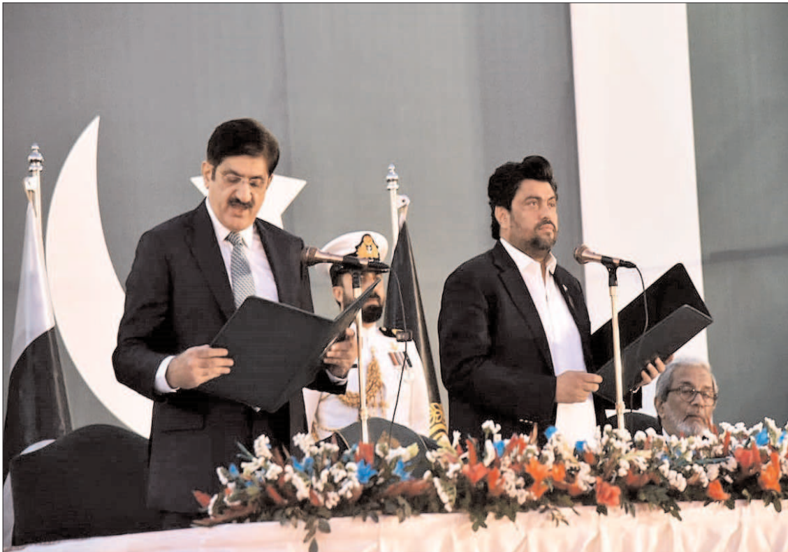
KARACHI: Governor Sindh, Kamran Khan Tessori administering the oath to the Newly-elected Chief Minister Sindh, Syed Murad Ali Shah.