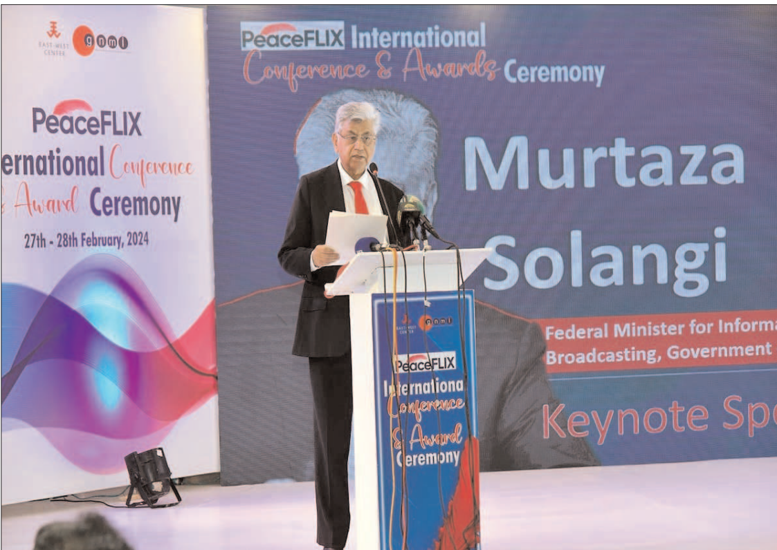
ISLAMABAD: Mr. Murtaza Solangi Caretaker Federal Minister for Information and Broadcasting addressing a PeaceFLIX International Conference and Award Ceremony.

Matthew Miller reiterated the US stance that there should be a transparent investigation into claims of rigging in general elections. Answering a question regarding massive rigging in elections, the spokesperson said: "For investigations into reported irregularities, we want to see those investigations proceed. We want to see them wrapped up as soon as possible. Replying to a question, Matthew Miller said: "We want to see a government move forward in a way that reflects the will of the Pakistani people."