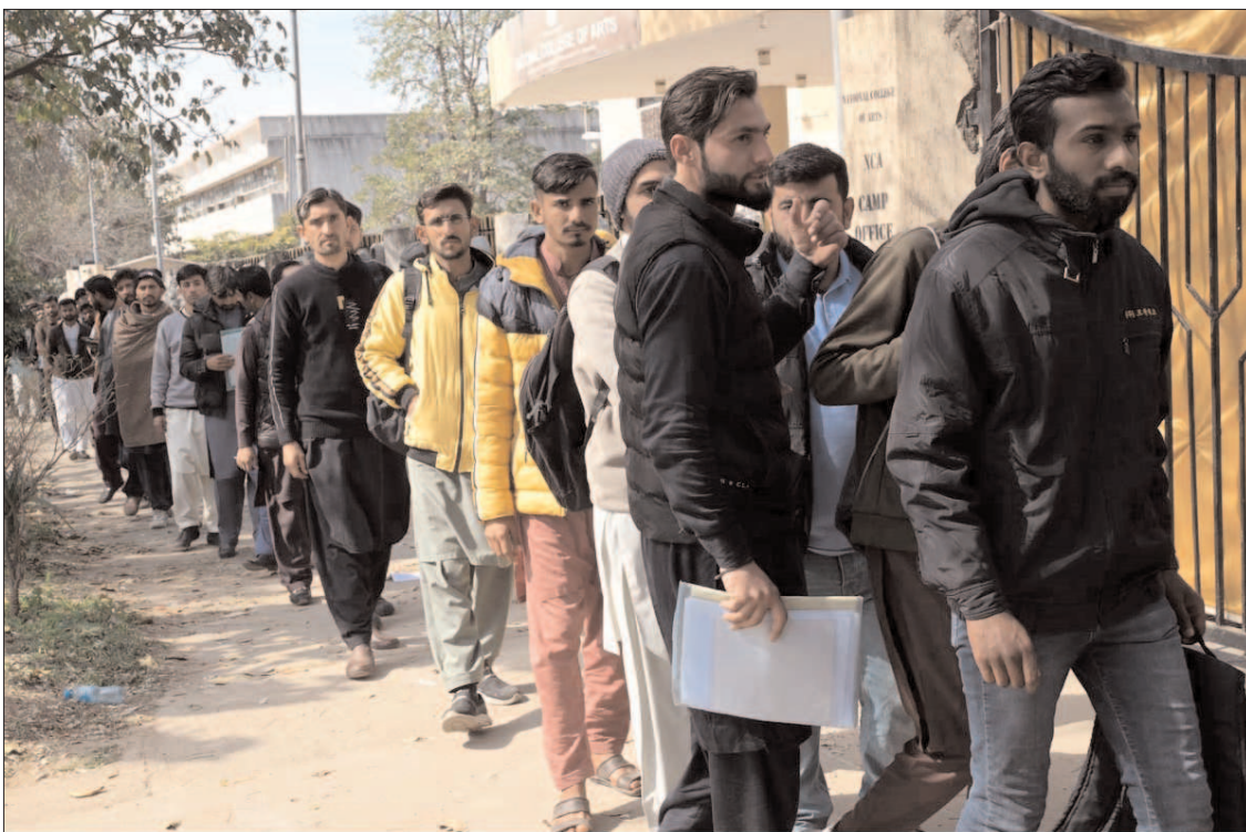
ISLAMABAD: A large number of people submitting visa forms for Korea at Manpower office.