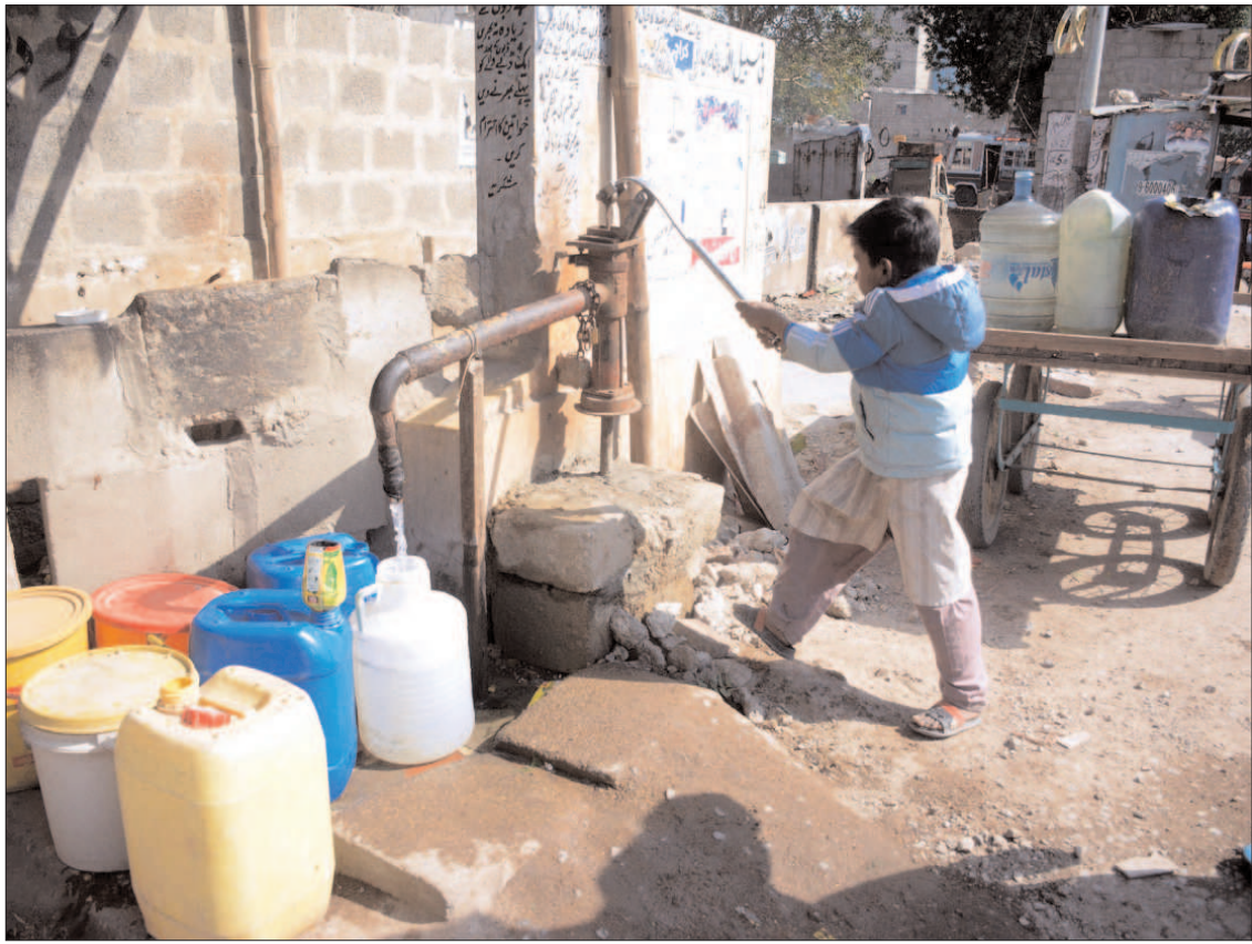
KARACHI: A boy using hand pump at community water well to collect drinking water.