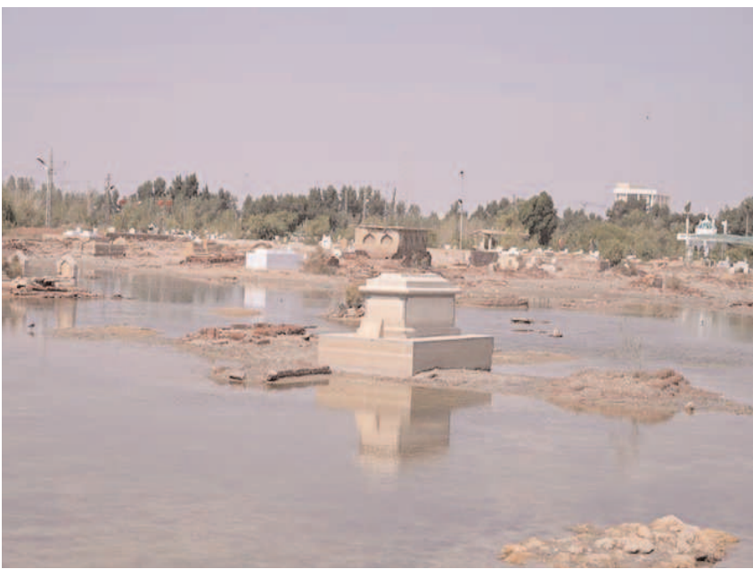
HYDERABAD: A view of sewerage water at cant graveyard need the attention of concerned authorities.

He said that we could save precious human lives to donate blood and it was a big means to get blessing of almighty Allah. Goodness never wastes and blood donation is such goodness which return to us tenfold in this world, he said and added that all youth should come forward to donate blood for thalassemic patients voluntarily to their lives.