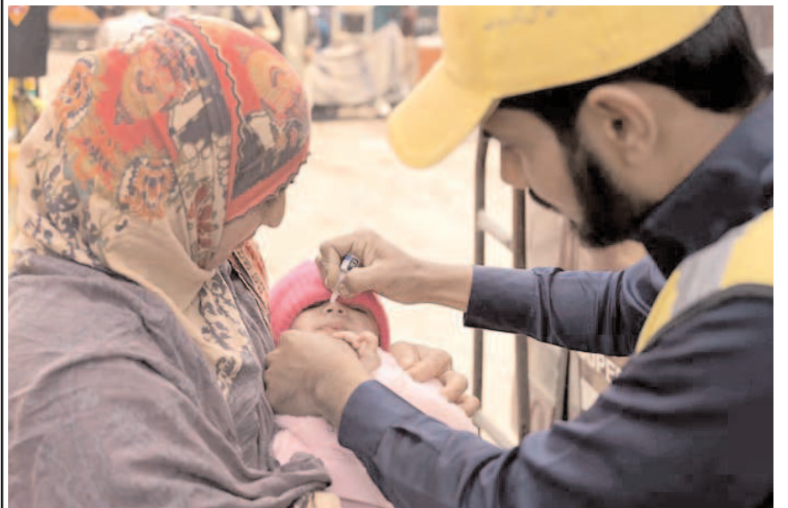
SARGODHA: A health worker administering polio drops to child at Nori Gate.

Traditionally, the deceased is buried alongside items reflecting their daily life, although modern practices exclude the inclusion of firearms. Following the burial, the widow of the deceased observes a period of mourning inside the home, receiving separate provisions for sustenance. Despite the financial strain posed by the sacrifice of numerous animals, the Kailash people steadfastly uphold the age-old customs, considering them integral to their cultural identity.