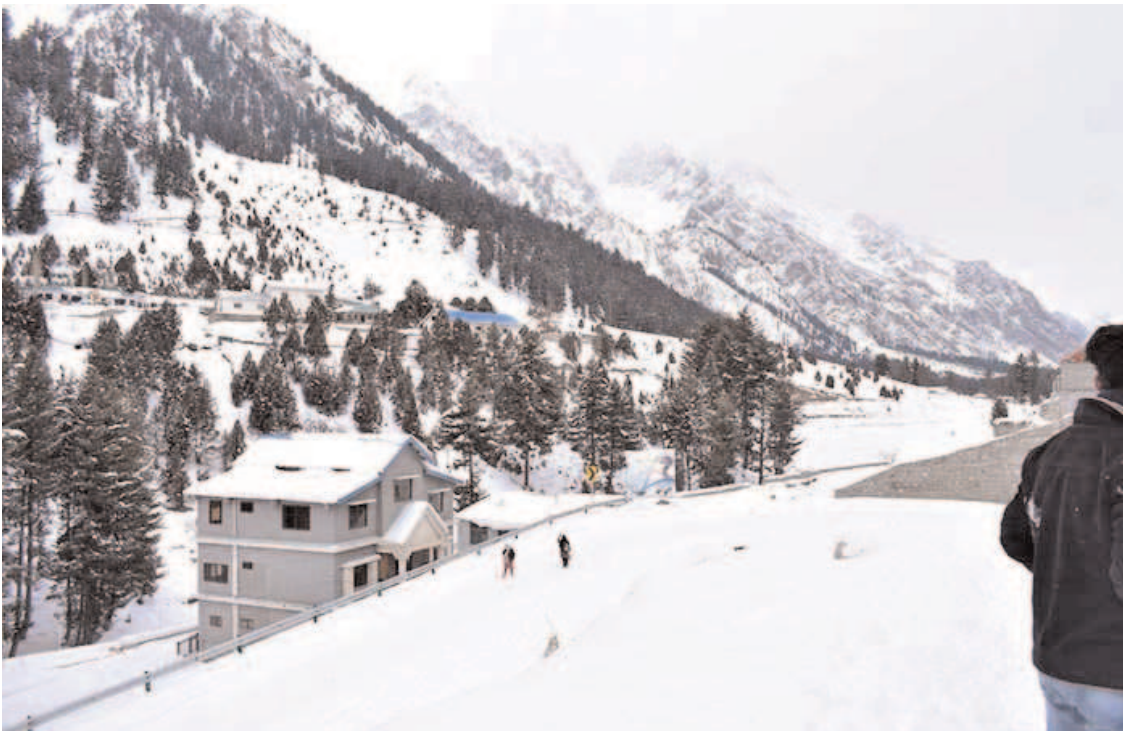
GILGIT: An attractive and eye catching view of fresh snow covered Nalter valley in the catchment area of Pakistan.

OKARA (INP): Four including two children and a woman were crushed to death by tractor trolleys in different areas of Hujra Shah Muqem district Okara on Tuesday. According to details, an over speeding tractor trolley ran over 8-year-old Ali Husnain at Hujra-Basirpur road near village Chandor killing him on the spot. A 10-year-old girl Kinza d/o Imran was crushed by a tractor trolley while playing by Jalalan Wali road in Mandi Ahmedabad town. Two over speeding motorcycles collided at Akhtarabad road and fodder laden tractor trolley coming from behind crushed to death 20-year-old Amir and his sister Uzma Bibi 25. Wedding of deceased Amir was scheduled to be held next week.