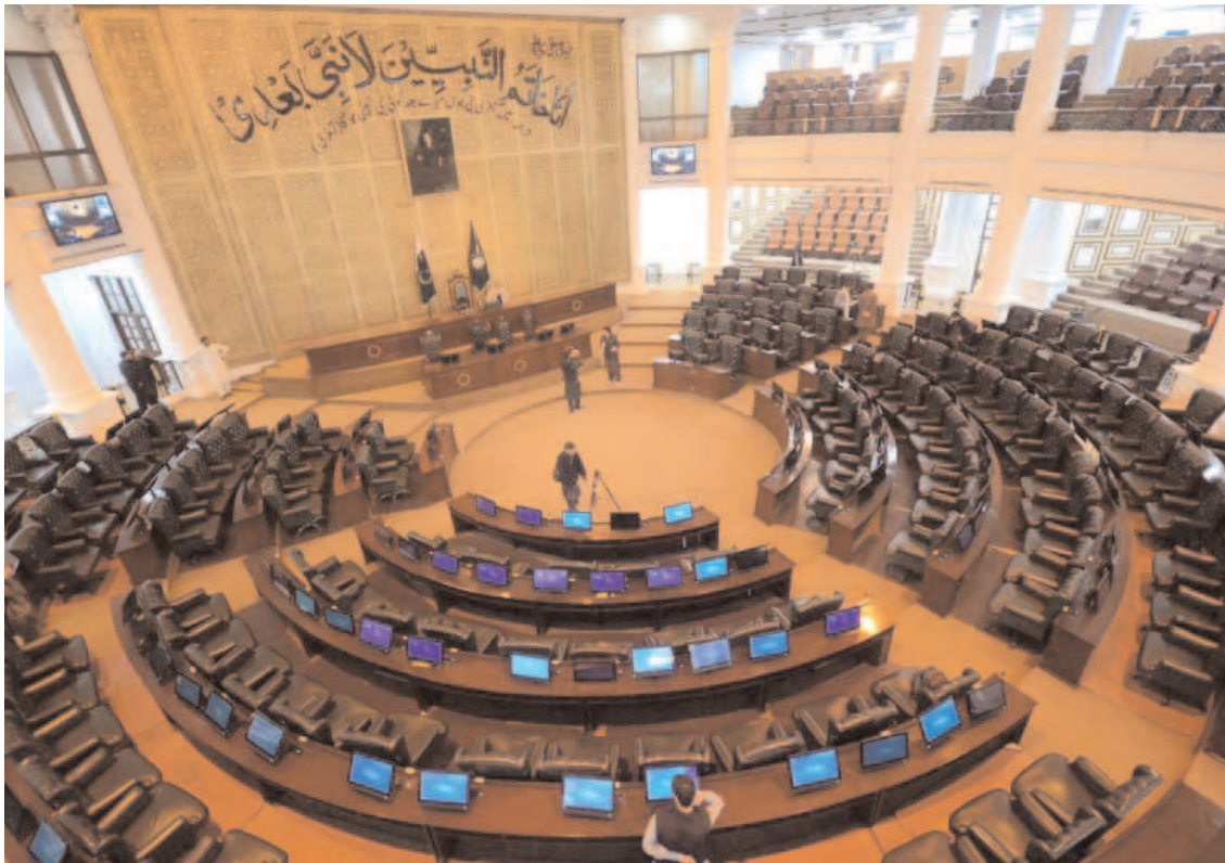
PESHAWAR: Workers clean the KP Assembly ahead of the Oath taking of the newly elected provincial legislators.

Governor listened to their problems and assured cooperation to resolve problems being confronted by the people. He also praised efforts and sacrifices of tribal people for security and sovereignty of the country.