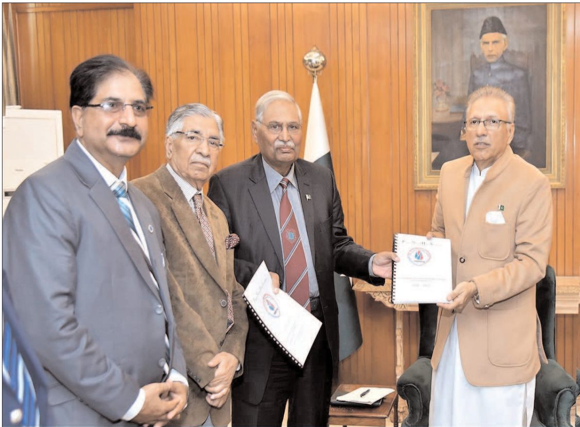
ISLAMABAD: A delegation of Pakistan National Heart Association (PANA) presenting a report on the activities and accomplishments of PANA to President Dr Arif Alvi, at Aiwan-e-Sadr.