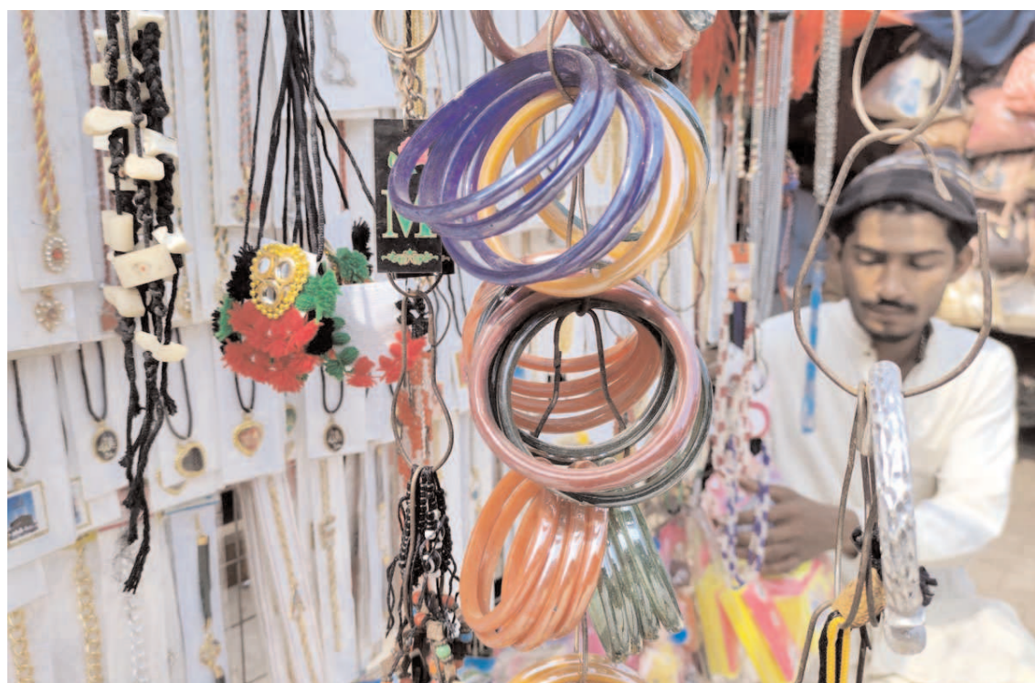
LARKANA: A vendor displaying colourful bangles and jewelry and items to attract the customers at his roadside setup near Shahi Bazar.

The Board of Directors appreciated the efforts of the management for taking effective steps for the implementation of the company's aggressive exploration program.