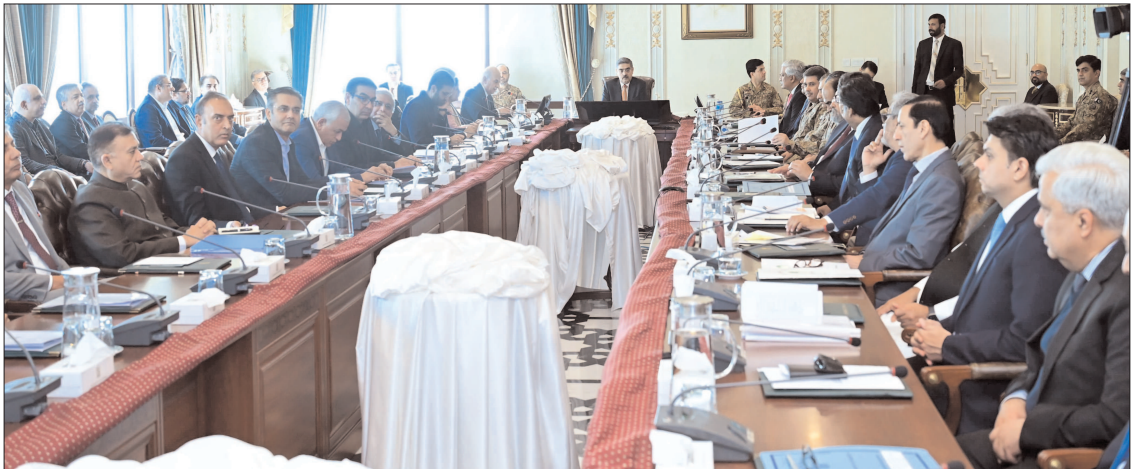
ISLAMABAD: Caretaker Prime Minister Anwaar-ul-Haq Kakar chairing the 9th meeting of the Apex Committee of Special Investment Facilitation Council.