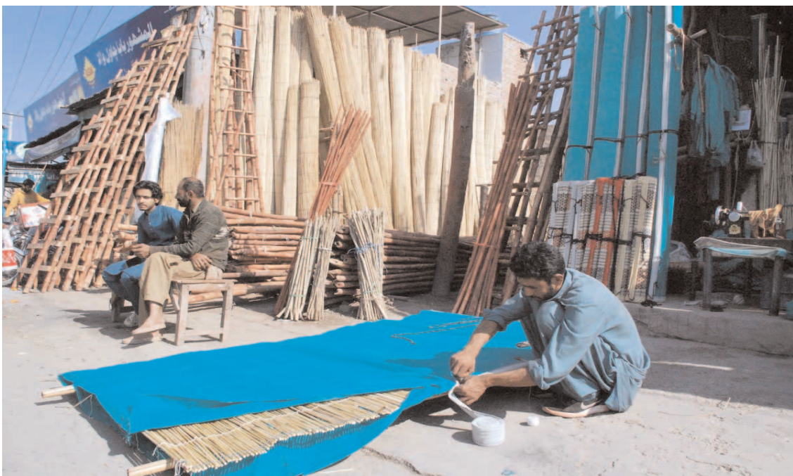
BAHAWALPUR: Artisan preparing traditional curtains on roadside.