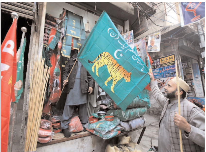
PESHAWAR: A man buying political flag from a shop at Qissa Khwani Bazaar for upcoming general elections.

It should be cleared that the issue of committing the crime of 'Ghag' will not be resolved by the Alternative Dispute Resolution (ADR) means of Jirga. He said that even after the enforcement of the Act, complaints of the continuation of the custom are being registered. Taking immediate action on these complaints, the minister directed to take action against this crime only under the relevant law.