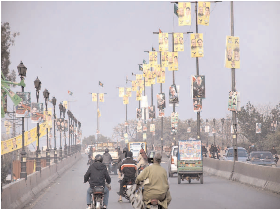
LAHORE: Posters and banners on display in preparation of General Election-2024.

Note: Quotations may be sent in favour of BWO, PAF Base, Peshawar. Detail specification may be obtained on Tel No: 091-9505031-5037, Mob: 0323-9411311.