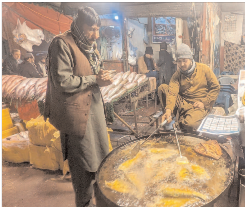
PESHAWAR: A shopkeeper frying fish at Ghanta Gher Bazaar.

Likewise, it power supply will remain suspended from Daggar Grid Station on 6th February from 9:00 a.m. to 2:00 p.m. resultant consumers of Karakoram, Gokand, Salarzai, Irrigation Scheme, Chagarzai, Sur Qila feeders will face inconvenience. The power supply will also remain suspended from Mansehra Grid Station on 6th February from 9:00 a.m. to 3:00 p.m. resultant, consumers of Ghazikot, Chana, Qalandar Abad, Lasin Nawab, Muradpur, Khaki and Shankari feeders will face inconvenience.