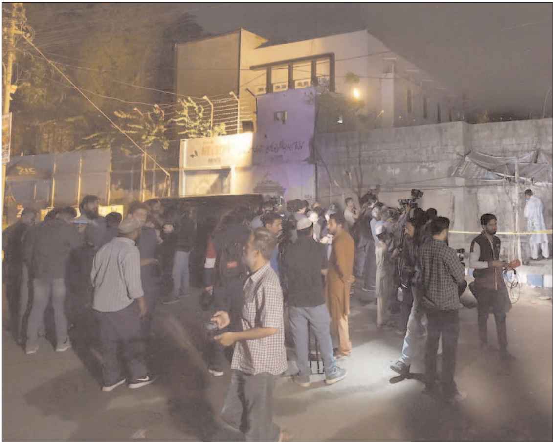
KARACHI: People gathered around the site of blast in office of the Provincial Election Commission office.