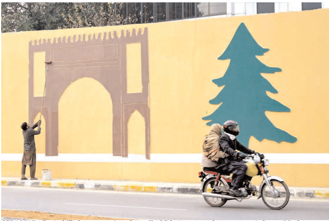
ISLAMABAD: A skilled person paints the wall of 7th Avenue underpass near Aabpara Market.

The chief trainer mentioned that model tents resembling Mina Valley style have been set up in the training centres. Pilgrims will receive guidance from Master Trainers using 3D videos and interactive question-and-answer sessions.